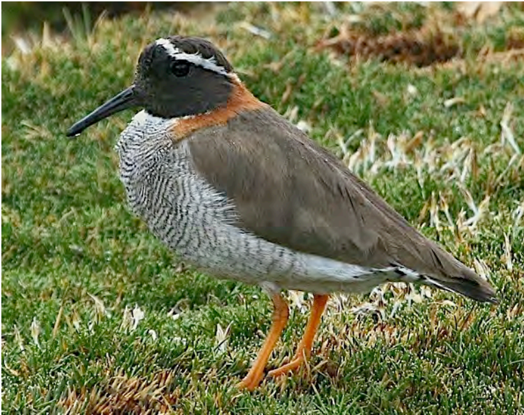
Finding the Diademed Sandpiper-Plover is a high priority for us when we visit the Yeso region.

The coast of Valparaiso province and the farmland northwest of Santiago provides more Matorral habitat, where we shall try for anything we didn't see in the mountains. But the real highlight here are the small marshes sometimes teeming with waterfowl. Here we shall seek White-tufted Grebe, Stripe-backed Bittern, the gorgeous Black-necked Swan, Cinnamon Teal, Red Shoveler, Rosy-billed Pochard (rare), Yellow-billed Pintail, Lake and Black-headed (rare) ducks, Plumbeous Rail, Spot-flanked Gallinule, and Red-gartered, Red-fronted, and White-winged coots. Two species found in Scirpus marshes are the odd Wren-like Rushbird and the Many-colored Rush-Tyrant, perhaps the most beautiful Tyrant flycatcher. If water levels are right, we stand a pretty good chance of seeing the South American Painted Snipe near Santiago; this secretive bird is absent if it is too dry or too wet. The salinasi Black Rail was heard for the first time ever on our 2008 tour and seen in 2013!