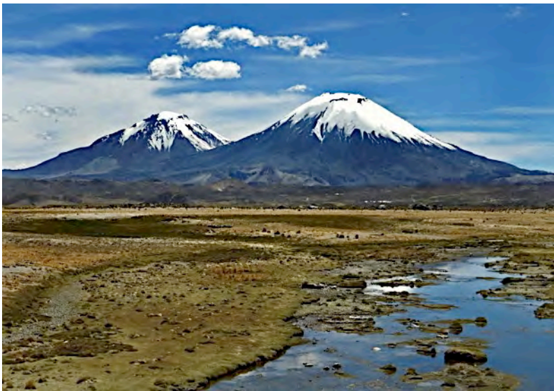
Parinacota Volcano looms over the nearby landscape near Lauca.

Note: In the following we have highlighted in green any text that we consider requires your special attention.