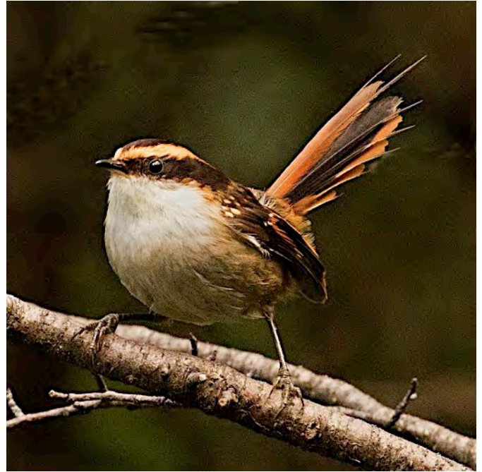
The Thorn-tailed Rayadito is a small furnariid found in southern Chile. This image shows the spine-tipped tail feathers well.

From the port of Valparaíso, we'll take a boat trip a few miles offshore where we should see the Humboldt Current species mentioned above as well as Peruvian Booby and Peruvian Diving-Petrel. The list of possibilities includes, as well, a number of ocean wanderers of the highest order, breeding in Antarctic and subantarctic regions around the globe. Although many of the southern tubenoses will have returned to their subantarctic breeding islands by November, some