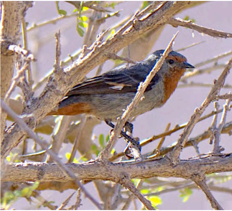
The Tamarugo Conebill breeds in a small area in northern Chile where the Tamarugo tree, a legume that is well-adapted to the dry conditions, occurs.

Arica area —Arica is situated on the coast at the mouth of an oasis valley in the driest desert on Earth: the Atacama. With the cold Humboldt Current just offshore, Arica enjoys a comfortable climate and is a resort area—Chileans know it as the city of eternal spring. The immediate coast teems with waterbirds and shorebirds, from such typical Humboldt Current species as Peruvian Pelican, Blackish Oystercatcher, Kelp, Gray, and Belcher’s gulls, to such wintering North American shorebirds as Whimbrel, Willet, Ruddy Turnstone, and Surf-bird. And in some years there are tens of thousands of wintering Franklin’s Gulls and Elegant Terns. Offshore, the seas can be filled with birds that are feeding on cyclical, high populations of small fish, with the pelicans, Guanay Cormorants and Peruvian Boobies making up the bulk of the birds. Other smaller marine species that are tied to the rich waters include Markham’s and Elliot’s Storm-Petrels and Peruvian Tern which are sometimes present.