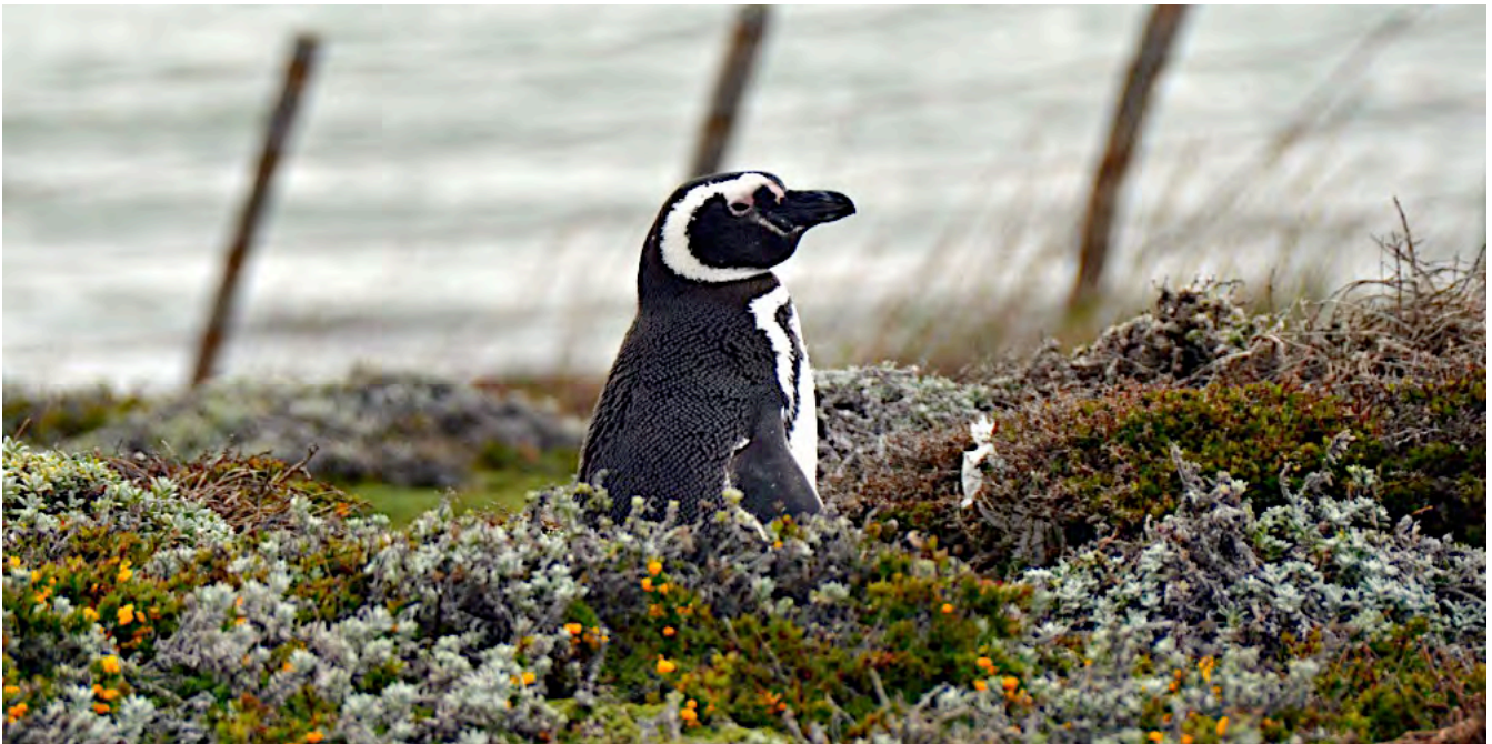
Magellanic Penguins are found around the southern coast of South America. This one was seen near Punta Arenas.

On our travel days in Chilean Patagonia we will be birding the whole way, sometimes taking detours to find special birds. In the Steppes near the east end of the Straights of Magellan we will look for unusual birds such as the Tawny-throated Dotterel, Cinnamon-bellied Ground-Tyrant, Chocolate-vented Tyrant, and the gorgeous and very rare White-bridled (Black-throated/Canary-winged) Finch. In higher areas we have a chance to find the White-throated Caracara, Patagonian Mockingbird, Band-tailed Earthcreeper and the Yellow-bridled Finch.