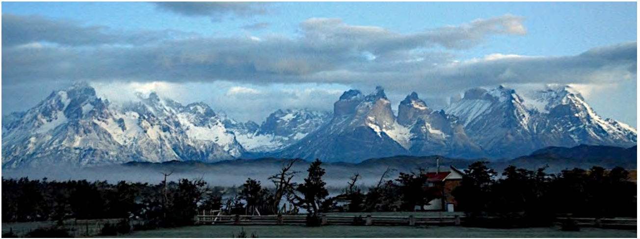
The other-worldly landscape of Torres del Paine.

Day 5, Thu, 9 Nov. Morning in Sierra Baguales; to Torres del Paine National Park. We will spend the morning birding the scenic and very interesting area of Sierra Baguales before heading to Torres del Paine. At Sierra Baguales we hope to find such birds of note as Yellow-bridled Finch, Cinnamon-bellied Ground-Tyrant, and maybe the scarce White-throated Caracara. We'll also have a shot at Austral Rail today. We will spend the night near the park in a hotel with a full view of the Paine Massif. Night In Torres del Paine.