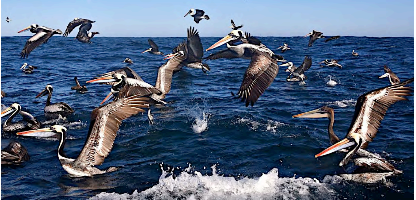
The Humboldt Current flows north along the coast of Chile, bringing nutrient-rich waters that support millions of seabirds, from penguins to albatrosses. We'll have several chances to look for pelagic birds such as these Peruvian Pelicans as we traverse the length and breadth of this amazing country.

We include here information for those interested in the 2017 Field Guides Chile tour: