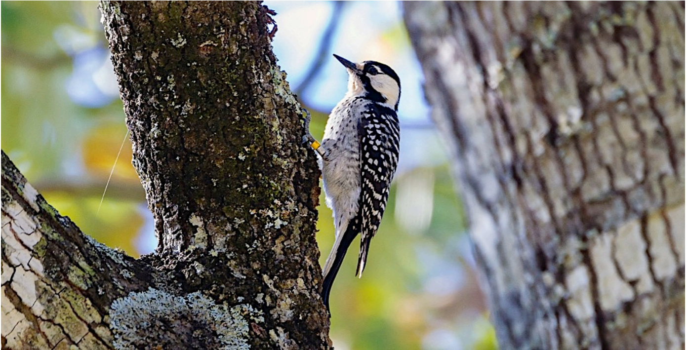
Red-cockaded Woodpeckers are residents of long-leaf pine forests. We will search for these woodpeckers, as well as wintering sparrows, Brown-headed Nuthatch, and Barred Owls in the Kisatchie National Forest.

In the course of our long weekend, we will also spend time birding along the coastal marshes, beaches, and cheniers (tree islands) for late seasonal migrants and wintering species, as well as some time in nearby pine woods that are home to such southeastern specialties as Red-cockaded Woodpecker, Brown-headed Nuthatch, Bachman's Sparrow, and possibly wintering Henslow's Sparrow. And of course, don't forget your appetite: Louisiana is rightly known for its tasty cuisine and we will make a point of sampling some of it: jambalaya, gumbo, etouffe, blackened redfish, boudin, and po'boys are some of the mouth-watering offerings for which the region is famous! So why don't y'all come on down and visit?