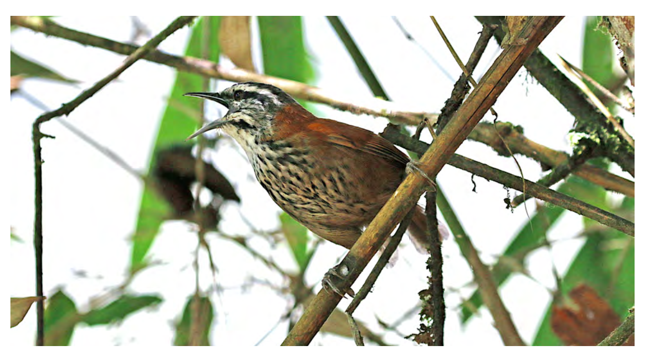
Inca Wren is a Peruvian endemic found in the region near Machu Picchu; in fact, the ruins may be the best place to see this bird.

After visiting Machu Picchu, we're off on a temperate adventure to the fertile Sacred Valley of the Urubamba and the glorious Cordillera Vilcanota. We'll take the afternoon train back to Ollantaytambo, where we'll disembark for our nearby lodge, our base for three nights as we make early departures for the high pass along the road that crosses the Andes on its way to Quillabamba in the lower Urubamba valley, closer to the Amazonian lowlands. This extraordinarily scenic road affords us access to a cross section of habitats and to some of the best high Andean birding in all Peru. Abra Malaga, at 14,200 feet, is the low point, or pass, along a ridge of rugged peaks called the Vilcanota Mountains separating elfin tree line and humid temperate forest on the northwest from the dry, shrub-covered slopes of the upper Rio Urubamba Valley. Buffering the upper limits of these habitats is the starkly beautiful puna grassland dotted with llamas, alpacas, and the very occasional cluster of stone houses, corrals, and fences erected by Quechua-speaking families who are somehow accustomed to prospering in what seems to most visitors an inhospitable environment.