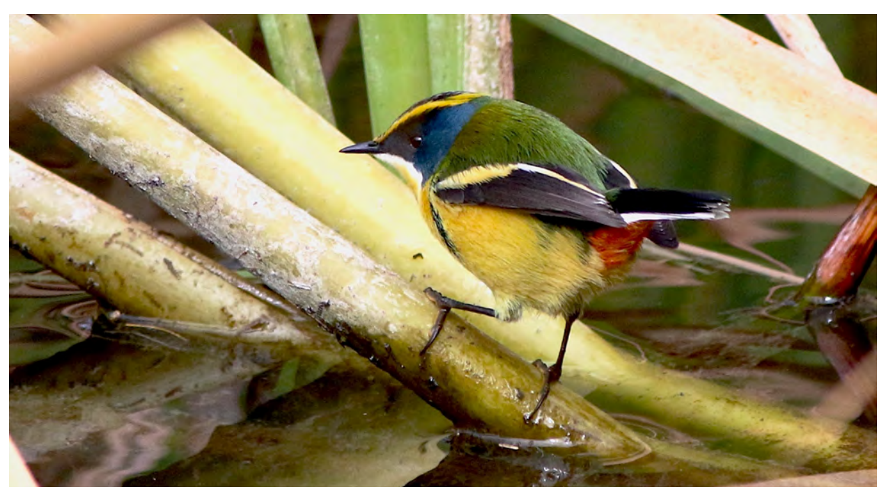
The Many-colored Rush-Tyrant is a gaudy little flycatcher found in marshy areas. We've seen these colorful birds well at lakes near Cusco.

During our three days in the Abra Malaga area, we'll sample each of these habitats from our base at Ollantaytambo. Even though we'll leave very early on two of the three mornings, a delicious hot breakfast is available for all who like to start the day off with a meal, no matter how early. While the changeable weather makes birding here tricky, the geography tends to ensure that some zone is always bird-able. You will never forget this place once you've experienced it. It's truly grand.