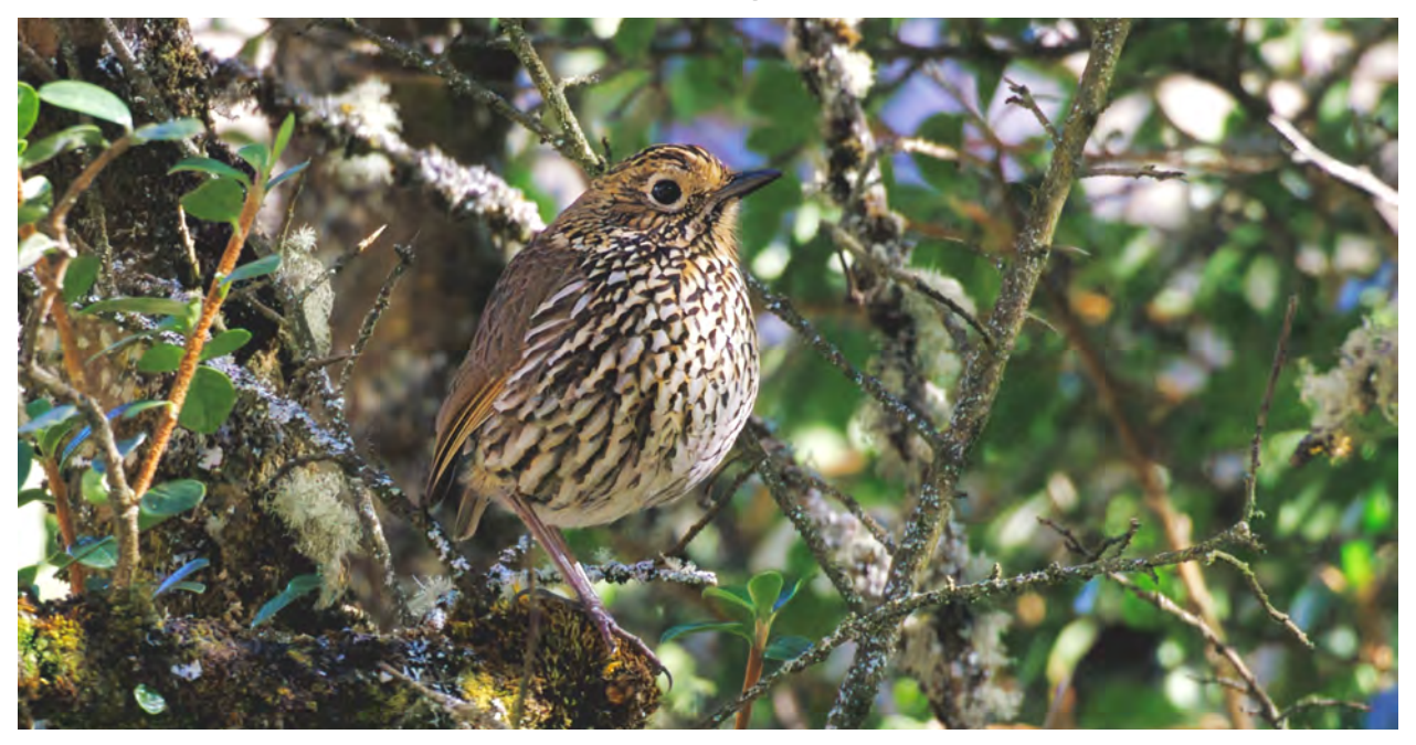
The Stripe-headed Antpitta is a near-endemic found in the Polylepis woodlands of Peru. Unlike many antpitta species, these are relatively bold and have posed nicely for us!

We include here information for those interested in the 2025 Field Guides Machu Picchu & Abra Malaga, Peru tour: