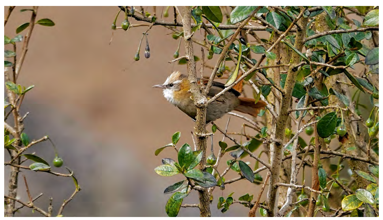
Near Abra Malaga, we'll look for a number of endemics including the attractive Creamy-crested Spinetail.

"Wet-side" endemics include: Marcapata Spinetail, Unstreaked Tit-Tyrant, Inca Wren, Parodi's Hemispingus, and Cusco Brush-Finch. Also possible are Sapphire-vented (Coppery-naped) Puffleg, Line-fronted Canastero, and Diademed Tapaculo. Should rain (or sun!) set in, we'll head back across the pass to the "dry side," watching for Black-faced (Andean) Ibis, Gray-breasted Seedsnipe, White-tufted Sunbeam, Creamy-crested Spinetail, Stripe-headed Antpitta, and the handsome Chestnut-breasted Mountain-Finch. There will be an opportunity for the hardy to climb into an area of extensive Polylepis where we'll have a chance for Andean Hillstar, White-browed and Tawny tit-spinetails, Junin Canastero, Puna Tapaculo, Ash-breasted Tit-Tyrant, and Giant Conebill. And at any time on the "dry side," a huge Andean Condor could circle right overhead.