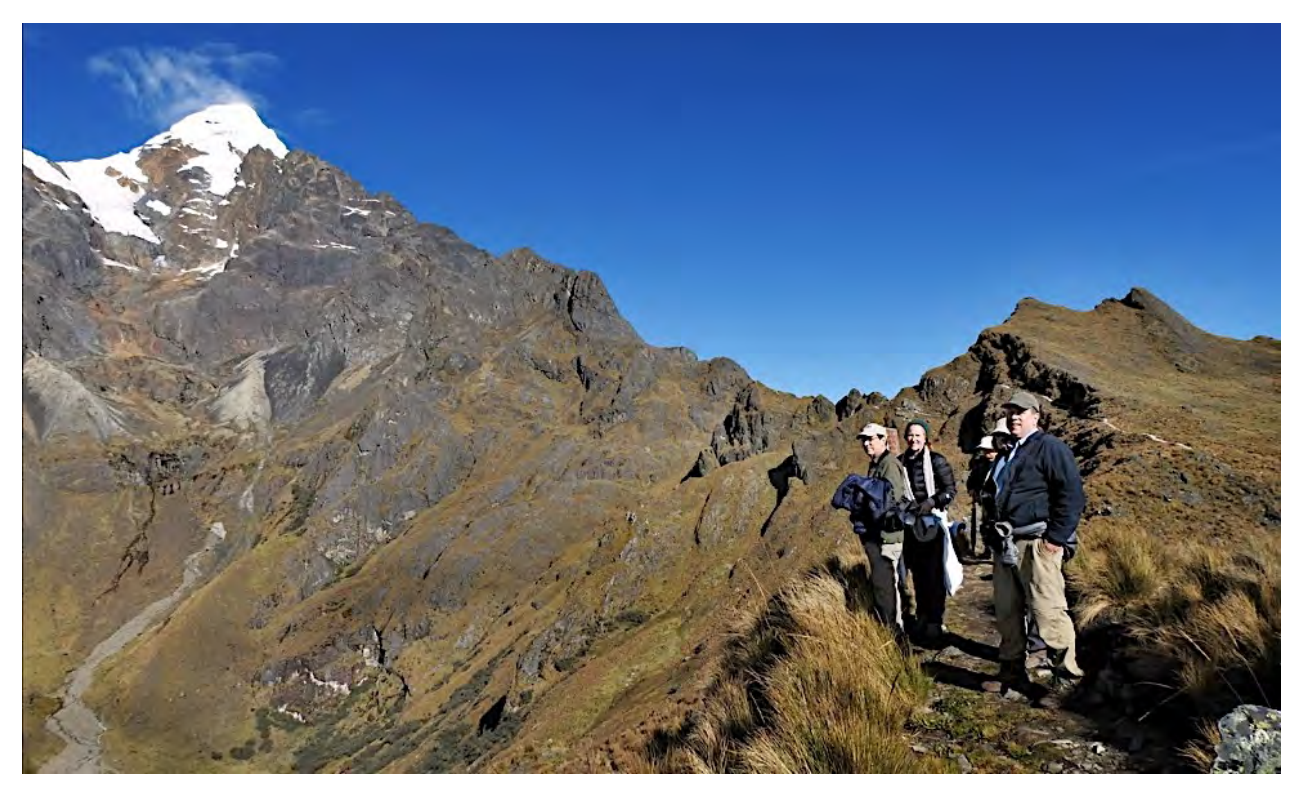
The trail up to the Polylepis woodlands can be difficult, but we take it at a slow pace, and there is the option to stay back at the hotel for those who do not want to make the climb.

We want to be sure you are on the right tour! Below is a description of the physical requirements of the tour. If you are concerned about the difficulty, please contact us about this and be sure to fully explain your concerns. We want to make sure you have a wonderful time with us, so if you are uncomfortable with the requirements, just let us know and we can help you find a better fitting tour! Field Guides will not charge you a change or cancellation fee if you opt out within 10 days of depositing.