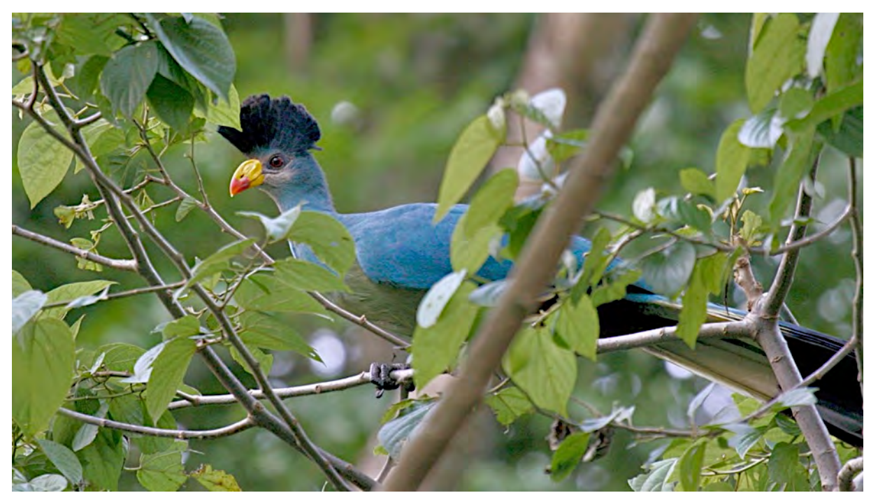
Kakamega Forest is home to the Great Blue Turaco, which we've seen well on previous tours.

Day 14, Fri, 15 Mar. Morning Lake Nakuru N.P.; and drive to Kakamega Forest. Dawn at Lake Nakuru brings the energetic chorusing of White-browed Robin-Chats from right outside our rooms, while the less common Mocking Cliffchat and Little Rock-Thrush are also occasionally present. Even as we have breakfast and the colors deepen on the glowing lake below, we'll be able to survey clusters of game feeding on the nearby grassy slopes. We will spend part of the morning birding the margins of the lake before taking a picnic lunch and heading northwest for a three night stay at the delightful Rondo Retreat—settled within the renowned Kakamega Forest. Night at Rondo Retreat.