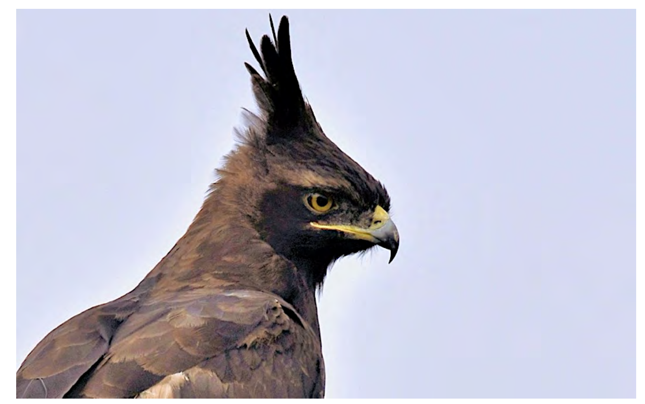
Long-crested Eagles are found through much of sub-Saharan Africa, but they are uncommon and local. We'll watch for this small eagle when we visit the Aberdare Mountains.

Later we'll visit the taller trees surrounding the lake (and in the old lodge gardens) which harbor a long list of species including White-browed Coucal, African Pygmy-Kingfisher, Black-throated and Red-and-yellow barbets, Nubian Woodpecker, Brubru, Red-faced Crombec, Beautiful Sunbird, Gray-headed and Sulphur-breasted bushshrikes, Crimson-rumped Waxbill, and many species of colorful weavers, including Little and Golden-backed and the very local White-billed Buffalo-Weaver. The lake itself is busy with waterbirds. Species vary with the water level, but an afternoon walk along the shore could produce excellent looks at such species as Goliath and Purple herons, White-faced Whistling-Duck, African Jacana, Black Crake, Pied and Malachite kingfishers, and Northern Masked-Weaver (only found here in the whole of Kenya). Night at Bogoria Spa Resort.