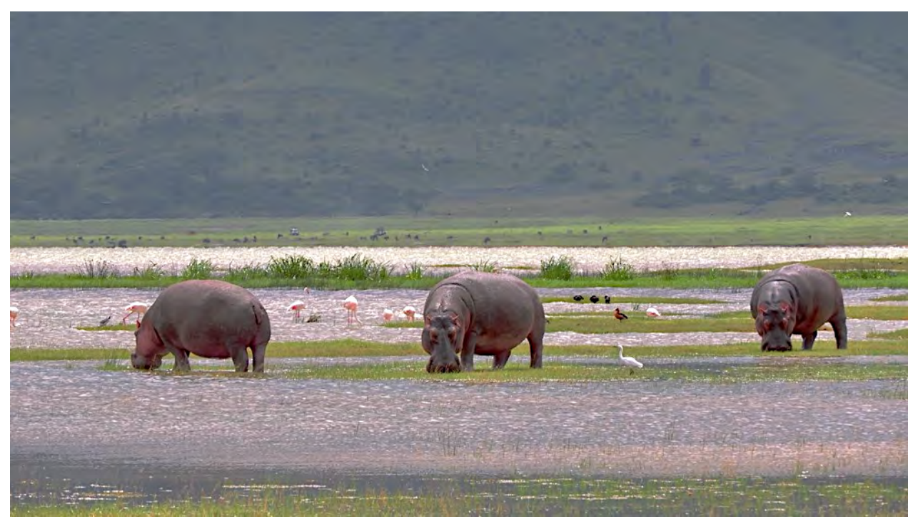
Ngorongoro Crater is one of the wonders of the natural world. We'll have a chance to visit the crater floor, where we'll see many of Africa's iconic mammals and birds, such as this collection of Hippos and waterbirds.

The remainder of the afternoon will be spent around the lodge, where we could see a variety of raptors, Rameron Pigeon, White-necked Raven, Bar-throated Apalis, Golden-winged and Tacazze sunbirds, and Red-naped Widowbird. Night at Ngorongoro Serena Lodge.