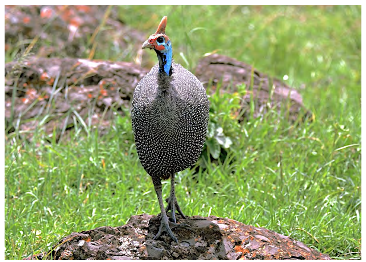
Guineafowl are endemic to Africa, and the widespread Helmeted is one of the most common. We'll watch for them when we visit Nairobi National Park.

Day 3, Mon, 4 Mar. Nairobi. Please enjoy breakfast whenever you like between 6:30-10:00 a.m. Terry will meet you at reception at 11.00 a.m. for a short bird walk and lunch.