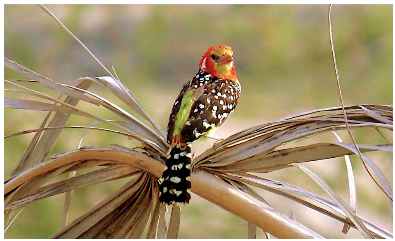
The colorful Red-and-Yellow Barbet is an East African specialty that we'll look for in Tarangire National Park.

Yet another Tanzanian endemic, Ashy Starling, is common right around our lodge, and Yellow-collared Lovebird occurs throughout the park. Also possible here are Saddle-billed Stork, Brown Snake-Eagle, Pygmy Falcon, Coqui and Crested francolins, Namaqua Dove, Red-bellied Parrot, White-bellied and Bare-faced go-away-birds, African Scops-Owl, Blue-naped Mousebird, 'African' Hoopoe, Northern Red-billed and Von der Decken's hornbills, Red-and-yellow Barbet, Cardinal Woodpecker, Chestnut-backed Sparrow-Lark (erratic), Foxy Lark, Magpie Shrike, Crimson-rumped Waxbill and Cut-throat. Nights at Tarangire Safari Lodge.