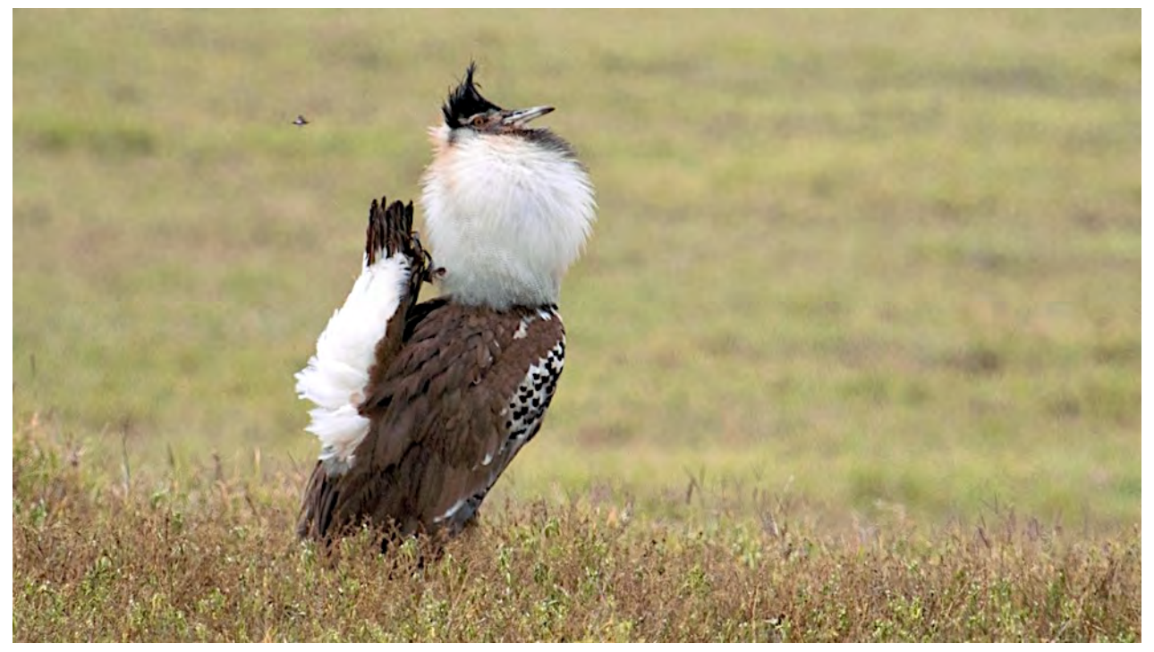
The impressive Kori Bustard is one of Africa's largest birds. We'll look for them in the grasslands of the Serengeti, and hope to see the males in display.

We include here information for those interested in the 2024 Field Guides East Africa Highlights: Kenya & Tanzania tour: