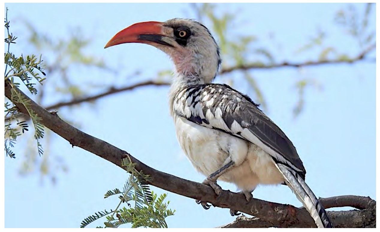
Tanzanian Red-billed Hornbill is an endemic that we'll seek in the Serengeti.

Three endemics—Tanzanian Red-billed Hornbill, Fischer's Lovebird, and Gray-breasted Spurfowl—occur right around our lodge, while on the open plains the variety ranges from the enormous Common Ostrich, Secretarybird, and Kori Bustard, to nomadic Black-winged Lapwings, and the flighty larks, pipits, and longclaws. While water is scarce, some of the permanent creeks near our lodge are the favorite wallows of hippos and our route will cover all the habitats, maximizing our chances of seeing most species. We will have the remainder of Day 7 and the whole of Days 8 and 9 to watch the birds and mammals of this area, although to give a slightly different mix of species, we'll spend the night of Day 9 at nearby Ndutu Lodge. Nights at Serengeti Serena Lodge (2 nights) and Ndutu Lodge (1 night).