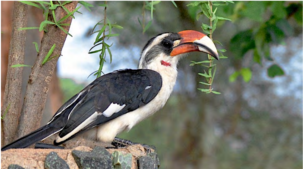
One of the small hornbill species we'll watch for is Von der Decken's Hornbill. We have the potential to see as many as 11 species of hornbill on this tour!

Yet another Tanzanian endemic, Ashy Starling, is common right around our lodge, and Yellow-collared Lovebird occurs throughout the park. Also possible here are Saddle-billed Stork, Brown Snake-Eagle, Pygmy Falcon, Coqui and Crested francolins, Namaqua Dove, Red-bellied Parrot, White-bellied and Bare-faced go-away-birds, African Scops-Owl, Blue-naped Mousebird, 'African' Hoopoe, Northern Red-billed and Von der Decken's hornbills, Red-and-yellow Barbet, Cardinal Woodpecker, Chestnut-backed Sparrow-Lark (erratic), Foxy Lark, Magpie Shrike, Crimson-rumped Waxbill and Cut-throat. Nights at Tarangire Sopa Lodge.