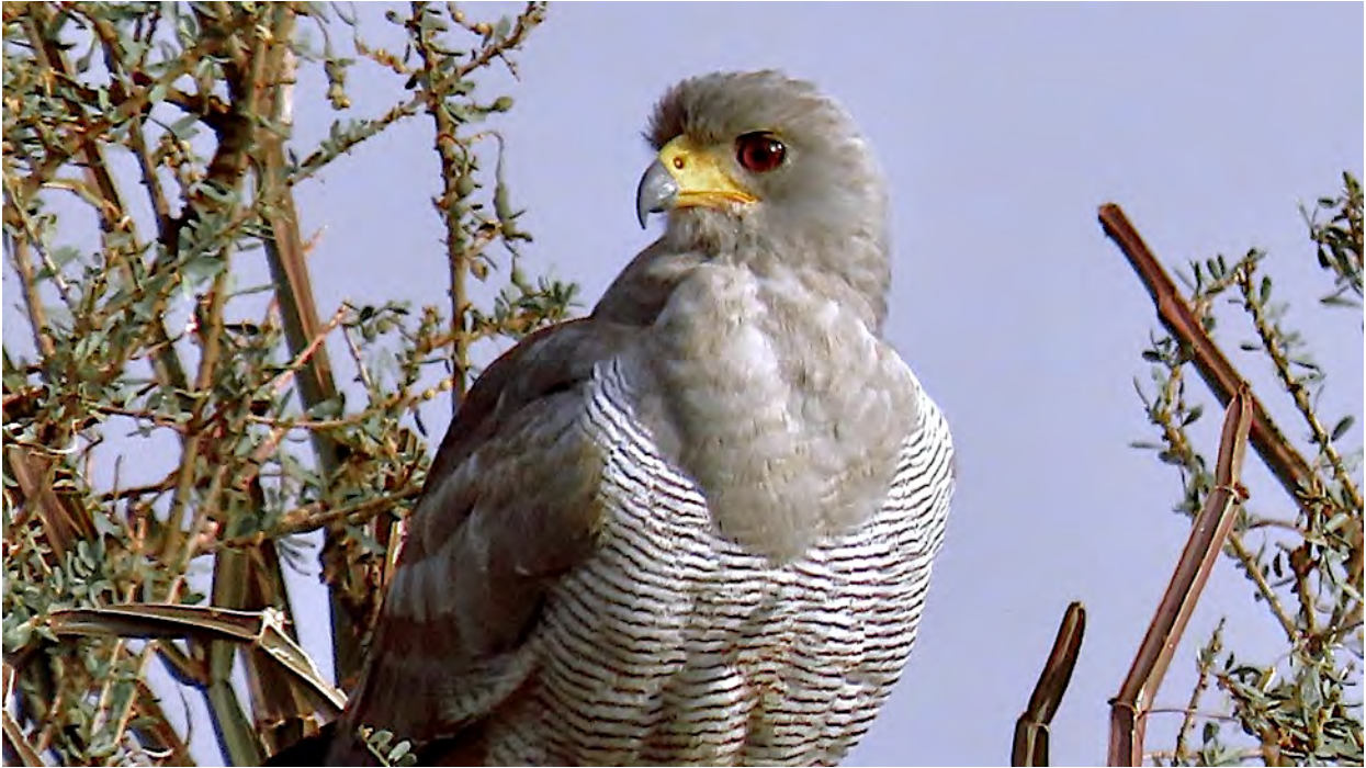
Eastern Chanting-Goshawk is found in the savannas of East Africa.

Day 4, Tue, 4 Mar. To Tanzania. Today is largely a travel day, but well over half of the distance we need to cover is now just a short flight away. We'll begin by flying from Nairobi to Arusha (gateway to the Serengeti) and then depending on our time of arrival, either have lunch in town or take a picnic and head towards Plantation Lodge.