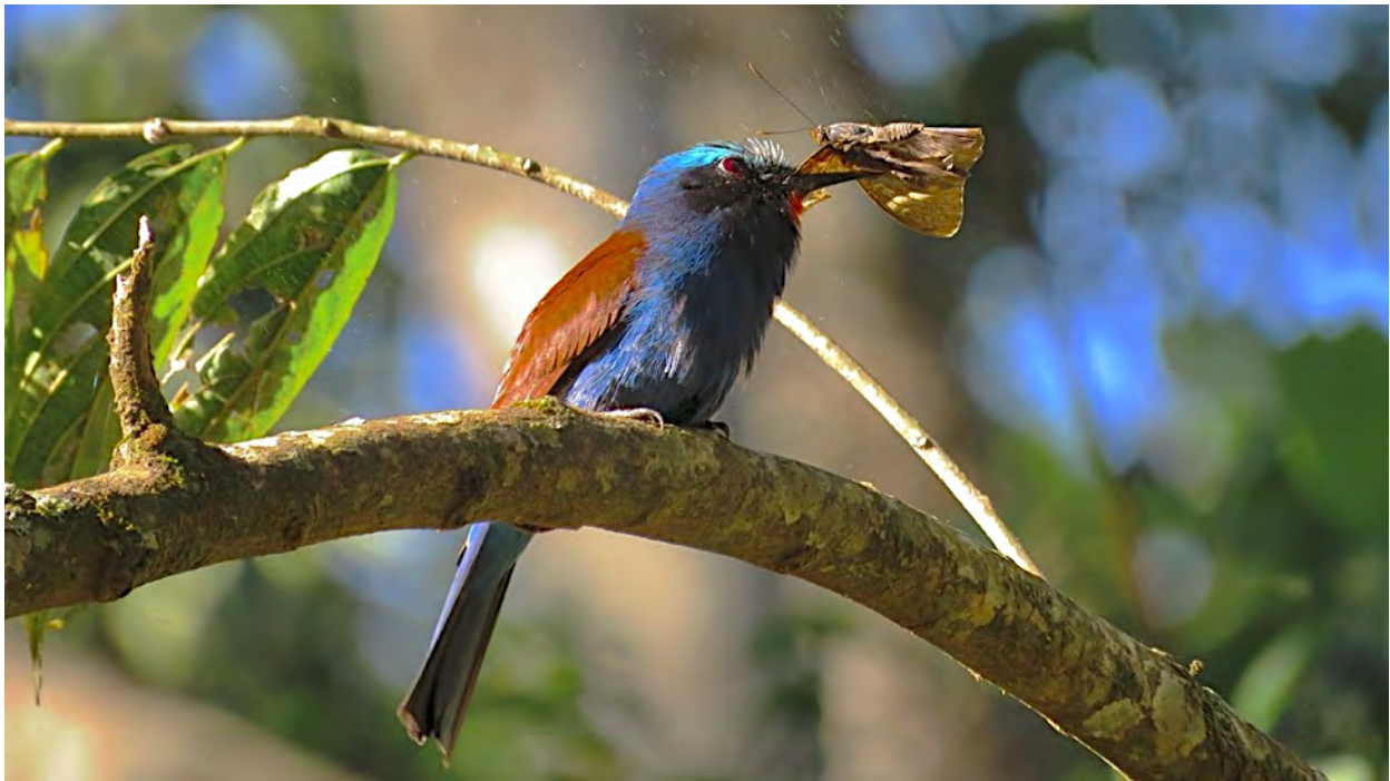
Kakamega Forest is home to species such as the beautiful Blue-headed Bee-eater.

Day 17, Mon, 17 Mar. To the Lake Baringo area. We'll leave Kakamega after breakfast and head east descending in to the Rift Valley down the spectacular Elgeyo Escarpment. At the bottom, the riverine forest along the Kerio River can be good for White-crested Turaco, and we'll spend some time here as we search for this beautiful bird. We'll then climb the Tugen Hills before descending yet again to the Rift Valley bottom and our lodge about 50 kms south of Lake Baringo. Many localized species are found in this area, and we'll have a part of this afternoon and the whole of tomorrow to look for them. Night at Bogoria Spa Resort.