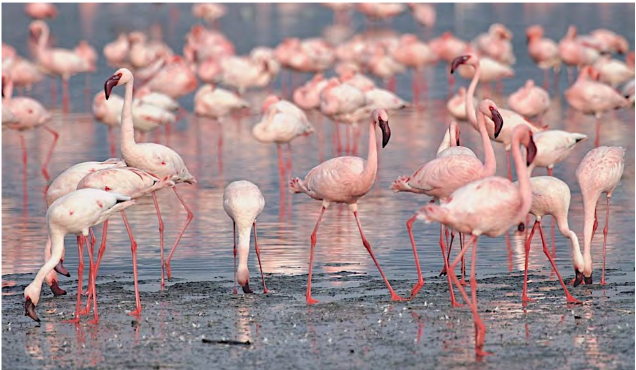
The alkaline lakes of the Rift Valley are often host to large numbers of waterbirds, including Lesser Flamingos. We'll visit Lake Nakuru to see this spectacle.

We'll spend the afternoon slowly driving along the lakeshore, through the yellow-bark acacia woodlands and near the lava cliffs, enjoying the tremendous variety of birds and mammals that occur here. Night at Lake Nakuru Lodge.