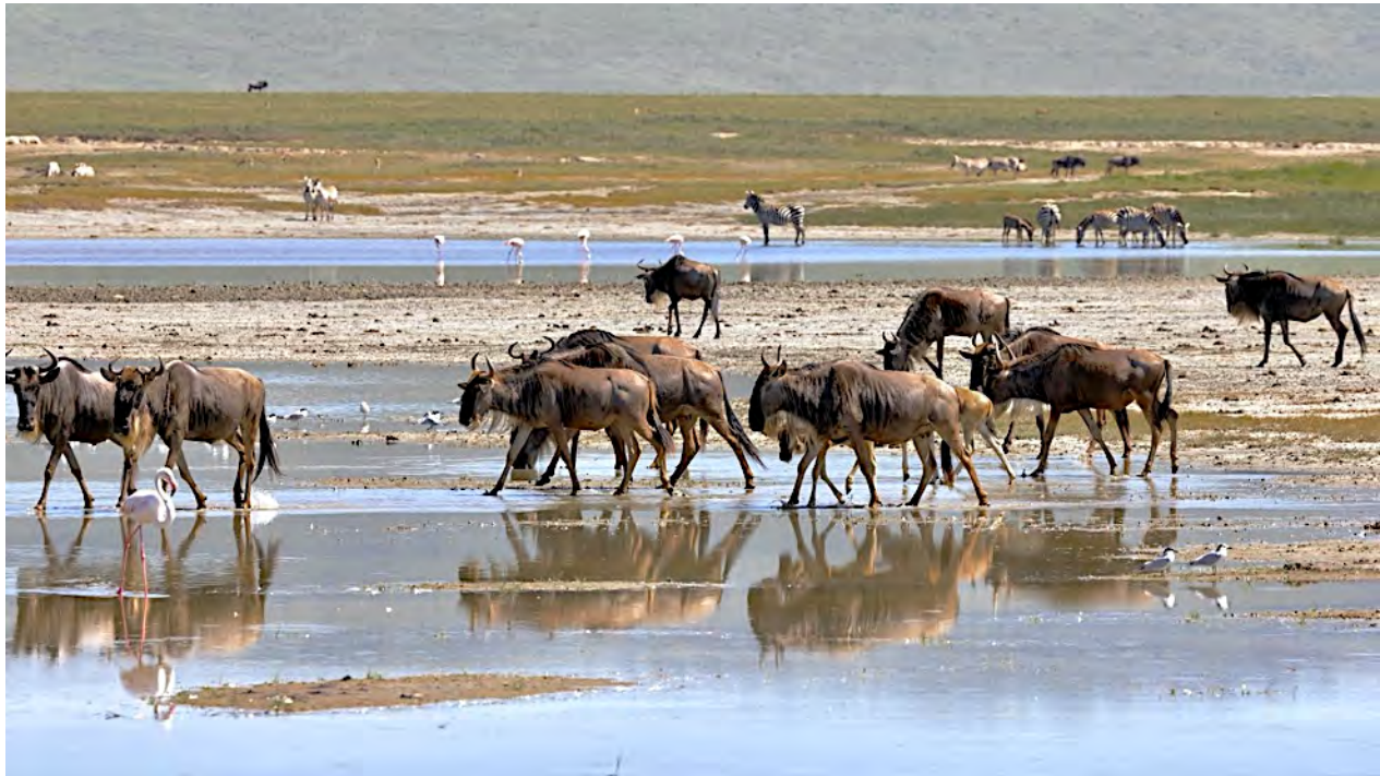
This tour visits some of East Africa's most iconic landscapes, and allows us to see many of the continent's natural wonders. Ngorongoro Crater is home to spectacular herds of Blue Wildebeest and Burchell's Zebra, as well as numerous species of birds.

We include here information for those interested in the 2025 Field Guides East Africa Highlights: Kenya & Tanzania tour: