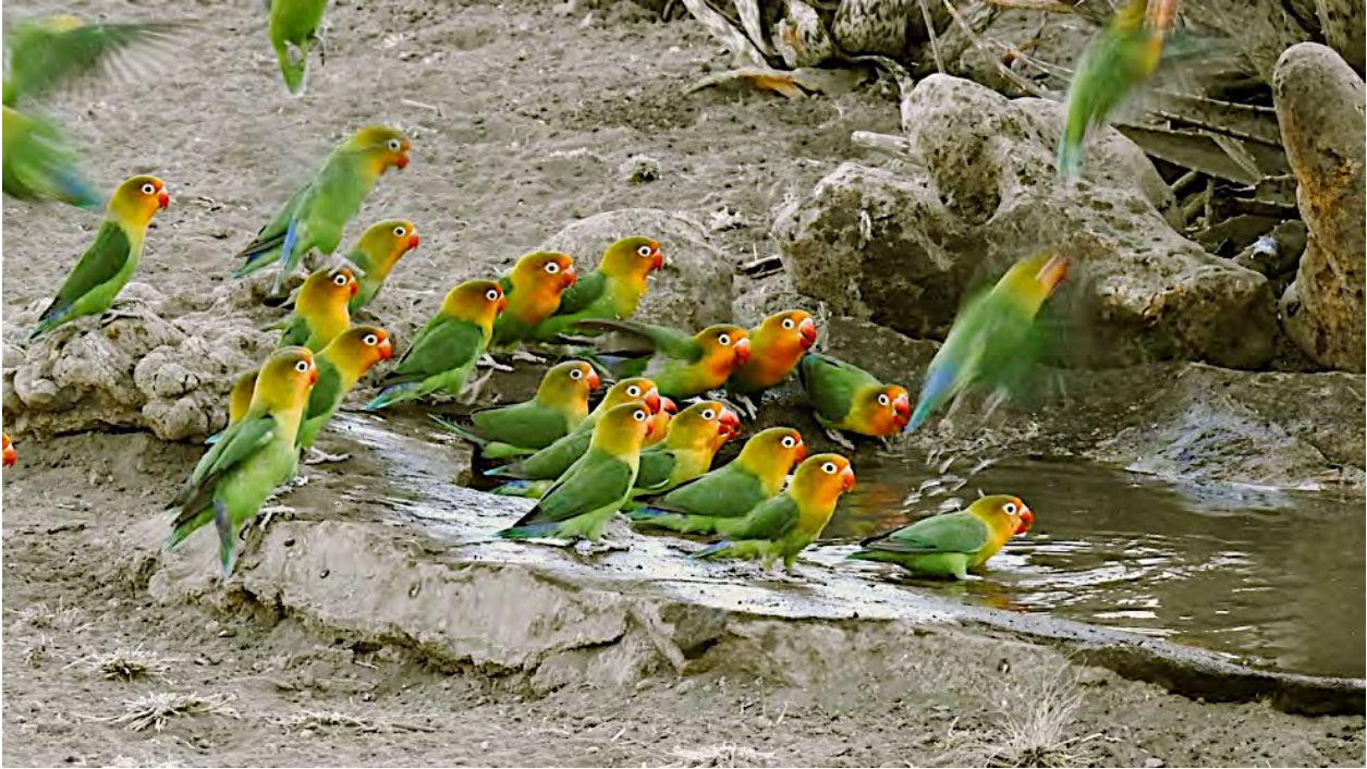
At waterholes in the Serengeti, we'll watch for the endemic Fischer's Lovebird. These colorful small parrots are among the species that come to water everyday.

We will picnic near a small group of acacia trees which are home to endemic Rufous-tailed Weavers and Superb Starlings; Black Rhinoceros is often seen on the plains beyond. And after lunch, we'll head for the freshwater swamps where more waterbirds—and, frequently, large bull African Bush Elephants—are found. The lush growth of vegetation here holds different species of birds and offers good protection from the afternoon sun. In the late afternoon we return to our lodge on the crater rim. Night at Ngorongoro Serena Lodge.