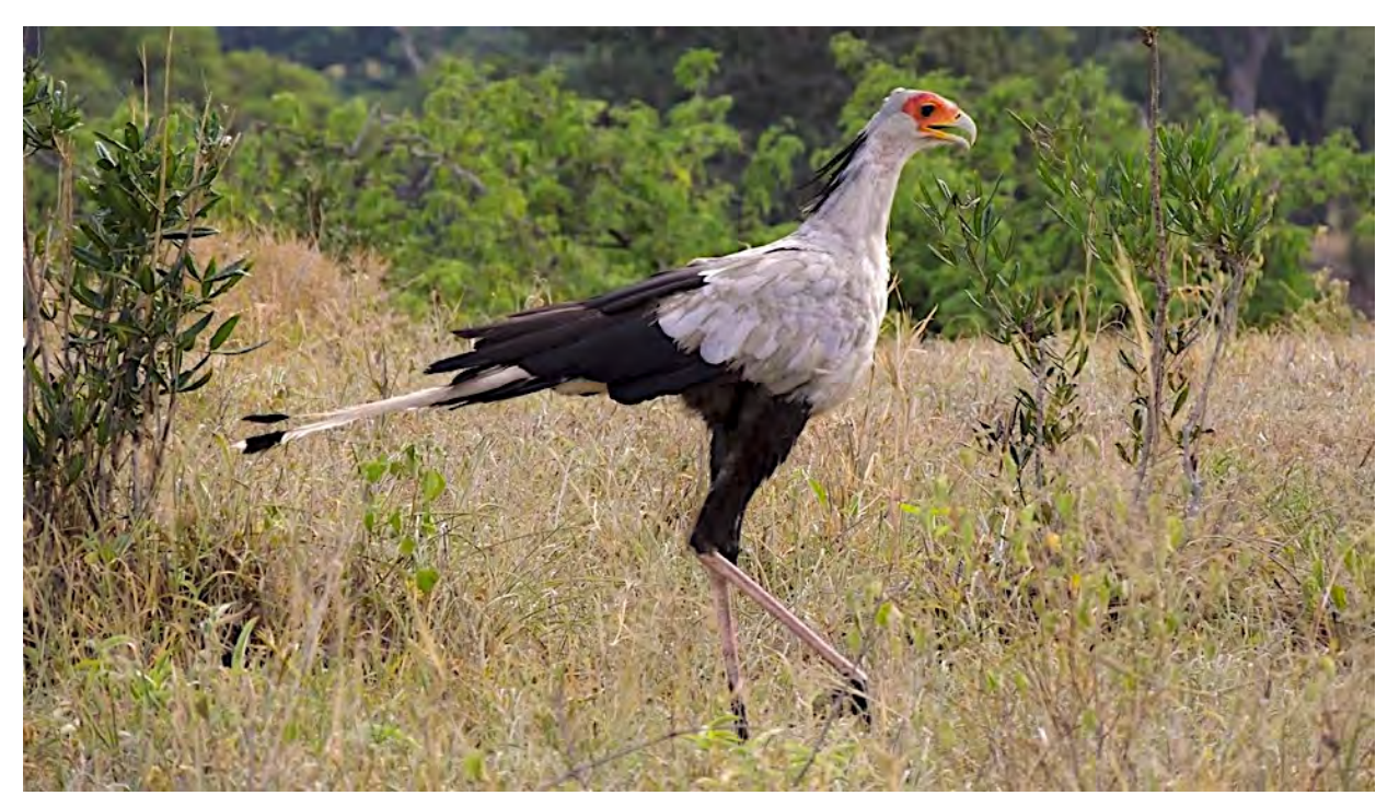
The Secretarybird is a unique long-legged raptor that we'll look for in the grasslands that we visit. Although their range is extensive, these large birds are endangered, so seeing one will be a great thrill.

If you are uncertain whether this tour is a good match for your abilities, please don't hesitate to contact our office; if they cannot directly answer your queries, they will put you in touch with the guide.