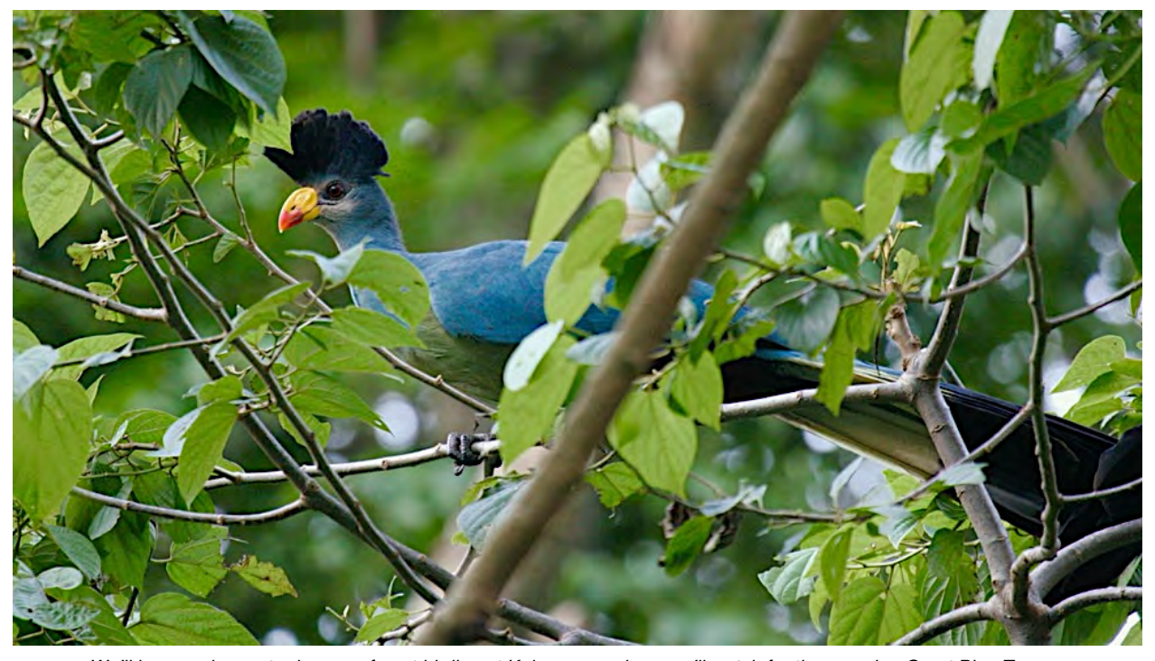
We'll have a chance to do some forest birding at Kakamega, where we'll watch for the amazing Great Blue Turaco.

Day 17, Mon, 16 Mar. To the Lake Baringo area. We'll leave Kakamega after breakfast and head east descending in to the Rift Valley down the spectacular Elgeyo Escarpment. At the bottom, the riverine forest along the Kerio River can be good for White-crested Turaco, and we'll spend some time here as we search for this beautiful bird. We'll then climb the Tugen Hills before descending yet again to the Rift Valley bottom and our lodge about 50 kms south of Lake Baringo.