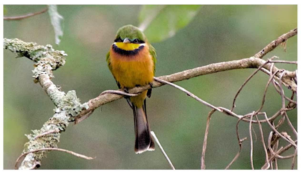
Cinnamon-chested Bee-eater is an East African specialty found in wooded areas. We'll see this pretty bird at Gibb's Farm.

Most of the landscape will be through semi-arid bush country, crossed here and there with dry river beds, and later, as we climb the western wall of the Great Rift Valley, a steep rocky escarpment. We hope to get to Plantation Lodge (or Gibb's Farm), with time for some afternoon birding, but along the way we'll undoudtedly make stops as we perhaps encounter Eastern Chanting-Goshawk, White-bellied Go-away Bird, Rufous-crowned Roller, Red-fronted Barbet, Banded Parisoma, Red-faced Crombec, Spotted Morning-Thrush, Red-throated Tit, Slate-colored Boubou, White-bellied Canary, and Green-winged Pytilia. Night at Plantation Lodge (or Gibb's Farm), near Karatu.