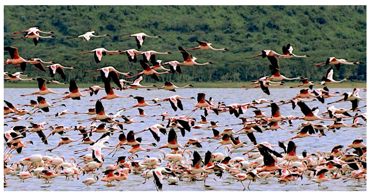
Lake Nakuru is known for its massive numbers of flamingos, both Greater and Lesser. We'll see many other waterbirds there as well, including pelicans, egrets and shorebirds.

Day 12, Wed, 11Mar. To Nairobi. After breakfast and some early birding around our lodge we'll take a picnic lunch and head north to Arusha for our late afternoon flight to Nairobi. Night at Tamarind Tree Hotel, Nairobi.