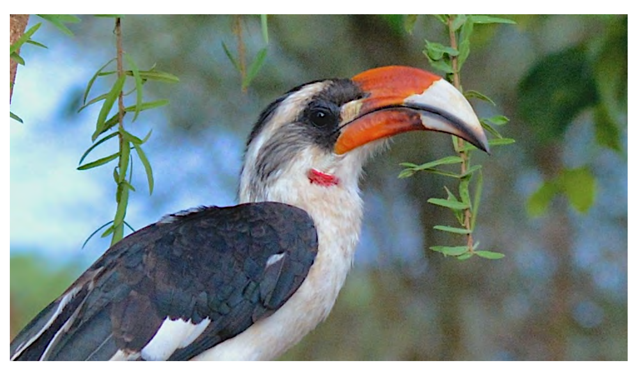
Von der Decken's Hornbill is one of a number of hornbill species that we'll watch for in the Serengeti. This is an East African species that is found in savannas.

We will picnic near a small group of acacia trees which are home to endemic Rufous-tailed Weavers and Superb Starlings; Black Rhinoceros are often seen on the plains beyond. And after lunch, we'll head for the freshwater swamps where more waterbirds—and, frequently, large bull African Savanna Elephants—are found. The lush growth of vegetation here holds different species of birds and offers good protection from the afternoon sun. In the late afternoon we return to our lodge on the crater rim. Night at Ngorongoro Serena Lodge.