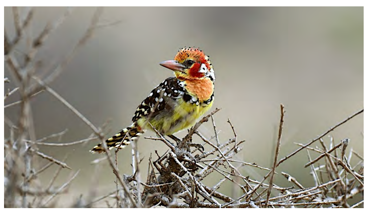
The Red-and-yellow Barbet is another species confined to East Africa. We'll find these colorful birds in Tarangire.

Three endemics—Tanzanian Red-billed Hornbill, Fischer's Lovebird, and Gray-breasted Spurfowl—occur right around our lodge, while on the open plains the variety ranges from the enormous Common Ostrich, Secretarybird, and Kori Bustard, to nomadic Black-winged Lapwings, and the flighty larks, pipits, and longclaws. While water is scarce, some of the permanent creeks near our lodge are the favorite wallows of hippos and our route will cover all the habitats, maximizing our chances of seeing most species. We will have the remainder of Day 7 and the whole of Days 8 and 9 to watch the birds and mammals of this area, although to give a slightly different mix of species, we'll spend the night of Day 9 at nearby Ndutu Lodge. Nights at Serengeti Serena Lodge (2 nights) and Ndutu Lodge (1 night).