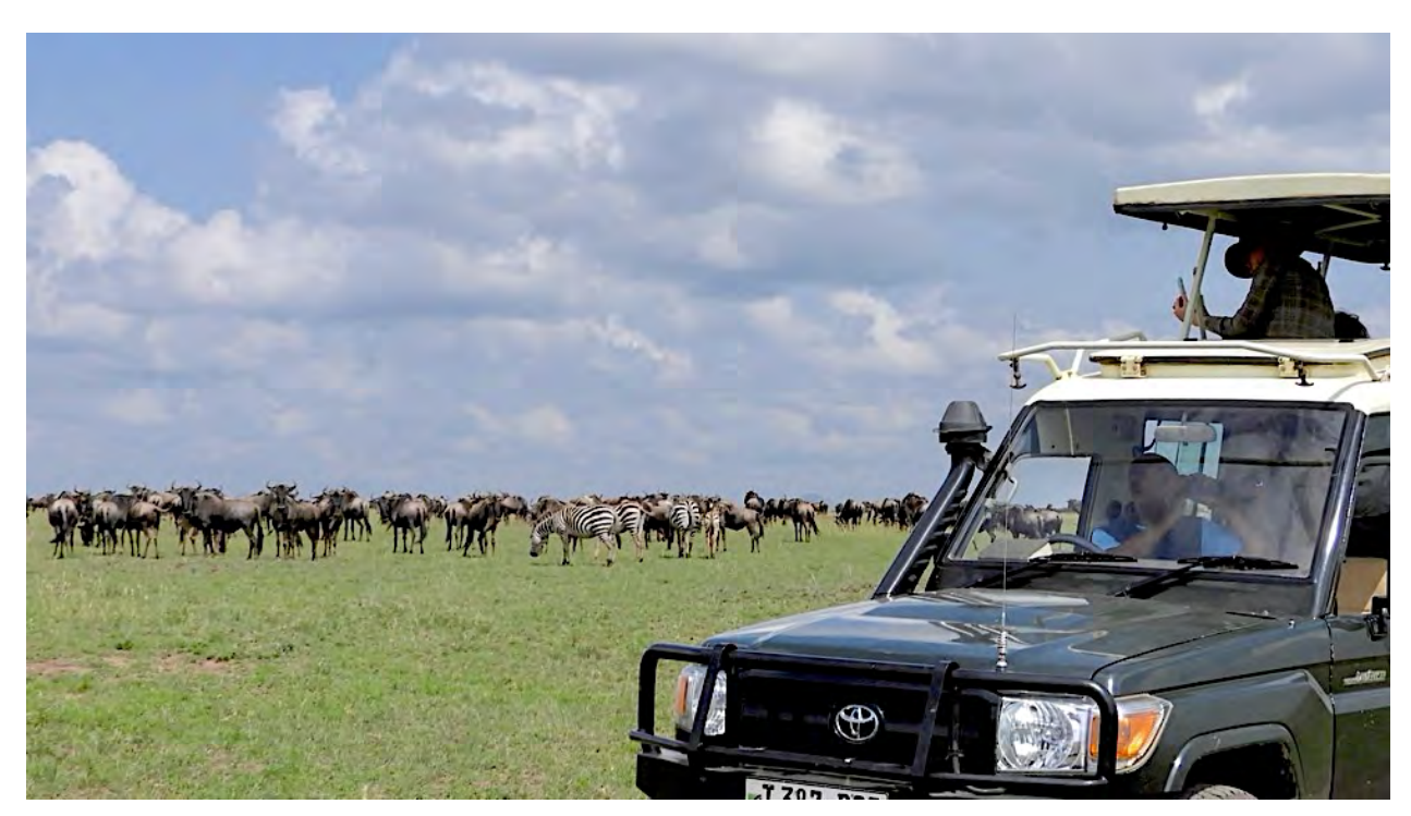
We'll spend time in safari vehicles in Tanzania, where we will not be able to do much walking, but we'll get great views of the wildlife.