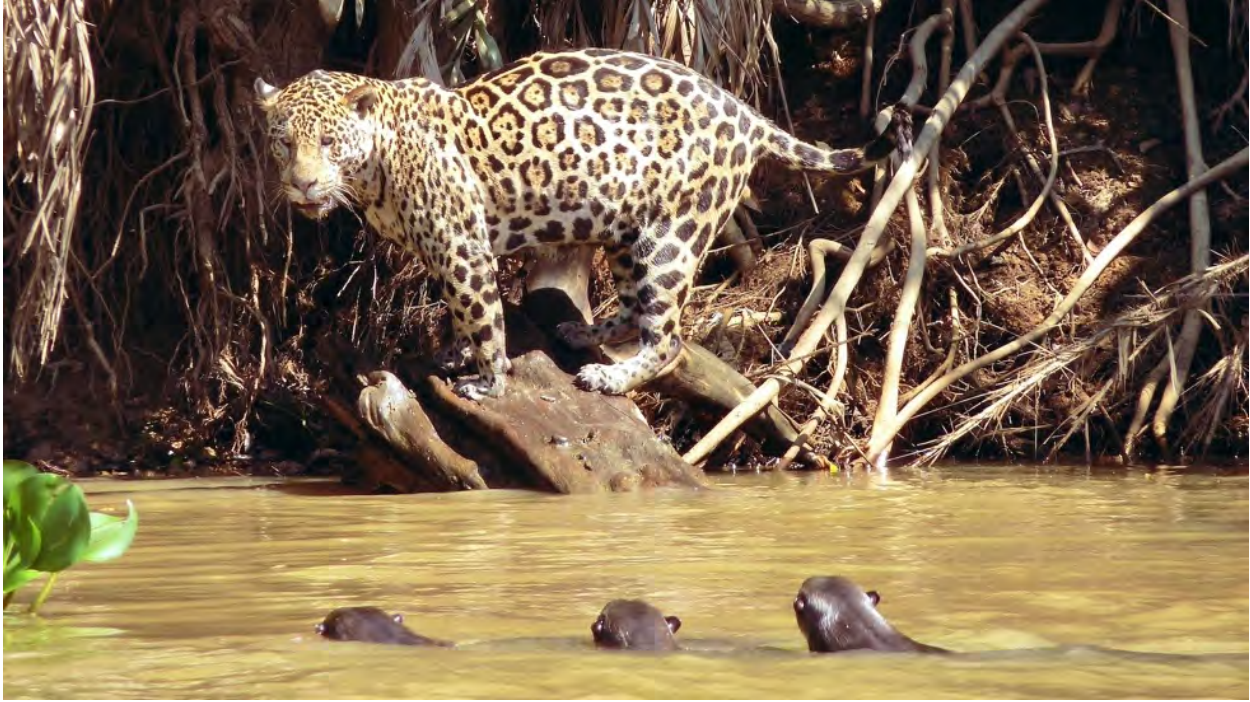
While we're watching for birds, we'll also keep an eye out for interesting mammals. On a recent tour, we saw this female Jaguar being confronted by three Giant Otters. While we can't guarantee anything this exciting, we have excellent chances of seeing a Jaguar, and probably Giant Otters as well.

staying for several days in a single, birdy place; spending most of the day on foot instead of in vehicles; taking time to learn about the natural history and behavior of the birds they see; having regular afternoon periods for rest or birding a little on their own; and (often mentioned last but almost never forgotten) great food. Your Field Guides leaders like all of these things, too, but it is relatively rare that a tour destination, especially a tropical one, provides the special setting required for the ultimate combination of activities. Hours after arrival at Alta Floresta and the Cristalino Jungle Lodge, you will know that you are there! Having unpacked, your clothes and books in handy places all over the room, you will still be deliriously happy because the moving van is delayed another WEEK...there is nothing to do but bird, eat, and sleep!