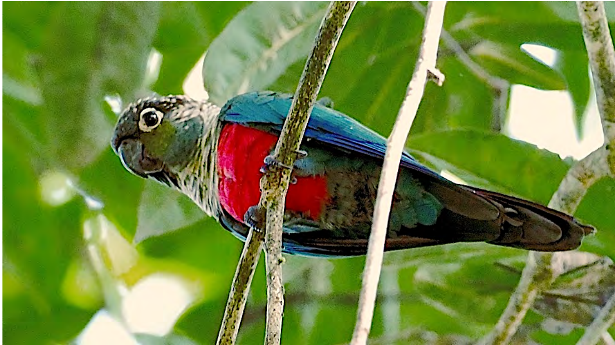
Crimson-bellied Parakeet is a regional specialty that we'll watch for from the towers at Rio Cristalino Jungle Lodge.

We include here information for those interested in the 2024 Field Guides Alta Floresta & the Northern Pantanal, Brazil tour: