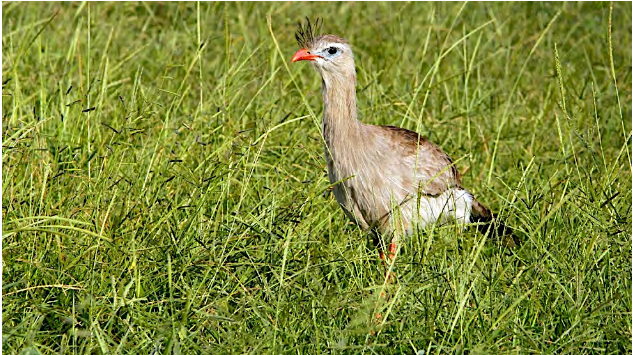
The Red-legged Seriema is one of the birds we'll watch for at Pousada Piuval.

Most of the trails (with one major exception) are level and easy to walk. The single steep trail ascends to a rocky hilltop ( serra ) in the forest and provides a look at the canopy (and it's not very long or difficult). Nights at the Cristalino Jungle Lodge.