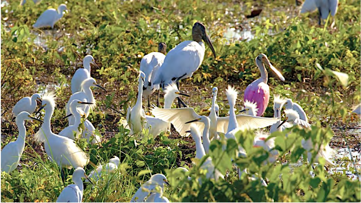
The Pantanal is famous for concentrations of waterbirds, including Wood Storks, Roseate Spoonbills and Snowy Egrets.

Chapada dos Guimaraes —The Chapada dos Guimaraes is a spectacular red-rock escarpment along the western edge of the Planalto Central, or Central Plateau of Brazil. The tableland along the top of the plateau is generally covered with cerrado habitat, a rather closed grassland with many species of arid-adapted trees on gently rolling ground. Specialties of this habitat range from White-eared Puffbird, Rufous-winged Antshrike, Rusty-backed Antwren, Rufous-sided Pygmy-Tyrant, White-rumped and White-banded tanagers, Coal-crested Finch, and Black-throated Saltator, to Horned Sungem, Curl-crested Jay, and the recently described Chapada Flycatcher. Patches of woodland and forest along the escarpment itself harbor a different set of specialties, such as Helmeted Manakin and Large-billed Antwren, species that need good woodland. Here too, one finds some Amazonian species near the southern limit of their ranges. Note that possibilities occurring primarily in this habitat on our tour are indicated on the checklist with a G.