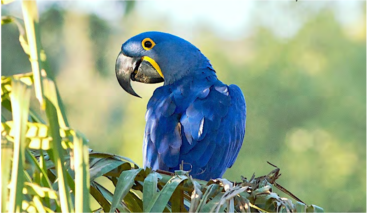
The spectacular Hyacinth Macaw is one of many parrot species we'll see on this tour.

Our itinerary continues with a two-day visit to the red-rock canyon country of Chapada dos Guimaraes and ends with four days in the northern Pantanal. That region is truly one of the birdiest in all of South America, and it is in the Pantanal that we stand a fairly good chance of finding a Jaguar. Even if you've birded the southern Pantanal, you will see some new birds in the north, perhaps a Cinereous-breasted Spinetail or Subtropical Doradito, or the handsome Chestnut-bellied Guan. On past tours we've seen nearly 30 species of parrots and macaws, making this tour one of our richest for psittacids.