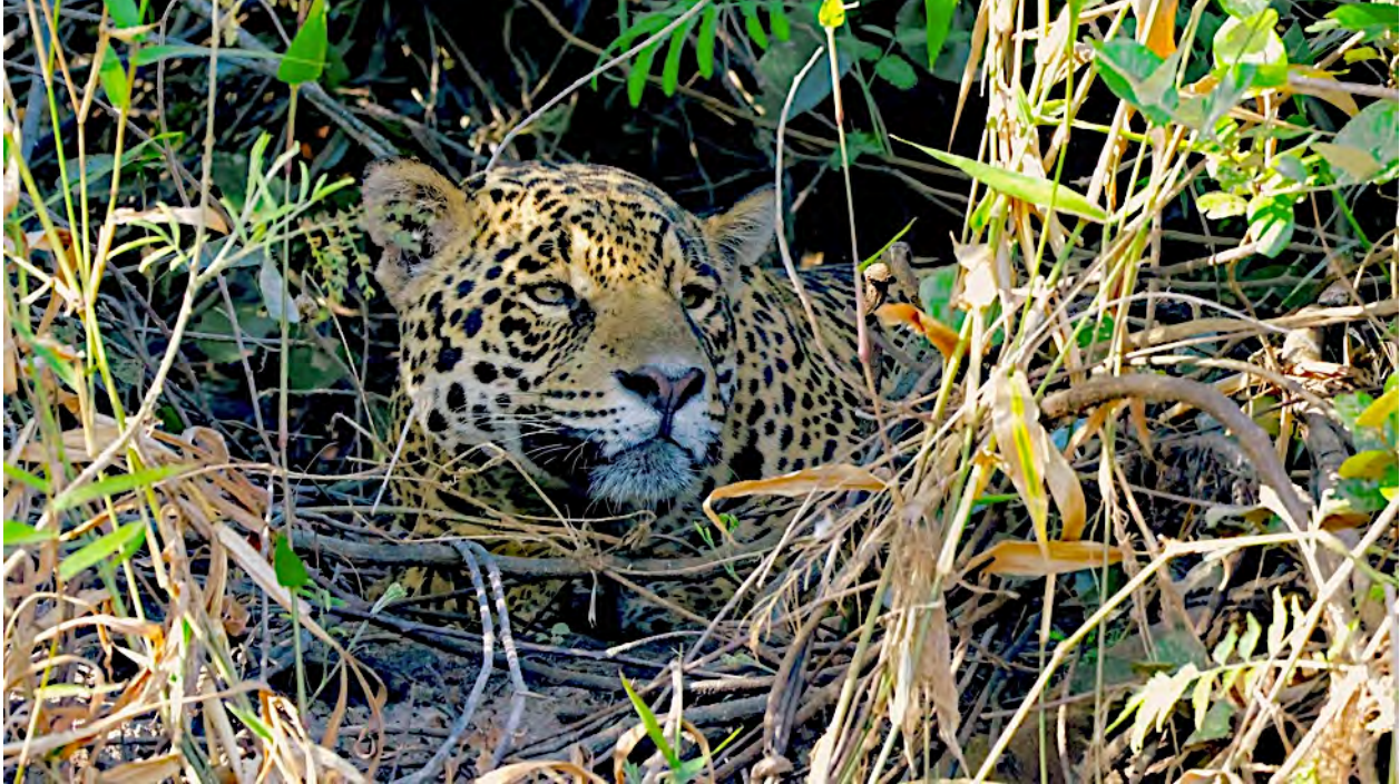
While we're watching for birds, we'll also keep an eye out for interesting mammals. On recent tours we have seen Jaguars, Giant Otters and many others.

staying for several days in a single, birdy place; spending most of the day on foot instead of in vehicles; taking time to learn about the natural history and behavior of the birds they see; having regular afternoon periods for rest or birding a little on their own; and (often mentioned last but almost never forgotten) great food. Your Field Guides leaders like all of these things, too, but it is relatively rare that a tour destination, especially a tropical one, provides the special setting required for the ultimate combination of activities. Hours after arrival at Alta Floresta and the Cristalino Jungle Lodge, you will know that you are there! Having unpacked, your clothes and books in handy places all over the room, you will still be deliriously happy because the moving van is delayed another WEEK...there is nothing to do but bird, eat, and sleep!