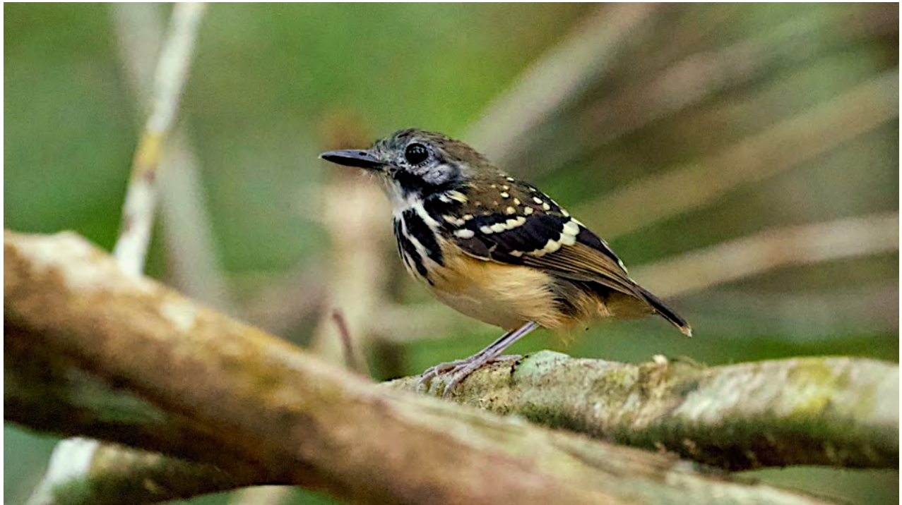
We'll see a number of antbirds, including beauties like this Dot-Backed Antbird.

Most of the trails (with one major exception) are level and easy to walk. The single steep trail ascends to a rocky hilltop ( serra ) in the forest and provides a look at the canopy (and it's not very long or difficult). Nights at the Cristalino Jungle Lodge.