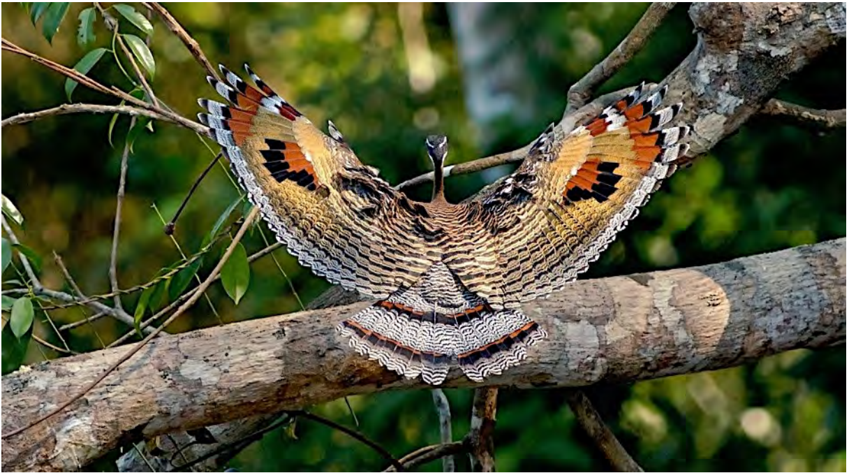
The dazzling Sunbittern is a resident along many of the rivers in South America.

After lunch, we'll continue south for some 40 kilometers on the Transpantaneira to Rio Claro Lodge, where we'll bird the river in the late afternoon in search of Sungrebes, White-throated Piping-guans and Yellow-collared Macaws. We may offer a night-drive along the entrance road after dinner. Possibilities include Nacunda Nighthawk, Scissor-tailed Nightjar, lots of Pauraques, and some nocturnal mammals such as Crab-eating Fox and, with great luck, Giant Anteater. Night at Pousada Rio Claro.