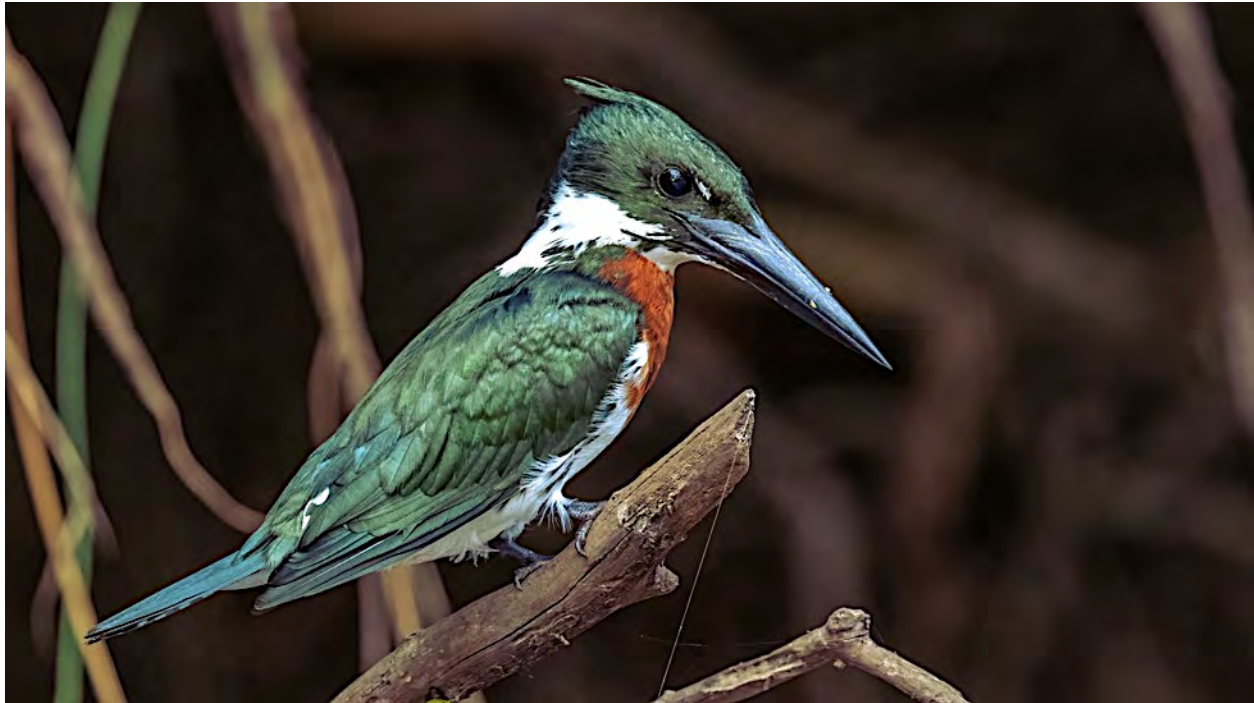
We'll have a chance to see all five Neotropical kingfishers, including the Amazon Kingfisher.

We include here information for those interested in the 2025 Field Guides Alta Floresta & the Northern Pantanal, Brazil tour: