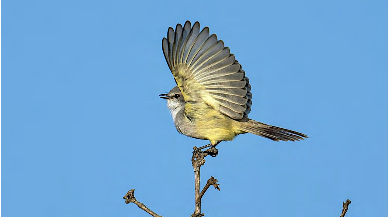
The Chapada Flycatcher is a near-endemic found in cerrado habitats like that around Chapada dos Guimaraes.

Chapada dos Guimaraes —The Chapada dos Guimaraes is a spectacular red-rock escarpment along the western edge of the Planalto Central, or Central Plateau of Brazil. The tableland along the top of the plateau is generally covered with cerrado habitat, a rather closed grassland with many species of arid-adapted trees on gently rolling ground. Specialties of this habitat range from White-eared Puffbird, Rufous-winged Antshrike, Rusty-backed Antwren, Rufous-sided Pygmy-Tyrant, White-rumped and White-banded tanagers, Coal-crested Finch, and Black-throated Saltator, to Horned Sungem, Curl-crested Jay, and the recently described Chapada Flycatcher. Patches of woodland and forest along the escarpment itself harbor a different set of specialties, such as Helmeted Manakin and Large-billed Antwren, species that need good woodland. Here too, one finds some Amazonian species near the southern limit of their ranges. Note that possibilities occurring primarily in this habitat on our tour are indicated on the checklist with a G.