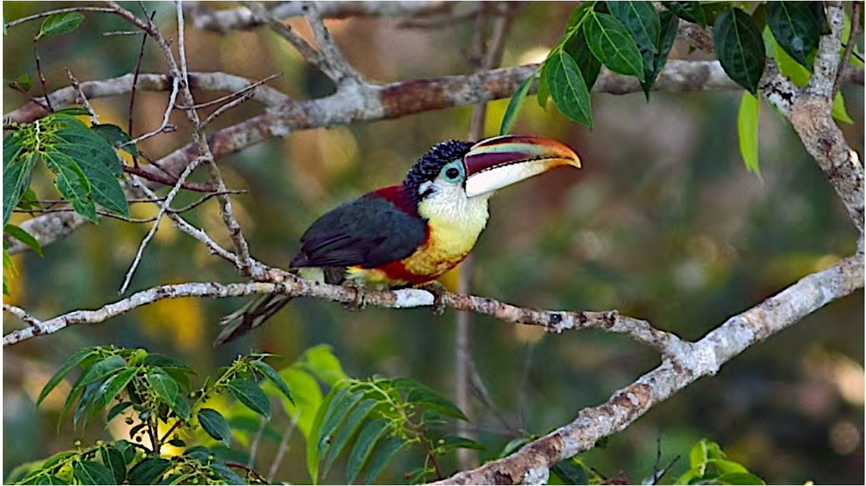
We have had very good views of the unusual Curl-crested Aracari from one of the towers at Rio Cristalino Jungle Lodge near Alta Floresta.

Antshrike, Black-bellied Antwren, Mato Grosso Antbird, Campo Suiriri Flycatcher, Ashy-headed Greenlet, Red-crested and Yellow-billed cardinals, White-bellied and Rusty-collared seedeaters, and Unicolored and Scarlet-headed blackbirds (catch your breath)...and the Pantanal may well be the highlight of the trip! Primarily Pantanal species are indicated on your checklist with a P.