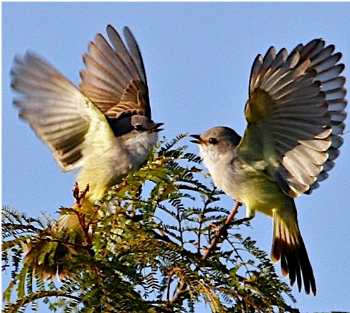
Chapada Flycatchers displaying.

Day 3, Wed, 21 Nov. Chapada birding. We'll have an early breakfast and drive a few kilometers out into cerrado habitat to bird for several hours this morning. It's sure to be an exciting time unless a southern cold front has moved in. After a break at the hotel, we'll bird another patch of Cerrado in the afternoon in search of any species we may have missed in the morning. Our targets will include White-rumped and White-banded tanagers, the nomadic Coal-crested Finch, Curl-crested Jays, and many other cerrado endemics that are not likely to be seen on other areas of the tour. Night at Pousada Cambara in Chapada dos Guimaraes