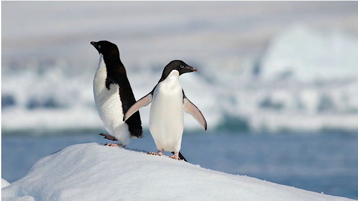
Adelle Penguins are emblematic residents of the Antarctic, and we will be able to visit a colony of these endearing inhabitants of the far south.

We include here information for those interested in the 2022 Field Guides Antarctica – Antarctic Peninsula, South Georgia & the Falkland Islands tour: