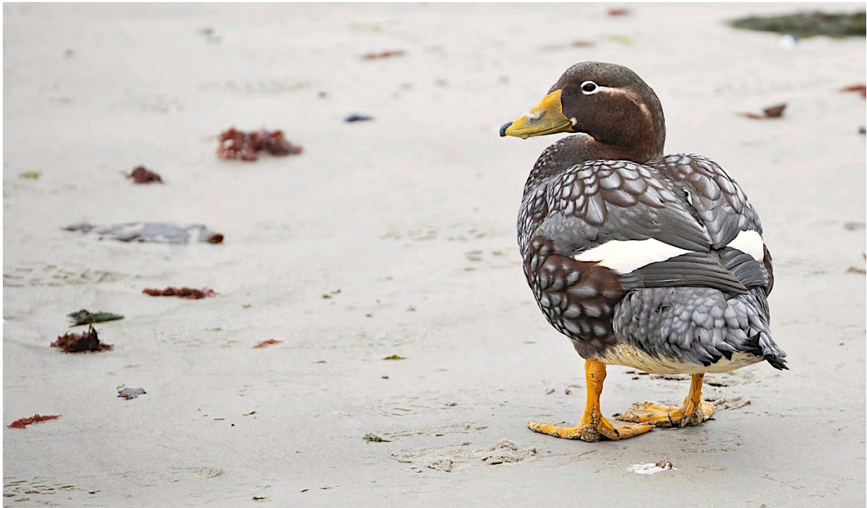
The Falkland Steamer-Duck is one of two endemics found on the Falklands. These flightless ducks breed along the coastline of the islands, where they are quite common.

Days 5-6, Wed-Thu, 9-10 Nov. Falkland Islands. The British Overseas Territory of the Falkland Islands offers a fascinating window into human history and conflict, with Argentina disputing the British claim to these islands. While not ignoring the human conflict represented by the islands, our time here will focus on the wildlife that this relatively warm and lush landscape has to offer. Due to the islands' isolation from South America, a distinctive set of resident birds exists here, and we'll seek them out - Striated Caracara, Cobb's Wren, Falkland Steamer-Duck, Rufous-chested Dotterel, Two-banded Plover, and more. Our first day will likely be spent visiting the western end of the Falklands, including a site where we might explore a colony with up to 4 species of breeding penguin (Magellanic, Gentoo, Southern Rockhopper, and small numbers of King) as well as Black-browed Albatross and Imperial Cormorants. We'll also stop in the islands' capital city of Port Stanley – during this time, instead of spending our time in museums and souvenir shops, we will arrange transportation to get us out onto the moorlands and beaches near the airport to search for Rufous-chested Dotterel, Two-banded Plover, and more.