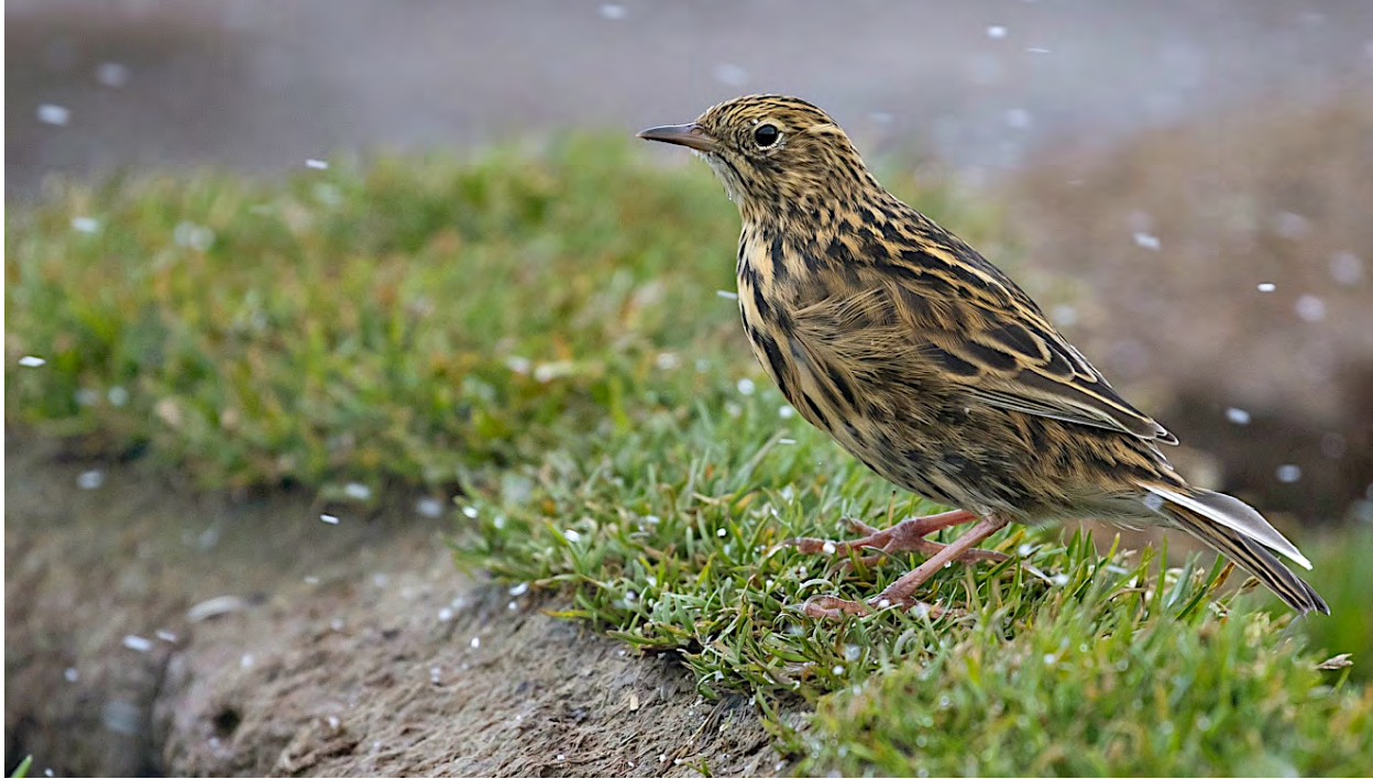
The South Georgia Pipit is the most southerly resident songbird. The environment is harsh on South Georgia, so these must be hardy little birds, indeed!

**Important note** - This itinerary reflects a plan based on our last two trips (2018 & 2019). Please note that all sites and landings are subject to change due to weather and the discretion of the captain and expedition staff.