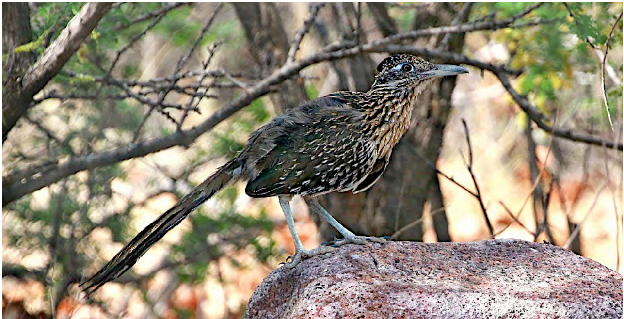
Greater Roadrunner is the State Bird of Arizona. We're sure to see at least one!

Day 1. Arrival in Tucson. Please plan to arrive in Tucson no later than 2:00 p.m. You may call the motel, located just two minutes away from the airport, for complimentary transportation. We plan to meet in the lobby of the motel at 2:30 p.m. to start our birding. Where we go this afternoon depends largely on what's been around, but we'll likely visit a favored watering hole in town and/or a county park where we could see the likes of Harris's Hawk, Gambel's Quail, Gilded Flicker, Gila Woodpecker, Cactus Wren, Black-tailed Gnatcatcher, Verdin, Lucy's Warbler, Rufous-winged Sparrow, and many other species characteristic of the Sonoran Desert. Alternatively, we may decide to ascend the nearby Santa Catalina Mountains (Mt. Lemmon) with a picnic dinner in tow to get our first taste of the Southeast Arizona mountain habitats and attempt a bit of owling before returning to our rooms for the night. It will be quite warm when we head out but could be cooling off at dusk if we decide to stay out for a picnic dinner. Night in Tucson.