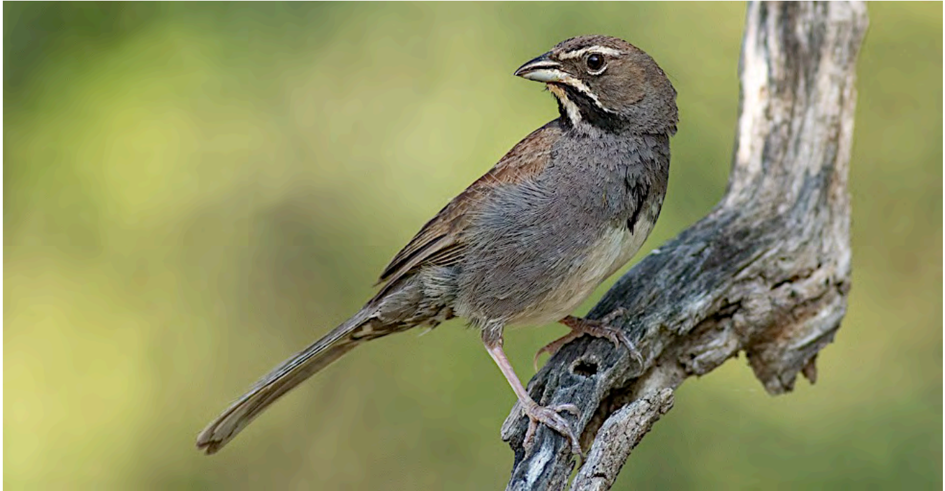
The Five-striped Sparrow is a specialty of the Arizona/Mexico border region. In the US, these desert-grassland sparrows occur only in far southeastern Arizona, where they can be a bit difficult to find, but we have very good luck in seeing them on our tours!

We include here information for those interested in the 2018 Field Guides Arizona: Birding the Border tours: