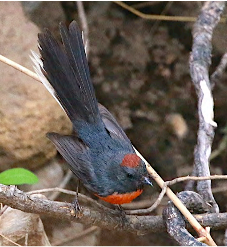
Slate-throated Redstart is a rare vagrant from Mexico; while the tour focuses on Arizona specialties, we'll be on the lookout for any rarities that stray our way!

Huachuca Mountains —From our headquarters in Sierra Vista we will have a couple of days to explore the Huachuca Mountains. The majestic Huachucas remain one of the wildest ranges in Southeast Arizona. Many of the sharp ridges and rugged canyons are reached only by arduous treks. A few of the finest canyons in the Huachucas, however, are easily accessible.