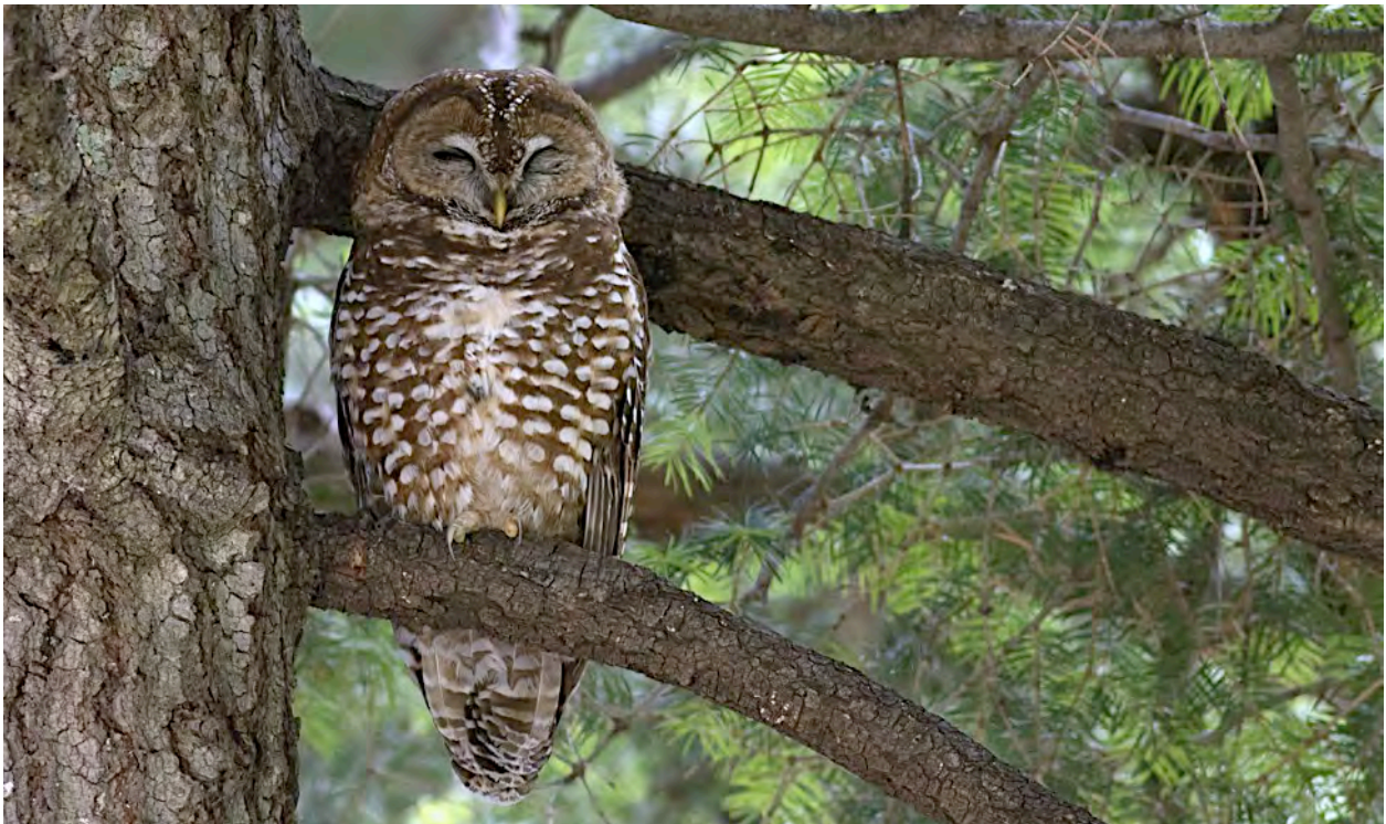
One of our targets will be the Spotted Owl, one of eight possible owl species in southern Arizona. We'll look for these lovely owls in the Huachuca Mountains, and other higher elevation locations.

Day 7. Sierra Vista area; to Patagonia/Sonoita Creek/Nogales area. We'll have a chance today to look for some migrants or desert grassland species as well as some of the riparian breeding birds in the Sierra Vista area. Later in the morning, we'll head to the Patagonia area for some afternoon birding in the Sonoita Creek area. Night in Nogales.