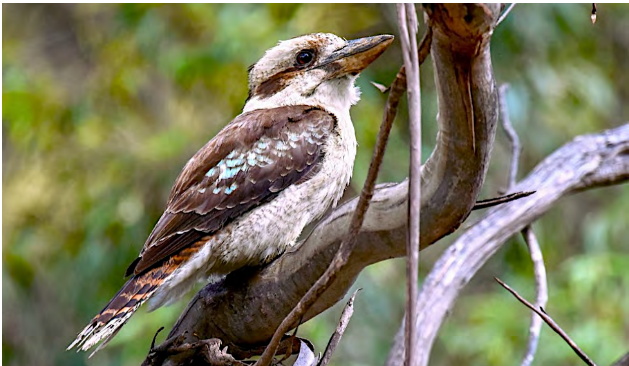
The Laughing Kookaburra is an iconic species found in the woodlands of eastern Australia.

If you are uncertain about whether this tour is a good match for your abilities, please don't hesitate to contact our office; if they cannot directly answer your queries, they will put you in touch with one of the guides.