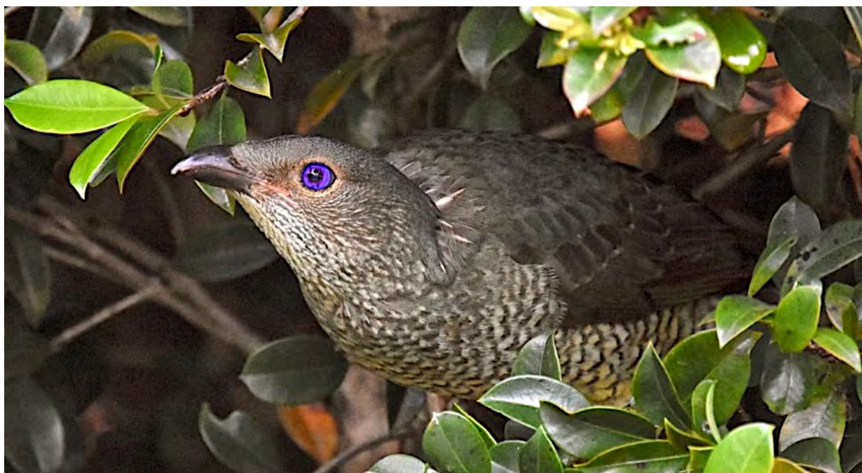
Bowerbirds are special members of the avifauna of Australia. The mature male Satin Bowerbird is satiny-black with a brilliant purple eye like that of this bird, which may be an immature male. We'll look for these interesting, artistic birds in eastern Australia at Lamington National Park.

We'll also go afield by night in search of (Greater) Sooty-Owl (rare), Southern Boobook, frogmouths, Australian Owlet-Nightjar, and mammals. Among the several mammal possibilities are Common Ringtail and Short-eared (Mountain Brush-tailed) possums.