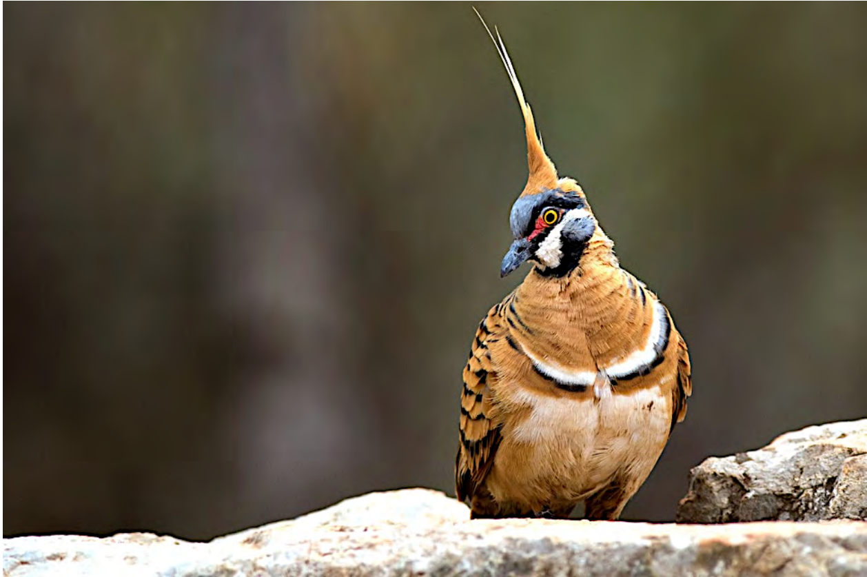
The colorful Spinifex Pigeon is one of a number of interesting Australian doves that we'll seek.

Near Alice Springs possibilities include White-fronted and Black honeyeaters (nomadic; both sometimes absent if clumps of mistletoe are not in bloom) and Pied Butcherbird. We may also see Bourke's Parrot, the nomadic Budgerigar, and the scarce Gray Honeyeater, which favors Mulga woodland. The Wallaroo, or Euro, a kangaroo well adapted for desert life, also frequents the area. The Red Kangaroo, a gregarious species and the largest of the kangaroos can sometimes be found in the flatter, mulga rich country northwest and southeast of town.