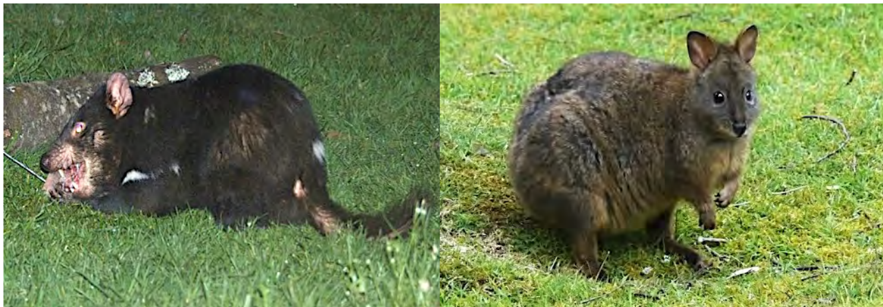
Tasmania is home to a number of endemic mammals in addition to its endemic birds. Here are two of these interesting creatures: left, the iconic Tasmanian Devil, and right, the Tasmanian Pademelon.

Bruny Island, located a short distance from Hobart, is reached by a short car-ferry ride. On the 20-minute boat ride in the calm channel we will keep our eyes open for Black-faced Cormorant, the large and impressive Pacific Gull and Kelp Gull. The island is the best place to see several of the endemics including the rare Forty-spotted Pardalote. Along some of the sandy beaches we'll look for the increasingly rare Hooded Plover.