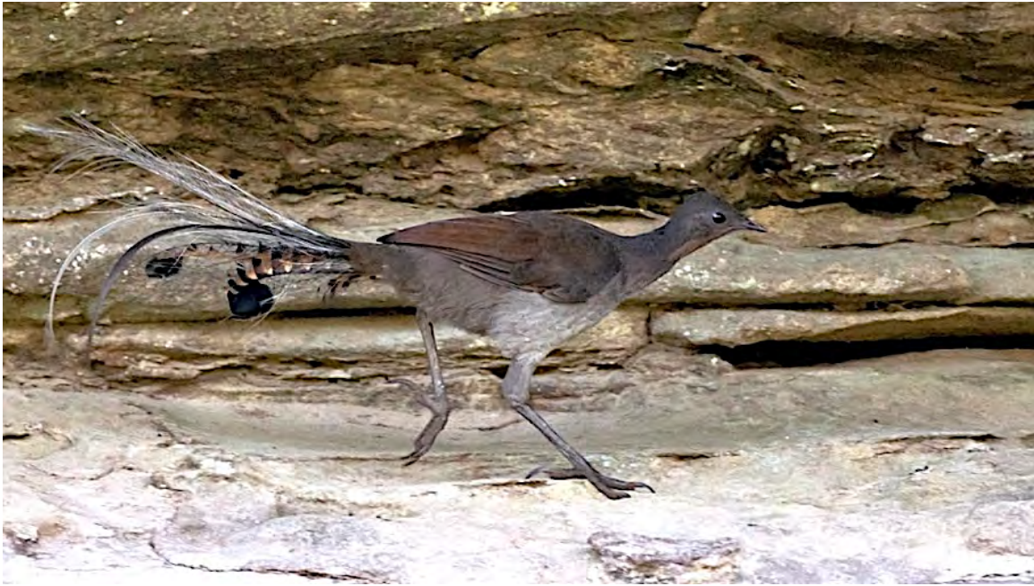
The Superb Lyrebird is said to be the world's largest passerine, and is one of the world's best mimics.