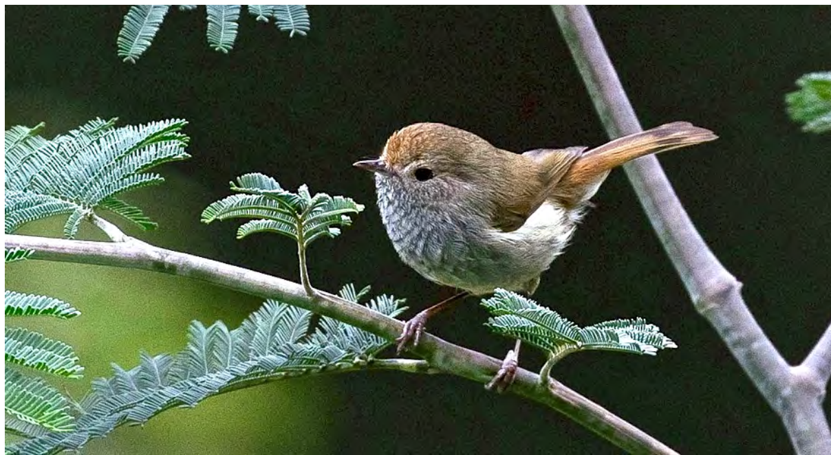
The tiny Tasmanian Thornbill is a common species endemic to Tasmania.

The human history of Tasmania is also one of isolation. Although Abel Tasman first sighted the island in 1642, Europeans did not land here until several years later. Many of the early settlements were penal colonies, and convicts were sent to Port Arthur (near Hobart, Australia's 2nd oldest city)—the island's most notorious prison—beginning in 1823. Immigration to Tasmania is still slow, though increasing recently as the secret has gotten out; among its 500,000 people is the highest percentage of inhabitants born in Australia of any state in the country.