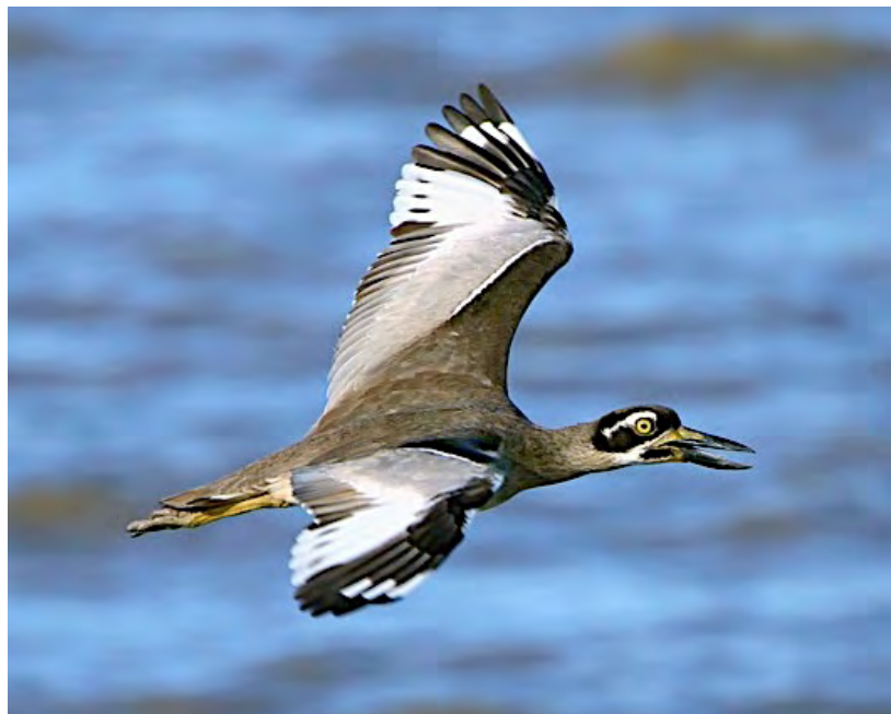
The Beach Thick-knee is one of the largest shorebirds. They occur along the northern and eastern coasts of Australia.

The Cairns waterfront—the Esplanade—is surely one of the best shorebirding spots in the world. High tide pushes the birds in toward the elevated walkway by the hundreds, even thousands. There is an excellent assemblage of species, too, mostly of East Asian and Siberian origin. Among the species to watch for along the Esplanade are Pacific Golden-Plover, Red-capped Plover, Lesser and Greater sandpipers, Far Eastern Curlew, Common Greenshank, Terek Sandpiper, Bar-tailed and Black-tailed godwits, Red-necked Stint, Sharp-tailed, Curlew and Broad-billed (scarce but regular) sandpipers, Yellow-billed and Royal spoonbills, Little Tern, the nearly cosmopolitan Osprey, and in trees along the coast, Varied Honeyeater and Olive-backed Sunbird.