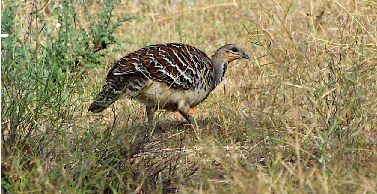
Megapodes are represented by three species in Australia. The Malleefowl is found in scattered scrubby areas of southern Australia, and we'll seek them on Part I of the tour.

A ustralia, the “Island Continent,” is a great plate of Earth’s crust that has come to rest between the waters of the Indian and Pacific oceans. Isolated since the breakup of Pangaea, it is an old continent, unchanged by the catastrophic mountain-building forces that have so altered the others. Only in a narrow crescent in the far eastern region do low hills and mountains, cloaked in dripping rainforest, relieve the brushy woodlands and arid plains that stretch away to the western edge of the land. Interior Australia, the vast Outback, ranks among the world’s largest deserts; it imposes a further isolating force on the continent’s flora and fauna, for in this hard place, relatively few creatures have evolved the means of survival. The greatest diversity of Australia’s abundant wildlife, however, is beyond the edge of the deserts, in the deep rainforests of the east, the extensive woodlands and heaths of the southwest, wild swamps and forests of the humid north, and the riverine districts and eucalypt forests of the southeast.