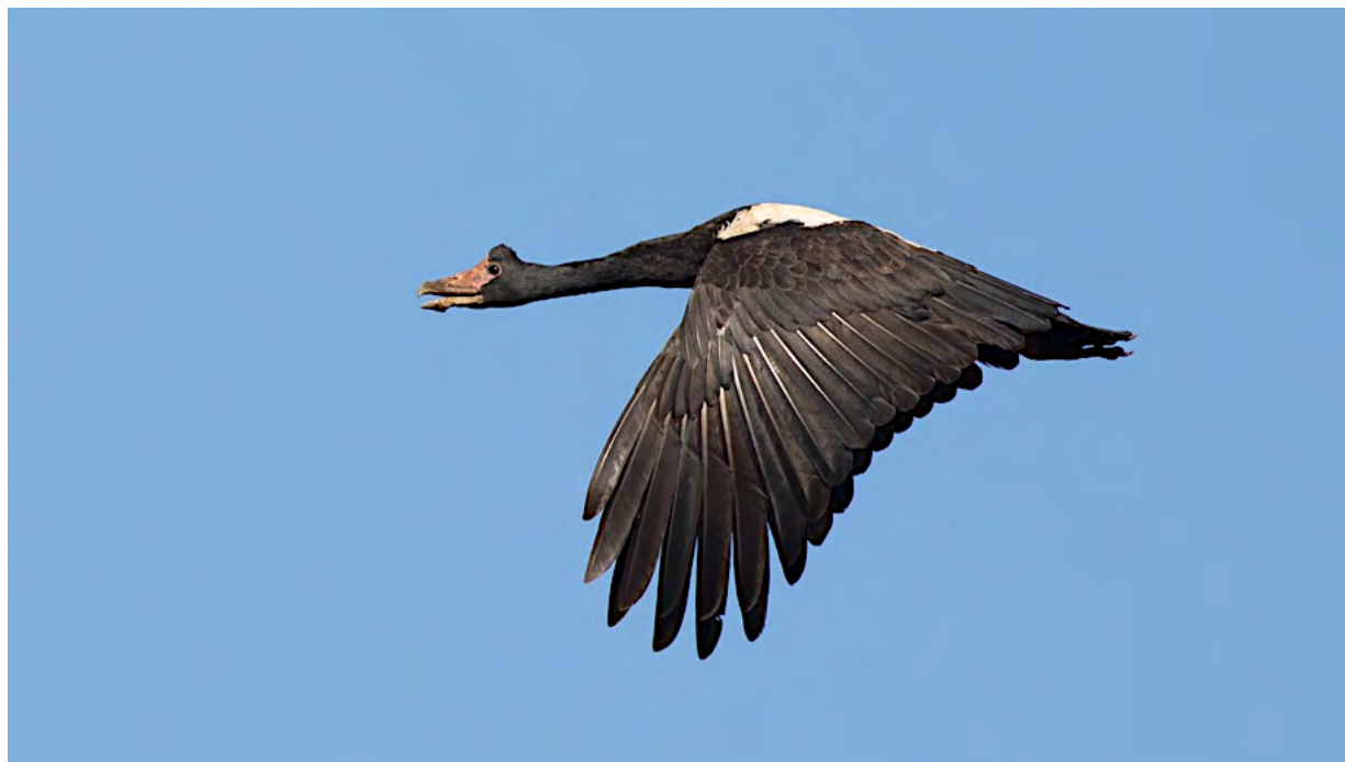
Near Darwin, we'll visit the Fogg Dam, where we'll view numerous waterbirds, including large numbers of primitive Magpie Geese.

The Southwest Corner of Australia is a wonderfully scenic spot that also harbors a few highly sought after species. Near Cape Leeuwin, we'll seek out the local Rock Parrot and keep a sharp eye out for the rare Hooded Plover, which nests at a few select beaches in this area. To the north, we'll likely visit Cape Naturaliste, where sea-watching can be productive.