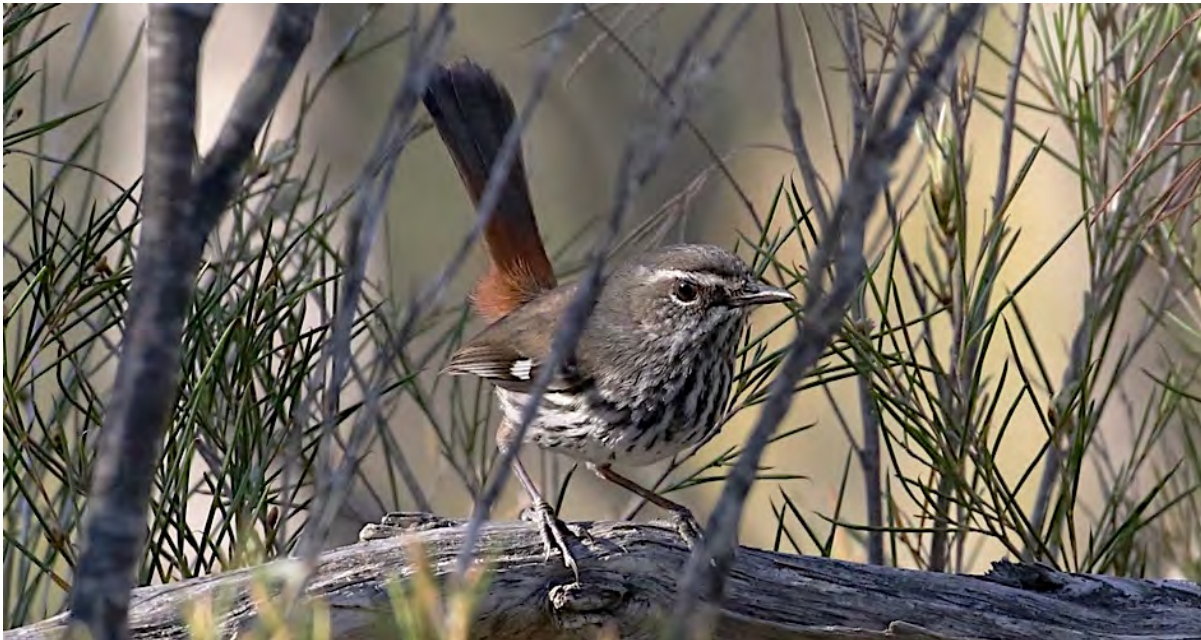
The Shy Heathwren is found in dense shrubby mallee woodlands, such as at Hattah-Kulkyne National Park.

Hattah-Kulkyne National Park is an excellent mallee site along the NSW border, famous for being one of the few localities for the rare Mallee Emuwren. The Yellow form of Crimson Rosella, Striated Grasswren, and Chestnut-crowned Babbler are all possibilities here. We'll have more chances of encountering Pink Cockatoo and Chestnut Quail-thrush, the beautiful and rather rare golden race of Regent Parrot, (elusive), as well as Australian (Mallee) Ringneck, Little Corella, Pallid Cuckoo, Red-capped Robin, Crested Bellbird, White-browed Babbler, Shy Heathwren, Southern Whiteface, and Masked and White-browed woodswallows.