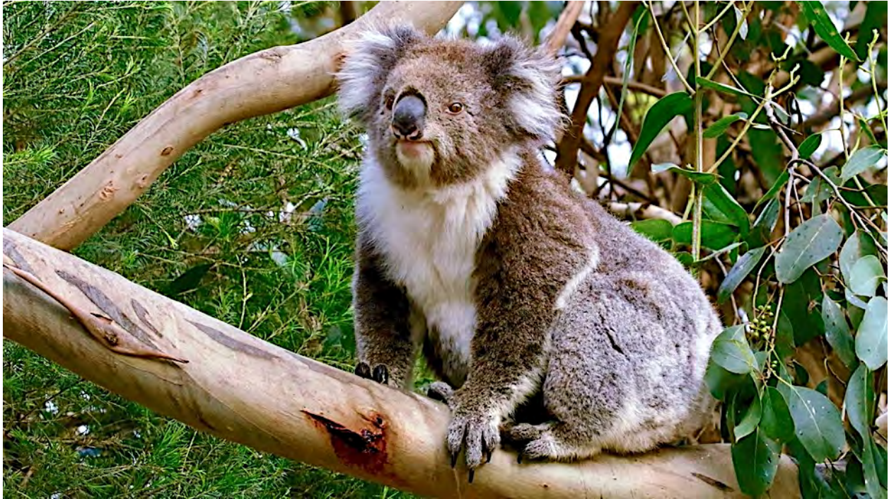
While we are in southwest Victoria, we'll watch for the Koala, another of Australia's icons.

Great Ocean Road is a stretch of scenic highway running along the coastline of southwest Victoria. We will spend time searching for some Bassian specialties, including the Rufous Bristlebird, which is endemic to the coastal heathland of this region. Other targets include the lovely and endangered Hooded Plover, Gang-gang Cockatoo, Blue-winged Parrot, Olive Whistler, Chestnut-rumped Heathwren, Striated Fieldwren, and Forest Raven. In addition, this is an excellent area to see Koala.