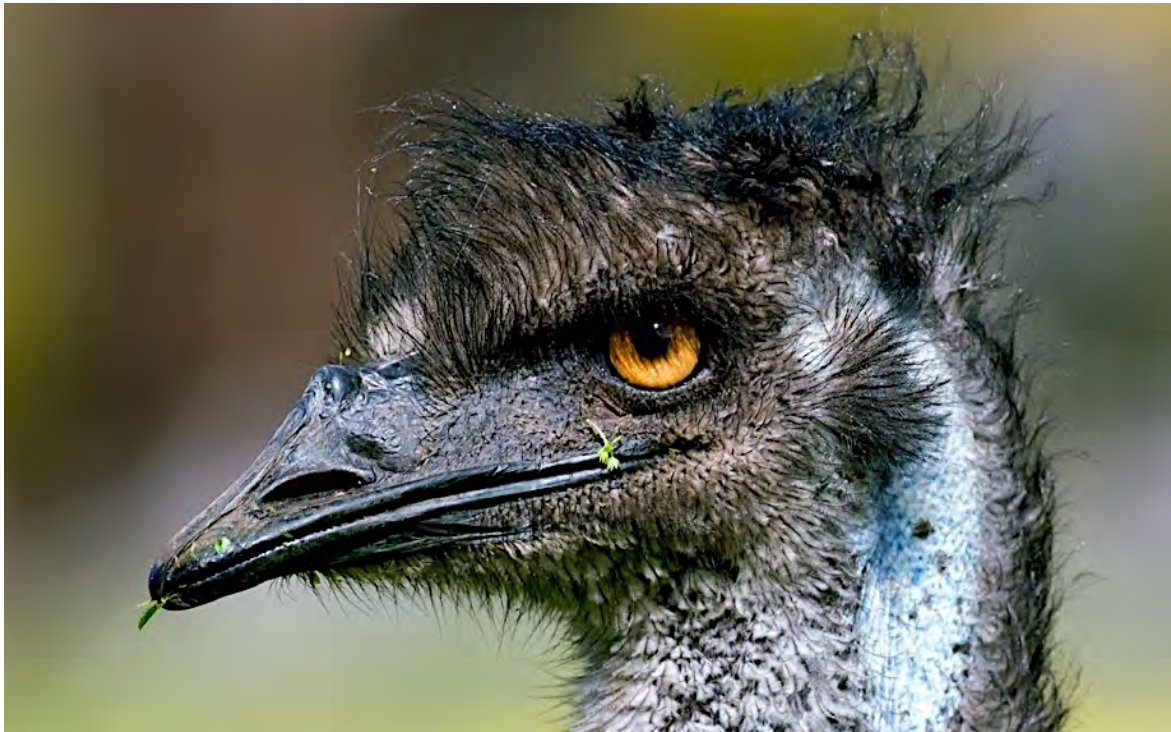
The Emu is an outback icon that we'll seek on Part I of this tour. We've had great views of these giants when we've visited Hattah-Kulkyne National Park in Victoria State.

We include here information for those interested in the 2023 Field Guides Australia tour: