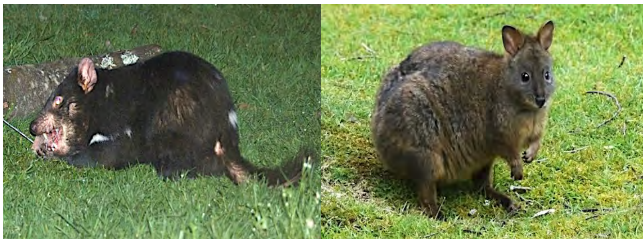
Tasmania is home to a number of endemic mammals in addition to its endemic birds. Here are two of these interesting creatures: left, the iconic Tasmanian Devil, and right, the Tasmanian Pademelon.

Bruny Island, located a short distance from Hobart, is reached by a short car-ferry ride. On the 20-minute boat ride in the calm channel we will keep our eyes open for Black-faced Cormorant, the large and impressive Pacific Gull and Kelp Gull. The island is the best place to see several of the endemics including the rare Forty-spotted Pardalote. Along some of the sandy beaches we'll look for the increasingly rare Hooded Plover.