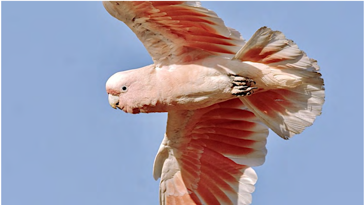
Cockatoos are another group well represented in the Australian avifauna. The Pink Cockatoo is a nomadic species except when it is nesting, and we'll look for them in the woodlands of Wyperfeld and Hattah-Kulkyne.

Little Desert National Park supports a slightly different shrub association than we will find elsewhere (dominated by Broom Honey-Myrtle, a species of Melaleuca ) and consequently harbors a few special birds, such as Tawny Frogmouth, Red-rumped Parrot, Southern Scrub-Robin, Eastern (Crested) Shrike-tit, Gilbert's Whistler, White-eared and Purple-gaped honeyeaters, Diamond Firetail, and White-winged Chough, many of which are attracted to small ponds that have been developed to enhance wildlife viewing. This area is good for thornbills, with Yellow, Buff-rumped, Yellow-rumped, Inland, and Slender-billed all possible. With luck we could see a Short-beaked Echidna digging up the earth for ants and termites. Echidnas (or "spiny anteaters") are primitive, egg-laying mammals and the only living relatives of the Platypus.