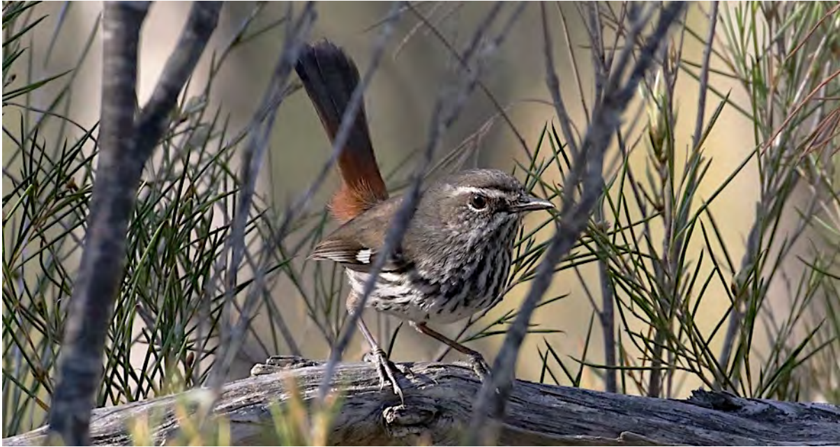
The Shy Heathwren is found in dense shrubby mallee woodlands, such as at Hattah-Kulkyne National Park.

Hattah-Kulkyne National Park is an excellent mallee site along the NSW border, famous for being one of the few localities for the rare Mallee Emu-wren. The Yellow form of Crimson Rosella, Striated Grasswren, and Chestnut-crowned Babbler are all possibilities here. We'll have more chances of encountering Pink Cockatoo and Chestnut Quail-thrush, the beautiful and rather rare golden race of Regent Parrot, (elusive), as well as Australian (Mallee) Ringneck, Little Corella, Pallid Cuckoo, Red-capped Robin, Crested Bellbird, White-browed Babbler, Shy Heathwren, Southern Whiteface, and Masked and White-browed woodswallows.