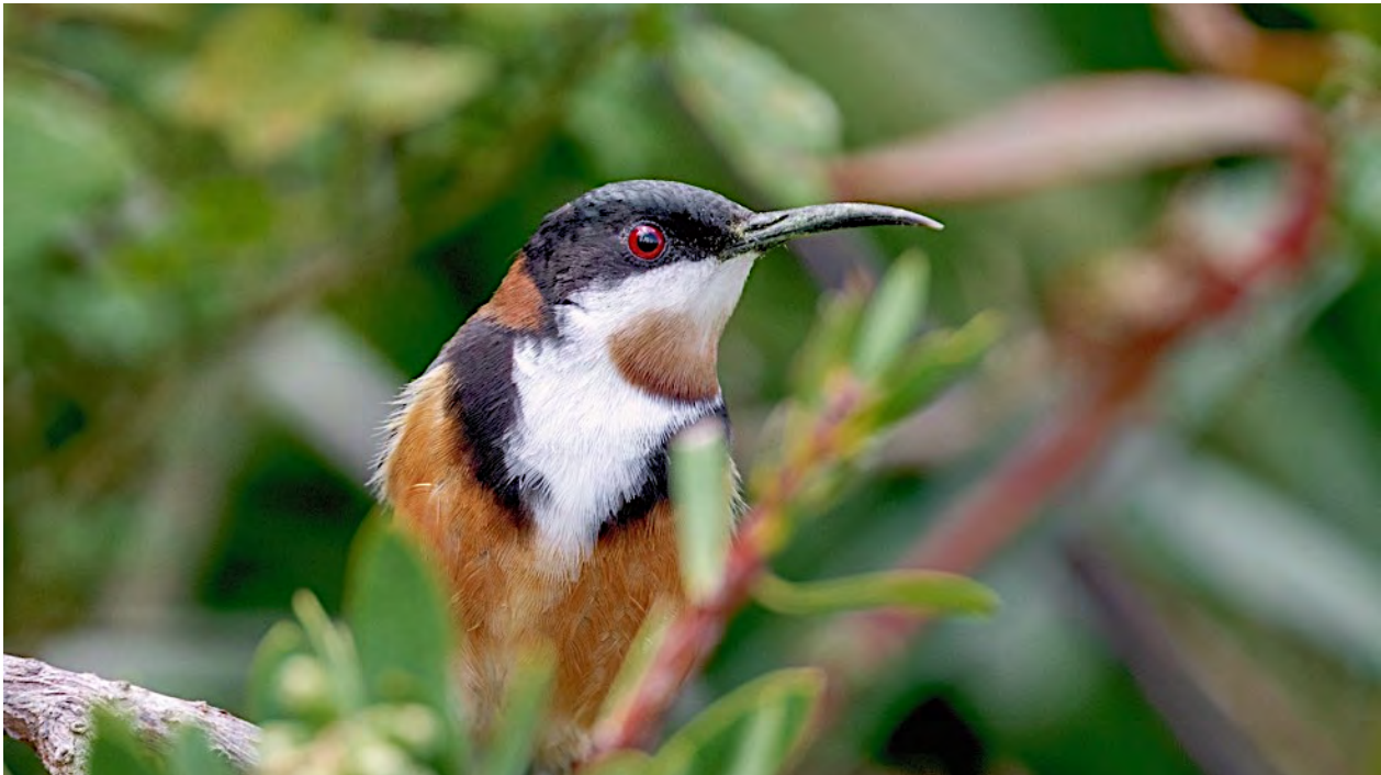
The Eastern Spinebill is a honeyeater found in the woodlands of southeastern Australia and Tasmania. This bird, and the similar Western Spinebill, are the only two members of their genus. Both spinebills feed primarily on nectar, which they glean from flowers with a brush-tipped tongue.

We include here information for those interested in the 2024 Field Guides Australia tour: