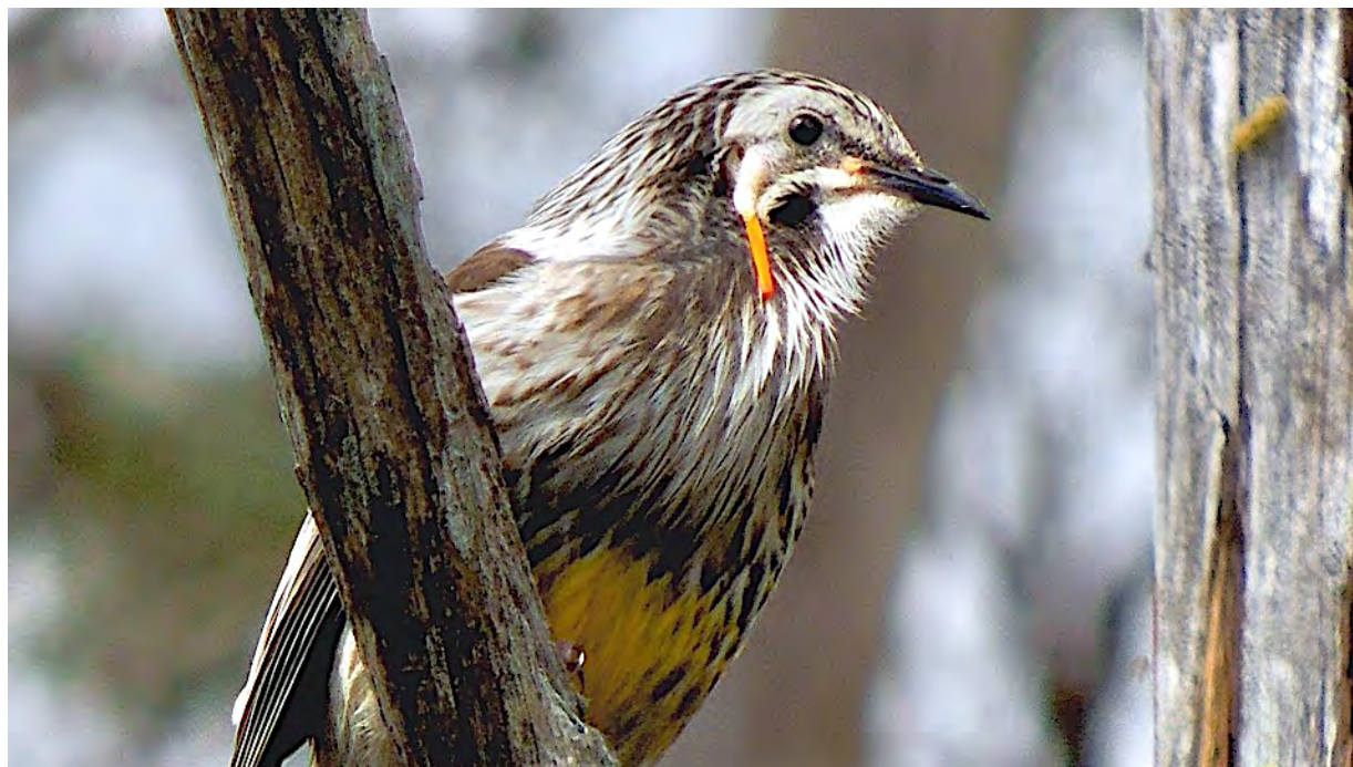
The Yellow Wattlebird is Australia's largest honeyeater, and is endemic to Tasmania.

The human history of Tasmania is also one of isolation. Although Abel Tasman first sighted the island in 1642, Europeans did not land here until several years later. Many of the early settlements were penal colonies, and convicts were sent to Port Arthur (near Hobart, Australia's 2nd oldest city)—the island's most notorious prison—beginning in 1823. Immigration to Tasmania is still slow, though increasing recently as the secret has gotten out; among its 500,000 people is the highest percentage of inhabitants born in Australia of any state in the country.