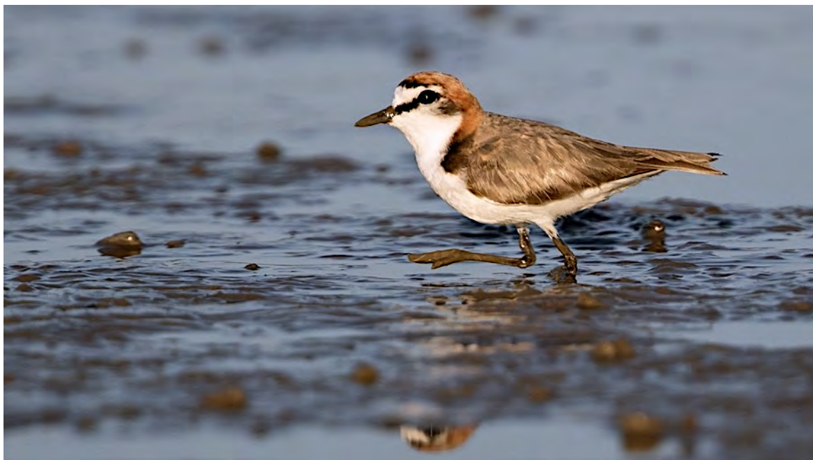
The diminutive Red-capped Plover is widespread, but we had some of our best views at the Cairns Esplanade in 2023.