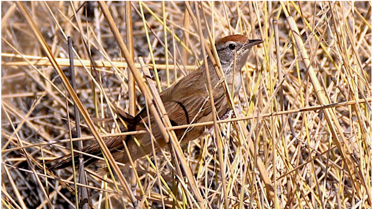
The Spinifexbird is a small warbler-like bird that can be difficult to see, but we will search for this skulker near Alice Springs.

MacDonnell Range —This rugged range represents the only topographic relief in the Alice Springs area. The range is a linear ridge of red rock, wrinkled and split with chasms and gorges. In this exceedingly arid region of rust-brown desert and clear blue skies, water is a most precious commodity, and vegetation is sparse and thorny.