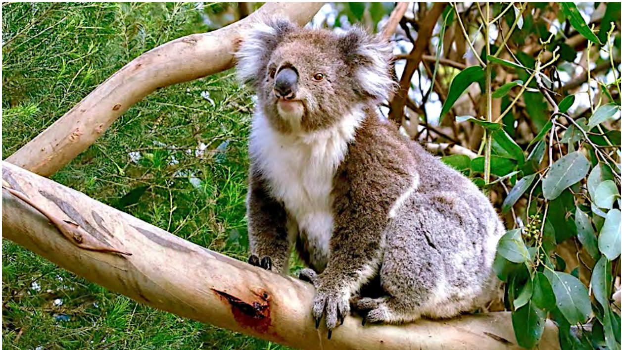
While we are in southwest Victoria, we'll watch for the Koala, an Australian icon.

Great Ocean Road is a stretch of scenic highway running along the coastline of southwest Victoria. We will spend time searching for some Bassian specialties, including the Rufous Bristlebird, which is endemic to the coastal heathland of this region. Other targets include the lovely and endangered Hooded Plover, Gang-gang Cockatoo, Blue-winged Parrot, Olive Whistler, Chestnut-rumped Heathwren, Striated Fieldwren, and Forest Raven. In addition, this is an excellent area to see Koala.