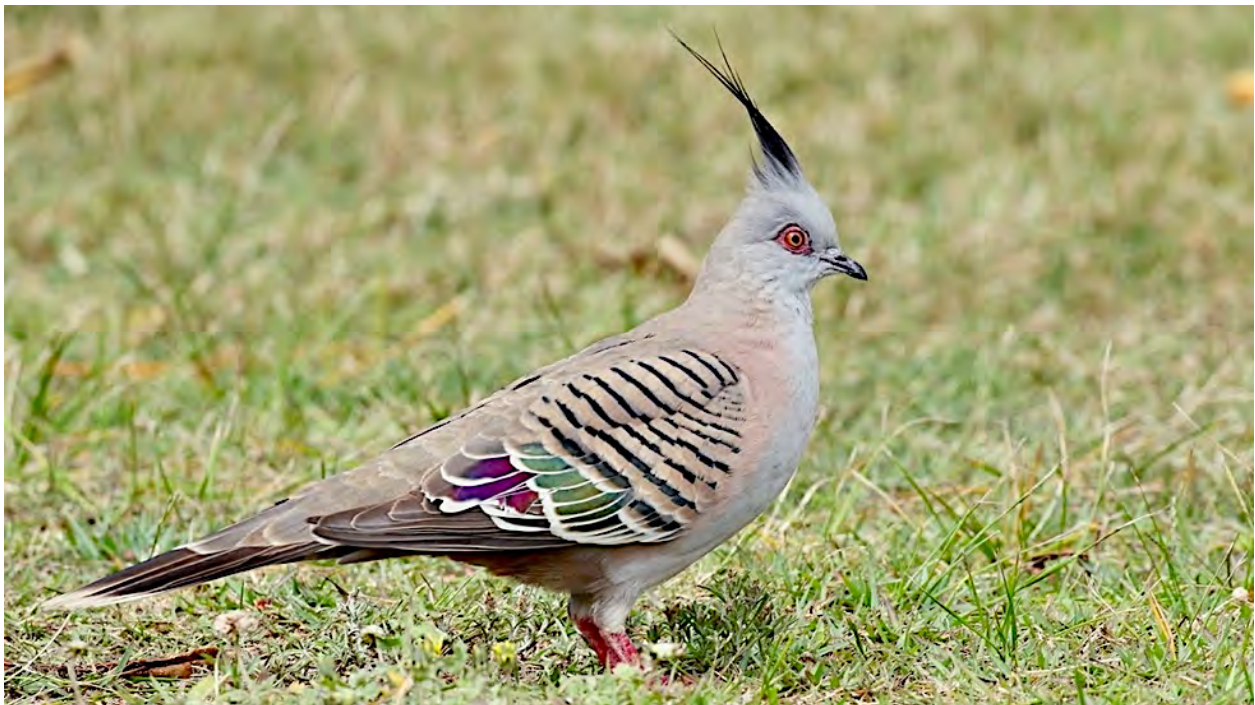
The Crested Pigeon is one of the fancier pigeons we will see. This bird is common over much of Australia.

If you are uncertain about whether this tour is a good match for your abilities, please don't hesitate to contact our office; if they cannot directly answer your queries, they will put you in touch with one of the guides.