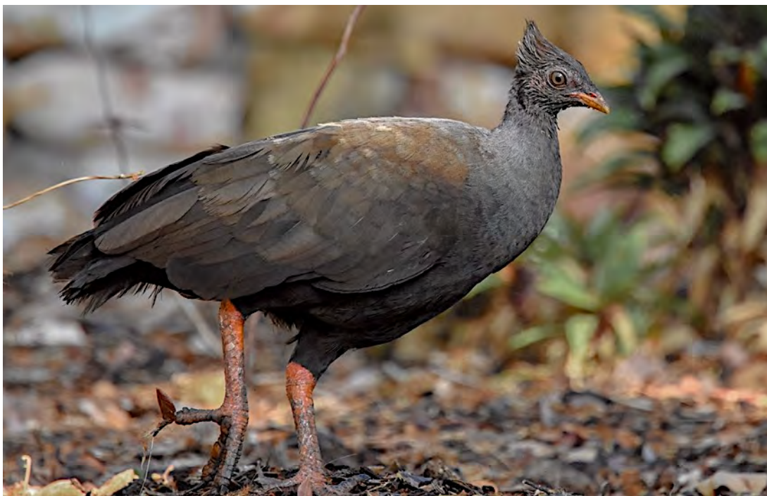
The Orange-footed Megapode is one of our targets in the Darwin region.

Howard Springs is a public park preserving a small patch of rainforest around a clear-water spring and creek. The park is a good place to look for Orange-footed Megapode (a megapode like the Malleefowl), Pacific Emerald Dove, Azure and Little kingfishers (both usually hard to see), the recently split Arafura (Little) Shrikethrush, Large-billed Gerygone, Chestnut-breasted Munia, and Double-barred and the striking Crimson finches. Tawny Frogmouth occasionally nests in the park, and with a careful check of favored trees, we may locate one or both members of a pair of these fascinating birds. It is also a good place to search for a day roost of big Black Flying-Foxes.