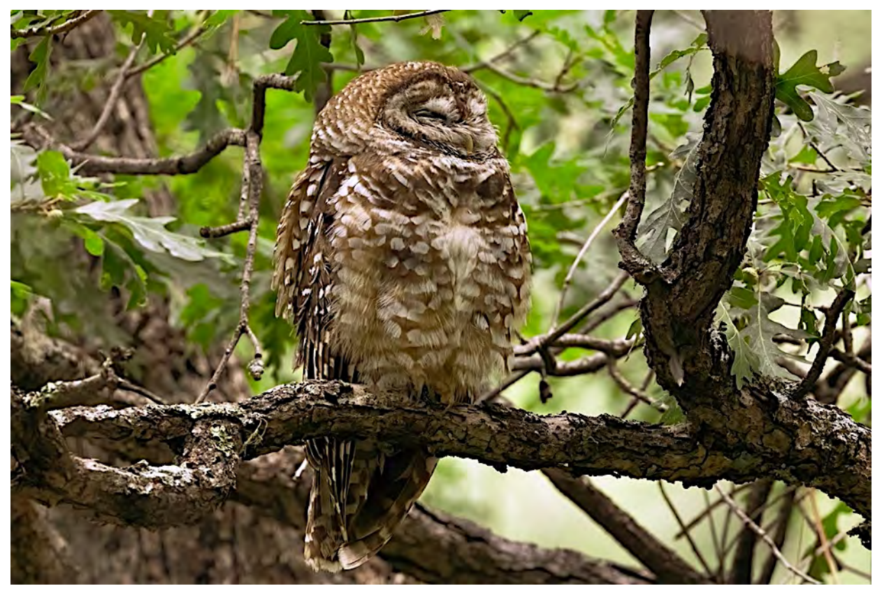
We'll visit a canyon in the Huachuca Mountains to search for Spotted Owl.

Venturing deeper into the mountains, we'll bird the mixed pine/oak and Douglas Fir forests of Carr Canyon and/or Garden Canyon in search of Zone-tailed Hawk, Northern Goshawk, Golden Eagle, Arizona Woodpecker, Greater Pewee, the very local Buff-breasted Flycatcher, Virginia's and Black-throated Gray warblers, Spotted Towhee, and Red Crossbill. During our visit here, we will offer an optional hike up either Miller or Scheelite canyon, depending on the latest information on Spotted Owl. Although the trail is narrow and rather steep in places, each canyon is beautiful, and the birding can be rewarding. With careful searching, at least one Spotted Owl can usually be located at its daytime roost for close, leisurely views. Northern (Mountain) Pygmy-Owl, Canyon Wren, Cordilleran Flycatcher, Painted Redstart, and Redfaced Warbler can also be found along the walk.