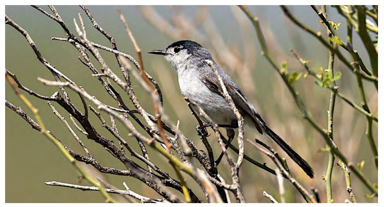
As we look for rarities, we'll enjoy many of the desert's more common species, such as the spritely Black-tailed Gnatcatcher.

numbers in these oaks as well. California Gulch is a sparsely vegetated, steep-walled canyon with well-developed riparian habitat along the creek. It is prime habitat for the Five-striped Sparrow, a Mexican species that breeds within the US in but a handful of canyons in this part of Southeast Arizona. In past years we've had excellent views of the Five-striped Sparrow within a quarter-mile walk along the ravine here. This is also a prime place to see the multi-hued Varied Bunting and a variety of other species including Northern Beardless-Tyrannulet, Bell's Vireo, and Yellow-breasted Chat.