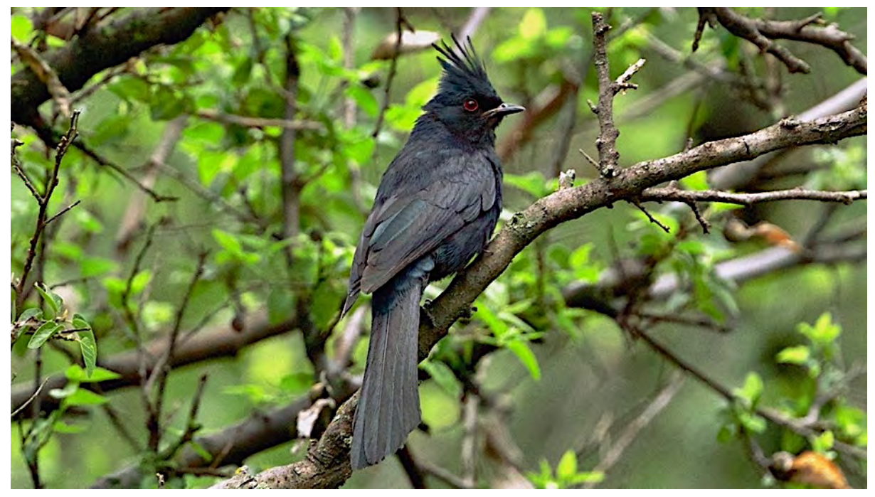
The unusual Phainopepla is the only silky-flycatcher that ventures into the US. We'll watch for them in the Patagonia/ Sonoita Creek area.

In the nearby Nogales area we'll search a few water areas in the desert for Black-bellied Whistling-Duck, Tropical Kingbird, Varied Bunting, migrants, and Mexican vagrants. A few other canyons in the area may yield a number of species typical of the oak-grassland hills of the area, including Rock Wren, Eastern Bluebird, Rufous-crowned and Lark sparrows, and Lesser Goldfinch.