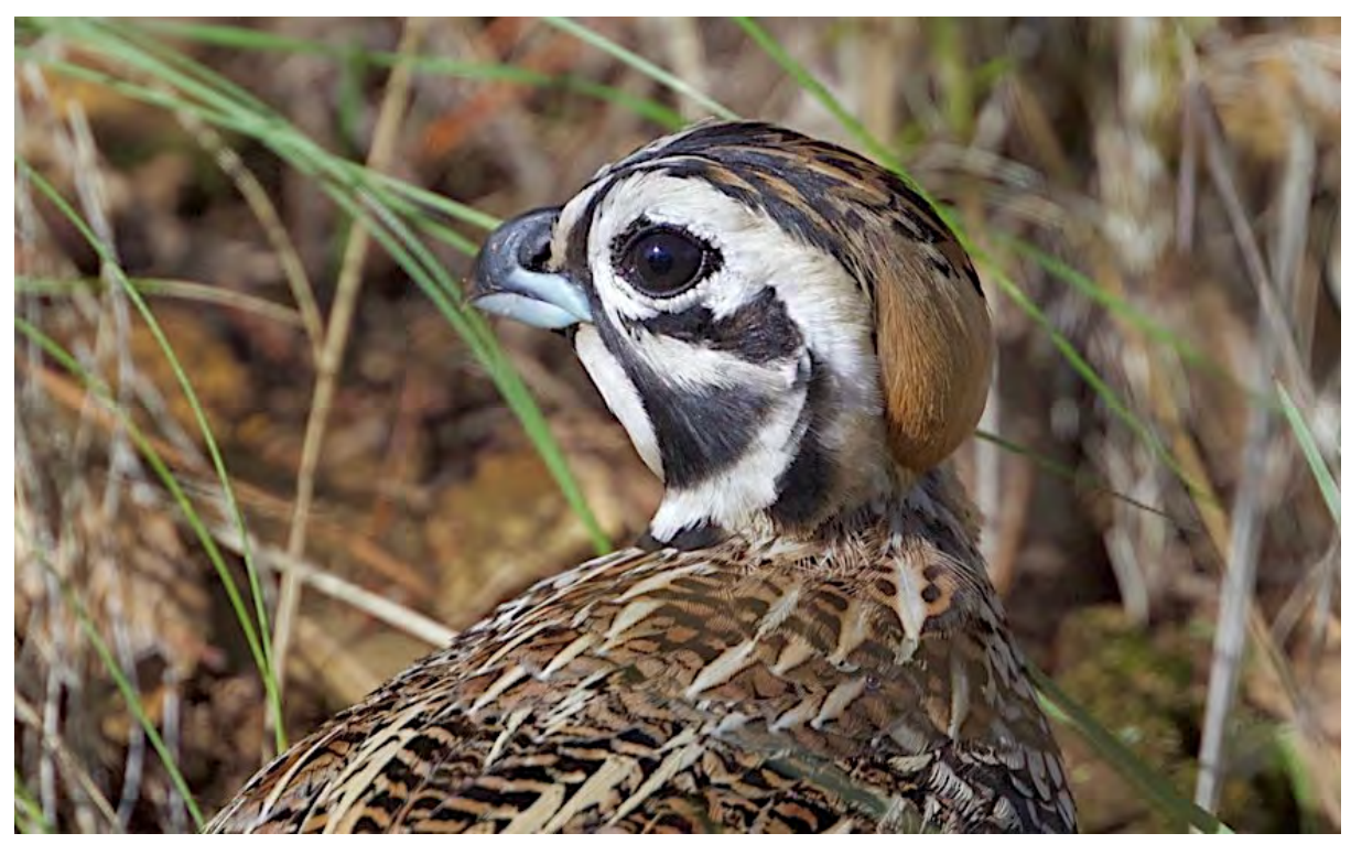
One of the most wanted birds for many visitors to Arizona is the cryptic Montezuma Quail. We'll spend time in the Chiricahuas and near California Gulch, where we'll watch for these lovely small quail.

Day 10. Tue. Departure for home. You may sleep in this morning if you wish. Please take the motel courtesy van to the airport at your convenience.