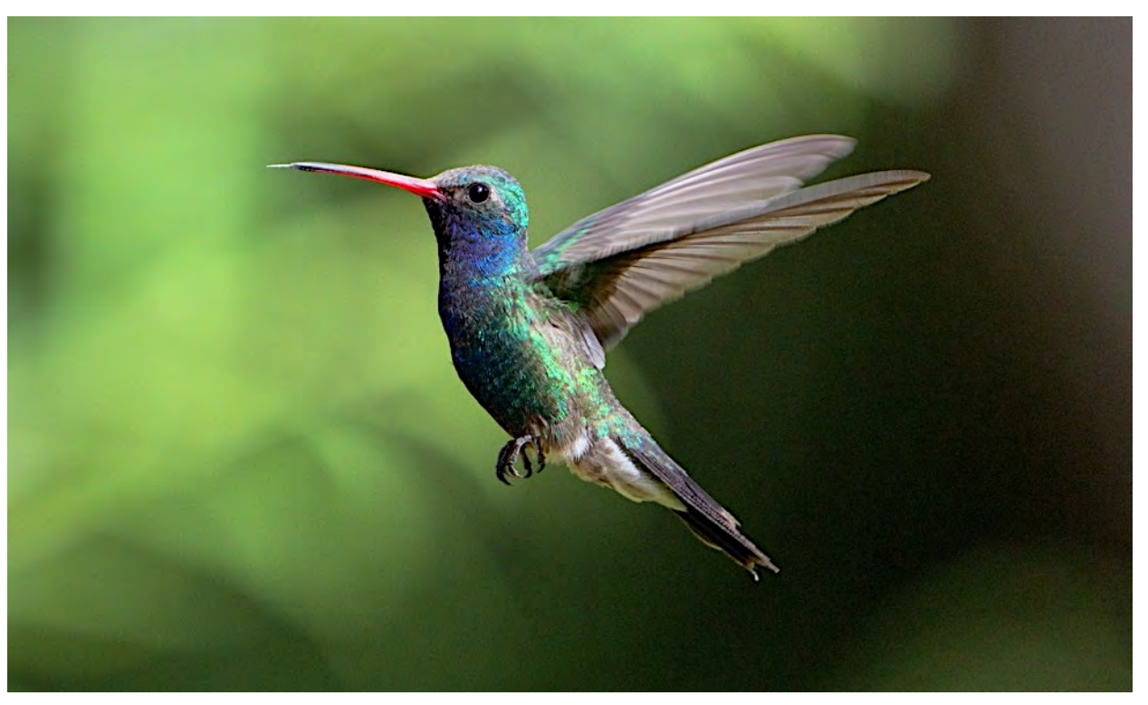
The spectacular Broad-billed Hummingbird is just one of a dozen or more hummingbird species we might find on this tour.

Our route forms a loop beginning and ending in Tucson with stops in Willcox, the Chiricahua, Huachuca, and Santa Rita mountains, the Patagonia/Sonoita Creek area, Nogales, the Pajarito and Atascosa mountains, and California Gulch. Scenery is spectacular, one-night stands are few, and the itinerary is arranged so as to maximize our chances for the local specialties as well as any vagrants that might appear.