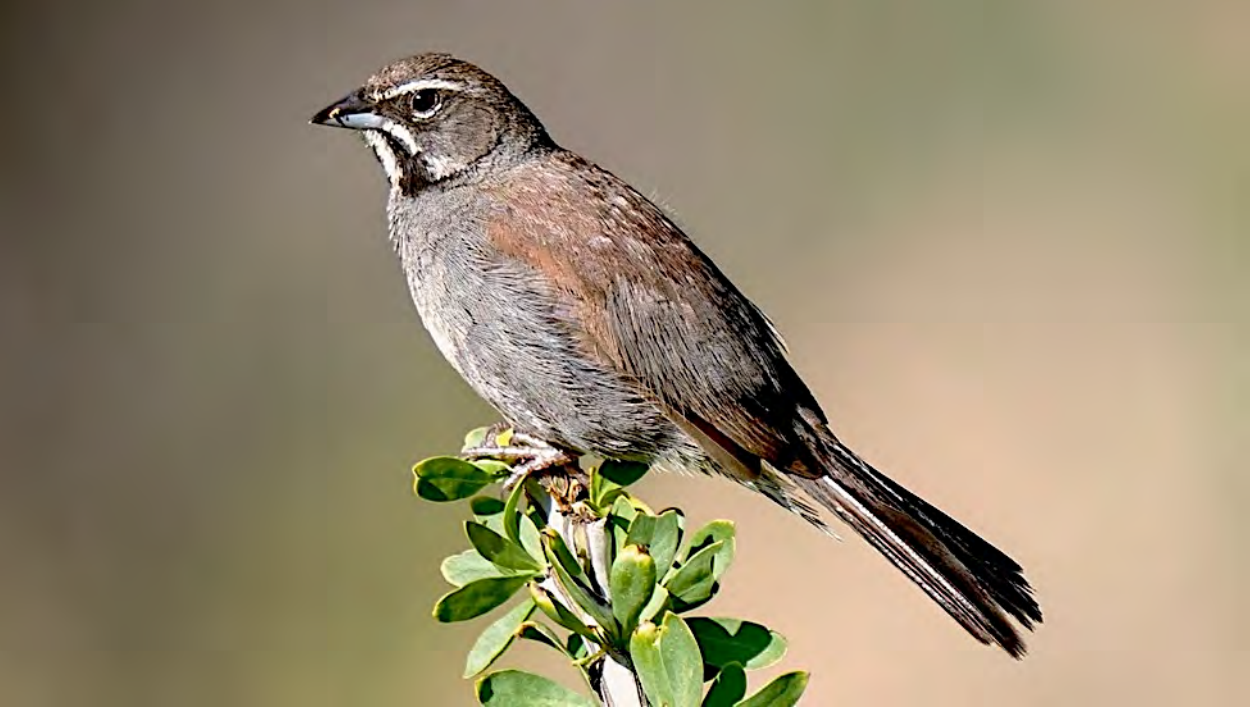
The Five-striped Sparrow is a Mexican species that just enters the US in far southern Arizona. These attractive but secretive birds breed during the summer rainy season, and we'll make an effort to find them while we are in the area.

Tour I: July 21-30, 2024 Tour II: July 27-August 5, 2024