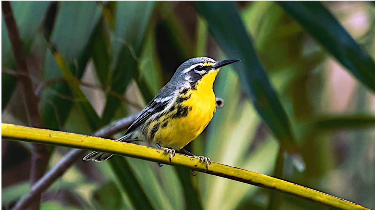
The Bahama Warbler is one of four endemics we'll seek, as well as a number of other interesting birds limited primarily to the Caribbean.

We include here information for those interested in the 2024 Field Guides Bahamas tour: