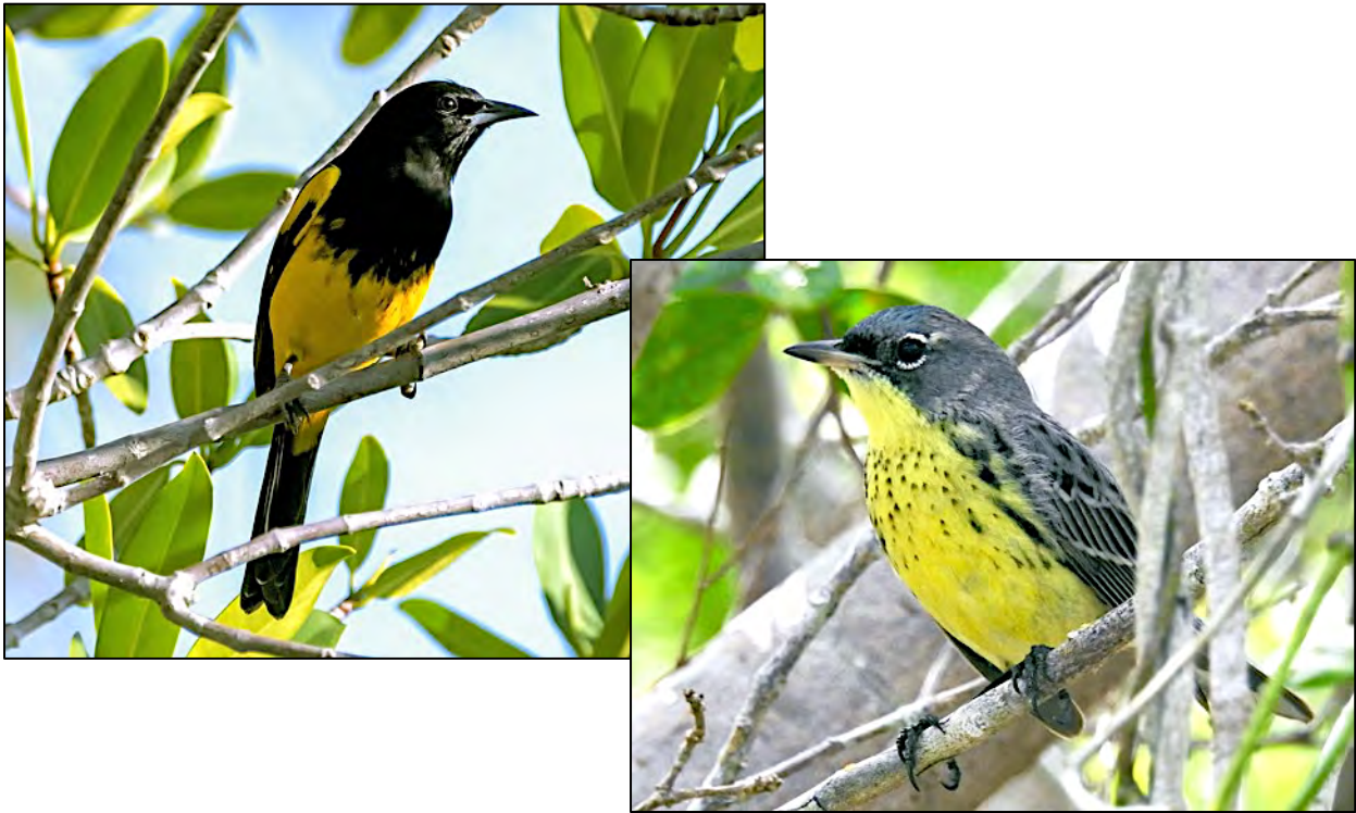
The Bahama Oriole, left, is an endemic of the Bahamas, and is found only on Andros Island. The Kirtland's Warbler, right, winters on Eleuthera. We'll look for both of these rare birds on our visit.