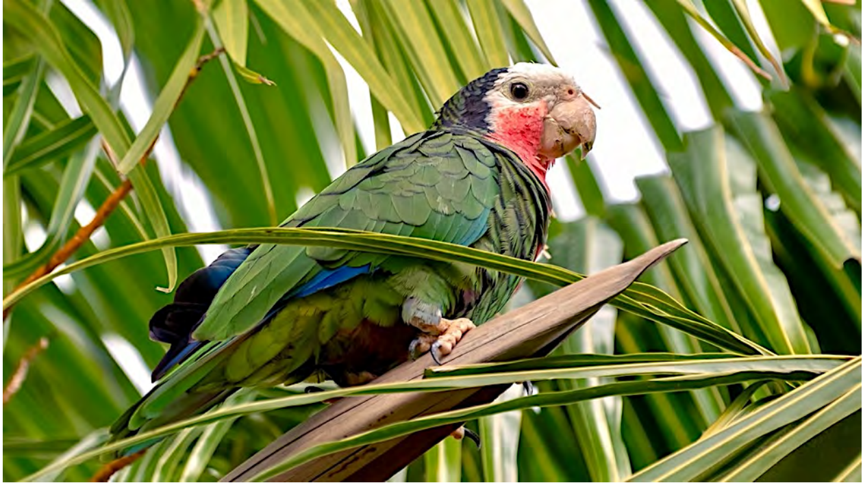
The Cuban Parrot is sometimes called the Rose-throated Parrot, for good reason! These beautiful birds are found on Abaco and Great Inagua in the Bahamas.

If island endemics, cracked conch, and Kalik beer all sound like a good time (they are), then join us in the Bahamas.