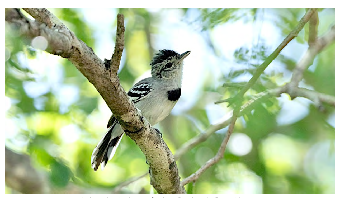
In the restinga habitat near Conde, we'll seek out the Pectoral Antwren.

Day 4, Sat, 31 Jan. Conde mangroves. This very full day will find us exploring an extensive area of old-growth mangroves on Bahia's northern coast. We'll use small boats to access narrow channels in the mangroves watching carefully for Little Wood-Rail, Mangrove Rail, Rufous Crab-Hawk (rarely seen anywhere in Brazil!), Straight-billed Woodcreeper (endemic coastal subspecies bahiae ), Campo Troupial, and Bicolored Conebill. A recent discovery here is the existence of a small, perhaps relictual population of Pyrrhura parakeets obviously related to the rare Gray-breasted Parakeet, until now thought to be endemic to the Serra de Baturite of northern Ceara state. Plumages of the two populations are at least slightly different, and their genetic makeups are currently under study. Although very few people have seen these birds, we will hope to find at least one small flock this morning. We will also make a foray into the restinga , where we could be fortunate enough to come up with Pectoral Antwren. Night in Conde.