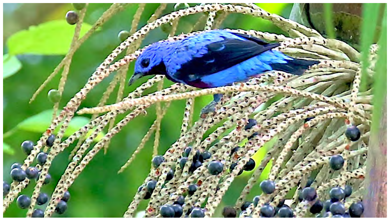
The Banded Cotinga is found in a few scattered locations of Atlantic forest in eastern Brazil. We'll look for this rare bird at Porto Seguro.

We include here information for those interested in the 2026 Field Guides Bahia Birding Bonanza tour: