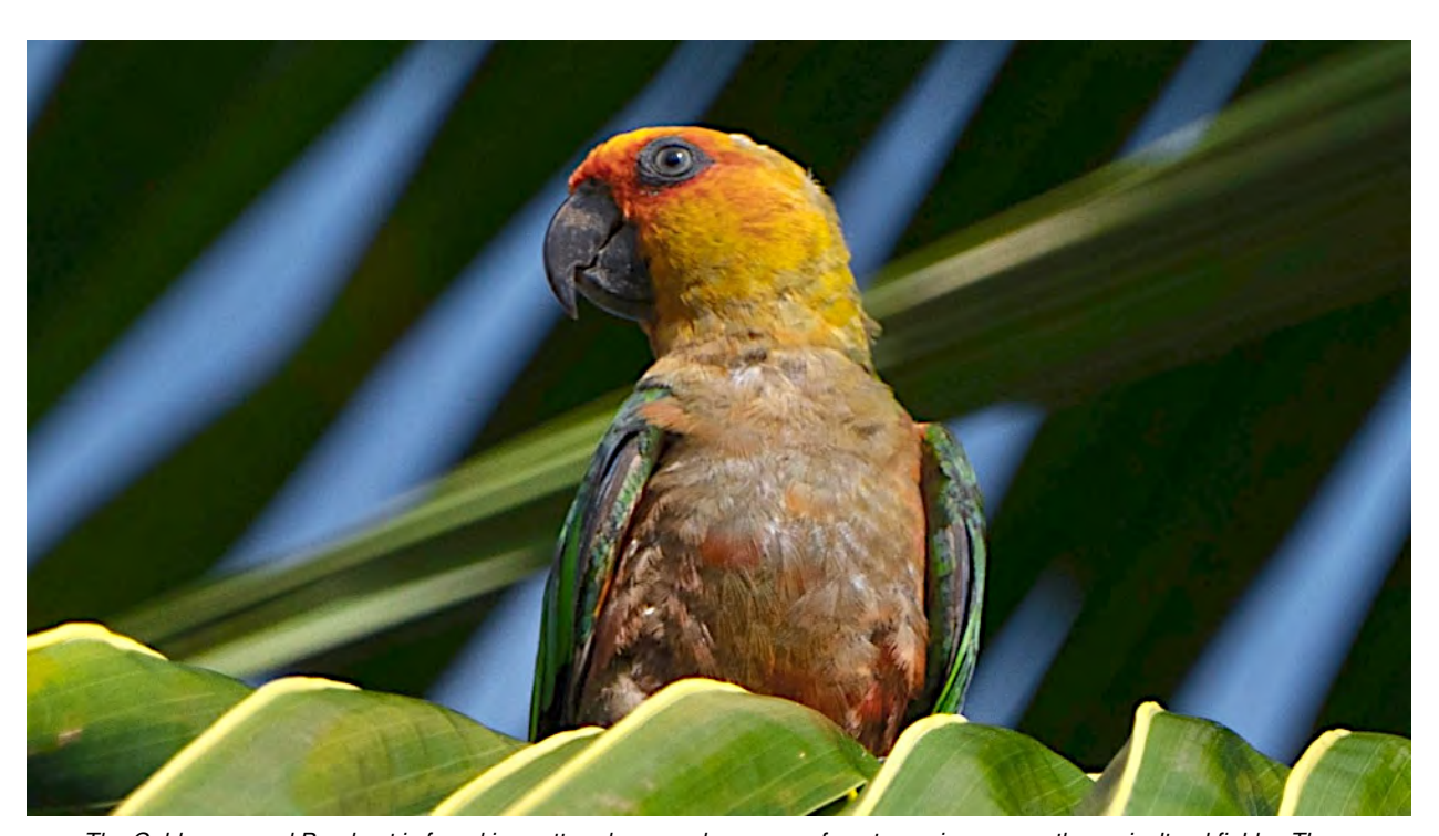
The Golden-capped Parakeet is found in scattered areas where some forest remains among the agricultural fields. These small parrots seem to be able to hang on as long as some good forest patches persist.

We should roll into the little town of Itacaré, on the coast at the mouth of the Rio de Contas, around dusk. Night in Itacaré.