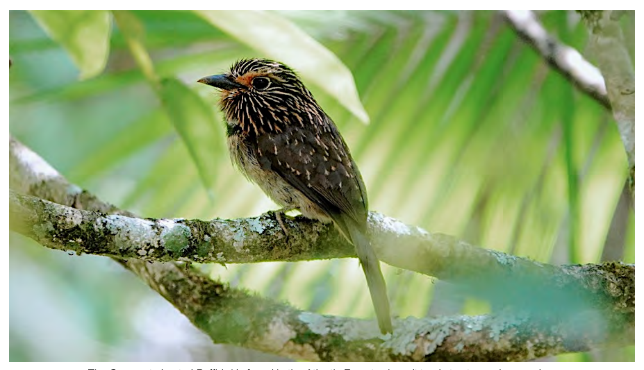
The Crescent-chested Puffbird is found in the Atlantic Forest, where it tends to stay on low perches.

After this invigorating morning in the mata-de-cipo , we will bird an open, rock shield that is studded with flowering cacti that attract a host of hummers, usually including Swallow-tailed Hummingbird, Sapphire-spangled Emerald, the gorgeous Ruby Topaz, and sometimes even Amethyst-throated Woodstar and Stripe-breasted Starthroat. Depending on the weather and our hour of arrival, we will either check into the hotel, or perhaps head straight to another excellent birding venue in tall, humid forest about 11 kilometers east of town. This area is usually very birdy, even during afternoon hours, but there is one celebrity that will have us waiting until dusk: Giant Snipe: we will have the thrilling experience of seeing this amazing creature, the largest snipe in the world, practically at our feet!