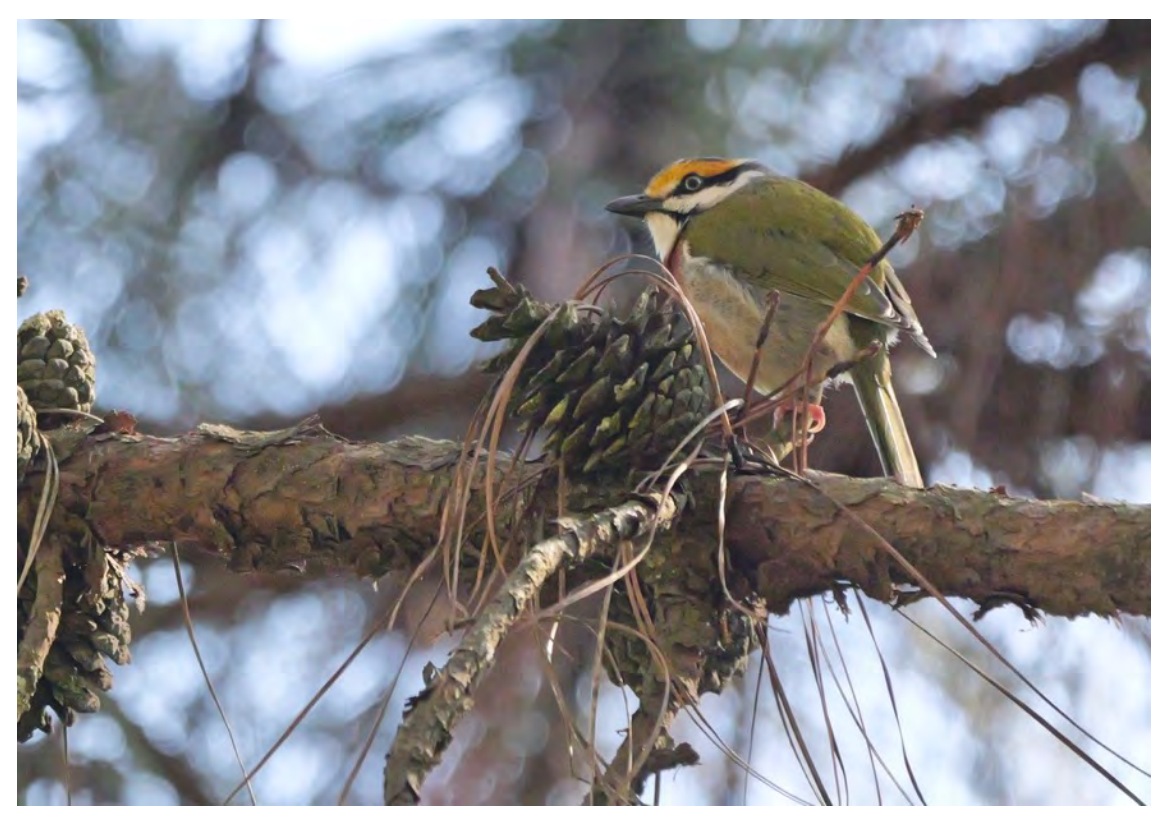
Chestnut-sided Shrike-Vireo is one of those must-see specialties of Central Mexico.

Days 3-4 Tue-Wed, 18-19 Feb. Birding around Morelos. These two days we'll be birding the state of Morelos in the vicinity of Tepoztlan and Cuernavaca. We'll explore the low elevation tropical deciduous forests in hopes of finding Banded Quail, Lesser Roadrunner, Lesser Ground-Cuckoo, Banded Wren, Pileated Flycatcher, Black-chested Sparrow, Rusty-crowned Ground-Sparrow and West Mexican Chachalaca. We'll see the spectacular ruins of Xochicalco, then stop at a waterfall in the middle of Cuernavaca to watch several hundred White-naped Swifts fly in to roost. In the oak forests around Tepoztlan we'll look for Chestnut-sided Shrike-Vireo, Golden-browed Warbler, Trans-Volcanic Jay and a number of resident and migratory hummingbirds. Nights in Tepoztlan.