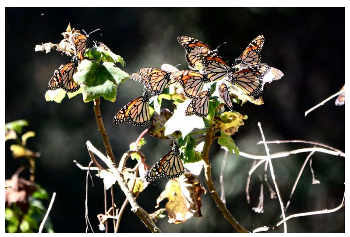
Wintering Monarch butterflies cluster by the millions in a few patches of montane forest in central Mexico.

At the same time of year, Gray Whales migrate from Arctic waters to the warm lagoons off the coast of Baja. They make the longest migration of any mammal on Earth, a distance of 11,000 miles. February is the best time of year to see mothers and calves wintering in these coastal lagoons. As if that weren't enough, Whale Sharks, the largest fish in the world (average adult length is 32 feet), also congregate off the coast of Baja in February. These gentle plankton-feeders can be seen perusing the waters near the port city of La Paz (in the state of Baja California Sur), where you can even swim alongside them, weather permitting of course.