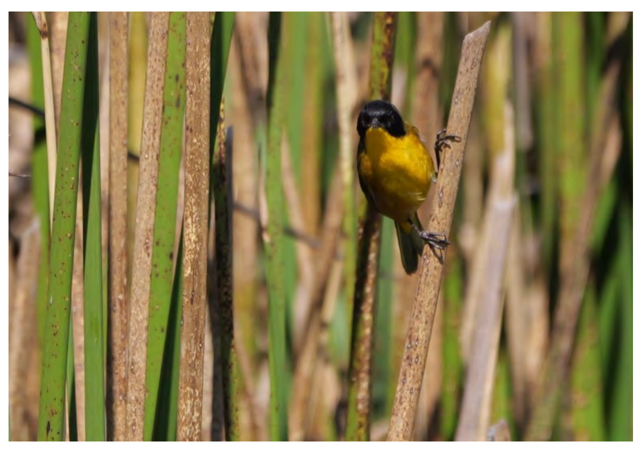
We have the opportunity to see three endemic yellowthroats on this tour. This Black-polled Yellowthroat is restricted to the high elevation marshes west of Mexico City.

Day 10, Tue, 25 Feb. Whale shark excursion (weather permitting), drive to Buenavista. If the weather is nice (fingers crossed!), we'll do a boat trip from La Paz in search of Whale Sharks, and if you're so inclined, you can even snorkel with them! Snorkel gear and wetsuits will be provided. We'll return to La Paz for lunch and make our way to Santiago, stopping at an Oasis where San Lucas Robins have been known to occur during the winter. Night in Buenavista. NOTE: The trips to see Whale Sharks are done with permits from the local government. Permits are only given out to boat operators if there are a sufficient number of Whale Sharks in the bay. If there are too few individuals, then we will not be able to view them. If this is the case, we will enjoy some additional birding around La Paz that morning.