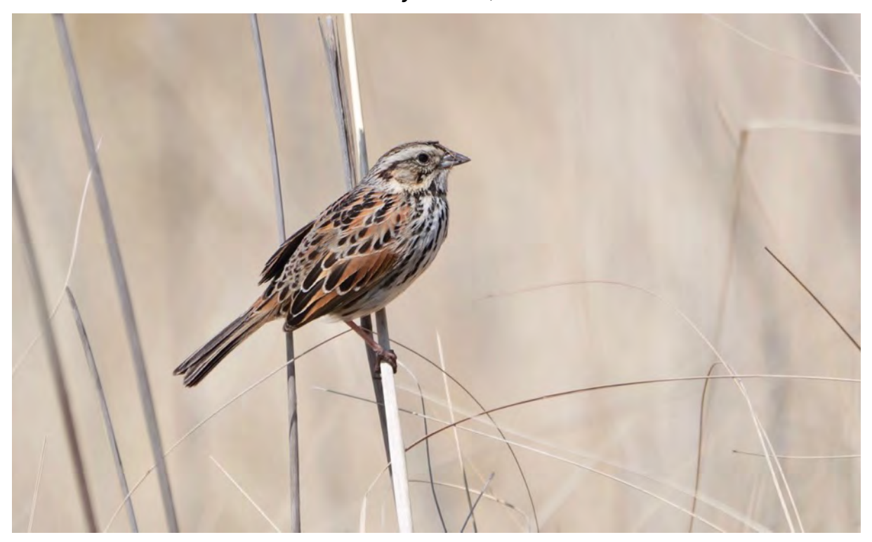
Central Mexico has a number of range-restricted endemics, including the Sierra Madre Sparrow.

We include here information for those interested in the 2025 Field Guides Central Mexico and Baja: Birds, Butterflies & Whales tour: