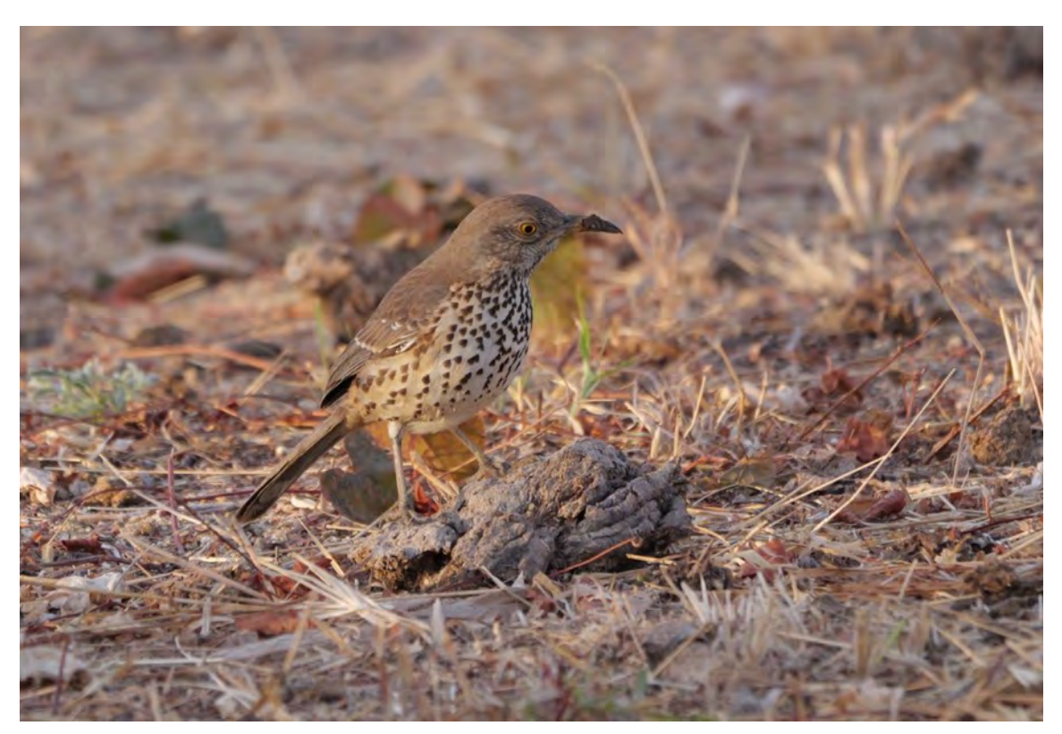
The Gray Thrasher is endemic to Baja California, where it is common in the desert scrub.

Baja California Sur – Baja California is a long peninsula located in Northwest Mexico that crosses the Tropic of Cancer. It is composed of two Mexican states, Baja California and Baja California Sur, and bordered to the west by the Pacific Ocean and to the east by the Gulf of California (also known as the Sea of Cortez). Our time will be spent in the southernmost state of Baja California Sur, with the capital city of La Paz, and the tourist area of Buenavista. The region is quite dry, with long sandy beaches at sea-level, a few coastal marshes, dry forest scrub a bit higher and ranging into the foothills where taller deciduous forest occurs. Pine-oak forest is found even higher, but gradually changes into pine forest at the highest elevations in the Sierra de la Laguna around 2,100 meters (6,900 feet). All the peninsular endemic bird species can be found in Baja California Sur, but it's also an excellent place for migrants and vagrants.