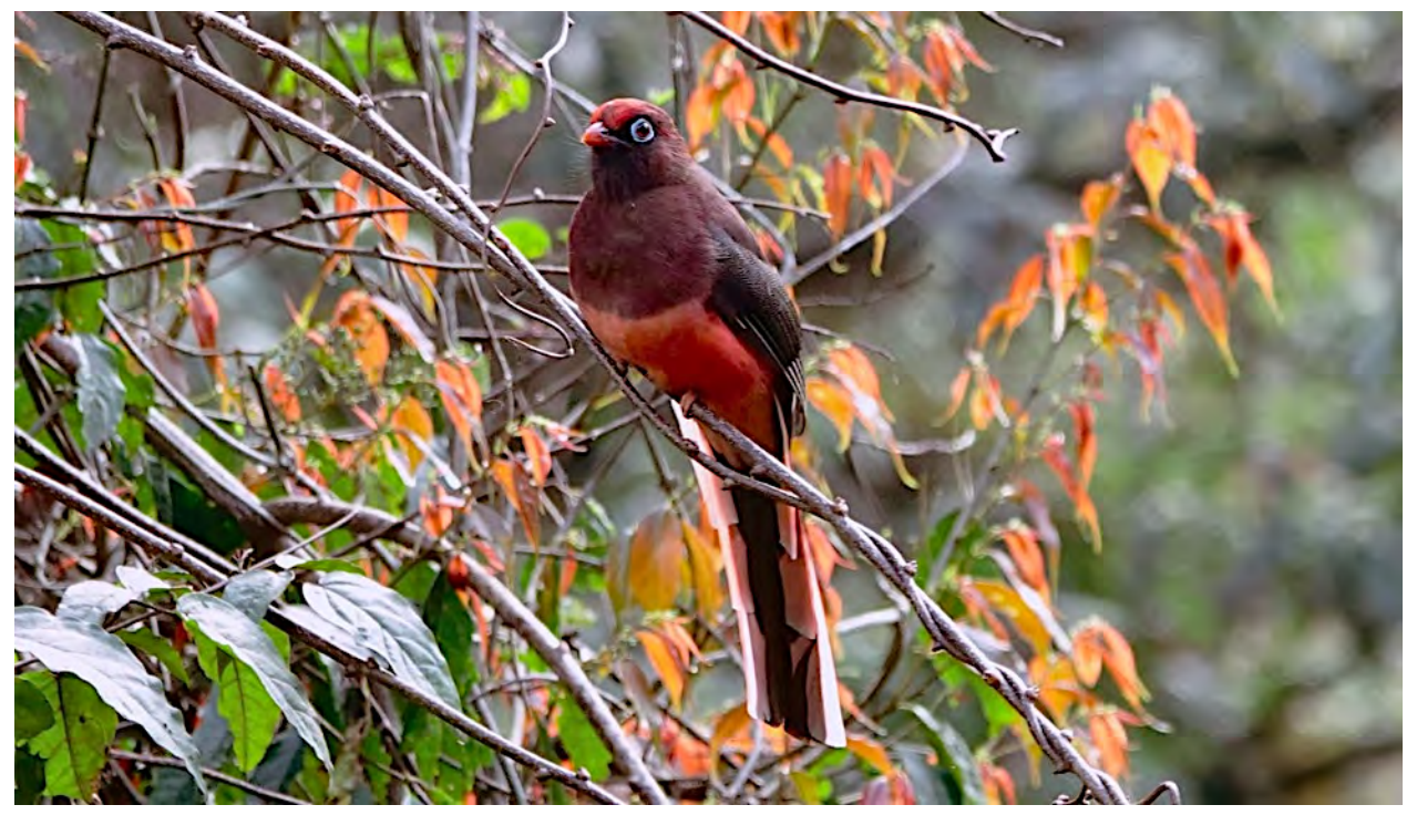
Ward's Trogon is considered to be secure in Bhutan, although it is classified as vulnerable throughout its range.

ITINERARY BHUTAN March 30-April 18, 2024