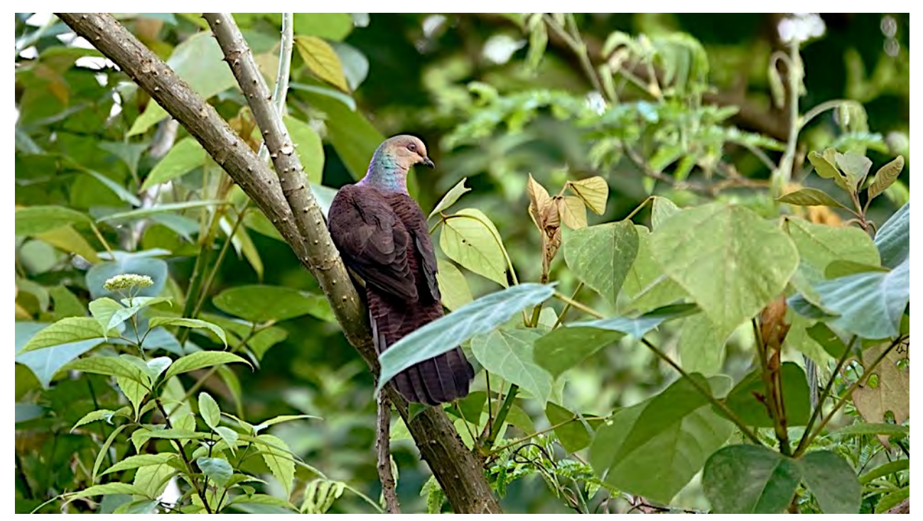
The Barred Cuckoo-Dove is found in the subtropical forests of the Himalayas and parts of SE Asia. Although they are rather uncommon, we will likely find them near our camp in Tingtibi.

Day 11, Tue, 9 Apr. Manas Ridge above Nganglam. We will spend much of the day birding the patches of forest on top of the ridge just west of town, searching for a number of special birds. The forest on the upper ridge offers an interesting mix of foothill species and birds that are typical of middle elevations but occur at around record-low elevations here. We will especially hope to find the rare and local (and very skulking) Rufous-vented Laughingthrush (with which we did connect in 2018). Other special species include Rufous-backed and Long-tailed sibias, Collared Treepie, and Gray-headed Parrotbill, and we have a good chance for more widespread tropical birds like Long-tailed Broadbill, Blue-bearded Bee-eater, Red-headed Trogon, and Sultan Tit. The area is good for a variety of doves, including Barred Cuckoo-Dove, Mountain Imperial-Pigeon, Wedge-tailed Pigeon, and Asian Emerald Dove. We certainly expect that there are more discoveries to be made here. (Rufous-throated Fulvetta? Spot-throated Babbler?) Night at our hotel in Nganglam.