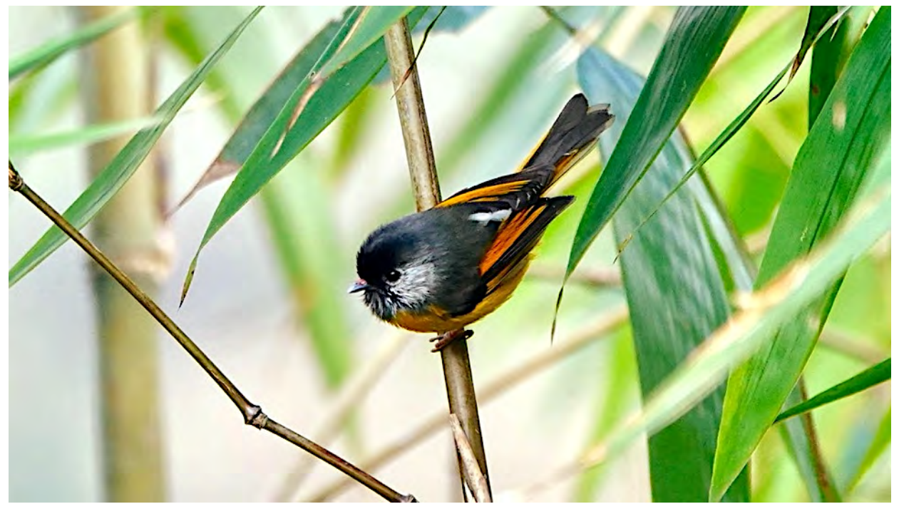
The tiny and colorful Golden-breasted Fulvetta is a bamboo specialist that we'll seek in Phrumsengla National Park; we'll hope to find it in the midst of a flock of other small species.

This area is particularly well known for several rich stretches of bamboo, and we will hope to encounter the jackpot of the right mixed flock, the one with White-breasted and Black-throated parrotbills and Coral-billed Scimitar-babbler, and we will also hope for other bamboo birds such as Golden-breasted Fulvetta and the skulking Broad-billed Warbler. On the subject of skulkers, this slope is rich in wren-babblers, laughingthrushes, and tesias, along with a shortwing or two, White-gorgeted Flycatcher, and Yellow-throated Fulvetta. With near-endemic specialties like Black-headed Shrike-Babbler to search for, too, and our lucky discovery of Beautiful Nuthatch in 2015 (seen again in 2018 and 2019), we will have a pretty busy stay. Nights at Trogon Villa, Yongkola.