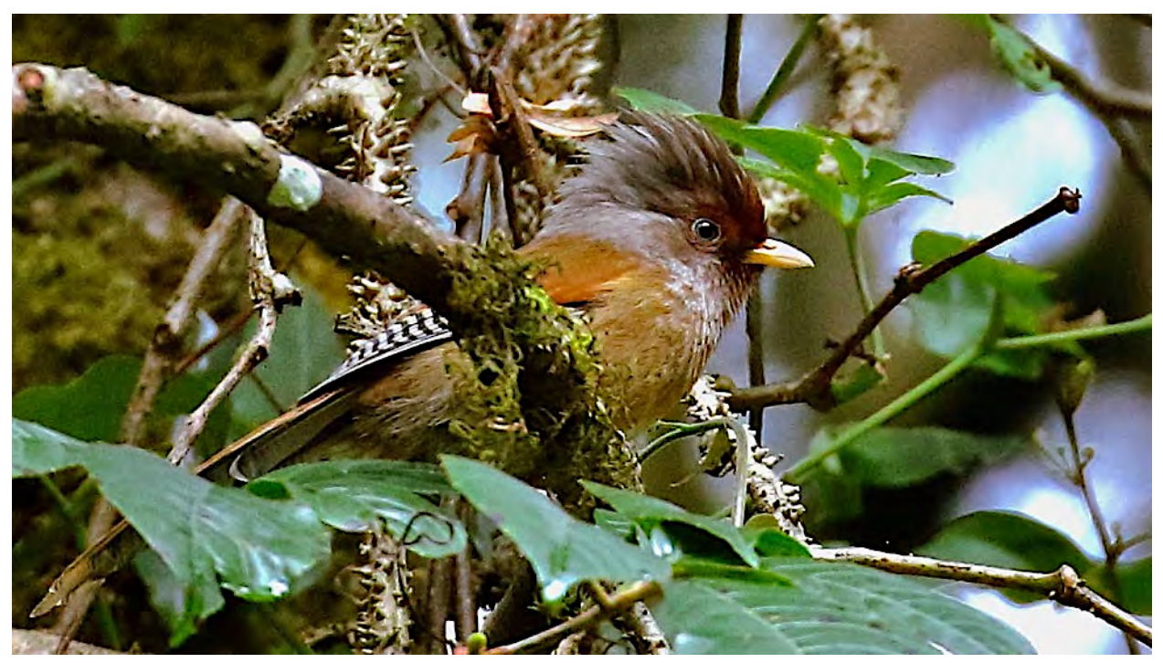
We'll look for the Rusty-fronted Barwing and other low and mid-elevation species when we stay at Tingtibi.

Day 7, Fri, 5 Apr. Darachu to Gelephu. We'll start our birding right around camp at the pass. The wet forest extends downhill to the east, and we will spend the first half of the day birding a very short distance downslope, enjoying first views of many new birds of middle and lower elevations. In the afternoon, we'll continue a couple of hours to Gelephu, a small commercial hub on the Indian border. We'll stay in a simple "local business traveler" hotel (and that means A.C. and hot water). In the late afternoon, we'll make a short foray to open and disturbed habitats (and a sewage plant), looking at any lowland "Indian" species we can find. Night in Gelephu.