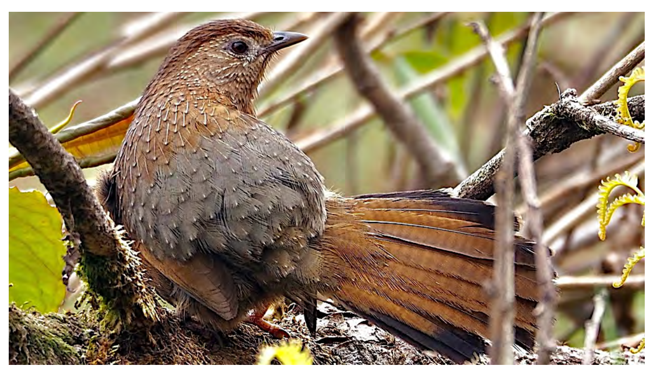
The Bhutan Laughingthrush is a near-endemic. We've seen these attractive birds at several locations on the tour.