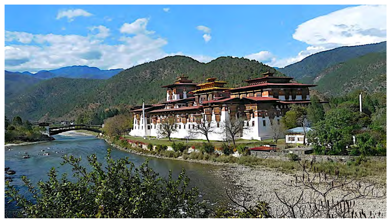
One of our cultural highlights will be a visit to the immense Punakha Dzong, situated at the confluence of the Mo Chhu and Po Chhu rivers. We'll also spend time birding here, looking for waterbirds.

Day 6, Thu, 4 Apr. Punakha to Darachu, via the valley of the Puna Tsang Chhu. This morning is atypical—we'll start with an emphasis on waterbirds! We'll bird along the Po Chhu, perhaps the Mo Chhu, and the Puna Tsang Chhu where we'll have chances of finding the rare Pallas' Fish-Eagle and one of the world's largest and rarest herons, the White-