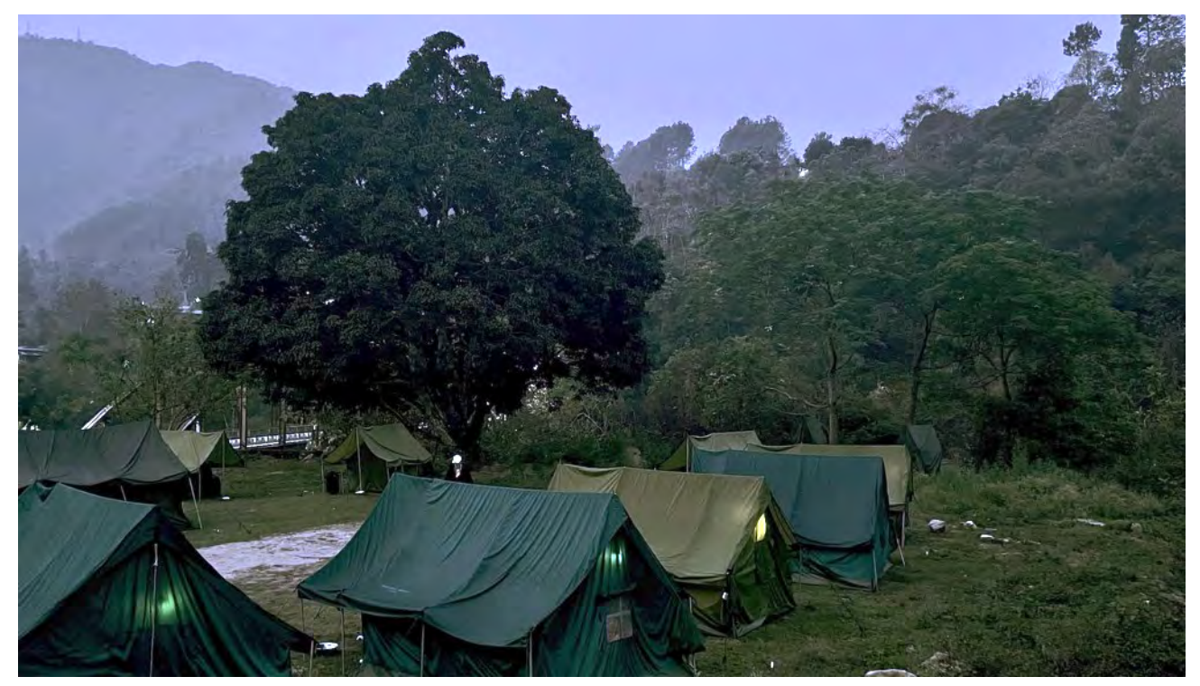
We'll spend a few nights in camps, where we'll wake to the sounds of prayer flags fluttering and birds singing.