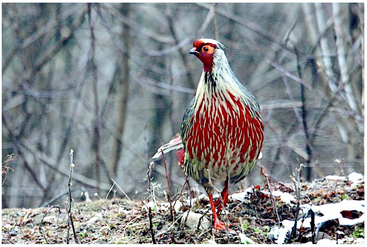
The Blood Pheasant is one of the special birds we'll seek in the high elevations.

After lunch, a lovely drive will bring us to the fourth Bumthang Valley and the scenic community of Ura. Keep your eyes open for flocks of Snow Pigeons and the newly-split Black-rumped Magpie (formerly a subspecies of Eurasian Magpie) in the fallow fields of the intervening valleys. The next high pass, Ura (or Sheltang or Sheytang) La, can be good for pheasants, which doesn't mean pheasants are easy here, but we will keep our eyes open because we were rewarded in several recent years. Late afternoon will find us reaching the second Bumthang Valley and the town of Jakar. Night at Gongkhar Lodge in the Bumthang Valley.