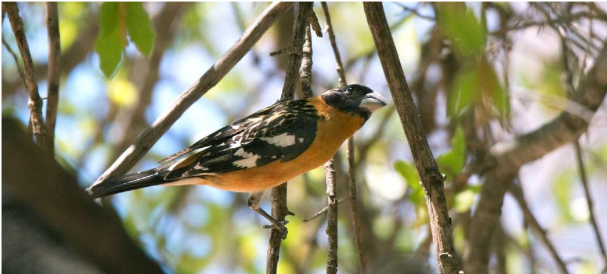
The Davis Mountains are another special habitat, where we’ll watch for birds like the Black-headed Grosbeak, which is near its eastern limit in the US in this part of Texas.

During our time in Big Bend, we’ll bird desert arroyos and ocotillo-clad slopes for such special breeders as Lucifer Hummingbird, Crissal Thrasher, Black-tailed Gnatcatcher, Gray Vireo, Pyrrhuloxia, Black-throated Sparrow, and Varied Bunting as well as for western migrants. Western Tanagers, Western Wood-Pewees, and MacGillivray’s Warblers turn up just about anywhere at this time of year. We’ll watch for nesting Vermilion Flycatchers, Summer Tanagers, Yellow-breasted Chats, Verdins, Bell’s Vireos, Lucy’s Warblers (rare and local in Big Bend), and Painted Buntings in the river floodplain. We’ll hike in the upper Chisos in search of the Colima Warbler (approaching its peak period of territorial singing now) as well as Zone-tailed Hawk, Blue-throated Mountain-gem, Broad-tailed Hummingbird, White-throated Swift, Violet-green Swallow, Cordilleran Flycatcher (sporadic), Hutton’s Vireo (the distinct interior form), migrant Townsend’s and Hermit (scarce) warblers, and Dusky Flycatchers.