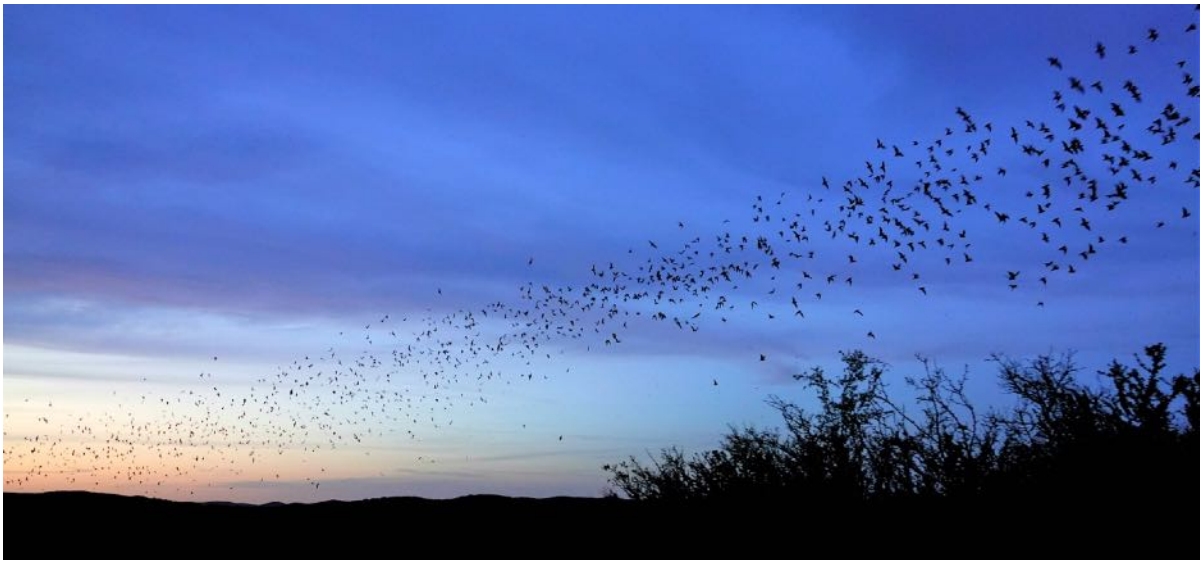
We'll visit the Rio Frio Cavern, near Concan, where we'll view the emergence of thousands of Mexican Free-tailed Bats. On occasion, we've seen raptors catching their dinners here as well!

Rio Frio Cavern —By evening we'll visit a nearby limestone sinkhole for one of the greatest mammalian spectacles in North America: the crepuscular emergence of countless thousands of Brazilian Free-tailed Bats. The bats in this nursery cave represent the fourth largest gathering of warm-blooded animals in the world (the first three being at other bat caves on the Plateau)! From the extensive Rio Frio Cavern system (twenty-three miles long, according to locals) the bats pour forth in seemingly endless streams, eventually breaking into discrete clouds that drift off toward the east (absent rain, this is a very reliable phenomenon). Radar-tracked individuals have been traced as far south as Corpus Christi on the central coast—a distance of 200 miles! So abundant are these freetails that during the summer peak population (estimated at ten million), the bats of the Frio Cave alone are said to consume more than a million pounds of insects in just four nights! Recent radar studies have revealed that they fly as high as 10,000 feet in pursuit of some of North America's most destructive agricultural pests, especially corn earworms (Noctuid moths), which swarm high above Texas by the billions at this time of year. The spectacle attracts other viewers as well: Red-tailed Hawks make repeated dramatic passes through the diverging streams, usually emerging with talons full. In the midst of the hectic emergence of so many bats, nesting Cave Swallows spiral to roost in the cave.