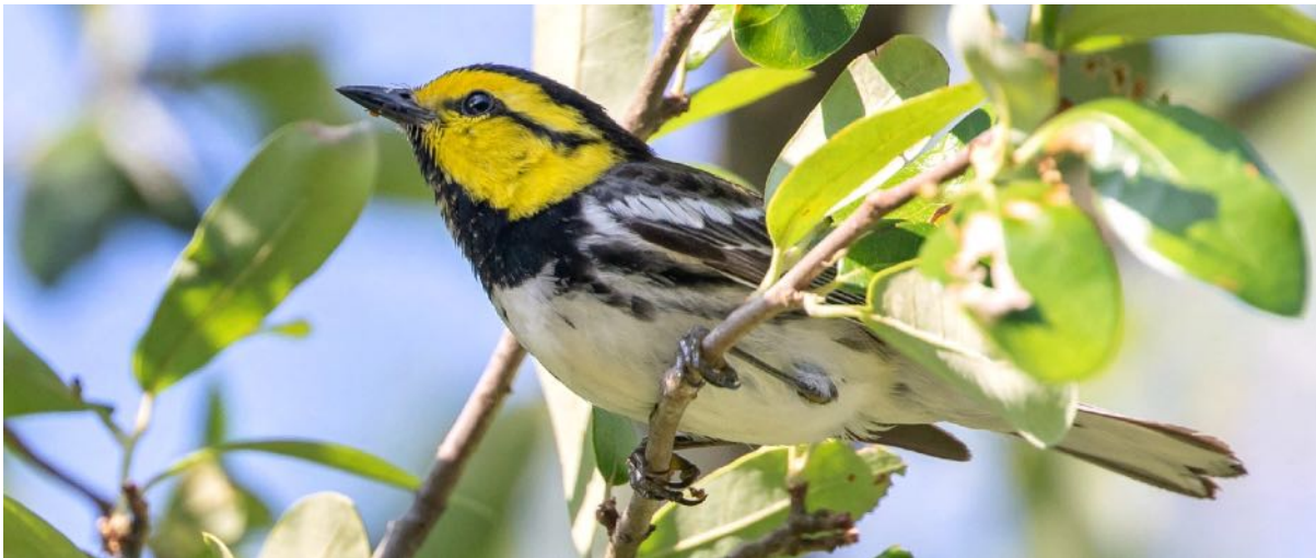
The specialty bird of Texas is the Golden-cheeked Warbler. This rare warbler breeds only in the Texas Hill Country, and we'll visit one of the best places to find this gem.

Utopia —We'll sample the various Hill Country habitats near the southern edge of the Edwards Plateau, where it is bordered to the south by the South Texas Brush Country. Our lodging in Utopia—on the Sabinal River—is in a beautiful setting. The avifauna of the immediate area includes species common on the Plateau, such as Bewick's and Canyon wrens, Black-crested Titmouse, Carolina Chickadee, Eastern Bluebird, and Field and Rufous-crowned sparrows. The mesic woodland along the river contributes species of eastern affinities, such as Yellow-throated Vireo, Yellow-throated Warbler, and Acadian Flycatcher, which approach the western limit of their ranges here. It's an interesting mixture of breeders. A river walk can produce some of these species as well as Green Kingfisher (depending on the water level), Black Phoebe, and the striking black-backed population of the Lesser Goldfinch.