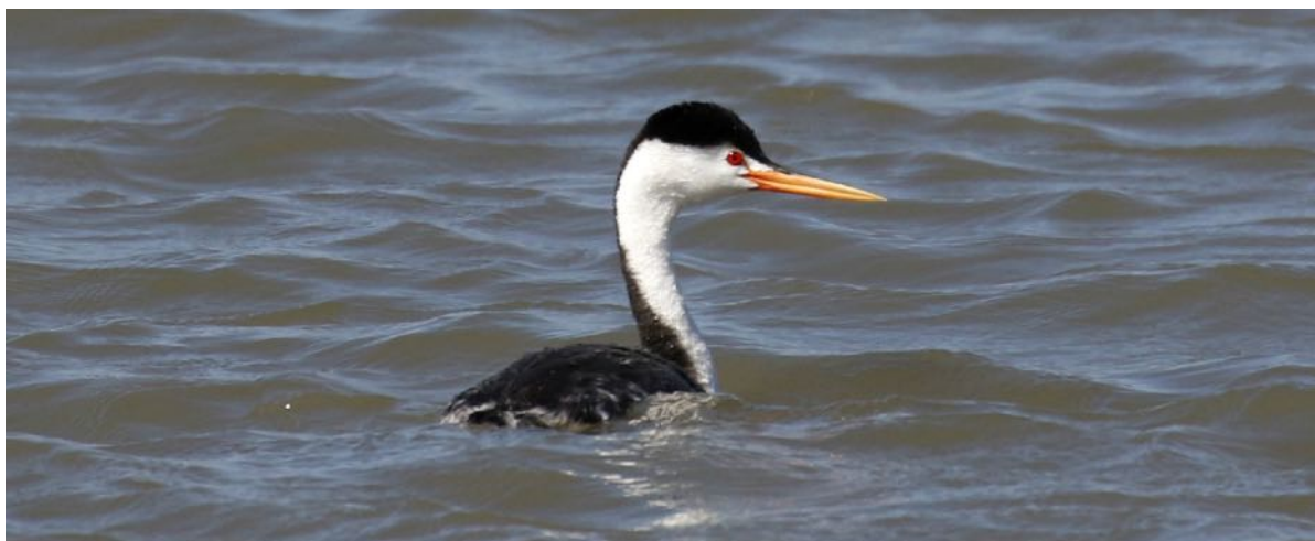
Lake Balmorhea is one of the largest bodies of water in West Texas, and it attracts some very interesting birds. Large grebes, such as this Clark's Grebe, are likely here, as are other water birds.

Lake Balmorhea —This 500-acre impoundment of Sandía Creek is used primarily for irrigation, fishing, and boating. However, such a large body of water in the arid trans-Pecos does not go unnoticed by waterbirds and shorebirds, especially during migration. The lake itself is good for western ducks and grebes, and the shallow mudflats and marshes support a nice variety of shorebirds and waders. Possibilities of interest include Eared, Western, and Clark's grebes, Cinnamon Teal, Mexican Duck (recently split, formerly considered a subspecies of Mallard), White-faced Ibis, the occasional rail, Baird's Sandpiper, Wilson's Phalarope, Snowy Plover (low-water years), Black-necked Stilt, American Avocet, Black Tern, Franklin's Gull, and Yellow-headed Blackbird. It's also a good place for a real surprise. In 2017 it was the shocking discovery of an Aplomado Falcon!