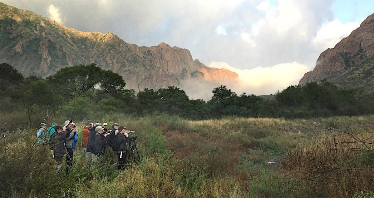
Big Bend is one of the most scenic places in the U.S. Hikes might be long and strenuous, so it's important to be in fairly good shape, but it's worth getting tired to see this wonderful and birdy place!

In addition to four days in Big Bend, we’ll visit the volcanic Davis Mountains in search of Montezuma Quail. This tour begins and ends in San Antonio, and we spend our last three nights in a beautiful section of the Edwards Plateau where we’ll seek the special Hill Country breeders, the endangered Golden-cheeked Warbler and Black-capped Vireo, and watch the emergence of bats from the world’s fourth-largest bat cave.