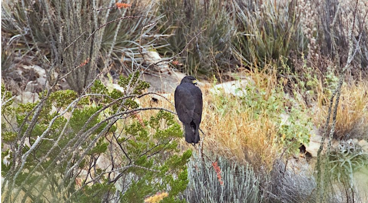
Zone-tailed Hawk is a bird of arid lands. These raptors are uncommon and can be overlooked in flight, as they appear much like Turkey Vultures. We'll be on the lookout for them, and perhaps we'll be lucky and spot one perched, as happened on our 2019 tour!

We include here information for those interested in the 2021 Field Guides Texas's Big Bend & Hill Country tour: