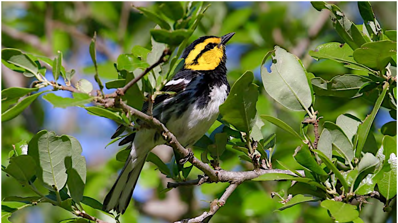
The brilliant Golden-cheeked Warbler is another endangered species we'll seek when we visit the Hill Country region. These gorgeous warblers nest only in Texas, and rely on a specialized oak-juniper habitat, making them vulnerable to habitat destruction.

Lake Balmorhea —This 500-acre impoundment of Sandía Creek is used primarily for irrigation, fishing, and boating. However, such a large body of water in the arid trans-Pecos does not go unnoticed by waterbirds and shorebirds, especially during migration. The lake itself is good for western ducks and grebes, and the shallow mudflats and marshes support a nice variety of shorebirds and waders. Possibilities of interest include Eared, Western, and Clark's grebes, Cinnamon Teal, Mexican Duck (recently split, formerly considered a subspecies of Mallard), White-faced Ibis, the occasional rail, Baird's Sandpiper, Wilson's Phalarope, Snowy Plover (low-water years), Black-necked Stilt, American Avocet, Black Tern, Franklin's Gull, and Yellow-headed Blackbird. It's also a good place for a real surprise. In 2017 it was the shocking discovery of an Aplomado Falcon!