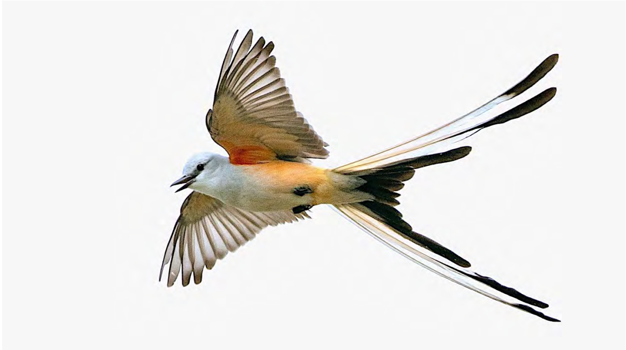
The elegant Scissor-tailed Flycatcher is a common sight across much of Texas in the spring and summer. We'll have ample opportunities to study these beauties on the tour.

cave represent the fourth largest gathering of warm-blooded animals in the world (the first three being at other bat caves on the Plateau)! From the extensive Rio Frio Cavern system (twenty-three miles long, according to locals) the bats pour forth in seemingly endless streams, eventually breaking into discrete clouds that drift off toward the east (absent rain, this is a very reliable phenomenon). Radar-tracked individuals have been traced as far south as Corpus Christi on the central coast—a distance of 200 miles! So abundant are these freetails that during the summer peak population (estimated at ten million), the bats of the Frio Cave alone are said to consume more than a million pounds of insects in just four nights! Recent radar studies have revealed that they fly as high as 10,000 feet in pursuit of some of North America's most destructive agricultural pests, especially corn earworms (Noctuid moths), which swarm high above Texas by the billions at this time of year. The spectacle attracts other viewers as well: Red-tailed Hawks make repeated dramatic passes through the diverging streams, usually emerging with talons full. In the midst of the hectic emergence of so many bats, nesting Cave Swallows spiral to roost in the cave.