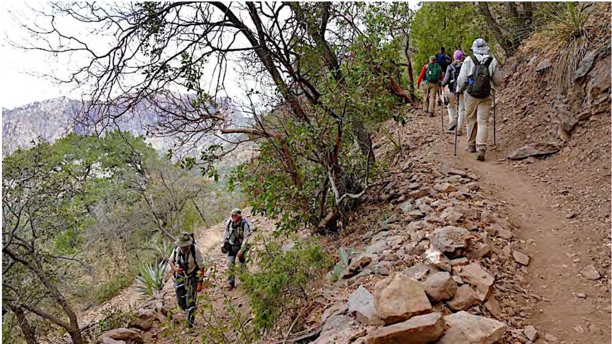
The Pinnacles Trail in Big Bend National Park takes us into the higher elevations, where we'll find specialties such as the Colima Warbler.

Days 3-6, Mon-Thu, 24-27 Apr. Big Bend National Park. Our general procedure at Big Bend will be to start early with a picnic breakfast, return for lunch and a short break during the heat of the day, and go birding again in the afternoon before returning to our comfortable base lodge. Exactly which sites we visit and the order in which we bird them will depend on the group and the weather. It is often quite possible to see the Colima Warbler without hiking all the way to Boot Spring. The Boot Canyon trail is steep but good and affords magnificent vistas of the entire Basin, the desert below, and of towering Emory Peak; it's a rigorous all-day hike (requiring comfortable hiking boots or shoes and two canteens full of water), and there will be an opportunity to do it for those who wish. Those who would prefer to seek the Colima in the easiest manner possible and return to the lodge to relax can easily do so. The easiest Colimas are often about two-and-a-half or three hours up the trail (1200 feet in elevation gain).