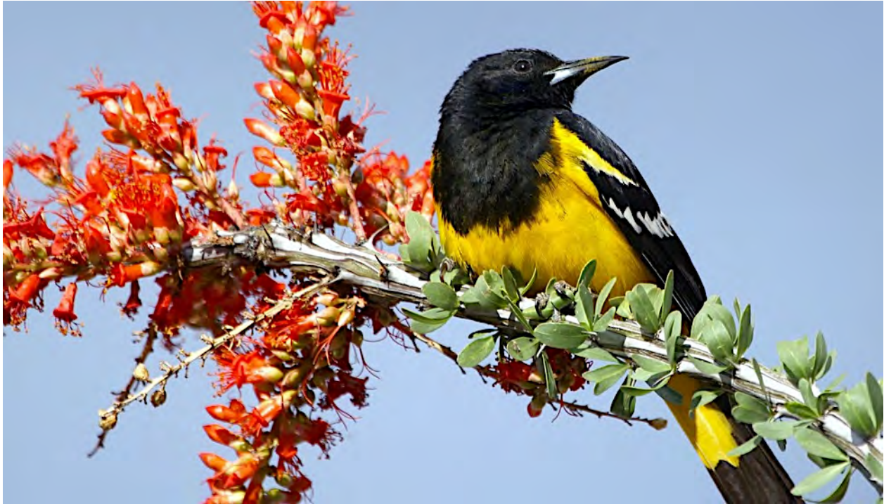
Scott's Oriole is near its eastern limit in the US in this part of Texas.

breasted Chats, Verdins, Bell's Vireos, Lucy's Warblers (rare and local in Big Bend), and Painted Buntings in the river floodplain. We'll hike in the upper Chisos in search of the Colima Warbler (approaching its peak period of territorial singing now) as well as Zone-tailed Hawk, Blue-throated Mountain-gem, Broad-tailed Hummingbird, White-throated Swift, Violet-green Swallow, Cordilleran Flycatcher (sporadic), Hutton's Vireo (the distinct interior form), migrant Townsend's and Hermit (scarce) warblers, and Dusky Flycatchers.