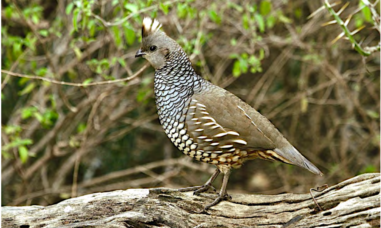
The Scaled Quail is an attractive resident of the brushlands of western Texas.

In addition to four days in Big Bend, we'll visit the volcanic Davis Mountains in search of Montezuma Quail. This tour begins and ends in San Antonio, and we spend our last three nights in a beautiful section of the Edwards Plateau where we'll seek the special Hill Country breeders, the endangered Golden-cheeked Warbler and Black-capped Vireo, and watch the emergence of bats from the world's fourth-largest bat cave.