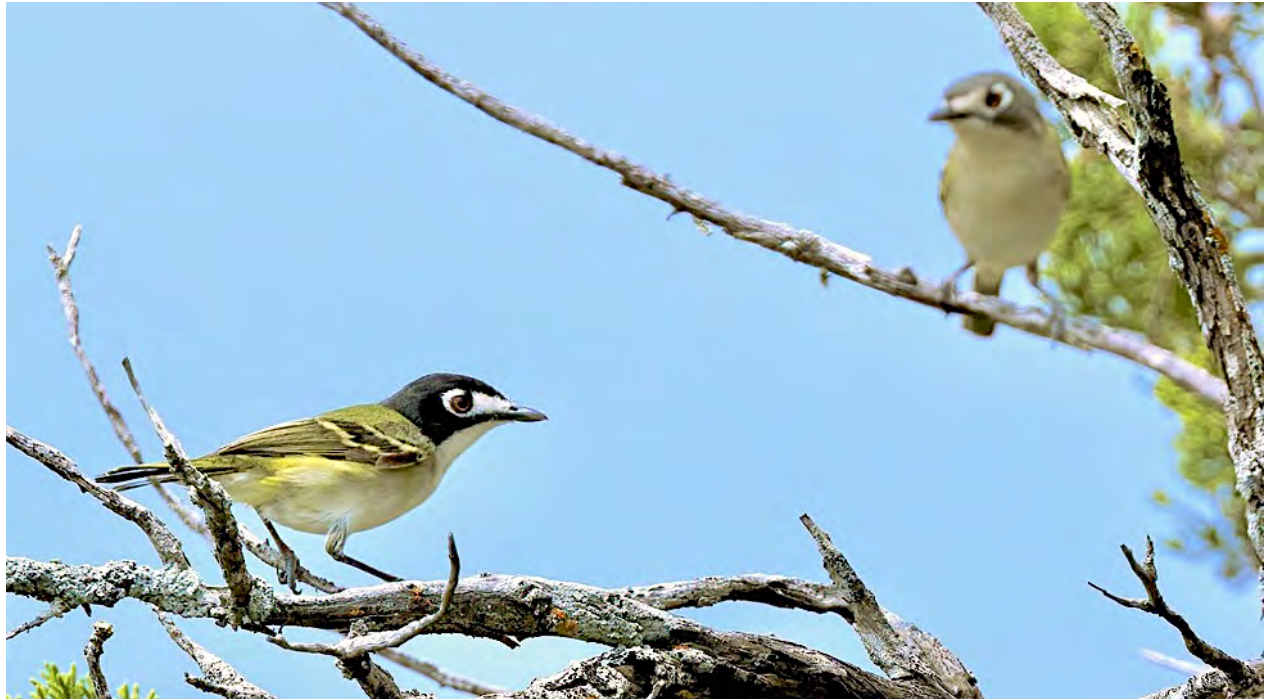
The Black-capped Vireo is an endangered species that breeds almost exclusively in Texas. We'll travel through some of the remaining habitat for this special bird and hope we can get some great views of these skulkers!

We include here information for those interested in the 2023 Field Guides Texas's Big Bend & Hill Country tour: