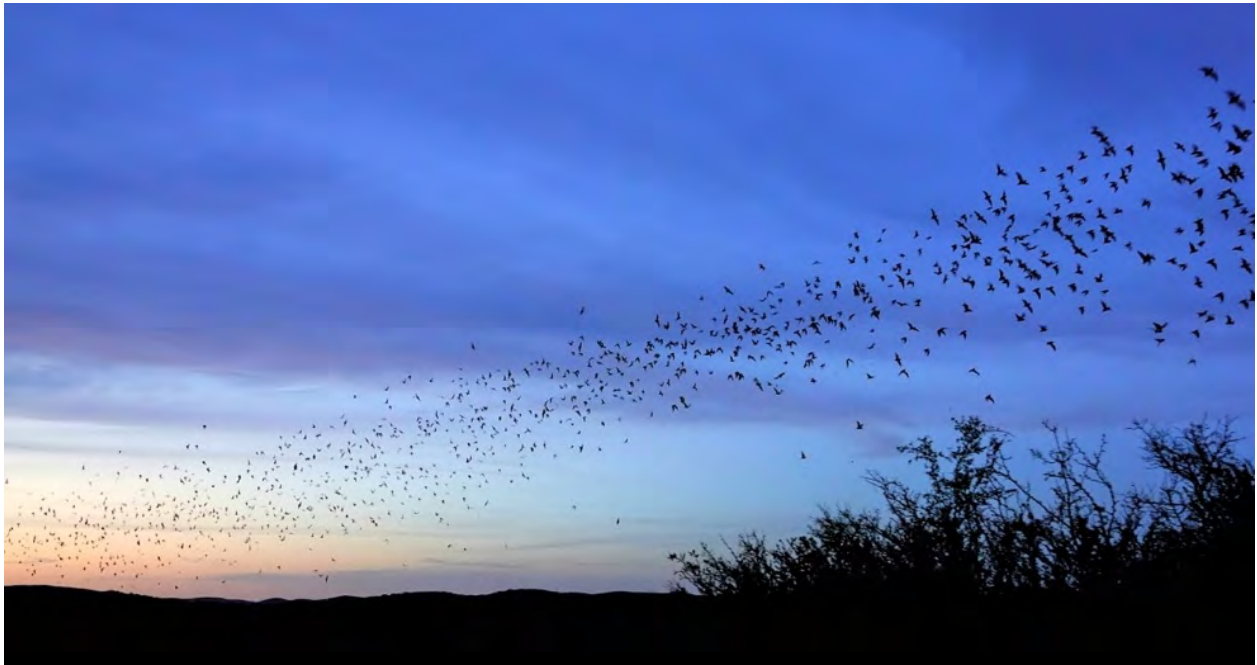
We'll visit the Rio Frio Cavern, near Concan, where at sunset we'll view the emergence of thousands of Mexican Free-tailed Bats. On occasion, we've seen raptors catching their dinners here as well!

Lost Maples State Natural Area —Named for its relict population of bigtooth maples ( Acer grandidentatum ), Lost Maples State Natural Area preserves 2200 acres of rugged Plateau habitats. In the wooded canyons of the bald cypress-lined Sabinal River, Golden-cheeks defend breeding territories while the furtive Black-cap vocalizes from clumps of shrubby oaks and sumacs on the drier slopes. Other breeders sharing these habitats include Wild Turkey, Black-chinned Hummingbird, Ladder-backed Woodpecker, Ash-throated Flycatcher, Vermilion Flycatcher and Yellow-breasted Chat (both in aerial song-display), Black-and-white Warbler, Yellow-throated Vireo, Painted and Indigo buntings, Blue Grosbeak, Lark, Field, and Rufous-crowned sparrows, and Hooded and Orchard orioles. The fields near the park are intermittently good for Western Kingbirds, Dickcissels, and Clay-colored, Grasshopper, and Cassin's sparrows.