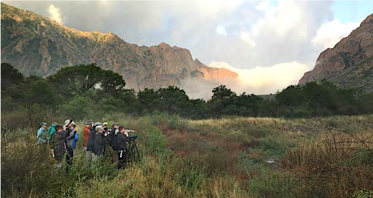
Big Bend is one of the most scenic places in the U.S. Hikes might be long and strenuous, so it's important to be in fairly good shape, but it's worth getting tired to see this wonderful and birdy place!