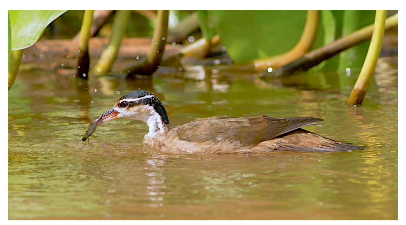
In the Rio Araguaia valley, we'll have the chance to see many different waterbirds, including the elusive Sungrebe.

Days 13-14, Thu-Fri, 22-23 May. Birding the Araguaia region. We'll roll across the landscapes, and travel the river on boat trips to look for a great variety of wildlife. A few other birds have even more restricted ranges in the Araguaia basin, including Bananal Antbird, Araguaia Spinetail ( Synallaxis simoni , sometimes still considered a subspecies of White-lored Spinetail), the handsome Crimson-fronted Cardinal, and an as-yet-undescribed species of Certhiaxis (Yellow-chinned/Red-and-white group) spinetail. Waterbirds are abundant in the region, including lots of Jabirus and other storks and herons, tens of thousands of whistling-ducks and other fowl, and even some locally breeding of Orinoco Geese, with a reasonable chance of seeing Pinnated Bittern and Azure Gallinule. Yellow-collared Macaws, Bare-faced Curassow, and Chestnut-bellied Guan are likely to be seen as well. Mammal encounters could include Giant Anteater, Brazilian Tapir, Maned Wolf, and Marsh Deer, as well as several smaller critters. We'll have early starts each day, then break for lunch and a siesta before again heading into the field late afternoon. There are good photographic opportunities everywhere in this area, including right around our hotel. We'll also want to do some night-driving for spotlighting Band-tailed Nighthawks and Scissor-tailed Nightjars, a variety of mammals, and perhaps some owls. Nights at Canguçu.