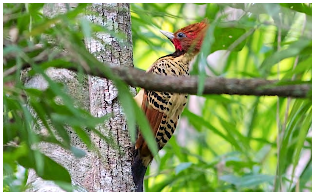
In addition to looking for the Blue-eyed Ground-Dove, we'll be watching for a number of other uncommon birds such as the beautiful Kaempfer's Woodpecker, a resident of bamboo forests in the state of Tocantins.

We include here information for those interested in the 2025 Field Guides Minas Gerais & Tocantins tour: