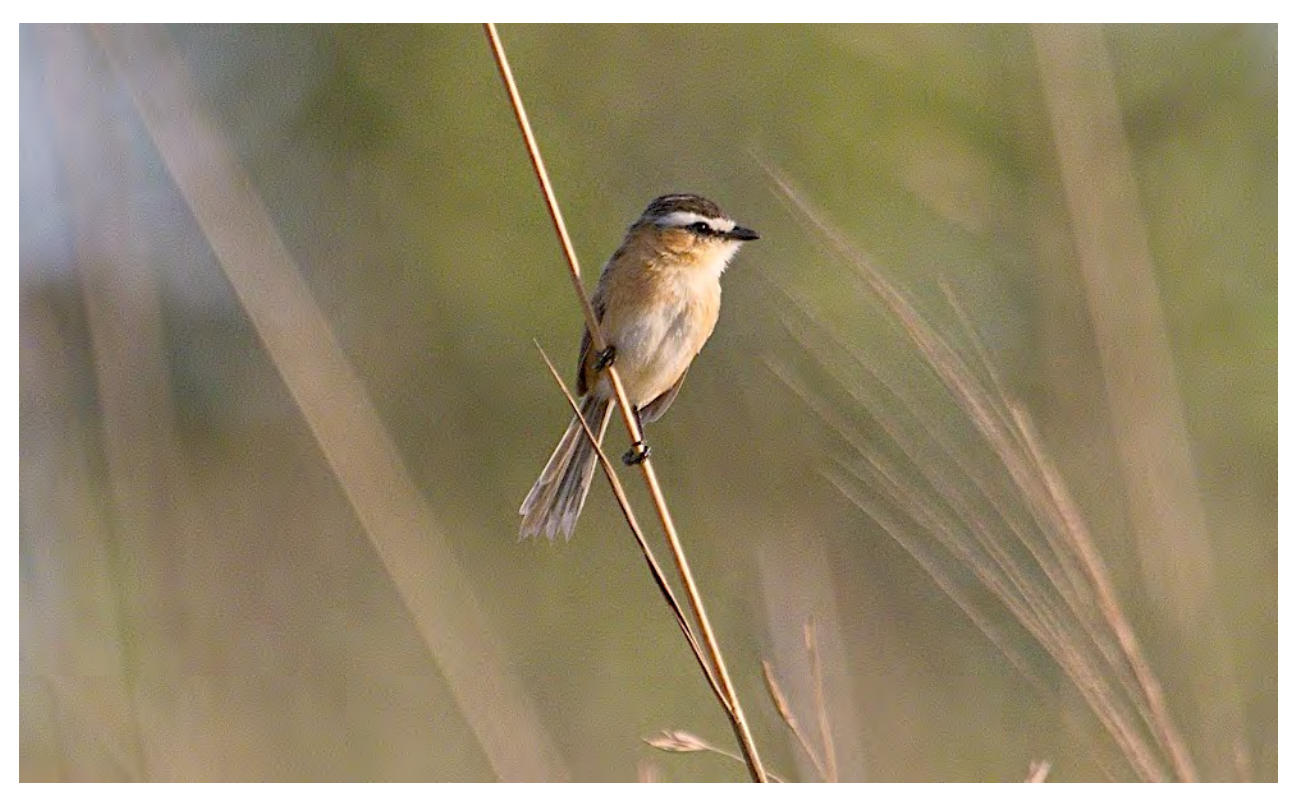
The Sharp-tailed Tyrant is found in the grasslands, a habitat that is threatened by encroaching agriculture. Some of this vanishing space is preserved in Chapada dos Veadeiros National Park, where we'll watch for this attractive little flycatcher and others.

Days 9-10, Sun-Mon, 18-19 May. Terra Ronca State Park; drive to Chapada dos Veadeiros. Terra Ronca State Park contains perhaps the most extensive system of caverns in all of South America. Its 57,000 hectares (about 142,000 acres) also protects a vast area of rare semideciduous forest as well as extensive, undisturbed cerrados dissected by crystalline rivers with some impressive waterfalls. The gorgeous but rarely seen Pfrimer's Parakeet occurs here, and will be the principal target of our visit to the park, and the area is very birdy, so this morning will be one to remember, for sure! After lunch, we'll make the drive to the little town of Alto do Paraiso, gateway to Chapada dos Veadeiros National Park. Nights in Alto do Paraiso.