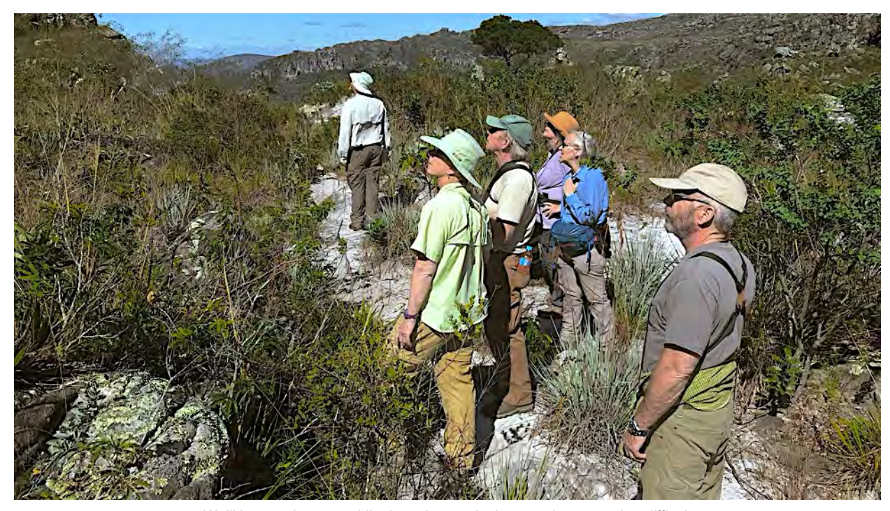
We'll have at least one hike in rocky terrain that may be somewhat difficult.

If you are uncertain about whether this tour is a good match for your abilities, please don't hesitate to contact our office; if they cannot directly answer your queries, they will put you in touch with the quide.