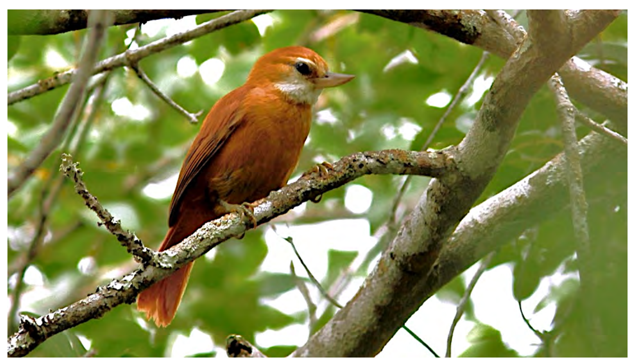
Another endemic, the Great Xenops, is found in the caatinga.