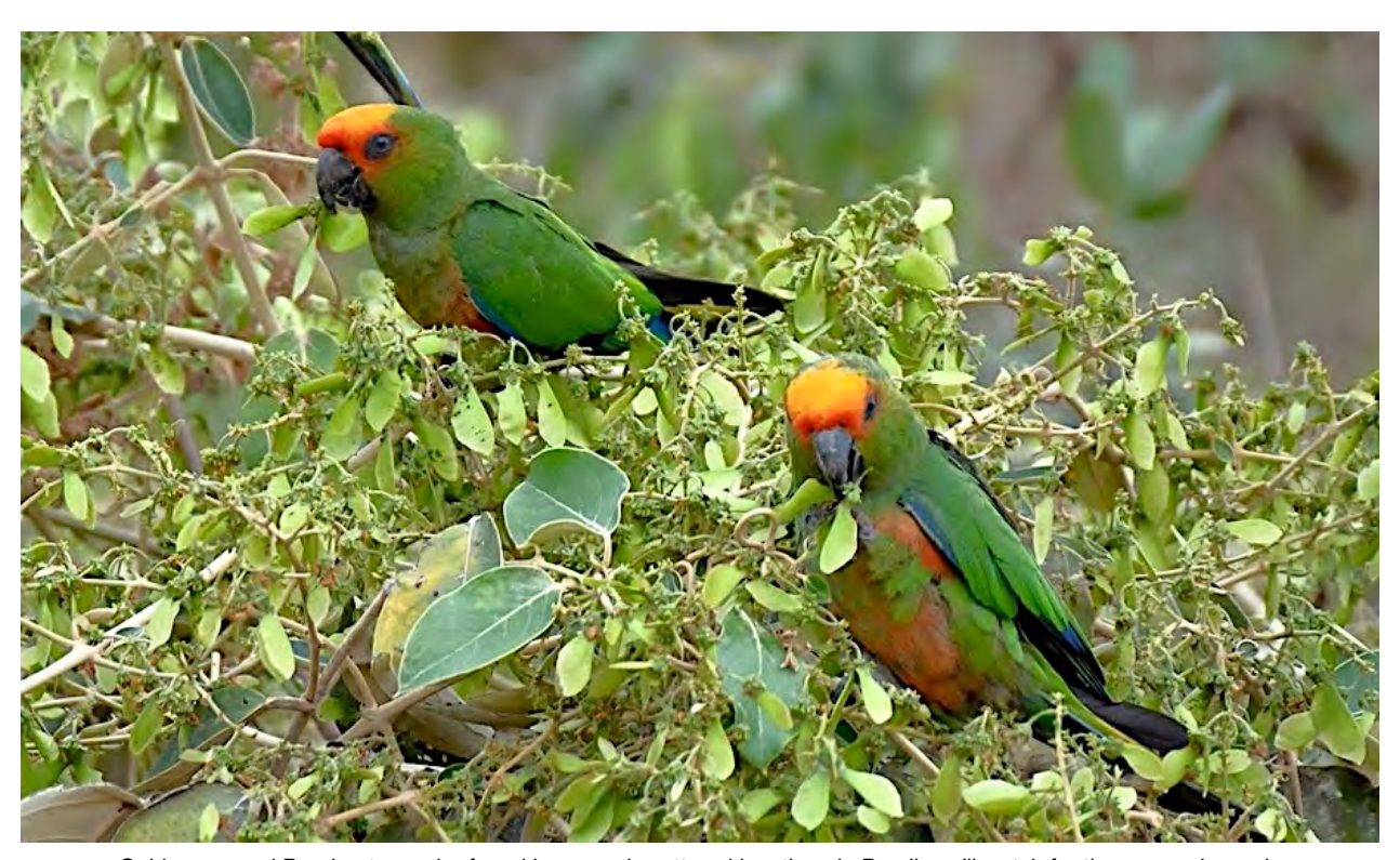
Golden-capped Parakeets can be found in several scattered locations in Brazil; we'll watch for them near Januaria.

Building on a star-studded first week, we'll head straight into a second one. The relatively small state of Tocantins, west of Minas Gerais, is Brazil's newest state, and one few tourists have visited. The dominant geographic feature there is the great Rio Araguaia, which marks a gateway to Amazonia. We'll settle in for a few days at a private, family-run fazenda (huge ranch) on the Araguaia that is peaceful, comfortable, and superbly birdy. Those of you who have birded the Pantanal will immediately be reminded of that wonderful place as we roll through the landscape in the back of elevated trucks and take boat trips on the river. Unlike the Pantanal, however, the Araguaia harbors some endemic species of birds, including Bananal Antbird, Crimson-fronted Cardinal, and a highly distinctive spinetail that has not yet been described to science! Finally, we'll focus on Kaempfer's Woodpecker, a spectacular species closely related to the geographically distant Rufous-headed Woodpecker of far-western Amazonia. Territories are large and scattered, but we stand an excellent chance of success!