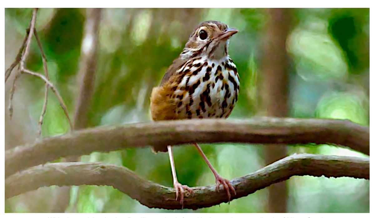
White-browed Antpitta is a Brazilian endemic found in the caatinga woodlands of Minas Gerais.

Let's keep fingers crossed for a typical northern Minas weather pattern for this time of year: crystal-clear skies, calm winds, with lows in the low 60s and highs into the mid-70s. Night in Botumirim.