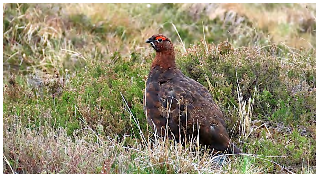
"Red Grouse", a form of Willow Ptarmigan, is a specialty of Scotland that we'll make an effort to find. These upland birds were quite common in 2019.

All participants will be required to confirm they will have completed a full COVID vaccination course at least two weeks prior to the tour (which includes a booster for those eligible to have one). Note too, that many travel destinations may still require proof of vaccination for entry to bypass testing delays or quarantine, and that entry requirements for a destination can change at any time. Proof of a booster shot, too, may be a requirement for some travel destinations.