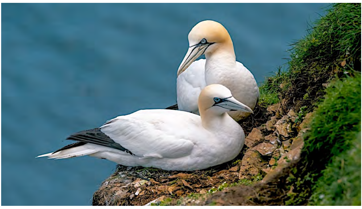
On the Scottish coast, we'll look for breeding seabirds such as these Northern Gannets.

Day 4, Thu, 16 May. Transfer to Aberdeen. Our itinerary allows plenty of time this morning to try again for anything we may not yet have seen. After a final lunch in the Spey Valley, we'll head north to check the waters of Lochindorb for loons before starting back to Aberdeen. If we get to Aberdeen early enough, we'll do some birding along the coast. Night in Aberdeen.