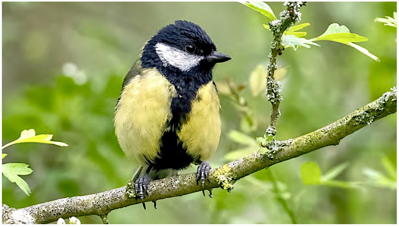
The Great Tit is found across Europe and Asia, but they can be quite confiding and easy to see in the gardens and parks of Great Britain.

May 4-13, 2024 Scottish Highland Extension May 13-18, 2024