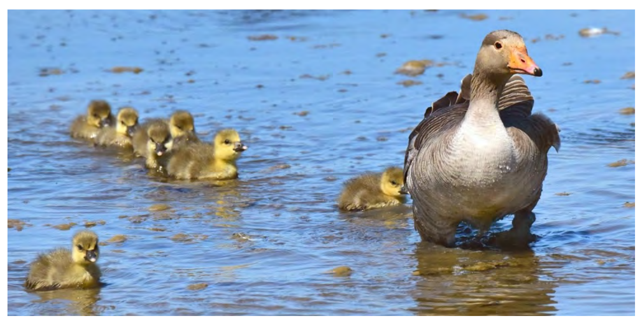
Our tour is timed so that we will see many of Britain's breeding birds with young in tow. This mother Greylag Goose and her brood were one of many families we saw on a recent tour.

Fowlsheugh or Troup Head) in search of breeding alcids, Northern Gannet, Northern Fulmar, and European Shag. Corn Buntings and Eurasian Tree Sparrows, two species in steep decline elsewhere in Britain, are still reasonably common in this region.