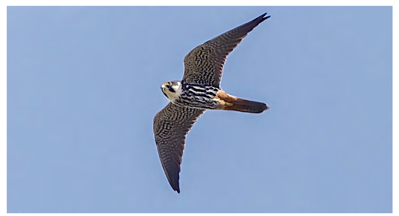
Eurasian Hobby is a beautiful small falcon that we'll watch for when we visit the Norfolk Broads.