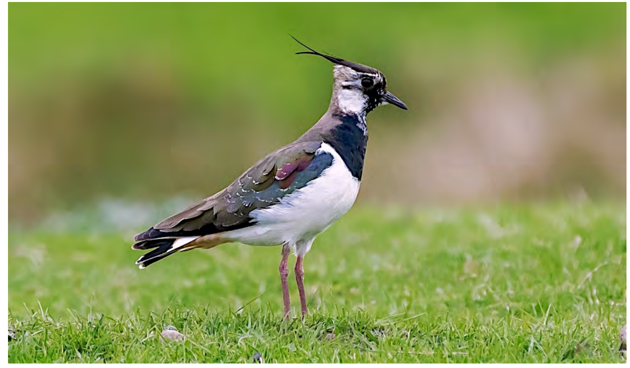
Northern Lapwing is common in the marshes, and we should get good views of these fancy shorebirds.

If you are uncertain about whether this tour is a good match for your abilities, please don't hesitate to contact our office; if they cannot directly answer your queries, they will put you in touch with the guide for the tour.