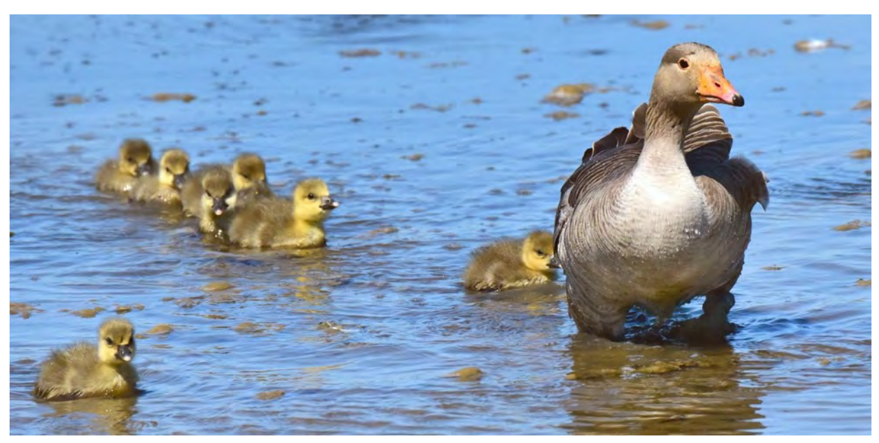
Our tour is timed so that we will see many of Britain's breeding birds with young in tow. This mother Greylag Goose and her brood were one of many families we saw on a recent tour.

Fowlsheugh or Troup Head) in search of breeding alcids, Northern Gannet, Northern Fulmar, and European Shag. Corn Buntings and Eurasian Tree Sparrows, two species in steep decline elsewhere in Britain, are still reasonably common in this region.