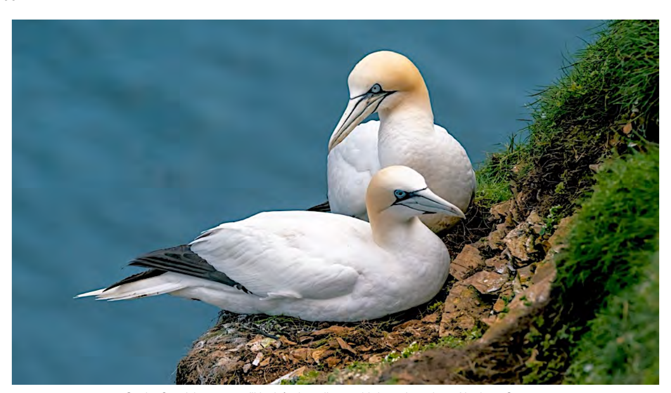
On the Scottish coast, we'll look for breeding seabirds such as these Northern Gannets.

Day 4, Thu, 15 May. Transfer to Aberdeen. Our itinerary allows plenty of time this morning to try again for anything we may not yet have seen. After a final lunch in the Spey Valley, we'll head north to check the waters of Lochindorb for loons before starting back to Aberdeen. If we get to Aberdeen early enough, we'll do some birding along the coast. Night in Aberdeen.