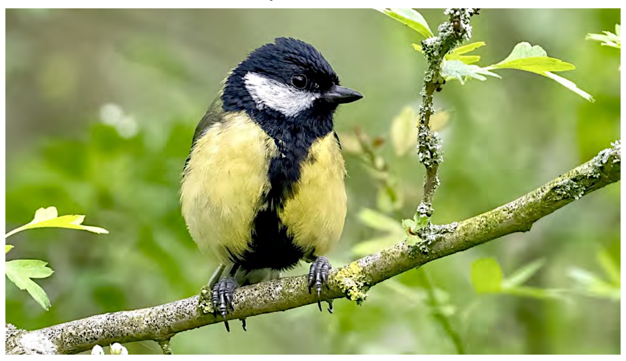
The Great Tit is found across Europe and Asia, but they can be quite confiding and easy to see in the gardens and parks of Great Britain.

May 3-12, 2025 Scottish Highlands Extension May 12-17, 2025