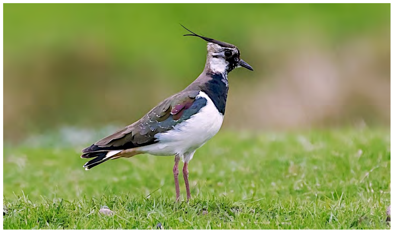
Northern Lapwing is common in the marshes, and we should get good views of these fancy shorebirds.

If you are uncertain about whether this tour is a good match for your abilities, please don't hesitate to contact our office; if they cannot directly answer your queries, they will put you in touch with the guide for the tour.