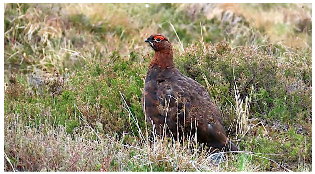
"Red Grouse", a form of Willow Ptarmigan, is a specialty of Scotland that we'll make an effort to find. These upland birds were quite common in 2019.

All participants will be required to confirm they will have completed a full COVID vaccination course at least two weeks prior to the tour (which includes a booster for those eligible to have one). Note too, that many travel destinations may still require proof of vaccination for entry to bypass testing delays or quarantine, and that entry requirements for a destination can change at any time. Proof of a booster shot, too, may be a requirement for some travel destinations.