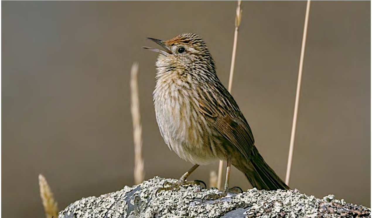
Furnariids are a large part of the South American avifauna, and we'll see quite a few on this tour, including the Scribble-tailed Canastero seen here.

fronted Brilliant, Black-hooded Sunbeam*, Bronzy and Collared (Gould's) incas, Amethyst-throated Sunangel, Booted Racket-tail, Scaled Metaltail*, Long-tailed Sylph, Crested and Golden-headed quetzals, Masked Trogon, Versicolored Barbet, Blue-banded* and Chestnut-tipped (scarce) toucanets, Hooded Mountain-Toucan*, Crimson-mantled Woodpecker, Olive-backed Woodcreeper, Black-throated Thistletail*, *, Montane Foliage-gleaner, Upland Antshrike*, Yellow-rumped Antwren* (rare), White-throated Antpitta* (tough), Rufous Antpitta (of the distinct-sounding race cochabambae ), Slaty Gnateater*, Bolivian ("Southern White-crowned") Tapaculo* ( Scytalopus bolivianus , a split from Rufous-vented; a tough skulker), Andean Cock-of-the-rock, Yungas Manakin, Yungas Tody-Tyrant* (scarce), Sclater's, Bolivian, and Buff-banded* tyrannulets, Rufous-bellied Bush-Tyrant, Band-tailed Fruiteater*, White-capped Dipper, Andean and White-eared solitaires, White-browed Conebill, Orange-browed* (rare) and Three-striped hemispinguses, Hooded and Scarlet-bellied mountain-tanagers, Golden-collared Tanager, Saffron-crowned, Blue-necked, Blue-and-black, and Green-throated* (scarce) tanagers, and Moustached and Deep-blue flower-piercers.