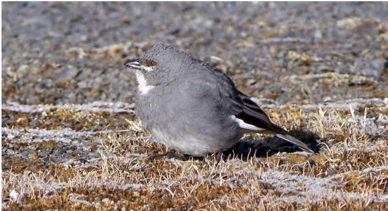
In the high elevations near La Paz, we'll look for the White-winged Diuca-Finch. This bird is one of the few that nest at such high elevations, and evidence suggests that they build their nests directly on patches of ice!

On the next three days, our efforts will be concentrated on the humid east slope of the Andes, which holds one of the richest avifaunas in the world. We'll need to depart Cochabamba very early on these days in order to be in the best birding areas as the sun comes up. After a picnic breakfast, we'll watch an impressive burst of activity among hummers, flower-piercers, furnariids, and flocking tanagers as the sun bathes the slopes at treeline. Weather permitting, we'll spend one entire day in the temperate forest zone, birding the bamboo flocks and hoping for such rarities as Hooded Mountain-Toucan and Chestnut-crested Cotinga in the forest below. We'll try some side roads and trails that take us into the alluring forest. Roadside and forest trail birding is not strenuous, but it is important to be prepared for rain (and to have waterproof footwear with you on the bus). To maximize our time in the field, we'll prepare picnic meals and be back at the hotel for dinner. Nights in Cochabamba at Hotel Aranjuez.