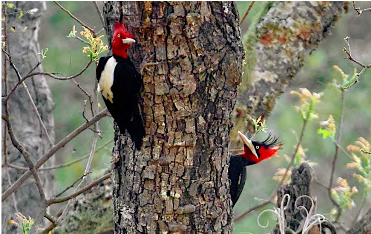
We've seen the impressive Cream-backed Woodpecker near Comarapa. This wonderful pair was seen well on our 2018 tour.

Day 6, Mon, 16 Sep. Just west of Comarapa, the serranía is high enough (8000-9000 feet) to catch the last of the moisture-laden easterlies. This is the southernmost of the Andes' humid "tropical" cloudforest, and as such, it marks the southern terminus in the distribution of numerous species of high-elevation forest birds. Siberia is a fascinating region that each year rewards us not only with the expected, but usually a surprise or two as well. Birding will be along level roads and on trails (with some climbing near Siberia) in both the arid zone and in the cloudforest. The cloudforest trails are sometimes muddy, although not too long or particularly steep. Some of the many birds we may encounter this day include Giant Antshrike, Olive-crowned Crescentchest, Red-tailed Comet and Great Pampa Finch. Night in Comarapa.