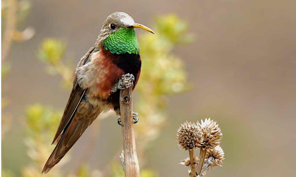
Wedge-tailed Hillstar is a high-elevation near-endemic. These hummingbirds are found primarily in southern Bolivia, and just barely extend their range into northern Argentina.

We include here information for those interested in the 2024 Field Guides Bolivia's Avian Riches tour: