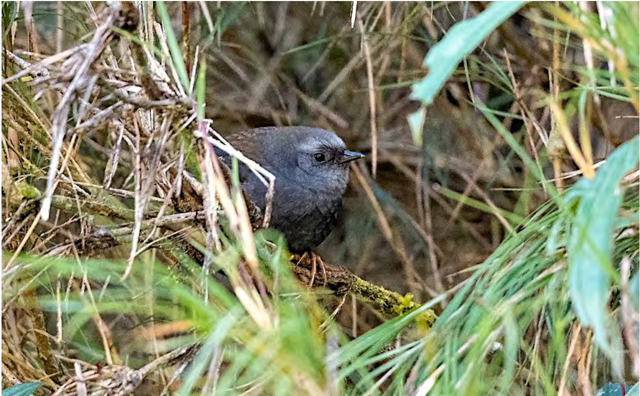
We've gotten some great views of Diademed Tapaculo on our tour.