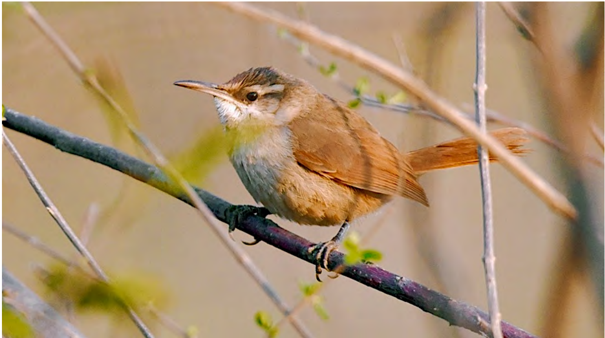
Bolivian Earthcreeper is an endemic found in dry valleys of south-central Bolivia. We'll look for them near Comarapa.

With aesthetic highlights varying from seeable tinamous and tapaculos to shy but often responsive Slaty Gnateaters and Giant Antshrikes, incredible Hooded Mountain-Toucan, the must-see-to-believe Black-hooded Sunbeam, the superb Olive-crowned Crescentchest, dazzling and exhilarating flocks of Hooded and Scarlet-bellied mountain-tanagers to subtly beautiful Whistling Herons and Scissor-tailed Nightjars, our efforts will be rewarded. We begin our birding in the lowlands at Santa Cruz and work our way slowly westward and northward before ascending the altiplano to end in La Paz. En route we will visit both the Serranía de Siberia, cloaked in a lush cloudforest at elevations of 8000 to 9000 feet at the southern limit for numerous forms of Andean birds, including the endemic Rufous-faced Antpitta, and the arid valleys of the Rio Mizque, with its surrounding cliffs furnishing nesting sites to some of the remaining 3000 Red-fronted Macaws, surely among the most beautiful of the macaws. In the nearby rain-shadow desert, the endemic Bolivian Earthcreeper scoots over rocks and cacti, while White-tipped Plantcutters clip leaves with their pruning-shear bills. Between this lovely area and Cochabamba await such specialties as Maquis Canastero and the strange Bolivian Blackbird. We end in the moist Yungas forests of the north, with their varied temperate and subtropical avian beauties. Bolivia's Avian Riches is a tour that brings scenic and avian variety and surprises every day.