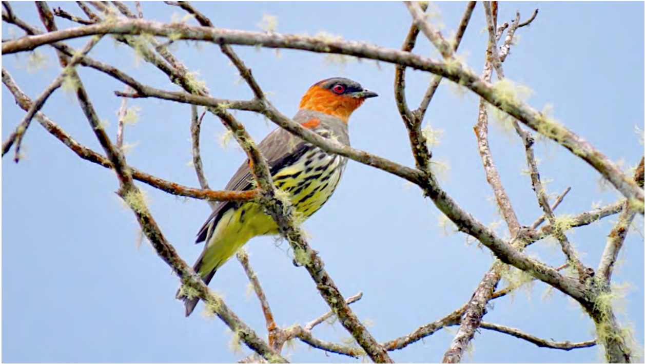
Chestnut-crested Cotinga is one of the cloud-forest dwellers we'll watch for near Siberia.

West of Comarapa, in near the town of Siberia , are shrub-clad slopes with a patchwork of alders and cultivated fields to 8500 feet. Then, around a bend, where clouds often spill over from the east slope, lies humid montane cloudforest with tall, epiphyte-laden trees and beautiful flowers. In these habitats we'll seek Andean Tinamou, Huayco Tinamou* (a recent split from Red-winged Tinamou; with a very different vocalization), Violet-throated Starfrontlet, Blue-capped Puffleg*, Red-tailed Comet, Spot-breasted Thornbird, Giant Antshrike, Rufous-faced Antpitta*, Trilling Tapaculo (a recent split from Unicolored), Olive-crowned Crescentchest, Chestnut-crested Cotinga, Brown-capped Redstart, Blue-winged and Chestnut-bellied mountain-tanagers, Great Pampa-Finch, Bolivian*, Rufous-sided, and Rusty-browed warbling-finches, and Gray-bellied Flower-piercer*.