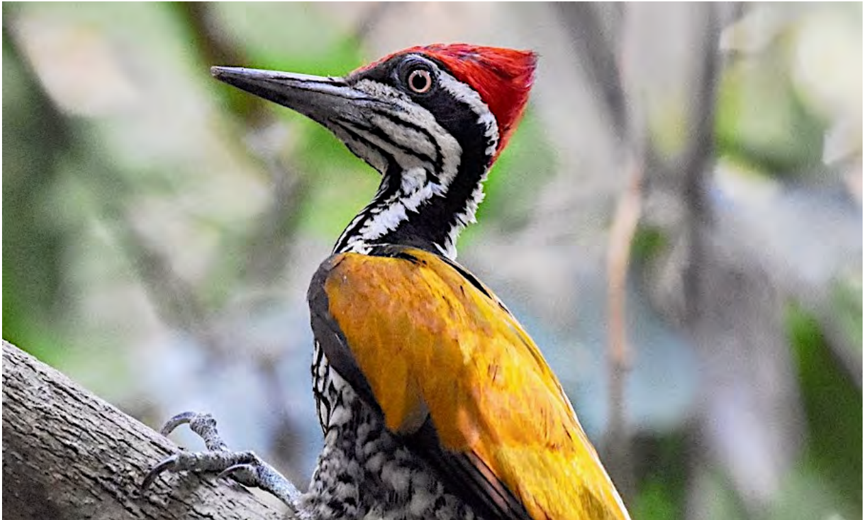
It is easy to see how the Greater Flameback got its common name. These large, spectacular woodpeckers are common across their range, and we should get good views of them.

Another day will see an early visit to Chankran Roy village conservation area where there is a blind set up at a water feature for good views of shy and elusive forest birds, that may include Bar-bellied Pitta. If we are successful, a return to the Angkor area may be possible for more birding and temple visiting.