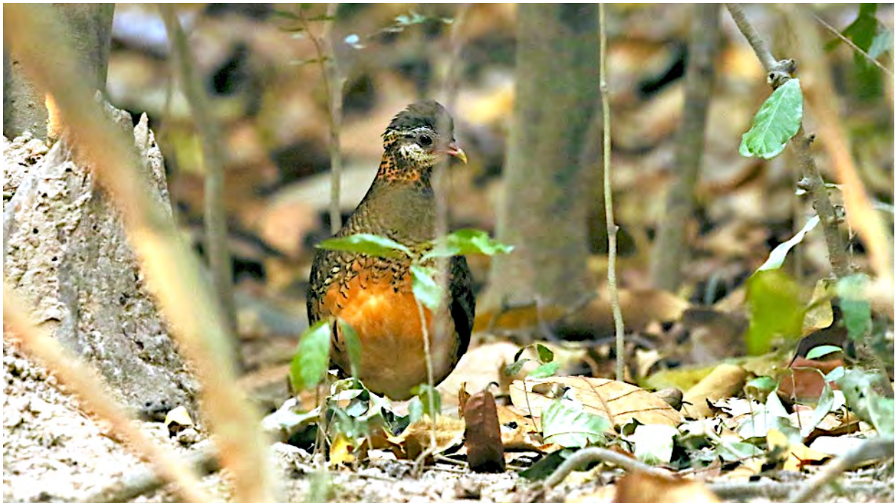
We had great views of this Scaly-breasted Partridge on our tour in 2020. The subspecies found in Cambodia could potentially be split, and become a full species known as the "Green-legged Partridge".

Seima is a large area of moist evergreen forest in the hills along the Vietnam border, with some very different species coming into Cambodia than we see elsewhere in the tour. Much of it is protected forest, but logging for valuable hardwoods is a serious problem, as is burning. Exciting species we've previously seen have included Germain's Peacock-Pheasant, Green Peafowl, Banded and Silver-breasted Broadbill, Great Hornbill, Rufous-bellied Eagle, four species of Barbet including the very localized Annam (Indochinese) and Red-vented Barbet, Silver-eared Mesia, and many others. There's also a chance of Scaly-breasted Partridge, or Bar-bellied Pitta if we can keep quiet and still for long enough!