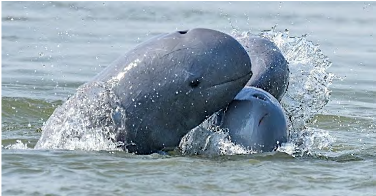
We had an amazing encounter with the rare Irrawaddy Dolphin on the Mekong River in 2019. We see these unusual small cetaceans on our river trip while searching for the Mekong Wagtail and other riverine species.

Day 13, Thu, 23 Feb. Mekong River at Kratie, then to Mondulkiri. We'll take a 90-minute river trip from Kratie to look for Irrawaddy Dolphins, Mekong Wagtail and Small Pratincole on the Mekong River, then head up to Seima Forest and Mondulkiri, near the Vietnam border. Depending on how we are doing on time, we may have time for some late afternoon birding around Seima which, despite enduring illegal logging damage, holds good birds like several species of barbets, including Indochinese, Red-vented and Green-eared, plus assorted Green-Pigeons and various forest birds also found in nearby Vietnam. Overnight at Sen Monorom in a comfortable hotel.