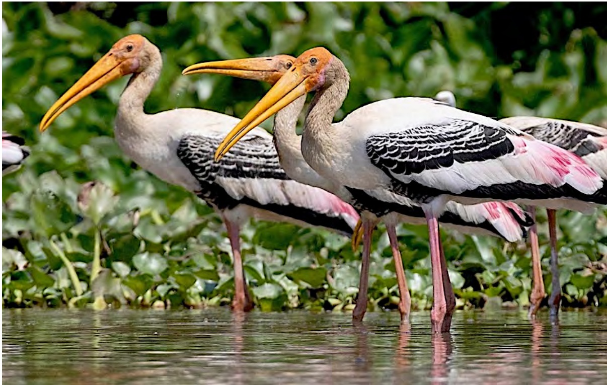
Cambodia hosts the largest breeding concentration of Painted Storks in southeast Asia at Tonle Sap. These colorful storks are listed as regionally threatened, but we should be able to get good views of them.

The subsidiary temples are well worth a visit. The ruins at Angkor Tom (Bayon), near Angkor, are very impressive, and Angkor itself has a tremendous setting. We'll have time to tour the site as well as bird the areas around it and you might want to think about coming a day or two early to enjoy the ruins at leisure, with excellent English-speaking temple guides readily available. Angkor must have been one of the wealthiest and indeed largest cities on Earth in the 12 th century.