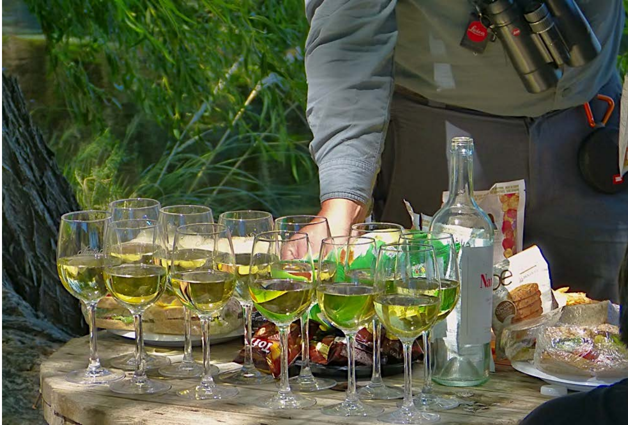
This tour is organized so that we may find the best of birds and wines in Chile and Argentina! We'll visit a number of wineries, and even be able to enjoy some wine with our lunch!

We include here information for those interested in the 2023 Field Guides Birds & Wines of Chile and Argentina tour: