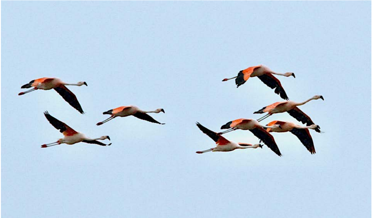
Chilean Flamingos have a colony that we will visit at Llanquanelo Province Park in Argentina.

All participants will be required to confirm they will have completed a full COVID vaccination course at least two weeks prior to the tour (which, for tours departing on or after March 1, 2022, includes a booster). Having a vaccinated group will greatly diminish but not eliminate the possibility of the group and individual participants being adversely affected by COVID-19. We are requiring all of our staff guides to be vaccinated, including getting the booster. Note too, that many travel destinations are or soon will be requiring proof of vaccination for entry to bypass testing delays or quarantine, and that entry requirements for a destination can change at any time. Proof of a booster shot, too, may become a requirement for some travel destinations if they choose to declare that vaccinations do not last indefinitely. And having a booster means your risk is lowered and your travel plans and those of our group are less likely to be disrupted.