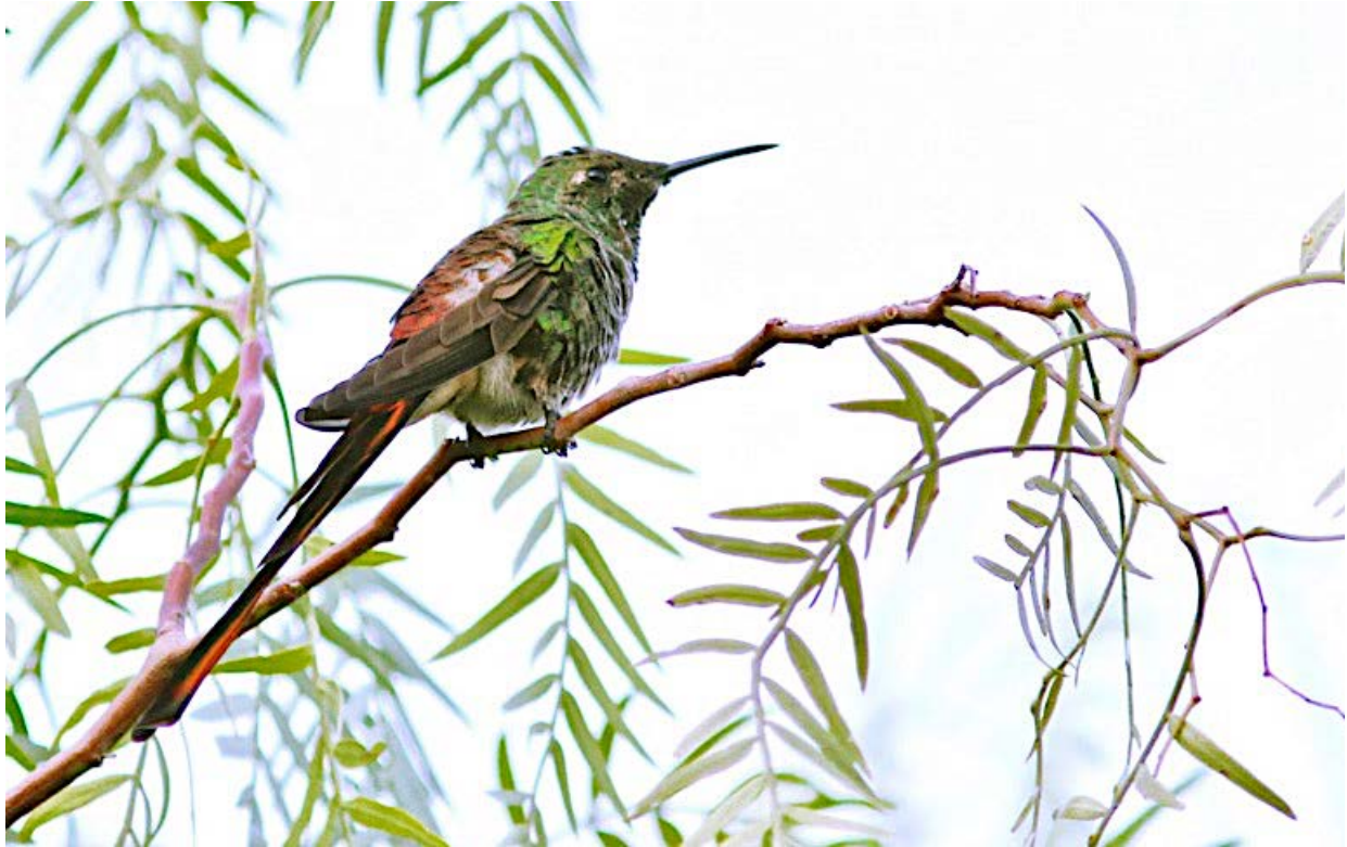
The Red-tailed Comet is one of our targets in the Mendoza area. These striking hummingbirds are found along the Andes from central Bolivia to northern Argentina.

Woodcreeper, White-fronted Woodpecker and many others. Returning to Mendoza for a late lunch and in time to explore this vibrant and surprisingly green city, we will take some time to bird its surroundings searching for a great variety of birds that may include the stunning Red-tailed Comet, Sparkling Violetear, Brown-capped Tit-Spinetail, Lark-like Brushrunner, and others. We will have dinner at our hotel and get ready for our flight back to Chile the following day. Night in Mendoza City.