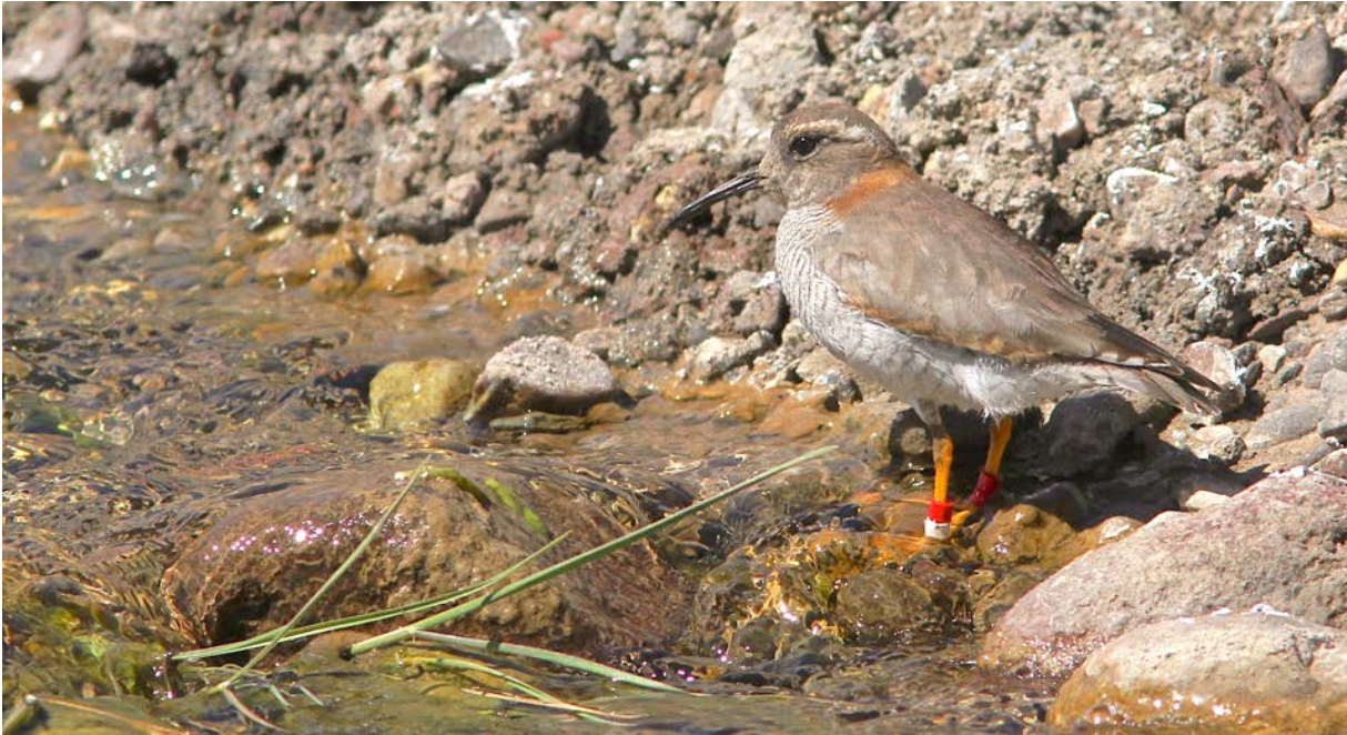
One of the special birds found in Chile and Argentina is the Diademed Sandpiper-Plover. These unusual shorebirds live in high-elevation wetlands such as the Yeso Valley in Chile.

coastal Atacama Desert farther to the north. The effects of the Humboldt Current are still felt—although slightly ameliorated—along the central Chilean coast. Near Viña del Mar many of the Humboldt Current specialties (including Humboldt Penguin, Peruvian Booby, Guanay and Red-legged cormorants, and Inca Tern) can be conspicuous right along the road that winds through the arid hills overlooking the rocky coastline. Here too is the endemic Chilean Seaside Cinclodes, Cinclodes nigrofumosus .