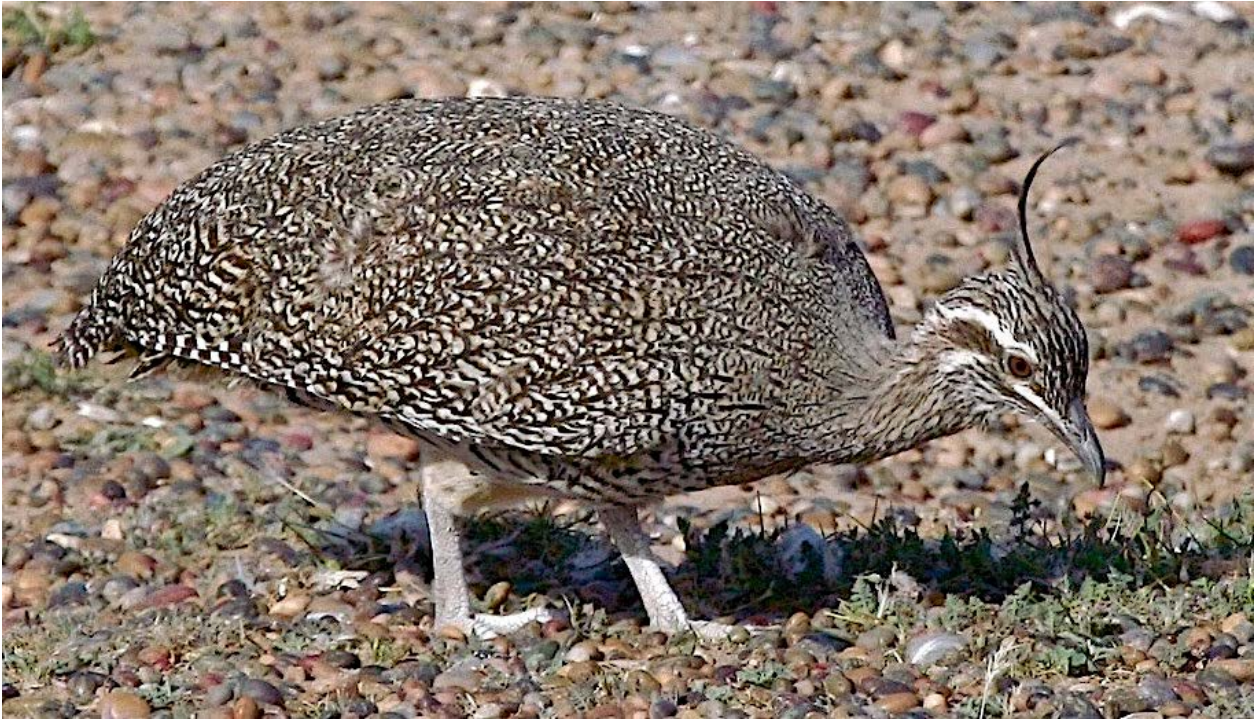
The Elegant Crested-Tinamou is a near-endemic of Argentina. It is found in dry scrub habitats, and we've had good luck in seeing these cryptically marked birds.

Day 7, Fri, 10 Feb. Posada Salentein. The property at Salentein produces more than just grapes, and we will make a point of using this morning to explore the surrounding orchards and a good area of native habitat on the back side of the property where we may find a wide range of birds such as White-crested Cachalote, Cinnamon and Ringed warbling-finches, Mourning Sierra-Finch, White-winged Black-Tyrant, and if we are lucky, Elegant Crested-Tinamou. We will then visit a nearby winery for lunch and take some time to visit the cellars and the museum at Salentein later in the afternoon. Night at Posada Salentein.