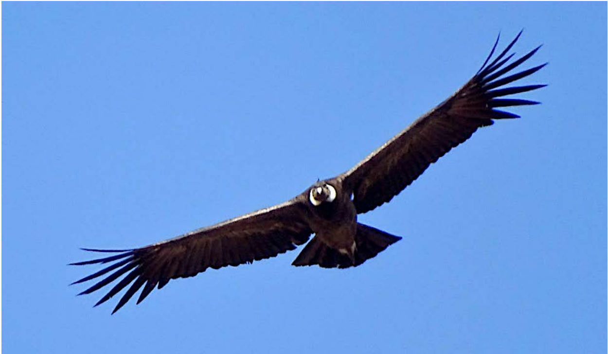
We'll get some good views of the magnificent Andean Condor when we visit the highlands near Santiago.

We'll have lunch at Viña Santa Rita, then visit their cellars and bottling plant and their Andean museum that holds a spectacular pre-Colombian collection. Next, we'll head to the nearby Concha Y Toro for a visit and a tasting of some of their premium wines. Night in Santiago.