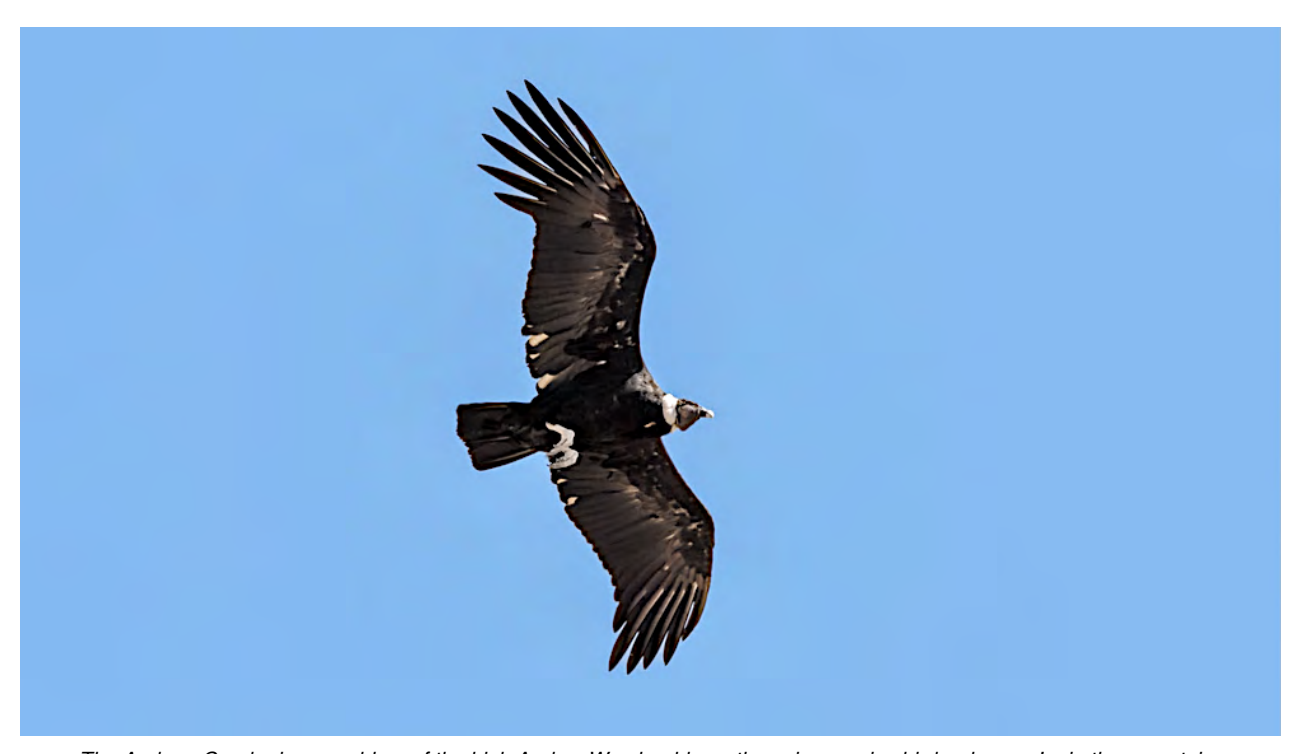
The Andean Condor is an emblem of the high Andes. We should see these impressive birds when we're in the mountains above Santiago.

Day 4, Tue, 3 Feb. Santiago. This will be one of the most strenuous days of the tour. We'll have breakfast before dawn and lunch in the field in order to make the best of a full day of birding in Andean highlands as we search for the rare and unusual Diademed Sandpiper-Plover as well as many other highlights. Today we are more than likely to have our first encounter with the incredible Andean Condor, and, as we make our way to and from our destination, we will make several stops that may well produce good looks at Torrent Duck, Crag Chilia, Chilean Flicker, Austral Blackbird, and Spot-billed Ground-Tyrant among several other highlights. On our way back to Santiago we will visit Concha Y Toro, Chile's largest winery, for a memorable dinner paired with their wines. Night in Santiago.