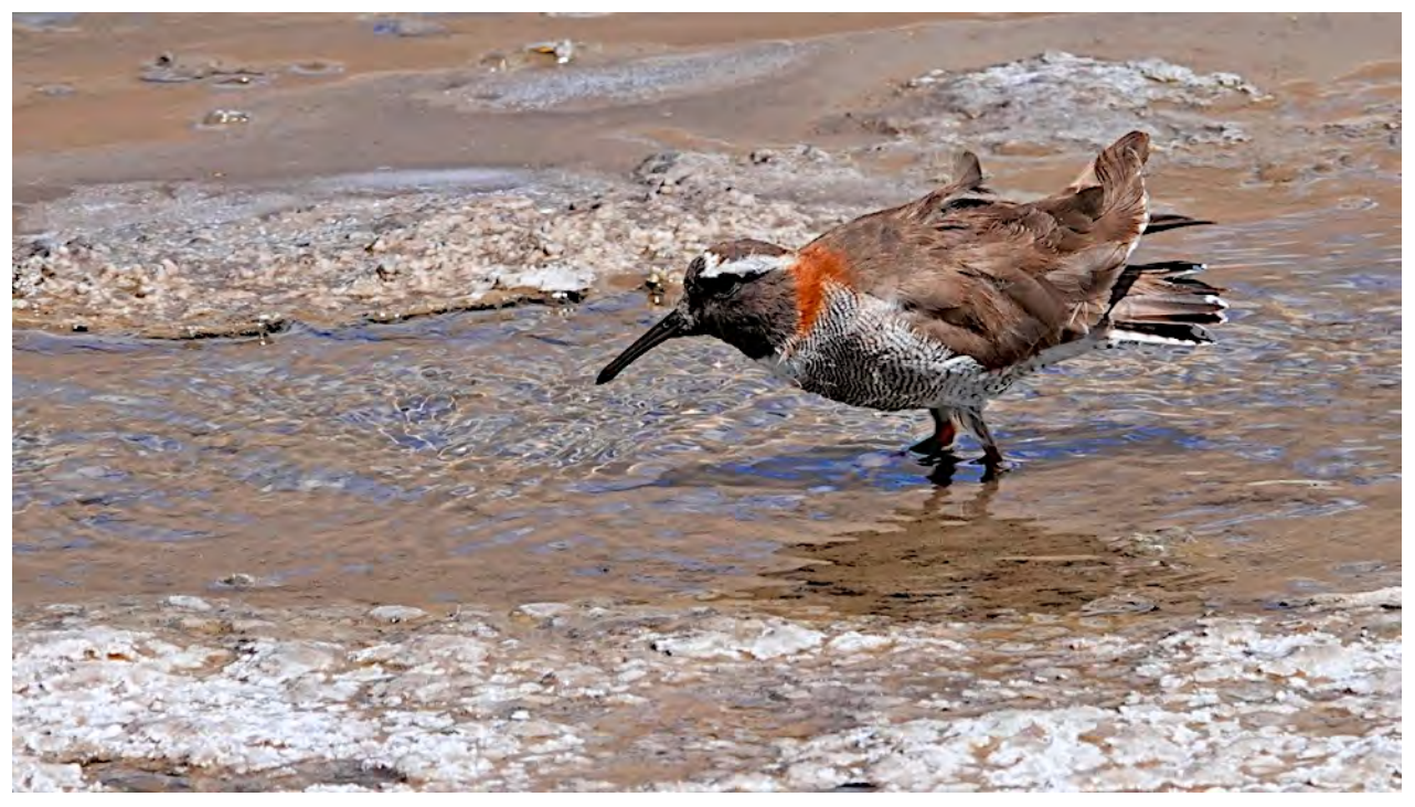
The Diademed Sandpiper-Plover is a special bird of the high Andes. One of the best places to see these lovely shorebirds is the Yeso Valley of Chile.

We include here information for those interested in the 2026 Field Guides Birds & Wines of Chile and Argentina tour: