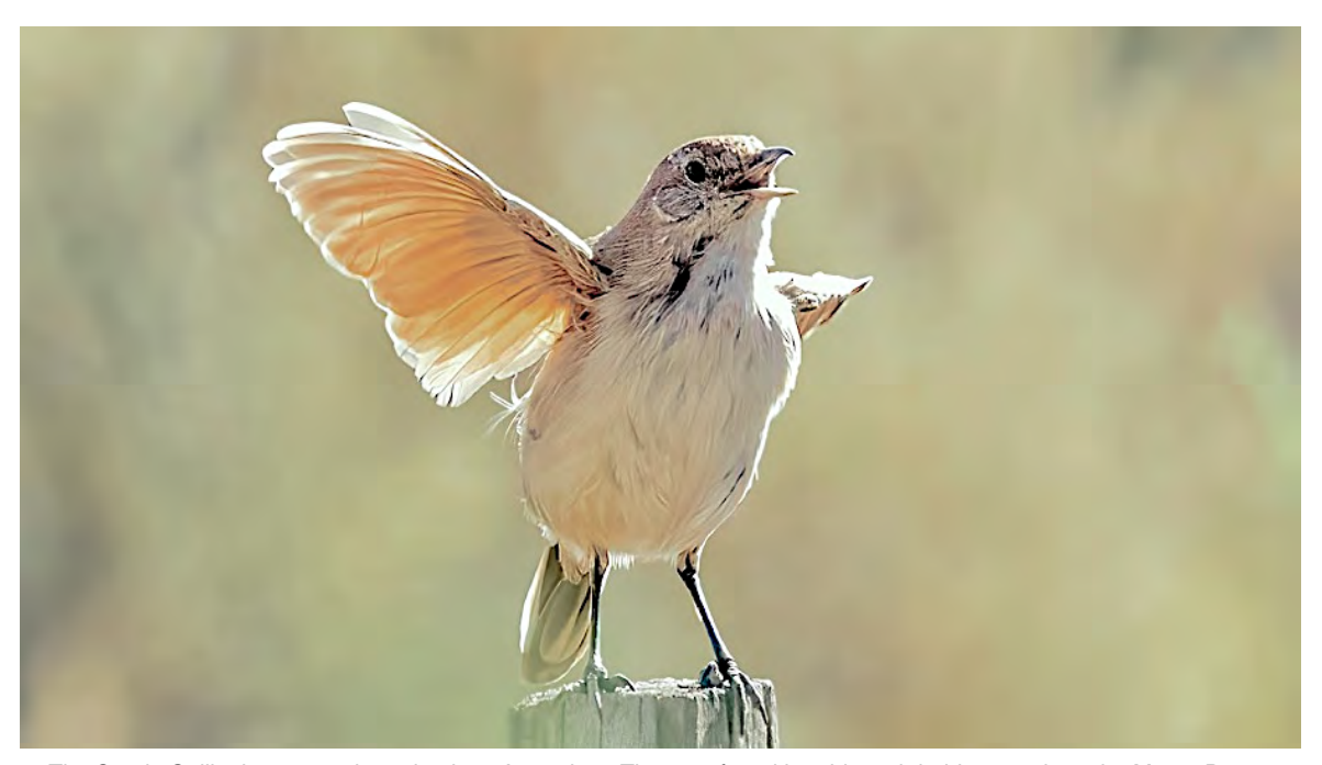
The Sandy Gallito is a tapaculo endemic to Argentina. They are found in arid scrub habitats such as the Monte Desert.

Monte Desert —The biogeographical province known as Monte Desert comprises an extensive area that stretches from 23° to 43° south in latitude and encompasses a large part of the province of Mendoza at its western limit. It is characterized by shrub steppes and small and localized areas of woodland. The region has a high level of endemism of plants and insects and few birders have explored the areas we will be visiting. Much remains to be studied and discovered in this area, but as we move about, we will make an effort to locate several specialties such as Sandy Gallito, Scale-throated Earthcreeper, White-throated Cacholote, Cordilleran Canastero, White-browed Ground-Tyrant, and many others.