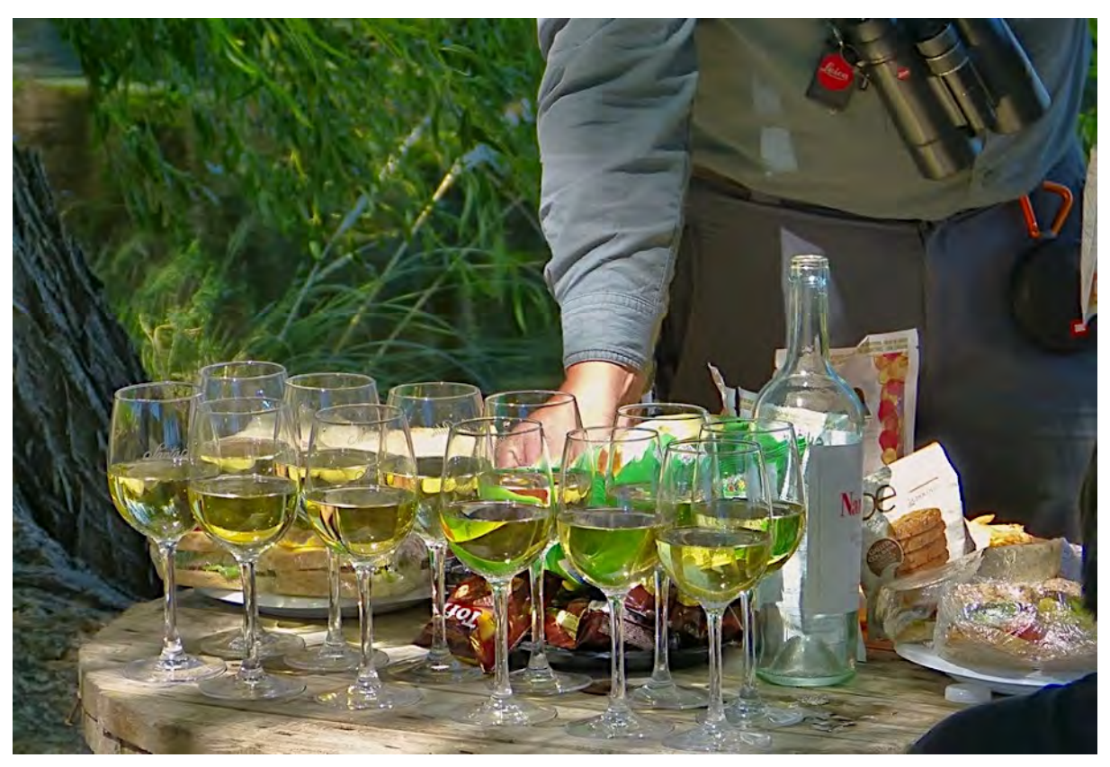
This tour is organized so that we may find the best of birds <u>and</u> wines in Chile and Argentina! We'll visit a number of wineries, and even be able to enjoy some wine with our lunch!

Throughout both countries we will always keep an eye in the sky for those incredible Andean Condors watching over us as we discover the true meaning of savoir vivre! Salud!