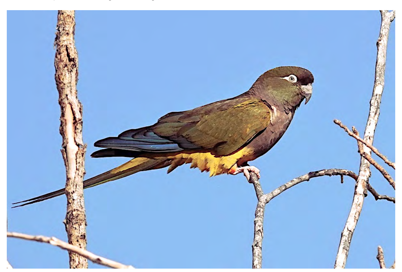
Burrowing Parakeets are unique parrots found in the Chaco region of Argentina.

Day 8, Sat, 7 Feb. Posada Salentein to Malargue. Today we will continue to head south in the province of Mendoza. As we make our way towards the town of Malargue, we'll make several stops along the way as we will be traveling through some excellent birding areas. With some luck today we will find the rare Burrowing Parakeets, the unusual Sandy Gallito, and several other interesting birds, perhaps including Chiguanco Thrush, Chaco Earthcreeper, Blue-and-yellow Tanager, and Yellow-billed Tit-Tyrant. We will reach our destination late in the afternoon and enjoy a traditional parrillada (Argentine barbecue) for dinner. Night in Malargue.