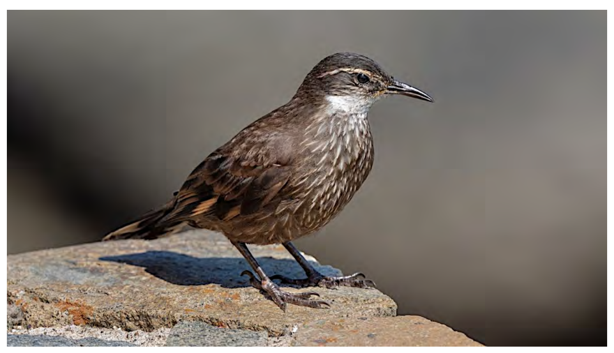
In coastal regions we'll watch for the unique Seaside Cinclodes. These furnariids are specially adapted to live in the tidal zone where they feed on small invertebrates and crustaceans.

Day 12, Wed, 11 Feb. Mendoza city to Viña del Mar. In order to maximize our experiences and reduce the time that we spend on the road, we'll fly to Santiago today instead of driving. Upon arrival in Santiago, we'll drive west and visit a family home where we will have the rare treat of eating a homemade meal in typical Chilean style. Fortunately for us this family's backyard is also full of waterfowl and we may enjoy great looks at birds such at Spot-flanked Gallinule, White-winged Coot and with some luck, even a rare Black-headed Duck. After a hearty lunch, we will continue to the coast where we will check in to our hotel and bird some nearby roosting colonies of gulls and terns. Night in Viña del Mar.