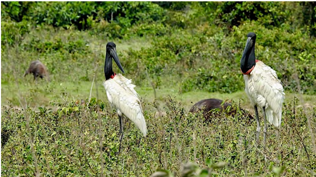
The imposing Jabiru is a prominent sight in the llanos of Colombia.

The area's forests hold their own interesting avifauna. The localized Pale-headed Jacamar is common along the riversides, and we also seek out White-bearded Flycatcher—both species are llanos endemics, found only in Colombia and adjacent Venezuela. Other birds we may see include Chestnut-vented Conebill, Double-banded Puffbird, Rufous-vented Chachalaca, Blue-tailed and Versicolored emeralds, the big Oriole Blackbird, Red-capped Cardinal, Pale-tipped Tyrannulet (Inezia), Orange-fronted Yellow-Finch, Chestnut-eared Aracari, , and the lively Rufous-fronted Thornbird, which nests commonly around the Lodge. We will always be on sharp lookout for mammals: along with the common Capybaras, we may encounter Crab-eating Fox, Collared Peccaries, White-tailed Deer, as well as Giant Anteater (seen here on our tours in 2017, 2018, and 2023). Jaguars are known to be present on the ranch, although a sighting is very unlikely. Green Anacondas are also present (seen in 2019), but they are also rather retiring, if not rare.