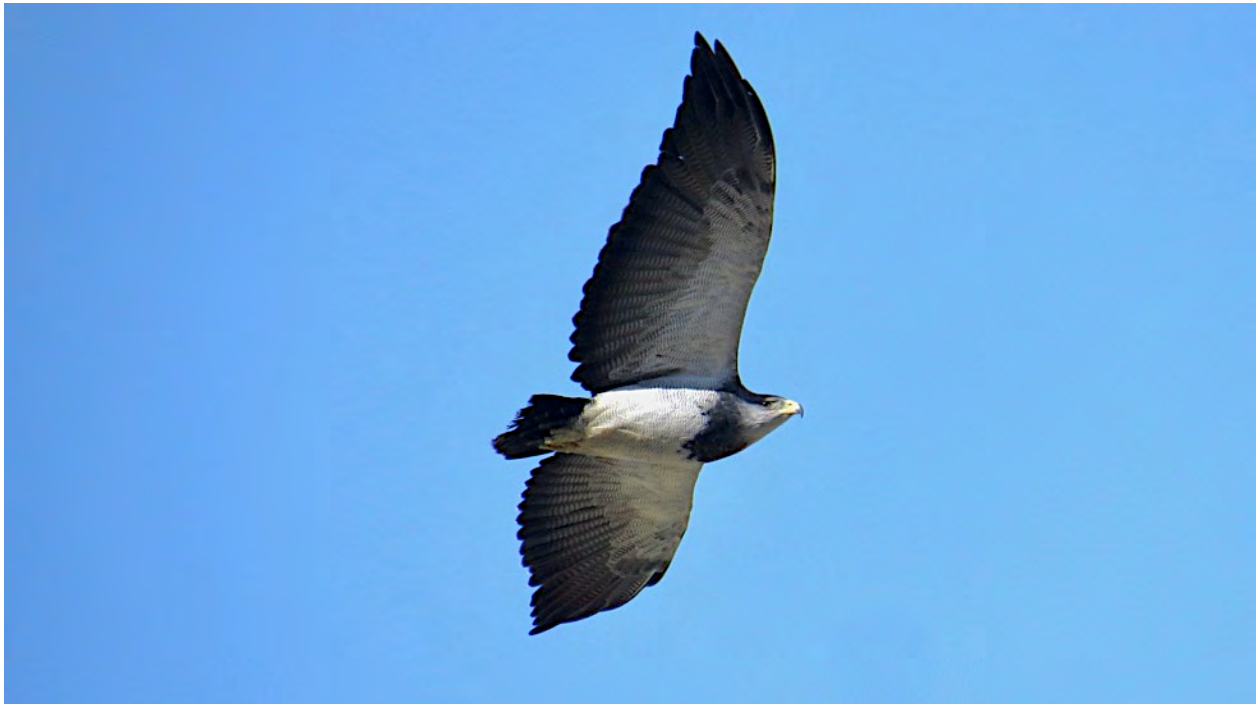
The Black-chested Buzzard-Eagle is a wide-spread hawk found in the higher elevations of Colombia. We'll watch for one when we visit Sumapaz National Park.

Observatorio de Colibries —This quiet garden bordered by a small patch of forest seems modest at first, but the blizzard of hummingbirds that attend the flowers and feeders here are anything but modest, in color or behavior! We stop by here primarily to see the endemic Blue-throated Starfrontlet, Coppery-bellied Puffleg, and Glowing Puffleg, but Sword-billed Hummingbird, Black-tailed and Green-tailed trainbearers, Great Sapphirewing, White-bellied Emerald, and Sparkling and Lesser violetears make for generous lagniappe. A few nice Andean birds are often in the parking area—Black-backed Grosbeak, Red-crested Cotinga, or Scarlet-bellied Mountain-Tanager, so we'll try to tear ourselves away from the garden for a few minutes before heading back to Bogotá.