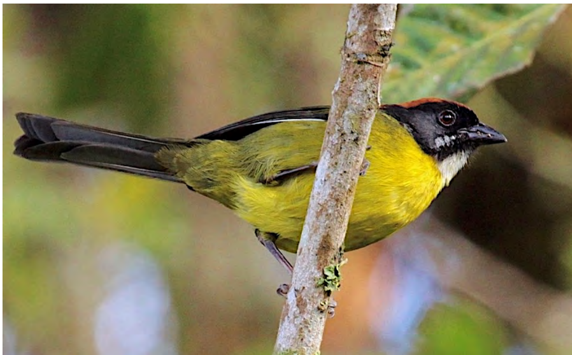
The Moustached Brushfinch is a near-endemic found only in the eastern Andes of Colombia, and western Venezuela.

Day 4, Tue, Jan 16. Laguna de Pedro Palo; return to Bogotá. Our main focus at Pedro Palo will be the endemic Turquoise Dacnis and Black Inca, but we will be on the lookout for any birds we haven't seen or would like to see better before leaving the western slope, including perhaps Stripe-breasted Spinetail, Moustached Brushfinch, Rufous-naped Greenlet, Olivaceous Piculet, Buff-fronted Foliage-gleaner, or Metallic-green Tanager. Night in Bogotá.