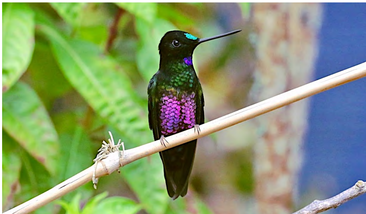
Blue-throated Starfrontlet (here an adult male) is one among many glorious hummingbirds of Colombia's eastern Andes that we'll seek during this week exploring the national capital area and a bit beyond.