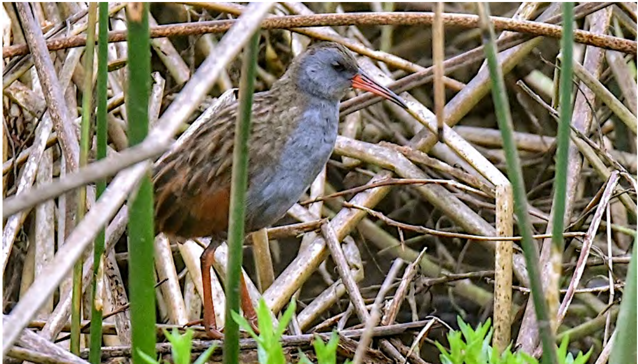
The endemic Bogota Rail is an endangered species, found in only a few locations. We'll look for this skulker in the wetlands of Sumapaz National Park.

And this is a rather packed and energetic week of birding! We'll have a local guide and drivers, to help us navigate (there is a bit of traffic to contend with in the capital), and we'll catch the occasional "cultural moment" as we can, like trying out the local aromática at a café. Although we won't shop for emeralds or take in the gold treasures at Museo del Oro together, we'll wager that the hummingbird shows at Tabacal, Chicaque, and especially the Observatorio de Colibries will outshine any display of gems or precious metals! The capital area has an active birding community, it's true, but the surrounding mountains still hold mysteries, like the enigmatic Bogota Sunangel—a gorgeous hummingbird species known only from one specimen—so we'll be on our toes in case fortune favors us with an El Dorado moment. Colombia has a way of surprising even veteran birders, we find.