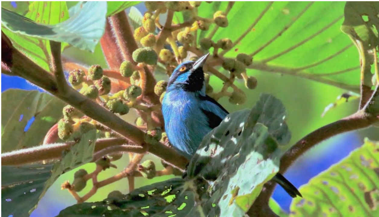
The endemic Turquoise Dacnis is one of our targets at Laguna de Pedro Palo.

Laguna de Pedro Palo —Our final morning on the western slope will find us in this mostly scrub and second-growth nature reserve that belongs to the municipality of Tena. The reserve spans 6600-7500 feet (2000-2280 m) in elevation, where temperatures are usually very pleasant. In the early mornings, the endangered Turquoise Dacnis often forages here, in the forest canopy comprised of species of oak, cecropia, fig, alder, walnut, willow, laurel, sweetwood, and coralberry, along with Ocotea , Cedrela , the lovely endemic Encenillo ( Weinmannia tomentosa ), and the magnificent Retrophyllum rospigliosii of the family Podocarpaceae, once called Romeron Pine. We'll bird slowly among these trees and along pasture edges, mostly from a gravel road but also from a short trail. We might see a Silvery-throated Spinetail or Gray-cowled Wood-Rail here, and we'll have an additional chance to see some of the species we might have seen (or missed?) earlier, including Spectacled Parrotlet, Buff-fronted Foliage-gleaner, Bar-crested Antshrike, Black Inca, Indigo-capped Hummingbird, Red-headed Barbet, Ash-browed Spinetail, Whiskered and Speckle-breasted wrens, Moustached Brushfinch, or Flame-faced, Golden, Saffron-crowned, Scrub, and Black-capped tanagers. White-winged Becard, Yellow-backed Oriole, and Metallic-green Tanager are occasionally present.