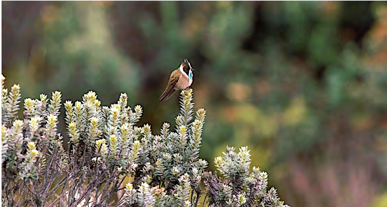
The bird list for this tour boasts nearly 50 species of hummingbirds, including the-endemic Green-bearded Helmetcrest. We'll look for this high-elevation specialist at Sumapaz National Park.

We include here information for those interested in the 2024 Field Guides Colombia's Eastern Cordillera tour: