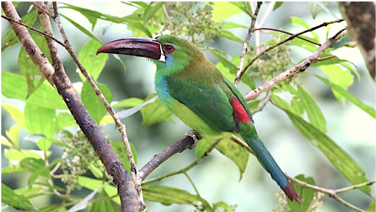
Crimson-rumped Toucanet and other Andean birds will be our focus in the forests of Chicaque Natural Park.

Jardín Encantado —This private home is called the called the “Enchanted Garden” because of its dozens of hummingbird feeding stations, which will give us an excellent opportunity to study the endemic Indigo-capped Hummingbird, which often patronizes flowers and feeders here. Gorgeted Woodstar is another range-restricted species we hope to see here (with White-bellied Woodstars for comparison), and we’ll certainly enjoy every hummer we see, including potentially Black-throated Mango, Green Hermit, White-vented Plumeleteer, Ruby-topaz Hummingbird, Red-billed Emerald, and three species of violetear—Brown, Lesser, and Sparkling. Of the more than three-dozen species of hummingbirds reported here, more than a third are regular patrons, and those will keep us busy!