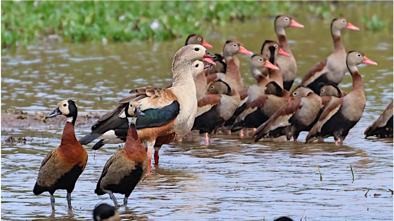
The Llanos of Colombia are home to many species of waterfowl, including the Orinoco Geese, and Black-bellied and White-faced whistling-ducks seen here.

Goose, Whistling Heron, and Sharp-tailed, Scarlet, and Buff-necked ibis will all be on the agenda, along with mammals—herds of Capybara, troops of Colombian Red Howler Monkeys, and perhaps even a Giant Anteater or Southern Tamandua. We may also get the chance to see a Green Anaconda or Red-footed Tortoise, among other reptiles. In the Llanos, whether flying Scarlet Macaws or a perched Great Potoo, a flashy Sunbittern or stately Jabiru, there is always something to see, making for an exciting safari-style birding experience.