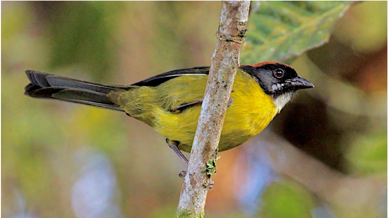
In addition to many wonderful hummingbirds and other beauties, we'll look for the Moustached Brushfinch when we visit Chicaque Natural Park.

Chicaque Natural Park —Located about 25 miles southwest of the capital, at elevations of 6900-8900 feet (about 2100-2700 m), Chicaque is a private park with an extensive trail system through wonderfully lush cloudforests bursting with ferns, orchids, epiphytes, palms, oaks, and many other Andean evergreen trees. Although many of the birds found in the mixed flocks here are of widespread Andean distribution, two hummingbirds are not: Golden-bellied Starfrontlet and Black Inca. The former sometimes visits feeders at the park restaurant, but the latter usually does not, and so we'll search for it carefully in the forest and edges, along with the range-restricted Moustached Brushfinch. We will take our time as we walk, slowly and carefully ( walking sticks are very helpful ), downhill over a trail that begins as cobblestone but becomes earthen and narrower as we descend (we'll get a ride in 4x4 trucks back to the entrance rather than walking back uphill!).