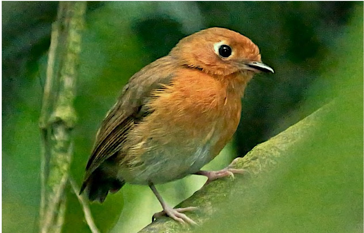
The Rusty-breasted Antpitta is a near-endemic found in only a few locations in Colombia and Venezuela.

We include here information for those interested in the 2026 Field Guides Colombia's Eastern Cordillera tour: