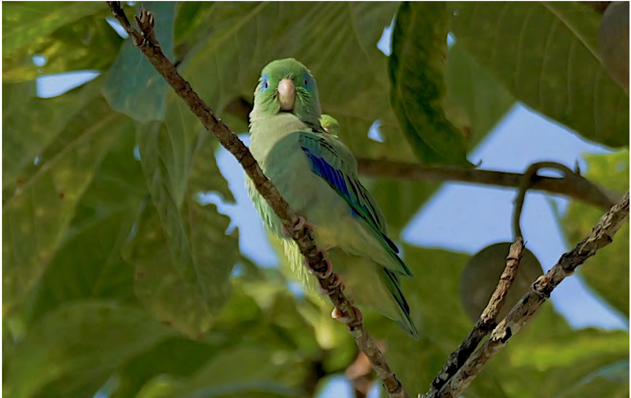
The tiny Spectacled Parrotlet is one of our targets at Laguna de Pedro Palo.

missed?) earlier, including Spectacled Parrotlet, Buff-fronted Foliage-gleaner, Bar-crested Antshrike, Black Inca, Indigo-capped Hummingbird, Red-headed Barbet, Ash-browed Spinetail, Whiskered and Speckle-breasted wrens, Moustached Brushfinch, or Flame-faced, Golden, Saffron-crowned, Scrub, and Black-capped tanagers. White-winged Becard, Yellow-backed Oriole, and Metallic-green Tanager are occasionally present.