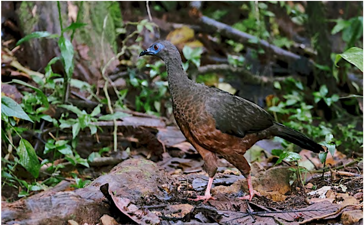
The Sickie-winged Guan is found in the temperate forests of the Andes. It is one of the smaller cracids, and perhaps has less hunting pressure, but it still can be difficult to see.

the humid forest is home to birds with distinctly Amazonian affinities: Spix's Guan, Cobalt-winged Parakeet, Amazonian Umbrellabird, White-chinned Jacamar, Amazonian Motmot, Lettered Aracari (what a bill!), White-chested Puffbird, Yellow-billed Nunbird, Scaled Piculet, Yellow-tufted and Red-stained woodpeckers, Gray-chinned, Sooty-capped, and White-bearded hermits, Blue-fronted Lancebill, Golden-tailed Sapphire, Green-backed Trogon, Gilded Barbet, Northern Slaty-Antshrike, Black-faced, Dusky, White-browed, and Spot-winged antbirds, White-bearded, Striolated, and Golden-headed manakins, Violaceous Jay, Russet-backed and Crested oropendolas, Purple-throated, Orange-bellied, and Golden-bellied euphonias, and Paradise, Speckled, Turquoise, Swallow, and Masked tanagers. More open areas may have Pectoral Sparrow, Buff-throated Saltator, and seedeaters and perhaps flocks of swifts overhead. There are no must-see endemics here, it's true, but this is a fascinating elevation to visit, particularly when contrasted with Monterredondo, a short distance upslope! At some point, however, if we see flowering Erythrina trees (usually about 4000 feet/1200 m at this time of year), we will check them carefully for the elusive endemic Green-bellied Hummingbird.