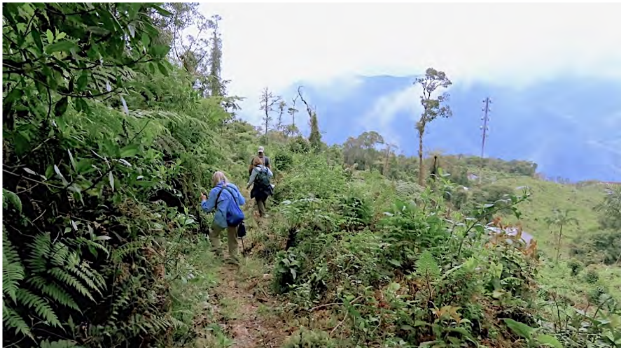
Some of our hikes will be in places that are rather steep, but it will be worth the effort to reach the special birds we'll see.

This tour may be combined with Colombia's Santa Marta Mountains & Caribbean Coast, January 5-13, 2026 and Colombia's Marvelous Magdalena Valley, January 21-31, 2026.