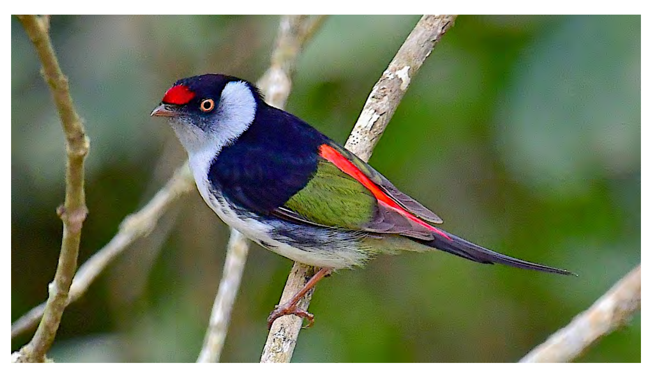
The gorgeous Pin-tailed Manakin is a specialty of the Atlantic Forest biome. We'll look for this colorful beauty near Caraca.

Parque Nacional Serra do Cipo includes 83,000 acres of designated parklands being acquired to preserve the highly endemic plant and animal life of this serra system. Principal among the specialties at Cipo are the very local Cipo Canastero, the undescribed tapaculo, Horned Sungem, Hyacinth Visorbearer, Gray-backed Tachuri, Sharp-tailed Tyrant, Yellow-billed Blue Finch, Stripe-tailed Yellow-Finch, and Cinereous Warbling-Finch.