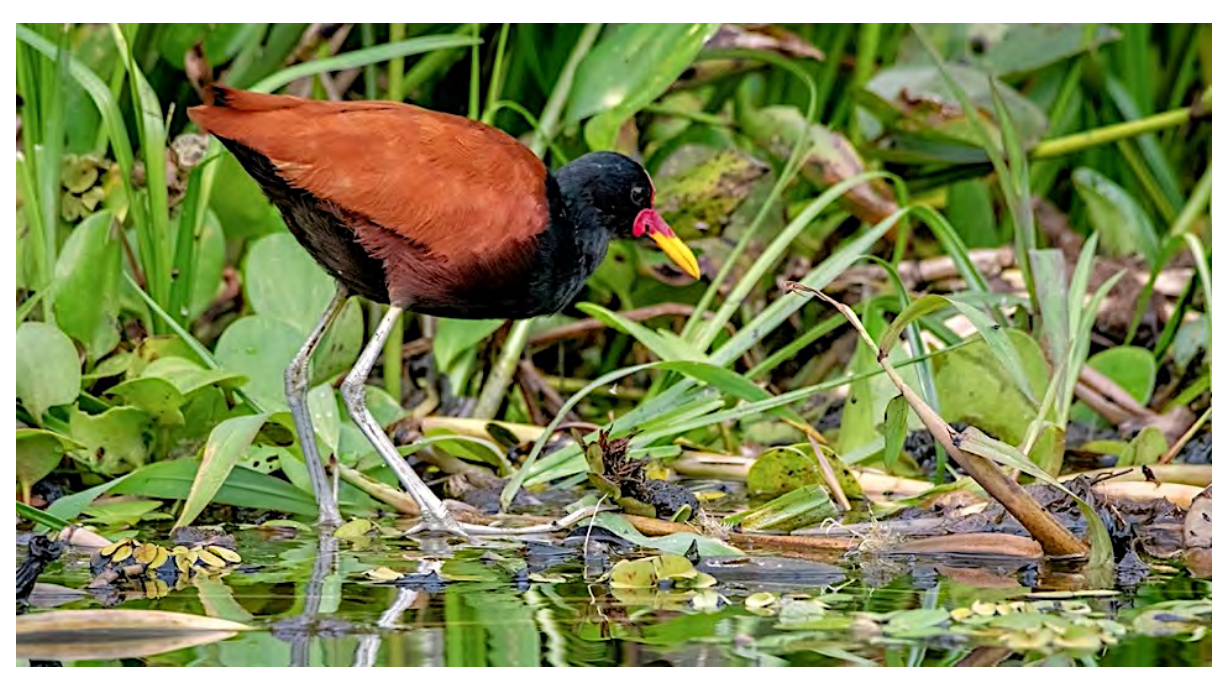
The Pantanal is known for large concentrations of water birds such as herons, egrets and storks, but we'll also be watching for smaller inhabitants such as the Wattled Jacana.

Dark-throated seedeaters, Unicolored and Scarlet-headed blackbirds, Orange-backed Troupial, and Golden-winged Cacique), and the hot, humid Pantanal may well constitute the highlight of the trip. On this trip we'll be birding the southeastern corner of the Pantanal with Pousada Aguape and Fazenda San Francisco as our bases.