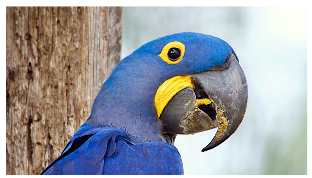
The magnificent Hyacinth Macaw is always a highlight when we visit the Pantanal. We're sure to see these beauties at Pousada Aguape.