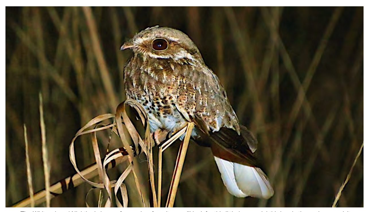
The White-winged Nightjar is known from only a few sites; we'll look for this little-known nightbird and others when we visit Emas National Park.

Days 8-9, Sat-Sun, 23-24 Sep. Parque Nacional das Emas. Our birding at Emas will vary from leisurely walks along the river into woodland and through expanses of open grassland, to drives in a safari vehicle (with much stopping and starting) on dirt roads through the park. We will also do some night driving for nightjars and mammals. Nights in Chapadao de Ceu.