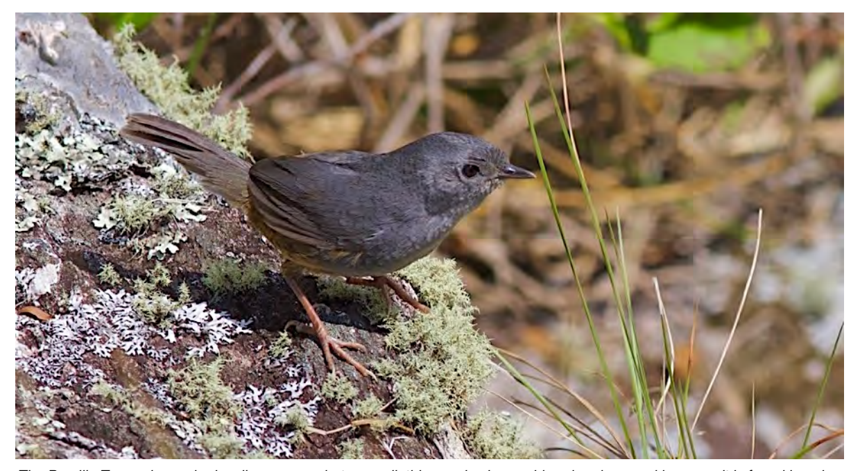
The Brasilia Tapaculo can be locally common, but over-all, this species is considered endangered because it is found in only a small region of Brazil. We've seen this range-restricted specialty in Canastra on recent Field Guides tours.