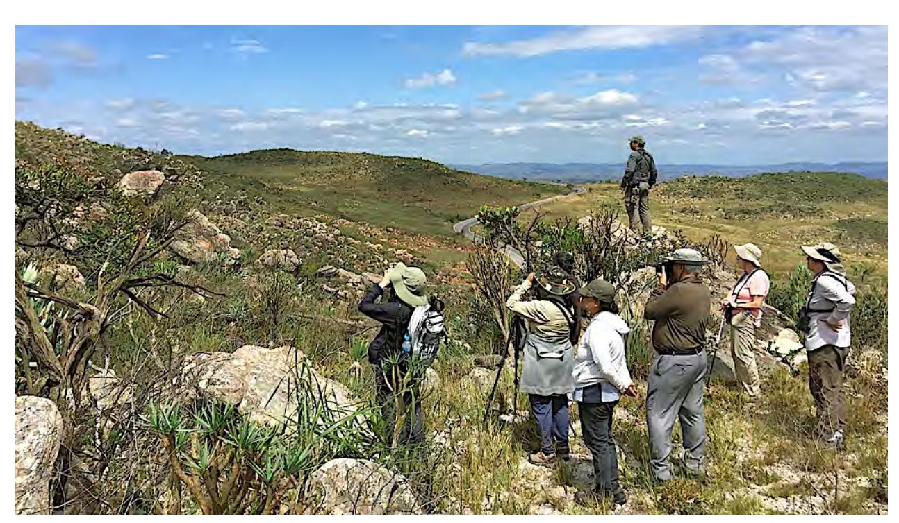
A Field Guides group searches for Cipo Canastero in Parque Nacional Serra do Cipo.