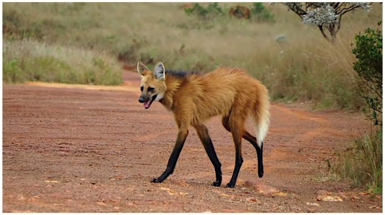
The wonderful Maned Wolf is a distinctive canid found in grassland habitats of central South America. We'll likely see these beautiful animals near Caraca.

Our tour is designed to sample the avian highlights of Brazil's Central Plateau (Planalto Central) and of the vast Pantanal, the low-lying drainage of the upper Paraguay River. We also visit the magnificent Serra do Cipo and Serra do Caraca, isolated ranges in central Minas Gerais state, supporting several restricted endemics as well as a more widespread avifauna characteristic of the humid Atlantic-coast forests which here spill over westward toward the plateau. The itinerary includes several parks rarely visited by other organized birding tours and harboring such rarities and specialties as Lesser Nothura, Bare-faced Curassow, White-winged Nightjar, Horned Sungem, Hyacinth Visorbearer, the recently described Cipo Canastero, Large-tailed Antshrike, Serra Antwren, the recently described Rock Tapaculo, Graybacked Tachuri, Swallow-tailed Cotinga, Helmeted Manakin, Gray-eyed Greenlet, White-striped Warbler, Yellow-billed Blue Finch, Pale-throated Pampa-Finch, Cinereous Warbling-Finch, and a host of rare and brightly colored seedeaters.