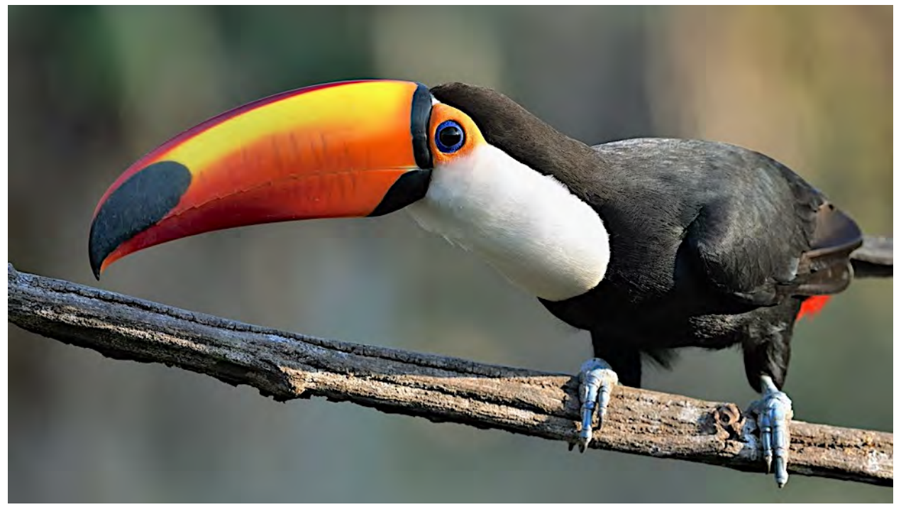
We'll get some great views of birds such as the colorful and charismatic Toco Toucan on this tour. These are the largest of the toucans, and while they are not rare, they are spectacular!

We include here information for those interested in the 2023 Field Guides Safari Brazil tour: