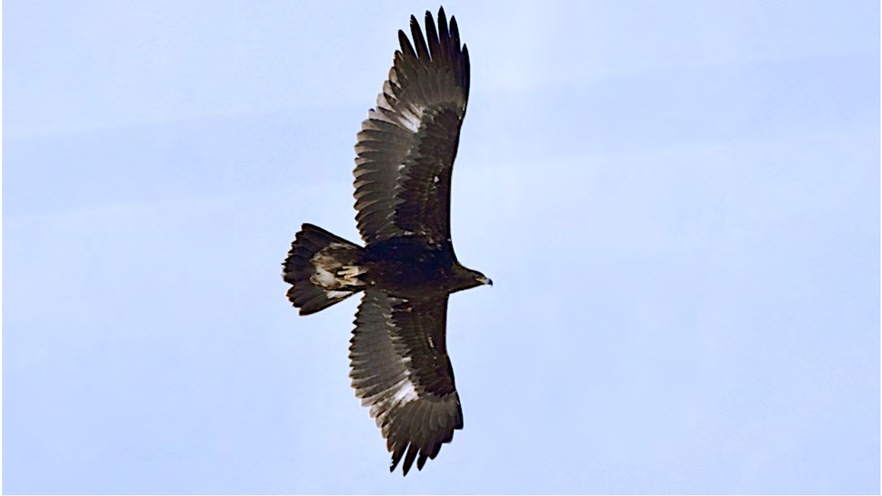
This tour is very good for raptors, and we'll be sure to keep our eyes on the skies as we drive so that we do not miss sights such as this immature Golden Eagle. Fifteen species of hawks, eagles, falcons, and vultures are possible!

Day 8, Fri, Apr 18. Montrose to Grand Junction. Our day will begin with a visit to the spectacular Black Canyon of the Gunnison National Park, where Dusky Grouse can be seen as they perform their nearly inaudible (to us), deep booming song. Other possibilities at this unheralded gem of a national park are the “Slate-colored” subspecies of Fox Sparrow, White-throated Swift, Mountain Bluebird, Townsend’s Solitaire, and Spotted Towhee. Lower elevations here hold Pinyon Jay and Juniper Titmouse. After a morning of birding, we’ll head northwestward, making concerted efforts to find Sagebrush and Brewer’s sparrows on the Utah border. Other stops may find us Lewis’s Woodpecker (scarce) and waterbirds on several reservoirs along the way. Night in Grand Junction, Colorado.