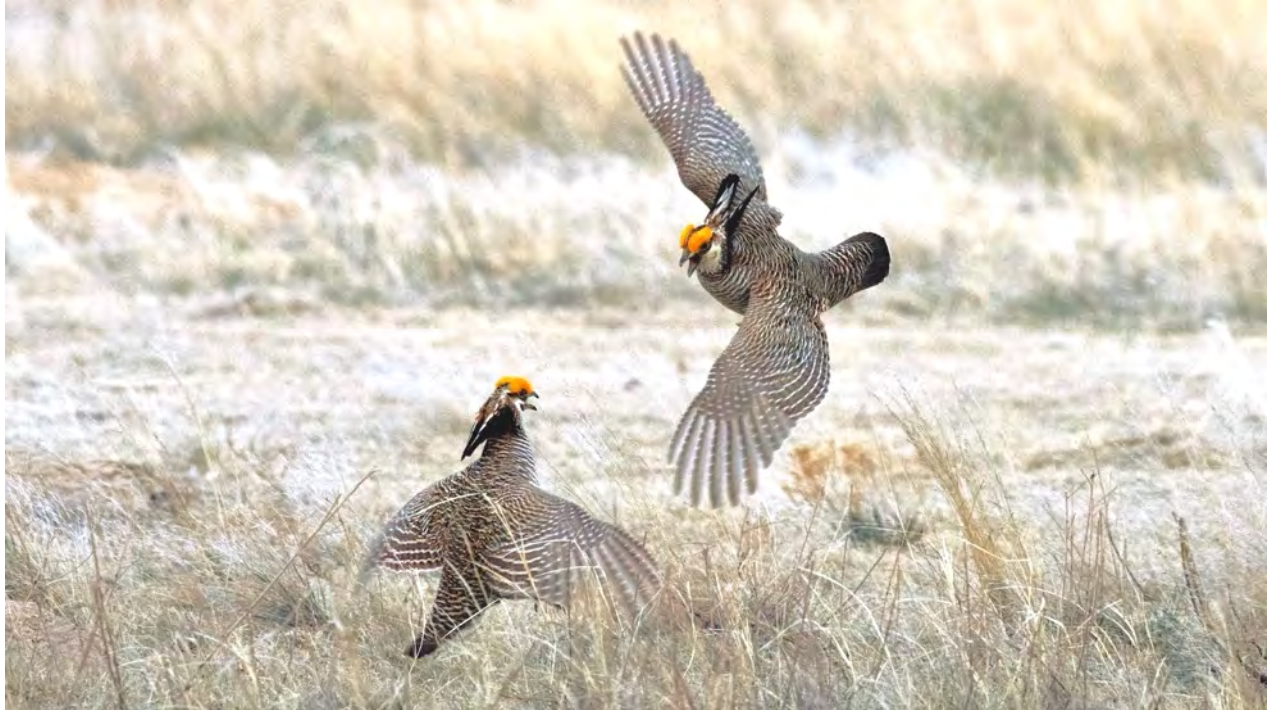
One of our primary goals on this tour is to observe lekking grouse in action, so on several days we will be out and in the field before dawn. We'll hope to catch some activity such as these male Greater Prairie-Chickens in battle.

We include here information for those interested in the 2025 Field Guides Colorado Grouse tour: