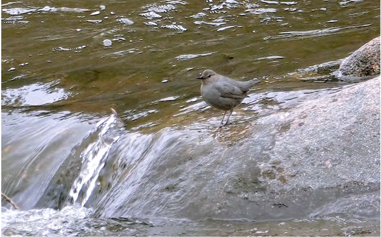
We'll be in a great area to find the American Dipper. These charismatic songbirds are only found on fast-moving, pollution-free streams in the western US, where invertebrate prey is abundant.

In addition, we'll take the opportunity to compare and contrast the birds of the various regions of the state: the Rockies, the eastern plains, and the intermountain basins (those broad valleys known as "parks"). But most importantly, we'll see Colorado grouse and prairie-chickens in their elaborate, boisterous, and colorful breeding displays, usually on "leks". We often see more than 140 bird species and 20 species of mammals by the end of the tour, and should have a better understanding of Colorado's birds and wildlife, mountains, and plains. Join us on this wonderful, action-packed tour in search of Colorado's grouse.