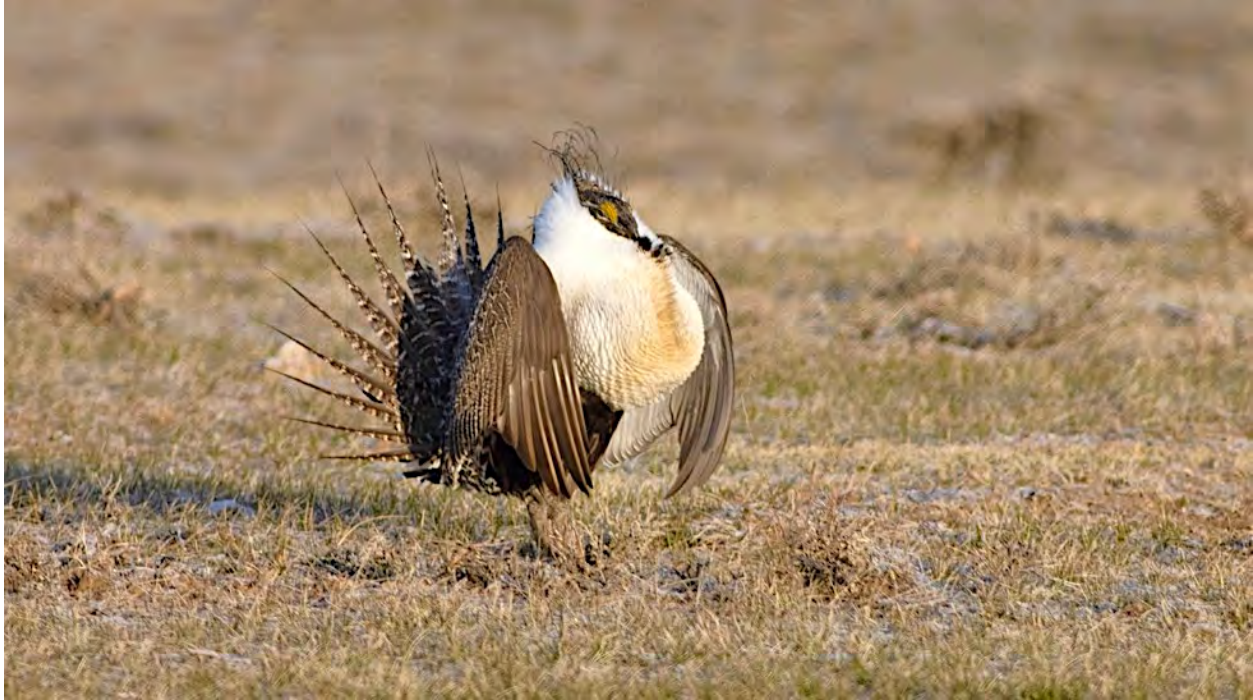
One of the final highlights of the tour will be a visit to a lek of Greater Sage Grouse, where we'll see the magnificent males strut their stuff!

Colorado Plateau: Plateaus, Mesas, and Valleys —The western portion of the state is the most dramatic and colorful section of Colorado. Our birding travels will take us to reservoirs and canyons such as Black Canyon of the Gunnison National Park and Colorado National Monument. We pass alongside the great rivers of western Colorado, including the Uncompahgre, Gunnison, and Colorado, enjoying panoramic views of western Colorado's most spectacular landscape features—the San Juan Mountains, Uncompahgre Plateau, and the granddaddy of them all, the Grand Mesa. Birdlife here is wonderfully diverse, with all three species of rosy-finches in the higher elevations and Gambel's Quail, Rock and Canyon wrens, Pinyon Jay, Juniper Titmouse, and Black-throated, Brewer's, and Sagebrush sparrows in the lower elevations.