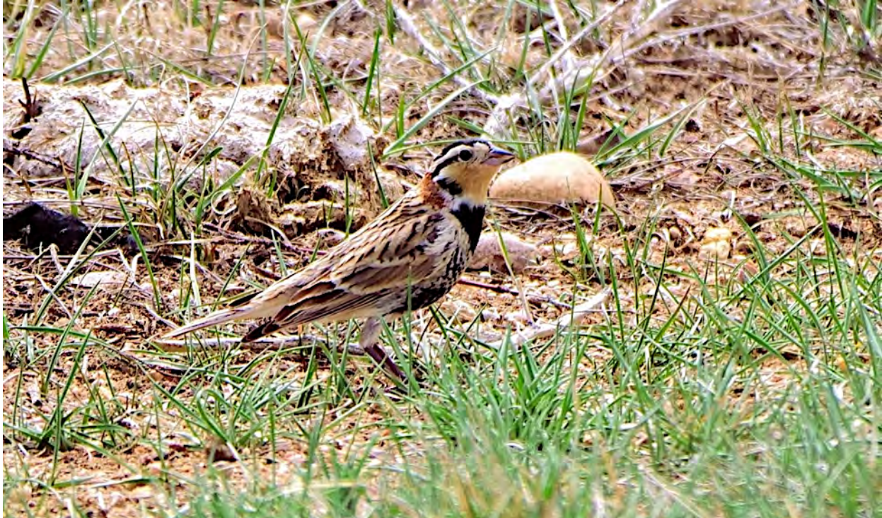
While the main focus of this tour is viewing grouse, we'll also have time to seek out prairie dwellers such as the Chestnut-collared Longspur.

Day 4, Mon, Apr 14. Eastern Plains to Wray. This is the day we've all been anticipating, our first experience at a lek. The rare Lesser Prairie-Chicken will be displaying as the sun rises. We'll need to be out very early to increase our chances for success. After (we hope) the excitement of seeing the prairie-chickens, we'll enjoy a hearty breakfast and then work our way northward and westward to Wray, Colorado. En route, we'll keep eyes peeled for Rough-legged and Swainson's hawks, Long-billed Curlew, and Eastern and Mountain bluebirds. We will cross from Central Time to Mountain Time today, gaining back the hour we lost yesterday. Night in Wray, Colorado.