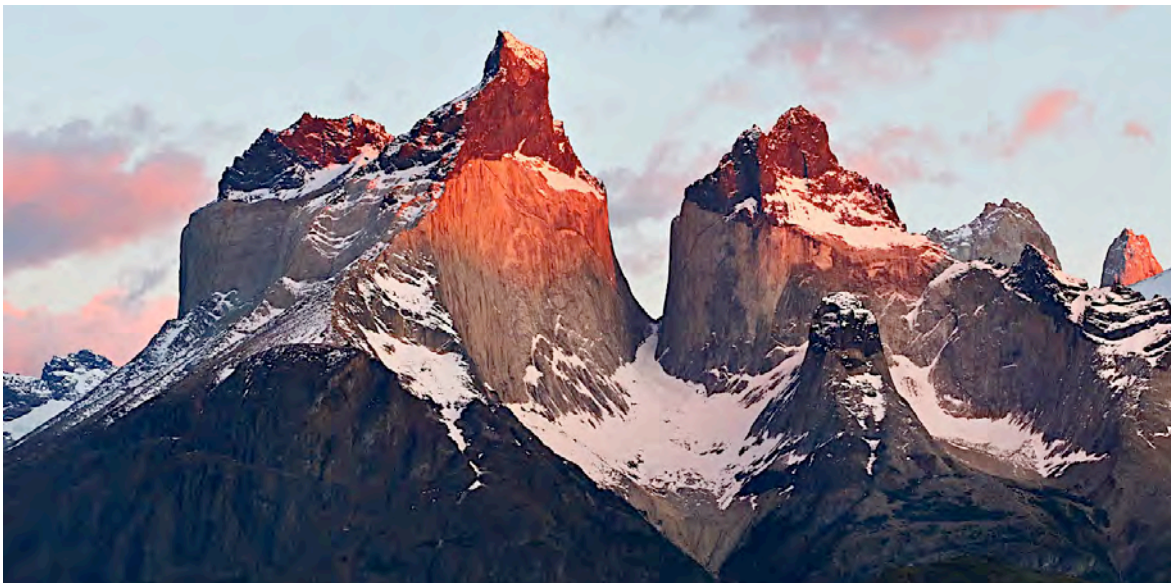
Chile has many different landscapes, but perhaps none are as iconic as the peaks of Torres del Paine.

The high puna is also favored by another camelid, the Vicuña, which has become quite rare in most parts of its range. Under the protection of the park (with curtailment of hunting and indiscriminate shooting), the Lauca population now numbers nearly 20,000 animals. Talus slopes and other rocky areas are frequented by Mountain Vizcachas, large rodents with soft, dense fur, long ears and tail, and big dark eyes.