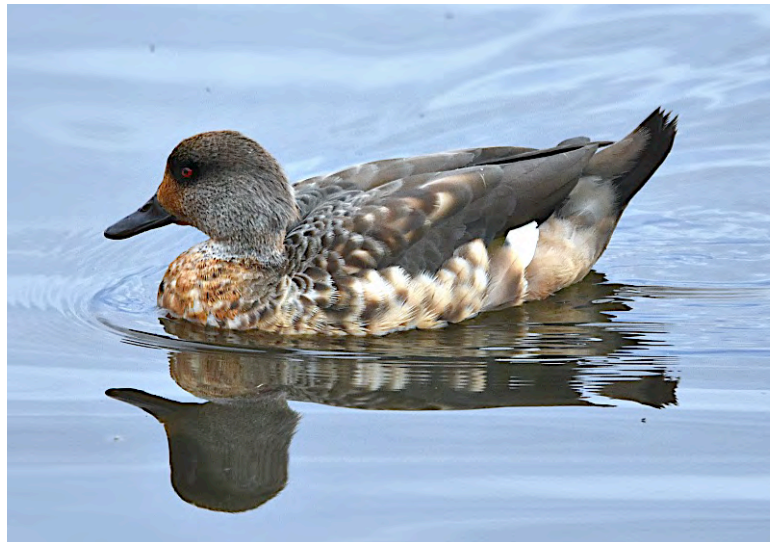
The Crested Duck is common over much of South America. We'll look for them at Lauca.

In this high Puna zone lives an exciting variety of wildlife, virtually all of which is viewable from the main park road. Grassy expanses support Ornate and Puna tinamous and the rare and endangered "Puna" Rhea, Rhea pennata tarapacensis , perhaps a full species distinct from the "Darwin's" Lesser Rhea, R. p. pennata , of the southern lowlands. In and around the numerous lakes and streams is an abundance of waterfowl and shorebirds, including Silvery