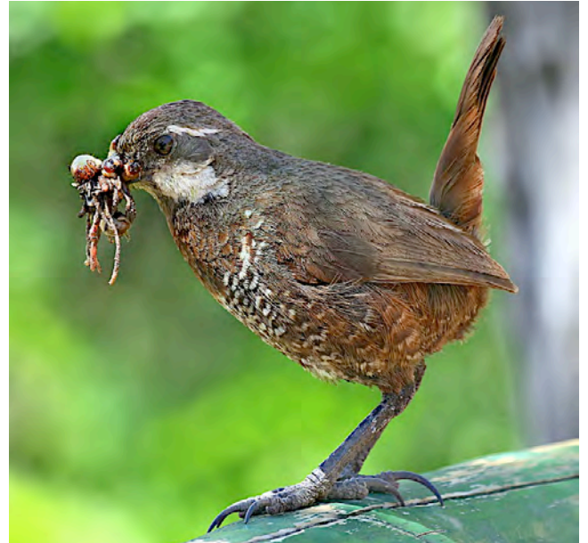
The Moustached Turca has large feet, likely for digging in the soil to create nesting burrows. This individual, seen on a recent Field Guides tour, is carrying food for young.

Waterfowl are a highlight of southern South America, and we should see hundreds of Black-necked Swans and smaller numbers of Coscorobas, as well as Andean, Ashy-headed, Ruddy-headed, and Upland geese, Flightless and Flying steamer-ducks, Red Shoveler, Torrent Duck, and many more. We'll also take a boat trip into the pelagic waters of the Humboldt Current, one of the world's top seabirding destinations, where we may see several species of southern albatrosses, petrels, shearwaters, and other oceanic birds.