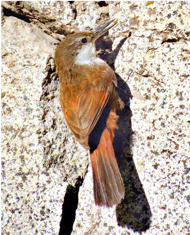
The endemic Crag Chilia is found on rocky slopes east of Santiago.

The coast of Valparaiso province and the farmland northwest of Santiago provides more Matorral habitat, where we shall try for anything we didn't see in the mountains. But the real highlights here are the small marshes sometimes teeming with waterfowl. Here we shall seek White-tufted Grebe, Stripe-backed Bittern, the gorgeous Black-necked Swan, Cinnamon Teal, Red Shoveler, Rosy-billed Pochard (rare), Yellow-billed Pintail, Lake and Black-headed (rare) ducks, Plumbeous Rail, Spot-flanked Gallinule, and Red-gartered, Red-fronted, and White-winged coots. Two species found in Scirpus marshes are the odd Wren-like Rushbird and the Many-colored Rush-Tyrant, perhaps the most beautiful Tyrant flycatcher. If water levels are right, we stand a pretty good chance of seeing the South American Painted Snipe near Santiago; this secretive bird is absent if it is too dry or too wet. The salinasi Black Rail was heard for the first time ever on our 2008 tour and seen in 2013!