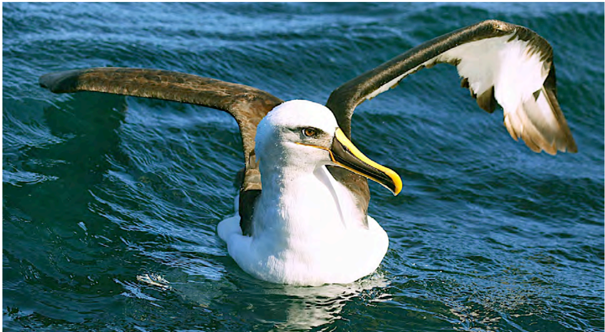
Buller's Albatross is one of the smaller albatrosses; we should see them on our pelagic trip from Valparaíso.

Termas de Chillan is a popular ski resort nestled in the Andes east of Concepción. Here we find the northern extension of Chile's Nothofagus (Southern Beech) forests. This region is rich in birdlife including such fine species as the Des Murs' Wiretail, Magellanic Tapaculo, White-throated Treerunner, Fire-eyed Diucon, Patagonian Tyrant and the wonderful Magellanic Woodpecker. Other treats we can see here include the Bicolored (Chilean) and the uncommon White-throated hawks. Certainly the species we will concentrate on is the elusive and colorful Chestnut-throated Huet-Huet, one of the biggest and fanciest of the tapaculos, as well as Patagonian Forest Earthcreeper, recently split from Scale-throated Earthcreeper. Be prepared for a wide variety of birds in Termas de Chillan.