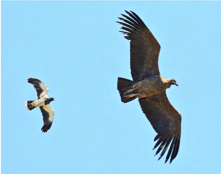
A Mountain Caracara chases a much larger Andean Condor, giving a good idea of just how huge the condor is!

Patagonia and Torres del Paine National Park —Punta Arenas, at 53° S latitude, is in the heart of Patagonian sheep ranching—and now oil-producing—country. Vast expanses of grassy steppe have been badly overgrazed by sheep and cattle, but where good grassland persists, the lowland form of the Lesser Rhea, Rhea pennata pennata , locally known as Ñandú, is still to be found in small parties on the open range. Here, too, are grazing flocks of Upland and Ashy-headed geese and occasionally overhead, scavenging Chilean Skuas, which patrol the grasslands and waterways almost everywhere in the Strait of Magellan area. Near the rocky shoreline are additional species, including Magellanic Penguin, Flying (and hopefully a Flightless or two!) Steamer-Duck, Magellanic Oystercatcher, and the striking Dolphin Gull.