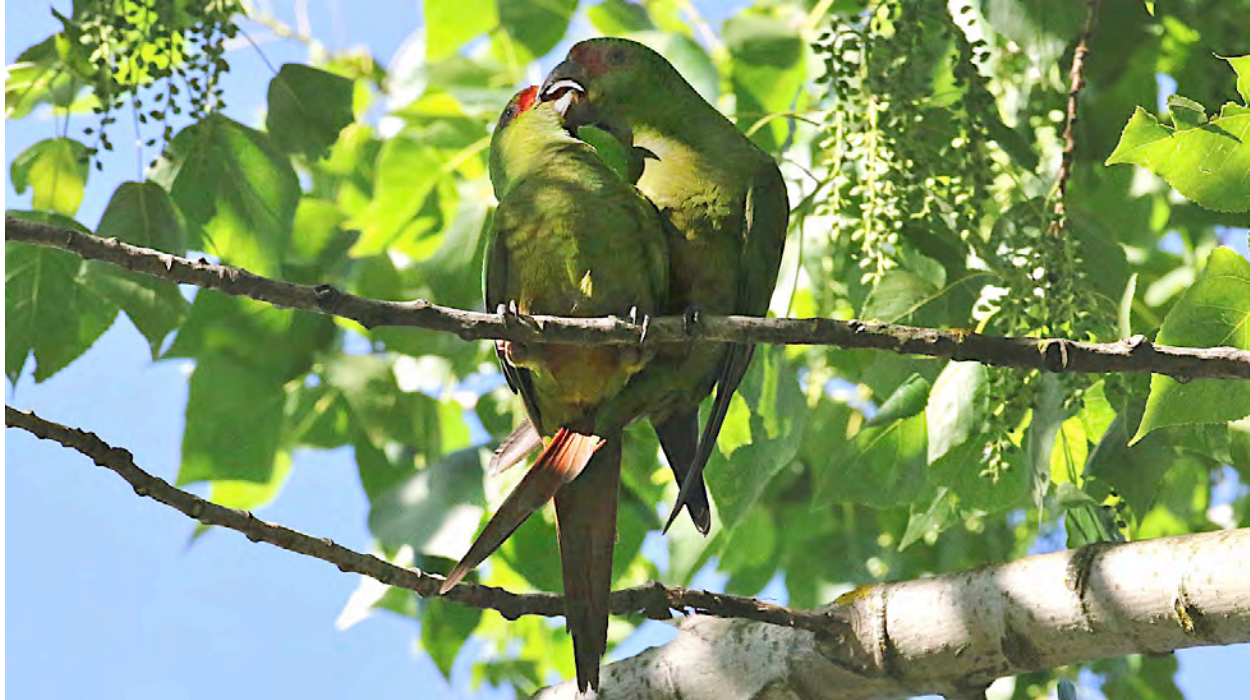
Slender-billed Parakeets are endemic to Chile, where they are found only in forests with Nothofagus and Araucaria trees. Their bills may be specially adapted to feeding on the fruits of these trees.

We include here information for those interested in the 2018 Field Guides Chile tour: