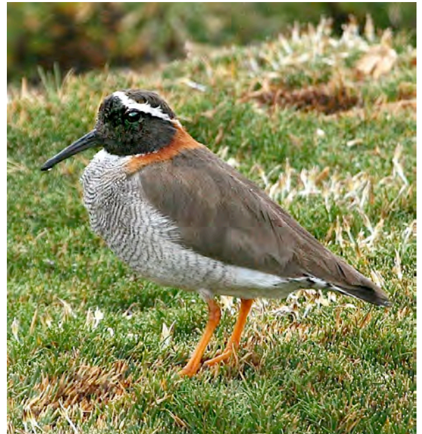
The Diademed Sandpiper-Plover is a special bird we'll seek in the Andes outside Santiago.

Day 16, Mon, 26 Nov. Fly to Arica and drive to Putre along the Rio Lluta Valley. Today we have a flight from Santiago to Chile's northernmost city, Arica. From here we'll travel by bus, birding our way up the Lluta Valley and eventually into the absolute desert. As we climb, the desert gradually begins to show signs of life, and by the time we reach Putre in the late afternoon, it will seem almost lush. After settling into our simple yet comfortable lodging (where we'll spend two nights), we'll bird the nearby slopes. Be prepared for a wide range of temperatures since we'll be climbing from sea level in the Atacama to 11,000 feet. Night in Putre.