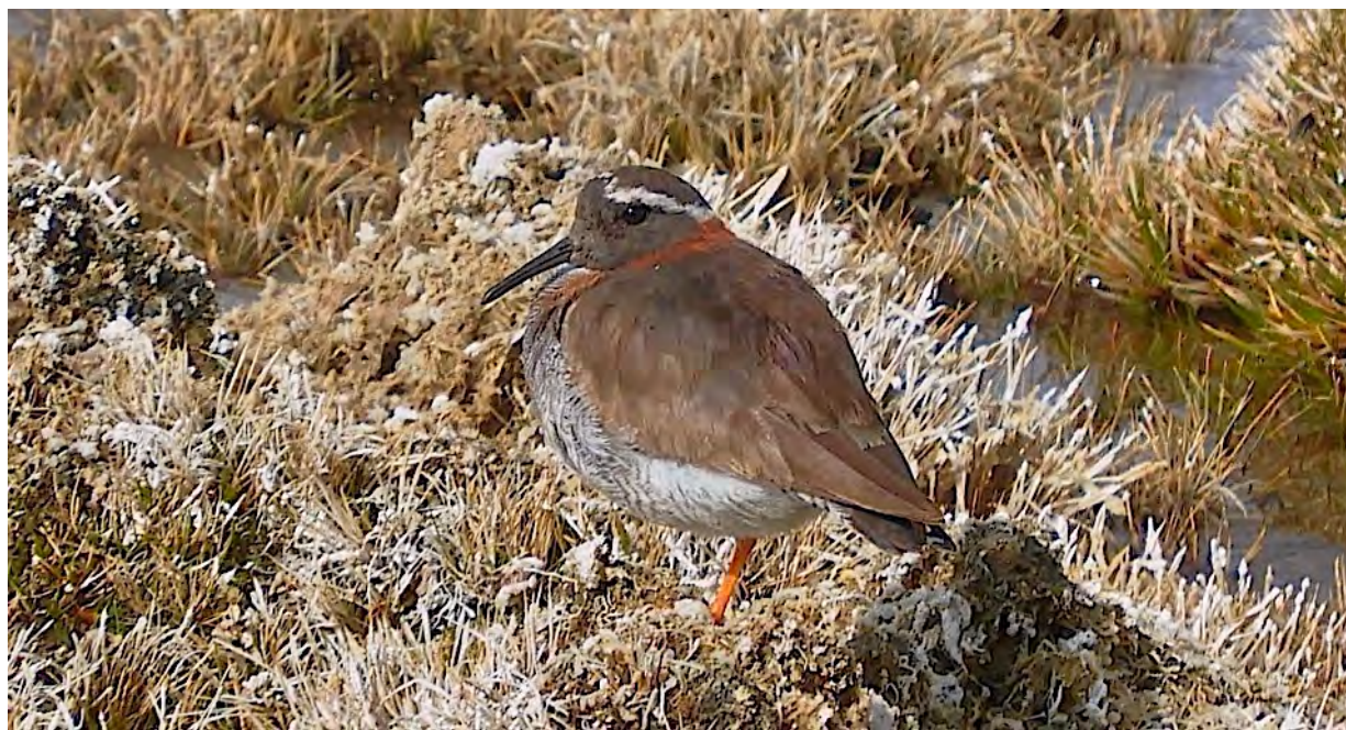
The Diademed Sandpiper-Plover is a shorebird found in high valleys of the southern Andes. We'll look for this beautiful bird in the Yeso Valley near Santiago, where this adult was seen on a previous tour.

prepared for a cool morning and sunny but cool temperatures in the highest areas. We'll hike for about 1.5 miles,. You will have the choice to opt out of the hike and stay at the vehicle with the driver. (If you are unsure about the activities on this day, please do not hesitate to contact our office.) We'll return to Santiago for dinner. Night in Santiago.