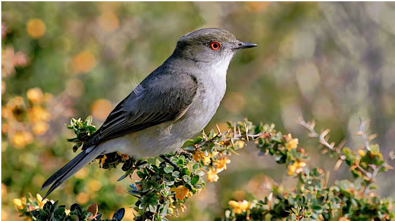
The Fire-eyed Diucon is a tyrant flycatcher found in the Nothaphagus forest region of Chile and Argentina.

Termas de Chillan is a popular ski resort nestled in the Andes east of Concepción. Here we find the northern extension of Chile's Nothofagus (Southern Beech) forests. This region is rich in birdlife including such fine species as the Des Murs' Wiretail, Magellanic Tapaculo, White-throated Treerunner, Fire-eyed Diucon, Patagonian Tyrant and the wonderful Magellanic Woodpecker. Other treats we can see here include the Chilean Hawk, split from Bicolored and the uncommon White-throated hawks. Certainly, the species we will concentrate on is the elusive and colorful Chestnut-throated Huet-Huet, one of the biggest and fanciest of the tapaculos, as well as Patagonian Forest Earthcreeper, recently split from Scale-throated Earthcreeper. Be prepared for a wide variety of birds in Termas de Chillan, even some night birding.