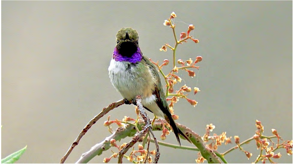
The Chilean Woodstar is an endangered endemic found in only a few high valleys in the northern coastal region near Arica. Though these tiny birds can be difficult to find, we've had good luck on recent tours.

But perhaps the bird of Yeso is the Diademed Sandpiper-Plover, Phegornis mitchellii , its generic name meaning bird of splendor. This high-elevation shorebird embodies characteristics of both plovers and sandpipers, and its beautiful plumage combined with its genuine rarity have made it one of the most sought-after of Andean birds. Yeso is a particularly good place for seeing the sandpiper-plover because much of the bird's favored bog/stream habitat occurs not far from the road and at a somewhat lower elevation than elsewhere in the bird's range. Finding this species will be a high priority.