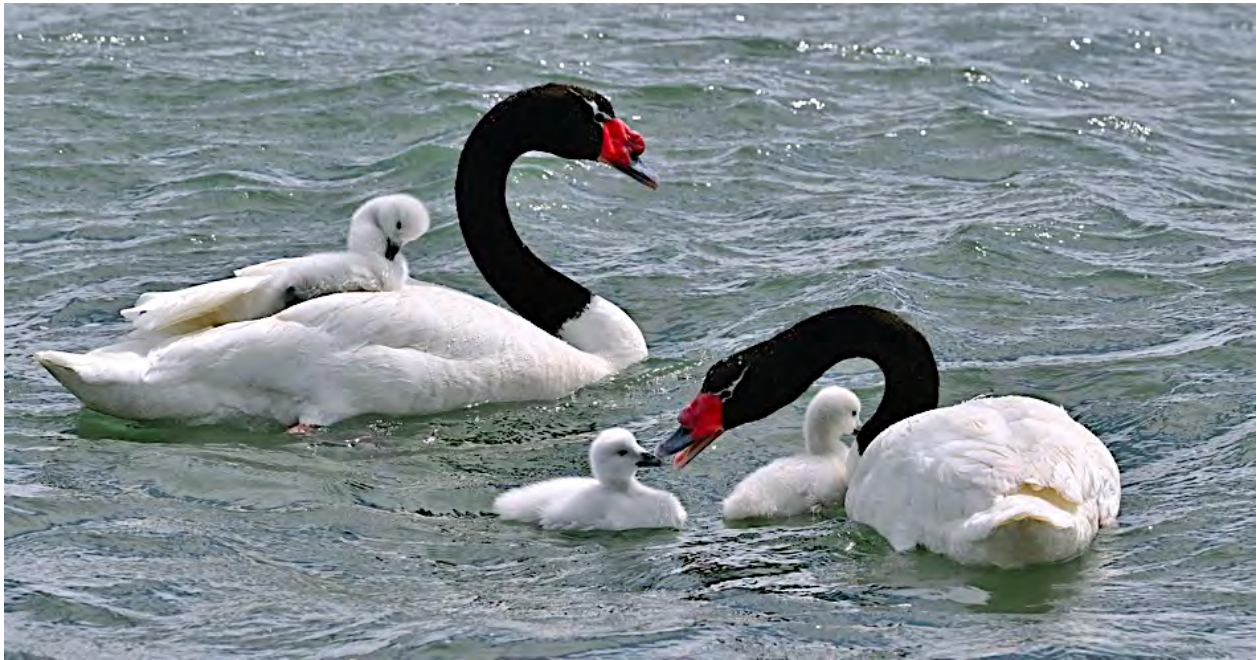
Black-necked Swans may have families in tow when we visit. These large swans can be found in both fresh and brackish waters, so we should have several chances to see them.

Our tour will record approximately 270 species of birds, a manageable number even for those new to the Bird Continent. Among these are widespread southern species, but also several in the ranks of the most unusual on the continent and many others that are little known or of very local distribution, such as Lesser Rheas (of both races/species?), Chilean Tinamou, Giant Coot, Rufous-chested Dotterel, Diademed Sandpiper-Plover, Magellanic Plover, Chilean Pigeon, Slender-billed Parakeet, White-sided Hillstar, Chilean Woodstar, the huge Magellanic Woodpecker, Creamy-rumped Miner, White-throated and the newly split Patagonian Forest earthcreepers, Des Murs' Wiretail, Black-throated and Chestnut-throated huet-huets, Moustached Turca, White-throated Tapaculo, Cinnamon-bellied Ground-Tyrant (and seven other breeding ground-tyrants), Patagonian Tyrant, Ticking Doradito, Rufous-tailed Plantcutter, Greater Yellow-Finch, and White-throated Sierra-Finch.