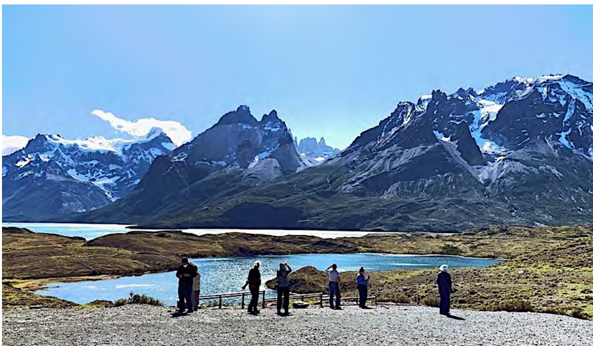
We will bird in some of the most spectacular scenery in the world. Here, a Field Guides group visits a beach at Torres del Paine National Park.

Day 5, Tue, 14 Nov. Morning in Sierra Baguales; to Torres del Paine National Park. We will spend the morning birding the scenic and very interesting area of Sierra Baguales before heading to Torres del Paine. At Sierra Baguales we hope to find such birds of note as Yellow-bridled Finch, Cinnamon-bellied Ground-Tyrant, and maybe the scarce White-throated Caracara. We'll also have a shot at Austral Rail today. We will spend the night near the park in a hotel with a full view of a Lake and a glacier. Night in Torres del Paine.