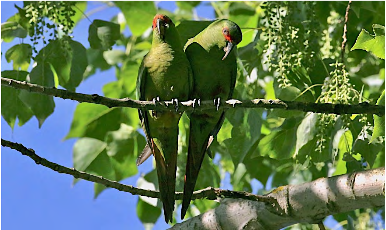
The Slender-billed Parakeet is a Chilean endemic found primarily in the Araucaria and Nothofagus forests. We will have a couple of chances to find these interesting birds.

Puerto Montt and the coastline of Los Rios —Situated at one of the wettest places on the planet, Puerto Montt is the gateway to the fjords of the southern portion of Chile's coastline. We will land here and then head for some local patches of forest before staying overnight in Puerto Varas. The next day we will drive northward towards Temuco. Our route will take us off the Panamerican Highway and along the coastline for a short while where we will bird a few estuaries and the Rio Tolten that flows into the Pacific, before heading back inland to Temuco. Special birds here may include Snowy-crowned Tern, Spectacled Tyrant, Slender-billed Parakeet, Many-colored Rush-Tyrant, South American Stilt (Black necked), flocks of shorebirds including Lesser Yellowlegs and Hudsonian Godwit, and Red-legged Cormorant.