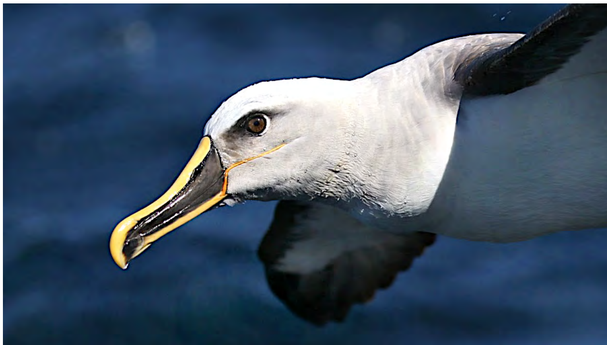
Near Vina del Mar and Valparaiso, we'll take a pelagic trip where we'll see oceanic travelers such as this Buller's Albatross, as well as species that stay closer to land.

Day 11, Mon, 20 Nov. Flight to Santiago; drive to Vina del Mar. We will drive from Termas de Chillan to the coastal city of Concepción from which we will take the hour-long flight to Santiago. If time permits, we will quickly visit some coastal wetlands near Concepción. After an afternoon arrival, we will drive two hours to Vina del Mar on the coast via a side road to look for some of the central Chilean endemics such as White-throated and Dusky tapaculos, Dusky-tailed Canastero, and Chilean Mockingbird. Night in Vina del Mar.