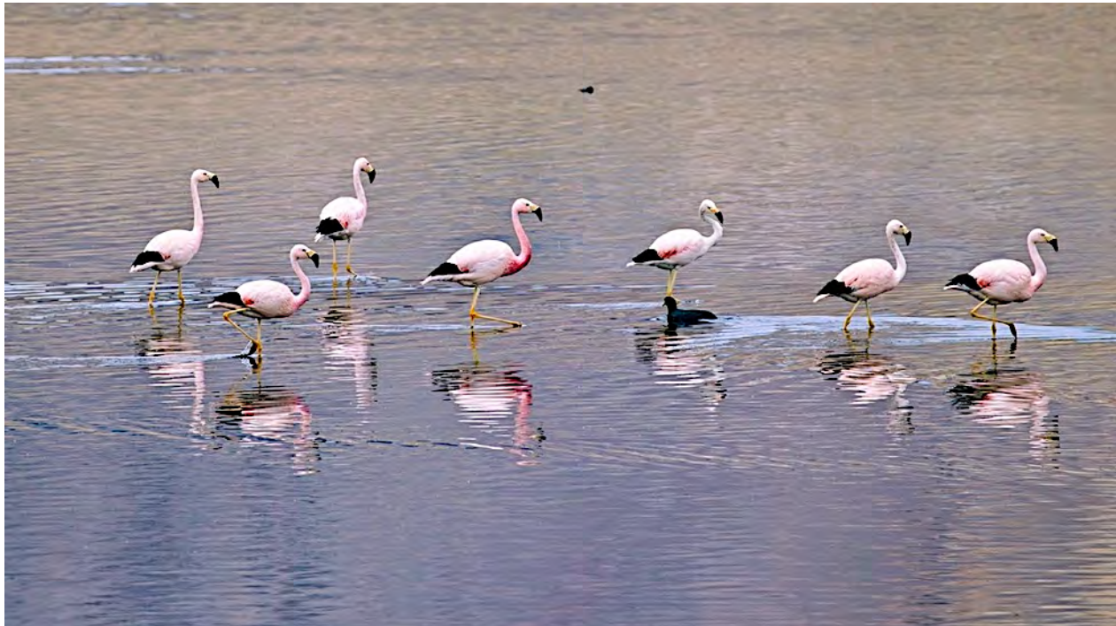
We may see three species of flamingos at at Lago Chungará. These are Andean Flamingos, but we may also find Chilean and Puna flamingos as well.

The snow-capped Nevados de Putre, a massive pair of ancient volcanoes, form an impressive backdrop for the village of Putre, at 11,000 feet in the high temperate zone of the Andes. The area is characterized by dry hills and gullies sparsely covered with Polylepis , shrubs, grasses, and cacti. This type of habitat and the irrigated terraces around town support a number of interesting birds such as Variable (Red-backed) Hawk, Bare-faced and Black-winged ground-doves, Giant Hummingbird (at nearly nine inches, the largest of all hummers), Andean Hillstar, Buff-breasted Earthcreeper, Streaked Tit-Spinetail, Spot-billed Ground-Tyrant, White-browed Chat-Tyrant, Yellow-billed Tit-Tyrant, Chiguanco Thrush, Mourning and Ash-breasted sierra-finches, Greenish Yellow-Finch, and Hooded Siskin. Some of the local specialties of this zone are, Creamy-breasted and Canyon canasteros, White-throated and Straight-billed earthcreepers, Blue-and-yellow Tanager, Black-throated Flowerpiercer, Golden-billed Saltator, and Black-hooded Sierra-Finch. The Andean Deer, or Taruca ( Hippocamelus antisensis ), is occasionally seen on the brushy slopes in this area as well.