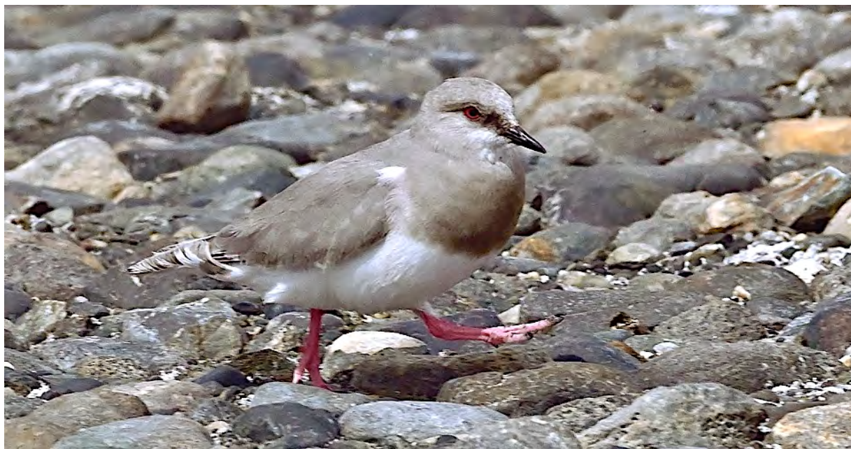
The odd but beautiful Magellanic Plover is an austral specialty we'll seek in Tierra del Fuego.

We include here information for those interested in the 2023 Field Guides Chile tour: