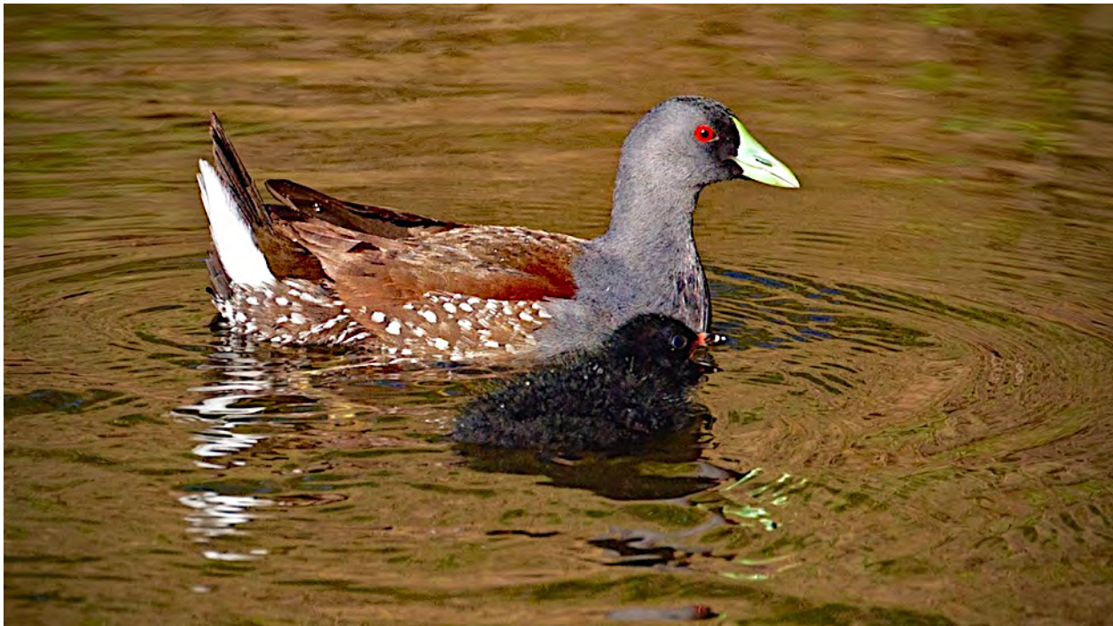
Spot-flanked Gallinule is one of the wetland birds we’ll watch for in the marshes of the central coast near Valparaíso, where this parent and chick were seen on a recent Field Guides tour.

The coast of Valparaíso province and the farmland northwest of Santiago provides more Matorral habitat, where we shall try for anything we didn’t see in the mountains. But the real highlights here are the small marshes sometimes teeming with waterfowl. Here we shall seek White-tufted Grebe, Stripe-backed Bittern, the gorgeous Black-necked Swan, Cinnamon Teal, Red Shoveler, Rosy-billed Pochard (rare), Yellow-billed Pintail, Lake and Black-headed (rare) ducks, Plumbeous Rail, Spot-flanked Gallinule, and Red-gartered, Red-fronted, and White-winged coots. Two species found in Scirpus marshes are the odd Wren-like Rushbird and the Many-colored Rush-Tyrant, perhaps the most beautiful Tyrant flycatcher. If water levels are right, we stand a good chance of seeing the South American Painted Snipe near Santiago; this secretive bird is absent if it is too dry or too wet. The salinasi Black Rail was heard for the first time ever on our 2008 tour and seen in 2013!