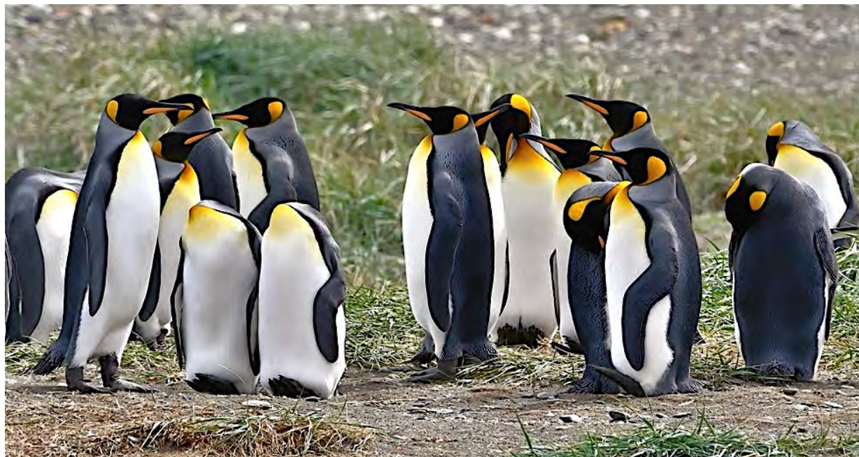
A small colony of King Penguins breeds on Tierra del Fuego, and we'll make a special trip to see them.

The high puna is also favored by another camelid, the Vicuña, which has become quite rare in most parts of its range. Under the protection of the park (with curtailment of hunting and indiscriminate shooting), the Lauca population now numbers nearly 20,000 animals. Talus slopes and other rocky areas are frequented by Mountain Vizcachas, large rodents with soft, dense fur, long ears and tail, and big dark eyes.