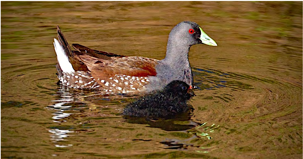
Spot-flanked Gallinule is one of the wetland birds we’ll watch for in the marshes of the central coast near Valparaiso, where this parent and chick were seen on a recent Field Guides tour.

The coast of Valparaiso province and the farmland northwest of Santiago provides more Matorral habitat, where we shall try for anything we didn’t see in the mountains. But the real highlights here are the small marshes sometimes teeming with waterfowl. Here we shall seek White-tufted Grebe, Stripe-backed Bittern, the gorgeous Black-necked Swan, Cinnamon Teal, Red Shoveler, Rosy-billed Pochard (rare), Yellow-billed Pintail, Lake and Black-headed (rare) ducks, Plumbeous Rail, Spot-flanked Gallinule, and Red-gartered, Red-fronted, and White-winged coots. Two species found in Scirpus marshes are the odd Wren-like Rushbird and the Many-colored Rush-Tyrant, perhaps the most beautiful Tyrant flycatcher. If water levels are right, we stand a good chance of seeing the South American Painted Snipe near Santiago; this secretive bird is absent if it is too dry or too wet. The salinasi Black Rail was heard for the first time ever on our 2008 tour and seen in 2013!