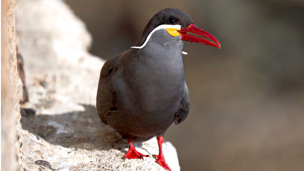
The beautiful Inca Tern can be found along the coast near Valparaíso.

Termas de Chillan is a popular ski resort nestled in the Andes east of Concepción. Here we find the northern extension of Chile's Nothofagus (Southern Beech) forests. This region is rich in birdlife including such fine species as the Des Murs' Wiretail, Magellanic Tapaculo, White-throated Treerunner, Fire-eyed Diucon, Patagonian Tyrant and the wonderful Magellanic Woodpecker. Other treats we can see here include the Chilean Hawk, split from Bicolored and the uncommon White-throated hawks. Certainly, the species we will concentrate on is the elusive and colorful Chestnut-throated Huet-Huet, one of the biggest and fanciest of the tapaculos, as well as Patagonian Forest Earthcreeper, split from Scale-throated Earthcreeper. Be prepared for a wide variety of birds in Termas de Chillan, even some night birding.