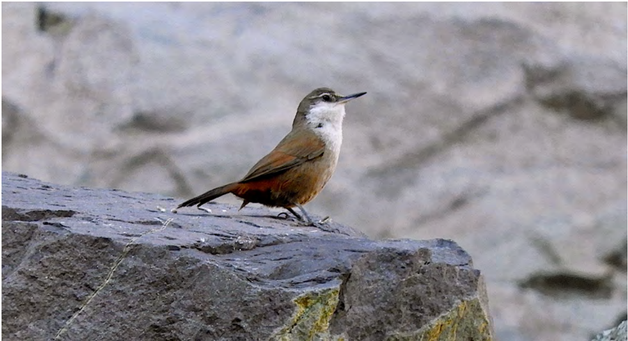
The Crag Chilia is an endemic, found in a narrow band in central Chile. We'll make a special effort to find it when we visit the Yeso Valley, south of Farellones.