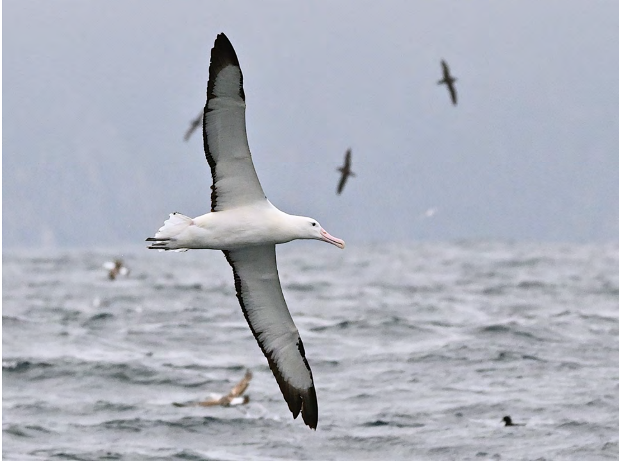
Near Vina del Mar and Valparaiso, we'll take a pelagic trip where we'll see oceanic travelers such as this Royal Albatross, as well as species that stay closer to land.

Day 11, Mon, 25 Nov. Drive from Chillan to Santiago. We will spend the full day driving from Termas de Chillan to Santiago, with several stops along the way. This will give us an opportunity to look for the Burrowing Parakeet and Chilean Tinamou, both of which are getting scarcer and more difficult to find in the usual places at Farellones. Night in Santiago.