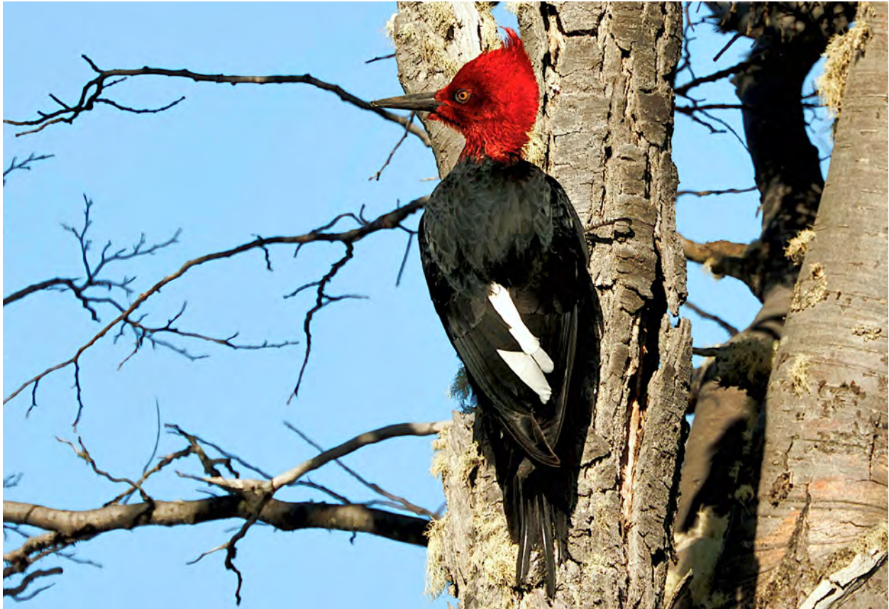
The imposing and beautiful Magellanic Woodpecker is an austral specialty we'll seek in Tierra del Fuego.

We include here information for those interested in the 2024 Field Guides Chile tour: