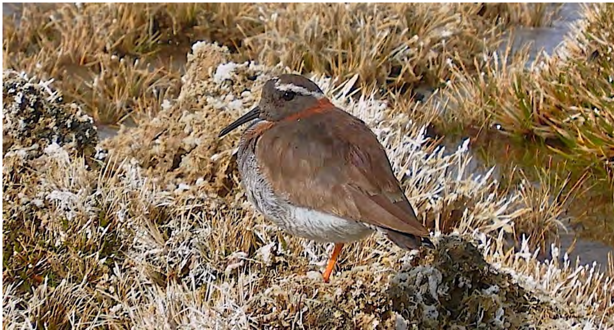
The Diademed Sandpiper-Plover is a shorebird found in high valleys of the southern Andes. We'll look for this beautiful bird in the Yeso Valley near Santiago, where this adult was seen on a previous tour.

Day 15, Fri, 29 Nov. Coastal birding and back to Santiago. Today we'll bird to the coast and return to Santiago, but in a roundabout and birdy way. We'll visit several sites on the coast, possibly the mouth of the Maipo River where gulls and terns roost, as well as some coastal marshes that may be teeming with waterbirds. Back at Santiago, we'll give a try at Cartagena wetlands again. Night in Santiago.