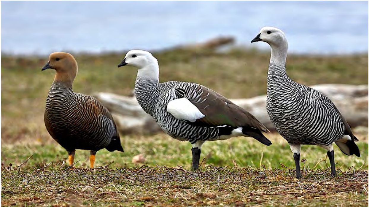
Upland Geese are one of several species we'll see that exhibit extreme sexual dimorphism. The darker female is seen here with two males.

Our tour will record approximately 270 species of birds, a manageable number even for those new to the Bird Continent. Among these are widespread southern species, but also several in the ranks of the most unusual on the continent and many others that are little known or of very local distribution, such as Lesser Rheas (of both races/species?), Chilean Tinamou, Giant Coot, Rufous-chested Dotterel, Diademed Sandpiper-Plover, Magellanic Plover, Chilean Pigeon, Slender-billed Parakeet, White-sided Hillstar, Chilean Woodstar, the huge Magellanic Woodpecker, Creamy-rumped Miner, White-throated and the newly split Patagonian Forest earthcreepers, Des Murs' Wiretail, Black-throated and Chestnut-throated huet-huets, Moustached Turca, White-throated Tapaculo, Cinnamon-bellied Ground-Tyrant (and seven other breeding ground-tyrants), Patagonian Tyrant, Ticking Doradito, Rufous-tailed Plantcutter, Greater Yellow-Finch, and White-throated Sierra-Finch.