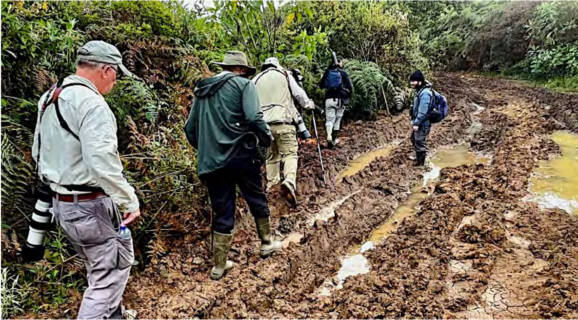
We'll do a lot of walking, and sometimes the tracks may be quite muddy.

We want to be sure you are on the right tour! Below is a description of the physical requirements of the tour. If you are concerned about the difficulty, please contact us about this and be sure to fully explain your concerns. We want to make sure you have a wonderful time with us, so if you are uncomfortable with the requirements, just let us know and we can help you find a better fitting tour! Field Guides will not charge you a change or cancellation fee if you opt out within 10 days of depositing.