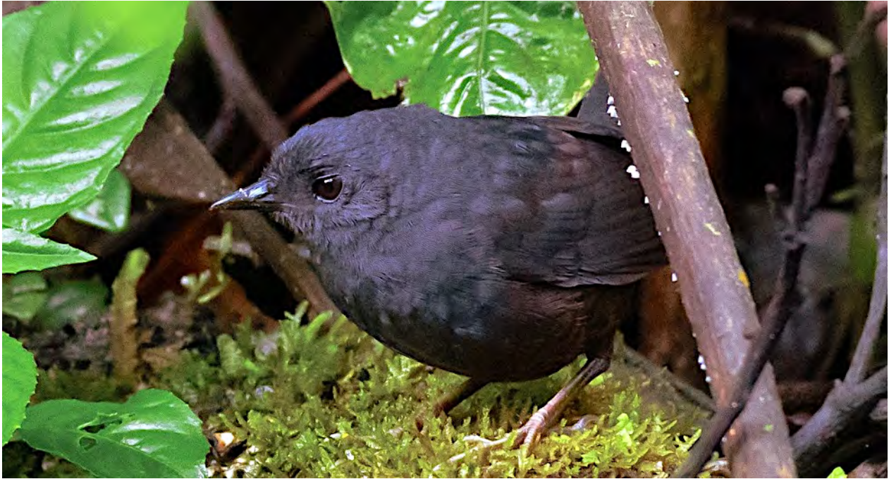
Stile's Tapaculo is a Colombian endemic that we'll look for at the Chestnut-capped Piha Reserve.

antpittas, Chestnut-breasted and Sooty-headed wrens, and Olive Finch, and where there is a good spot, we will try to see them. Depending on our success (especially as it relates to the weather), we will likely have time to try a different road that reaches slightly higher elevations where Munchique Wood-Wren and Tanager Finch occur, but we will concentrate on specialties of RNA Las Tangaras first.