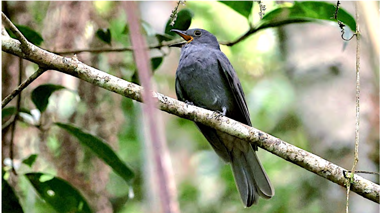
The Chestnut-capped Piha is found in only a few specialized localities in Colombia. One of these is the ProAves Chestnut-capped Piha Reserve, which protects a population of this critically endangered endemic.

We include here information for those interested in the 2024 Field Guides Colombia's Central Andes: The Wild, Wonderful North tour: