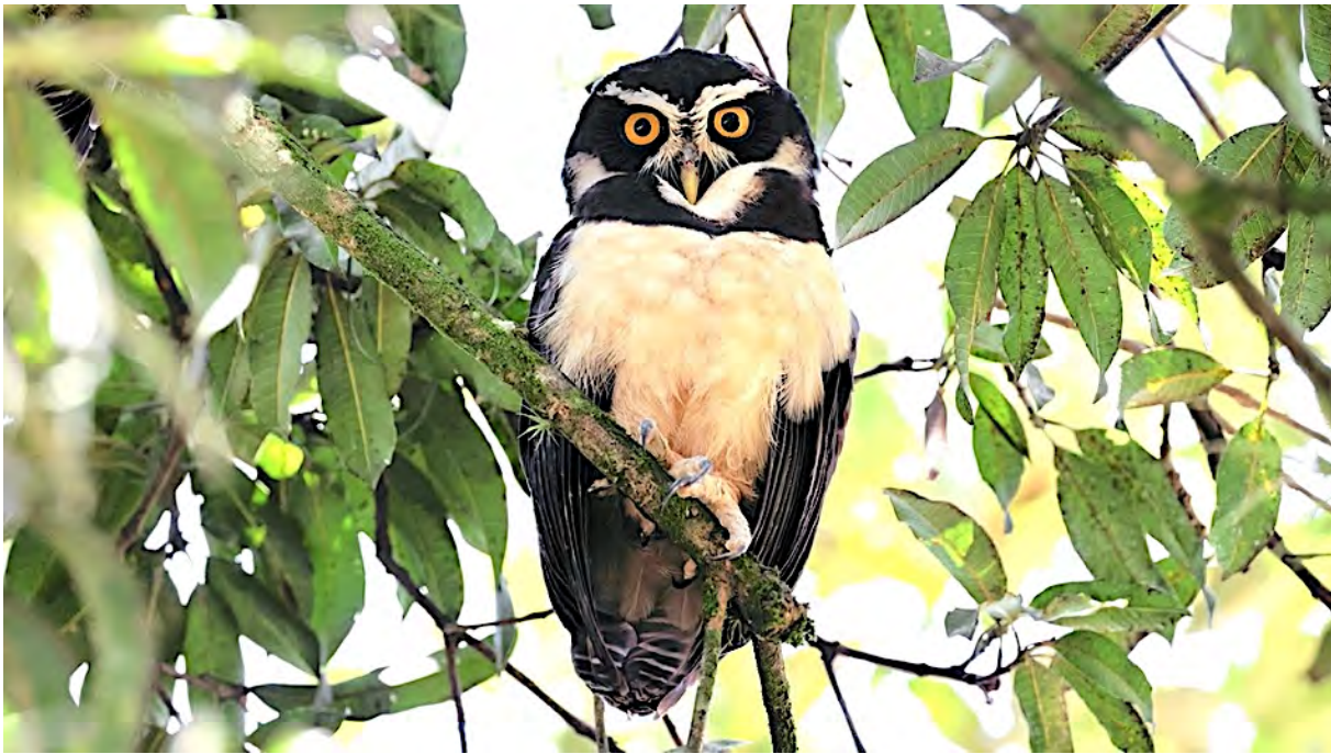
This gorgeous Spectacled Owl was seen near the Las Tangaras reserve on our 2022 tour. These owls are widespread, but seeing them is not an every-day event!

Day 5, Wed, 3 Jul. To RNA Las Tangaras. We will start with breakfast on the lovely town square and then depart for our destination of RNA Las Tangaras. We might make some birding stops en route, certainly for bathrooms in the town of Bolivar (and maybe day-roosting Spectacled Owls!). Soon after leaving Bolivar, we will cross a low pass in the Western Andes arriving to the ProAves reserve, RNA Las Tangaras, and our lodge for the next three nights. Our plan will be to lunch here, then bird the grounds and nearby forest patches in the afternoon. Night at Las Tangaras.