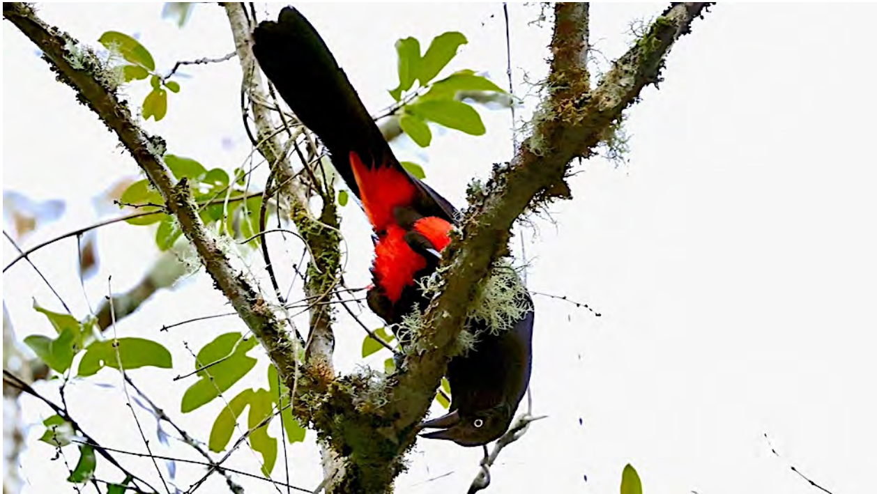
Another rare bird we'll seek is the Red-bellied Grackle, which is found in only a few cloud forest locations in Colombia.

As for the adjectives, "juicy" is really obvious, but it is also right on target. This tour is going to be fun, visiting a terrific variety of birdy forests with really juicy birds, many of them endemics in remote regions of the Western and Central Andes. While "remote" suggests hardship, and there are some simple lodges and the challenges of birding in rainy regions, there is also ease and comfort—our gateway is a city of millions served by major international airlines. And good birds are not always remote birds—one of the classiest endemics of Colombia, the Red-bellied Grackle, occurs in the hills above Medellín. It is also a list that is still growing, with Antioquia Wren described from the Cauca Valley since we started the tour and a rediscovery of the Antioquia Brushfinch. Colombia is well known to Field Guides clients, and if you are looking for a single-visit sampler, this 12-day itinerary traverses almost 10,000' (3000m) of elevation and two of its cordilleras, crossing two major river valleys (the Río Medellín and Cauca River), in pursuit of a dazzling variety of tropical birds.