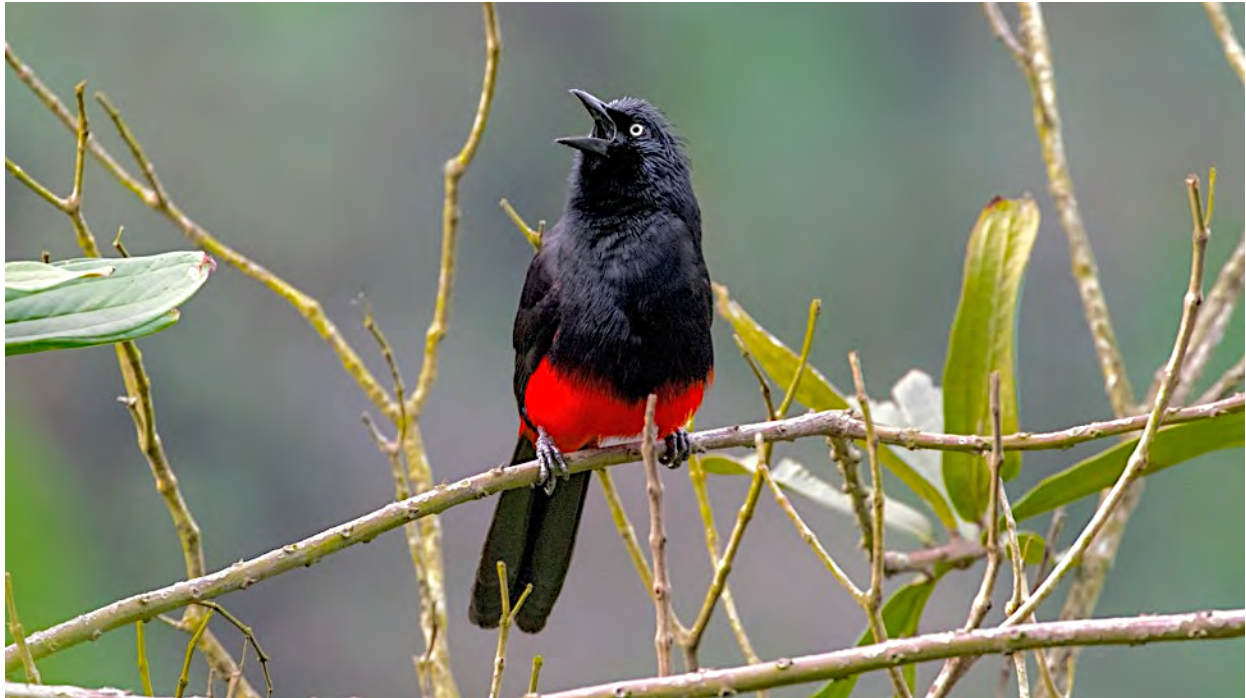
The Red-bellied Grackle is found in only a few specialized localities in Colombia. We'll look for them above Medellín and near Jardín.

We include here information for those interested in the 2026 Field Guides Colombia's Central Andes: The Wild, Wonderful North tour: