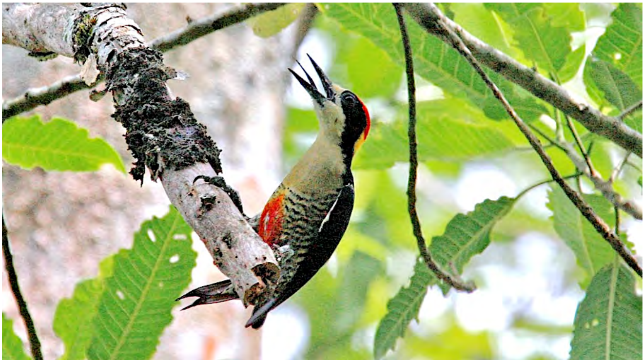
The aptly-named Beautiful Woodpecker is a species we'll watch for at El Palacio de los Frijoles.

Day 8, Sat, 4 Jul. To San Pedro de los Milagros. We will plan on departing Las Tangaras after breakfast, with some birding stops and lunch, and depart in the afternoon for San Pedro de los Milagros. We will either stay in the city center or below the town, closer to Medellín (about 45 minutes away). We will arrive in the late afternoon and get settled into our hotel for the night. Night in San Pedro de los Milagros.