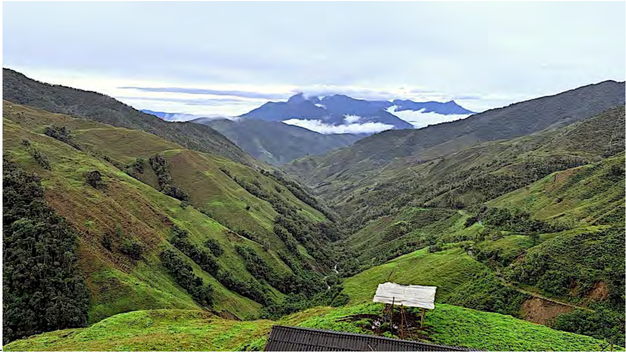
We'll visit a ProAves reserve known as Las Tangaras, where we'll look for cloud forest specialties, among others.