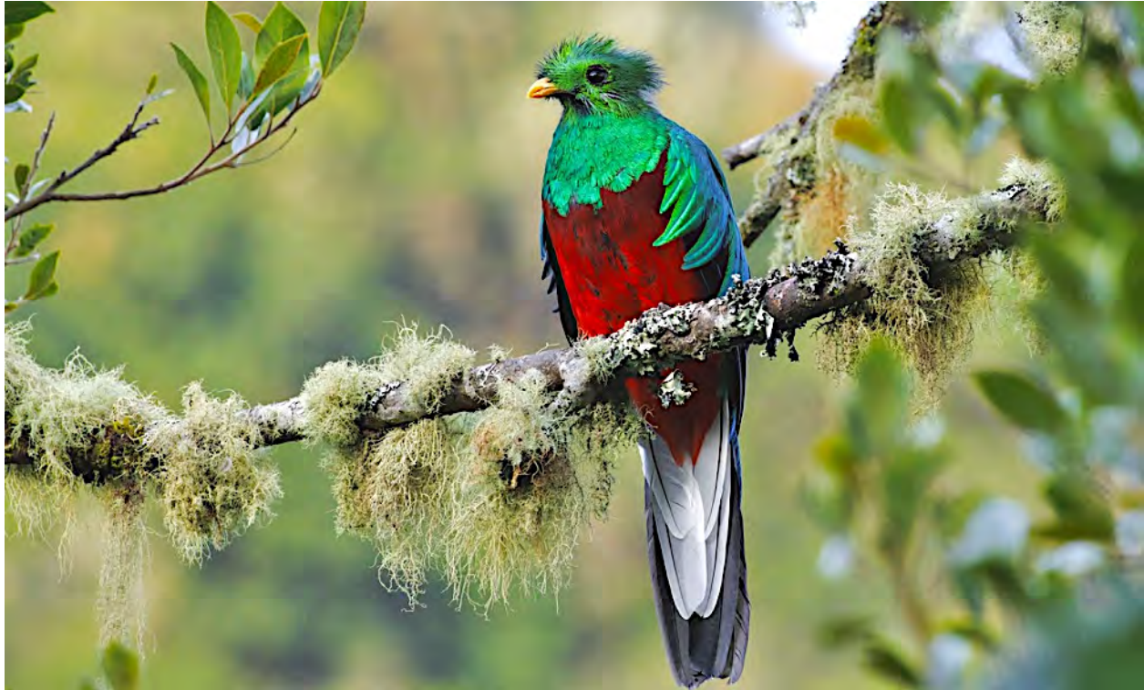
The Resplendent Quetzal is a wonderful example of the tropical birdlife awaiting us in Costa Rica. The list of potential sightings includes four motmots, five toucans and nine trogons, as well as many other amazing birds.

We include here information for those interested in the 2026 Field Guides Costa Rica tour: