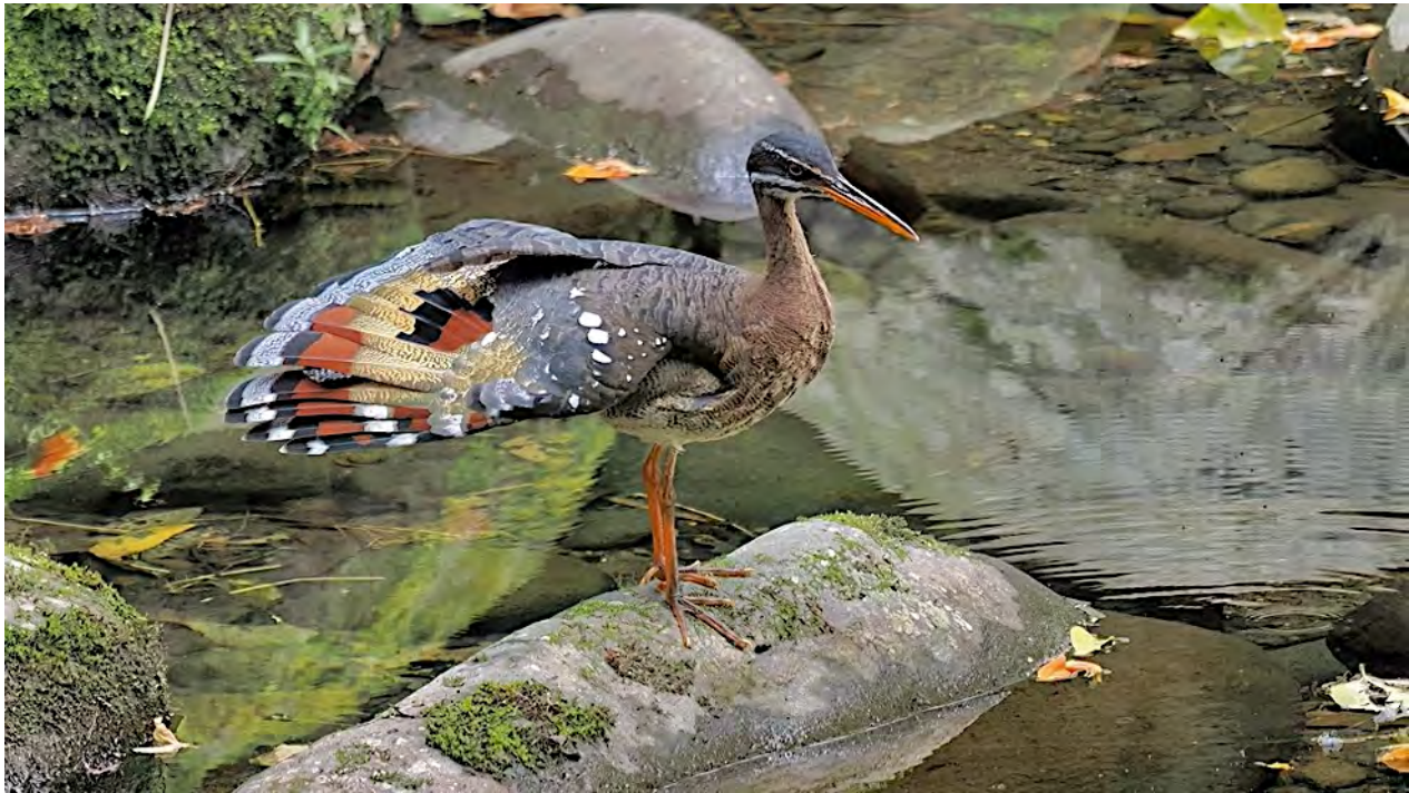
The elegant Sunbittern is often seen along the streams near Rancho Naturalista.

This tour will sample nearly all of Costa Rica's major habitats and seek out many of the endemics and specialties of the area. We'll spend some time at two different sites in the lush forests of the Caribbean foothills—Braulio-Carrillo National Park and Rancho Naturalista—where possibilities include Black-crested Coquette, Green Thorntail, the local Snowcap, Lattice-tailed Trogon, Dull-mantled Antbird, White-throated Shrike-Tanager, Blue-and-gold and Emerald tanagers, and even Lanceolated Monklet. Farther down the Caribbean slope, we'll visit the Rio Sarapiquí region and La Selva Biological Station. A focus for many of the tropical studies in the country today, the preserve and surrounding area at La Selva are home to an impressive array of specialties, from the beautiful Great Green Macaw and Snowy Cotinga to Black-capped Pygmy-Tyrant and Black-throated and Canebrake wrens.