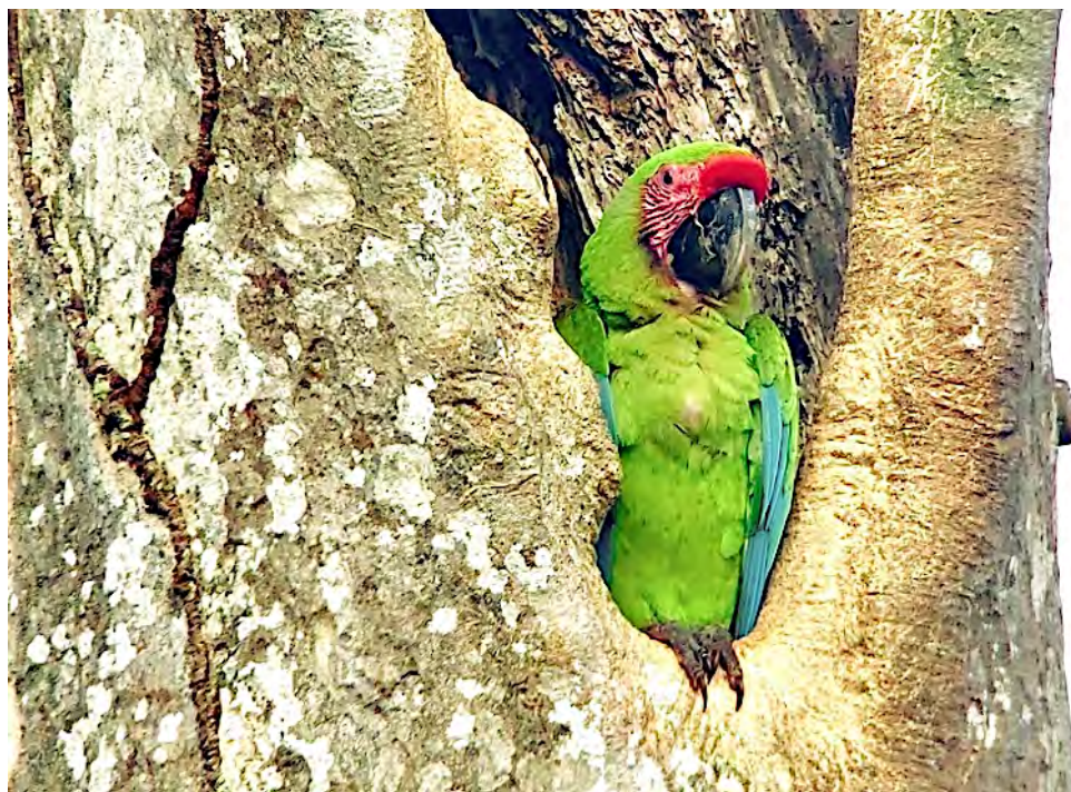
The Great Green Macaw is endangered throughout its range. We've been lucky enough to find this rare species on recent tours.

quarries. Fruit feeders could bring such treats as Prong-billed Barbet, and Spangle-cheeked and Silver-throated tanagers, while Silvery-fronted Tapaculo, Gray-breasted Wood-Wren, Slaty-backed Nightingale-Thrush, and Chestnut-capped Brushfinch are just some of the possibilities along the forest trails. We'll enjoy a restaurant lunch on the grounds before continuing downslope and into the lowlands, where we expect to arrive at our hotel in the late afternoon. Rain is a strong possibility today, and it would be wise to have an umbrella, poncho, or rain jacket handy. Night at La Quinta de Sarapiquí Lodge.