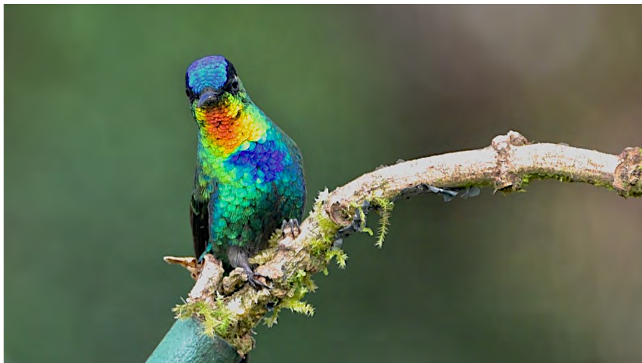
Costa Rica is home to many species of hummingbirds, including the spectacular Fiery-throated Hummingbird. This gem is a near endemic found in the highlands.

Black-faced Solitaire, Collared Redstart, Costa Rican Warbler, and Spangle-cheeked Tanager. Other avian attractions of the area include the famous Monteverde hummingbird feeders—where such dazzling birds as Lesser Violetear, Violet Sabrewing, Magenta-throated Woodstar, Stripe-tailed Hummingbird, Coppery-headed Emerald, Purple-throated Mountain-gem, and Green-crowned Brilliant may be seen at arm's length, and forest specialties from Chiriqui Quail-Dove, Prong-billed Barbet, and Streak-breasted Treehunter to Black-breasted Wood-Quail, Azure-hooded Jay, and Bare-shanked Screech-Owl are also sometimes found.