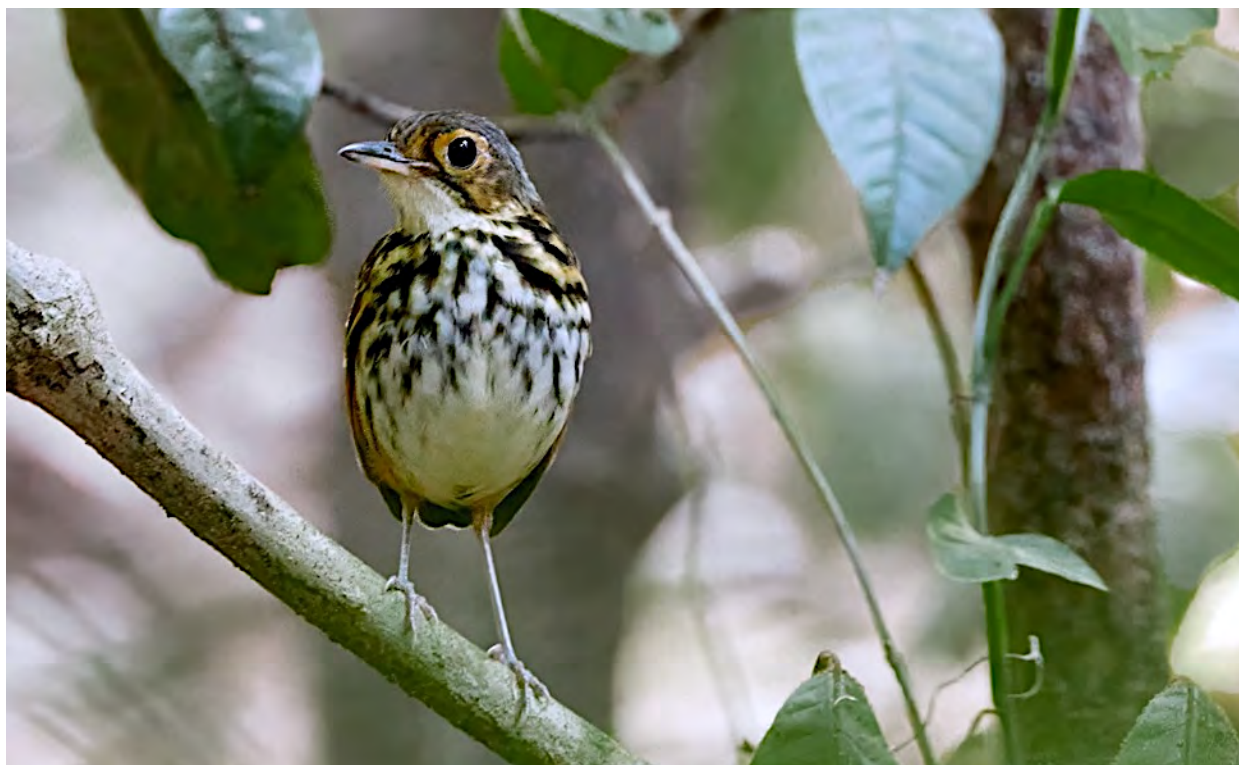
Streak-chested Antpitta is one of the birds we'll watch for in the Pacific lowlands at Carara Biological Reserve.

Volcano Junco. Our lodge is situated in beautiful, cool montane oak forest at about 7000 feet, and we sometimes have the good fortune of watching Resplendent Quetzals feeding in favored fruiting trees right behind our cabins!