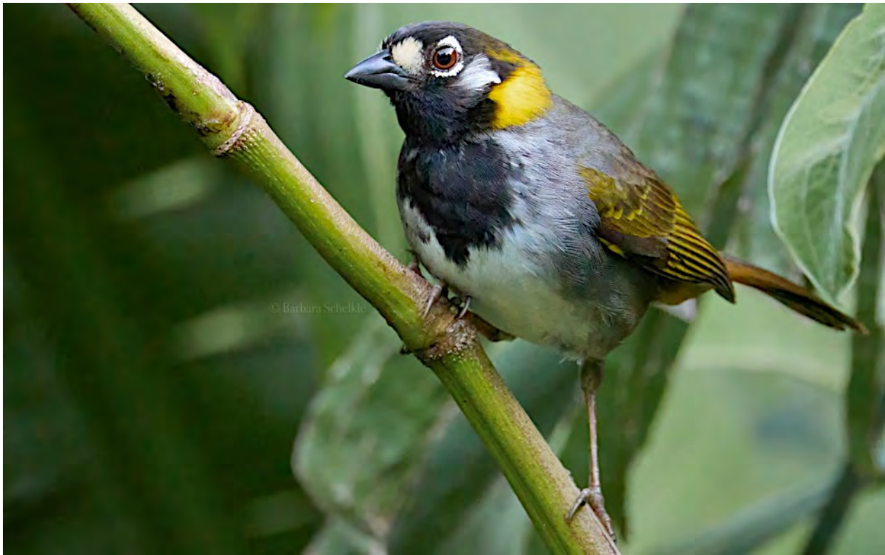
The White-eared Ground-Sparrow is an attractive species with a limited distribution in central America. In Costa Rica, we'll look for them at our accommodations in Monteverde.

Day 13, Thu, 19 Mar. Carara region; to Monteverde. We'll spend a final morning in the Carara area, searching for anything we've missed in the area. After the morning's birding and a final buffet lunch at Villa Lapas, we'll head north and inland towards Monteverde. We expect to arrive at our hotel by mid- to late afternoon and should have time for a ramble around the hotel's grounds, where Black-breasted Wood-Quail, Collared (Orange-bellied) Trogon, Elegant Euphonia, White-eared Ground-Sparrow, White-naped Brushfinch and Three-wattled Bellbird are possible. Night at Hotel Fonda Vela.