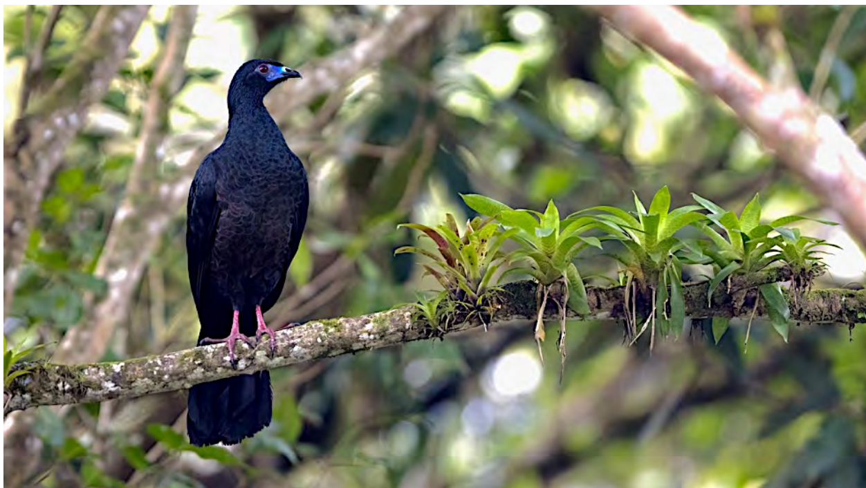
The Black Guan is restricted to the highland forests of Costa Rica and Panama. We'll visit Tapanti National Park where we've seen these birds on past tours.

up of ten to fifteen species or more), and these make for exciting (if sometimes frustrating!) birding. Around Rancho Naturalista, we'll be watching for such species as Bicolored Hawk, Gray-headed Chachalaca, the spectacular Sunbittern, Brown-hooded Parrot, Crimson-fronted Parakeet, Rufous-winged Woodpecker, Brown-billed Scythebill, Dull-mantled and Zeledon's antbirds, Thicket Antpitta, White-collared, White-ruffed, and White-crowned manakins, Tawny-chested and Slaty-capped flycatchers, Black-headed Tody-Flycatcher, Black-throated and Scaly-breasted wrens, Black-and-yellow, Crimson-collared, and Speckled tanagers, Scarlet-rumped Cacique, Chestnut-headed Oropendola, Chestnut-capped Brushfinch, and Black-headed Saltator. On the grounds of the lodge itself, hummingbirds—including such dazzling gems as Green and Stripe-throated hermits, Green-breasted Mango, Crowned Woodnymph, Green Thorntail, Black-crested Coquette, White-necked Jacobin, Green-crowned Brilliant, Violet-headed and Rufous-tailed hummingbirds, Snowcap, and Bronze-tailed Plumeleteer—visit feeders and flowering hedges, often only a few feet from the observer! Nearby areas we may visit from here offer up birds like Snail Kite, Limpkin, and Red-breasted Meadowlark, among many others.