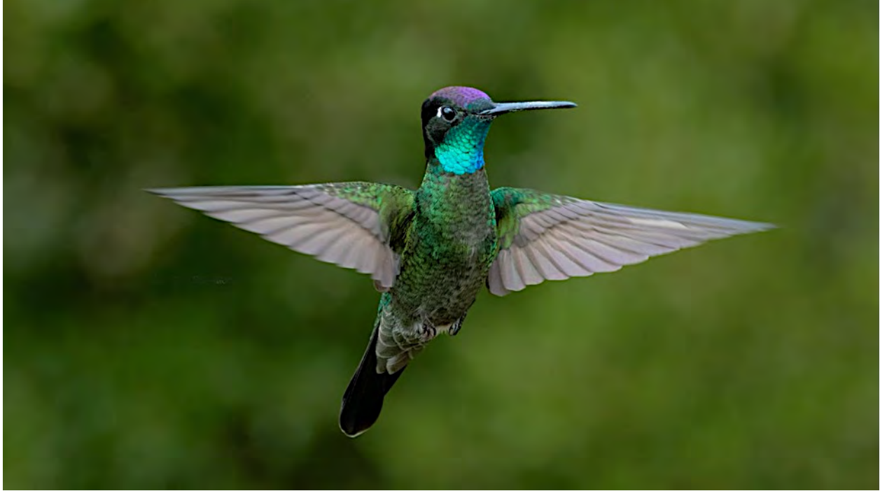
The Talamanca Hummingbird is a highland specialty that we'll seek along the Cerro de la Muerte.

Scaled Antpitta to Sharpbill among the possibilities, a visit here is always exciting! After a picnic lunch in the park, and a little early afternoon birding, we'll get back on the road, driving to the former capital of Cartago, before turning south and heading up the spine of the Talamanca Mountains, climbing to nearly 10,000' in elevation before descending the Pacific slope into the scenic Savegre Valley. Along the way we may make a birding stop or two along the roadside, as time permits, and we expect to arrive at the lodge just before dusk. Once again, rain is a possibility today, so keep your raingear handy. Comfortable footwear will suffice, as most of our birding will take place along graveled roads and trails. Night at Savegre Lodge or similar.