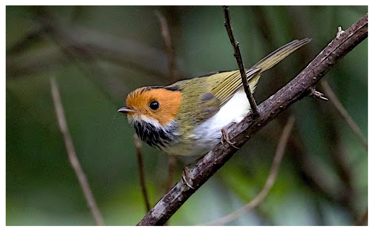
The tiny Rufous-faced Warbler is fairly widespread in China and other areas of eastern Asia. We'll have a chance to see these cuties when we visit Tangjiahe Nature Reserve.

Tangjiahe — Tangjiahe Nature Reserve is a large (40,000 hectare) protected area of hill forest (the land area of the preserve is 96% covered in forest) that is renowned as one of the best places for mammals in all of China, but it is also excellent for birding, and we should see an excellent array of both mammals and birds here. The rivers host Brown Dipper and Crested Kingfisher, and the evergreen forests are a refuge to the elusive but spectacular Golden Pheasant. Other birds here are Sichuan Leaf-Warbler, the range restricted and poorly known Zappey's Flycatcher, Speckled Wood-Pigeon, Mountain Bulbul, White-collared Yuhina, Chestnut-crowned Warbler, the skulky Blue Whistling-Thrush, Indian Blue Robin, Rufous-capped Babbler, Rufous-faced Warbler, Sooty Bushtit, and there is also a chance at the fantastic Temminck's Tragopan. We may even see some raptors, such as Oriental Honey-buzzard, migrating over the ridge here on their way to northern breeding grounds. The mammals mentioned above include Tibetan Takin, a large ungulate reminiscent (and related to) Muskox, which is restricted to just this region. In addition, mammals like Reeves' Muntjac, Tibetan Macaque, Chinese Goral, Wild Boar, Tufted Deer, and Serow are all possible. It is also one of the best places in China to look for Moon Bear (Asiatic Black Bear), and people have even seen the ever-elusive Giant Panda here (though this is a very difficult animal, and seldom seen in the wild).