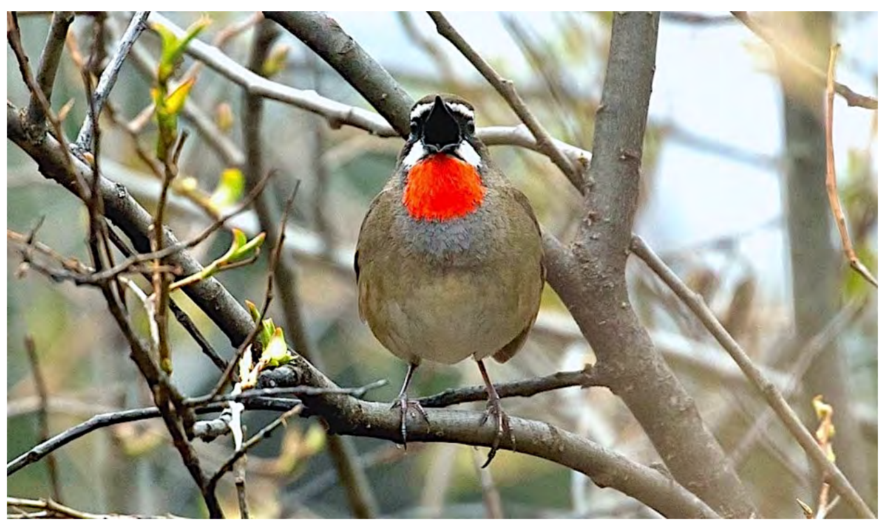
We'll look for the beautiful Siberian Rubythroat near Gongganglin.

Day 6, Fri, 6 Jun Tangjiahe to Pingwu. We will spend most of the day in Tangjiahe and drive to Pingwu in the late afternoon. It is a 3 hour drive and we will drive straight there without any birding stops. Night in Pingwu (1,500 m).