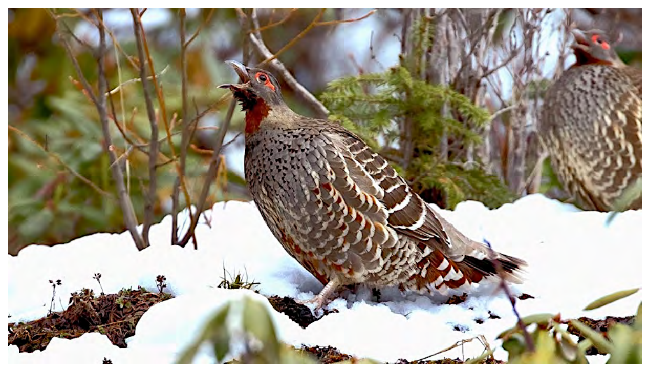
The Chestnut-throated Monal Partridge is a high-elevation endemic species that we'll look for in the mountains near Maerkang.

Mengbi Mountain —Standing tall in the mountains just south of Maerkang is mighty Mengbi Mountain. We will spend a full day birding through a wide elevational swathe along the road that goes over the mountain, starting our morning near the pass at around 4,000 meters, and working our way down from there. This high elevation virgin forest is home to plethora of wonderful possibilities, with two of our principal targets being the reclusive Sichuan Jay and the alternatingly shy or gregarious Chestnut-throated Monal Partridge (Verreaux's Partridge). In addition to these two endemic headliners, the slate of possibilities will include (but not be limited to!) a wide array of charismatic species from Blood Pheasant and Crested Tit-Warbler to Three-banded Rosefinch, the little known Przevalski's Nuthatch and the range restricted Crimson-browed Finch.