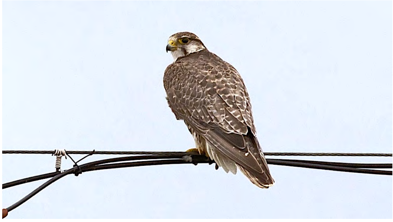
The rare Saker Falcon is one of the raptors we'll watch for on the Tibetan Plateau.

In the afternoon it will be back to open lands of the Tibetan Plateau, where we will visit Flower Lake, an enormous wetland rich in wildlife. Waterfowl may include Bar-headed Goose, Graylag Goose, Red-crested Pochard, and Ferruginous Duck. Black-necked Grebe and Great Crested Grebe, Little Ringed Plover and Lesser Sand Plover, Brown-cheeked Rail, nesting "Tibetan" Common Tern, and plenty of other water-attendant species should be around as well, maybe even complemented by a Pallas's Gull or Great Bittern. Salim Ali's Swift could be patrolling the skies over the water, and adjacent open lands peppered with Rufous-necked and White-rumped snowfinches and the massive (for a lark) Tibetan Lark. Nights in Ruoergai (3,500 m).