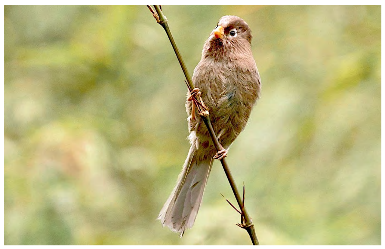
The Three-toed Parrotbill is another endemic that we'll seek, along with several other parrotbill species.