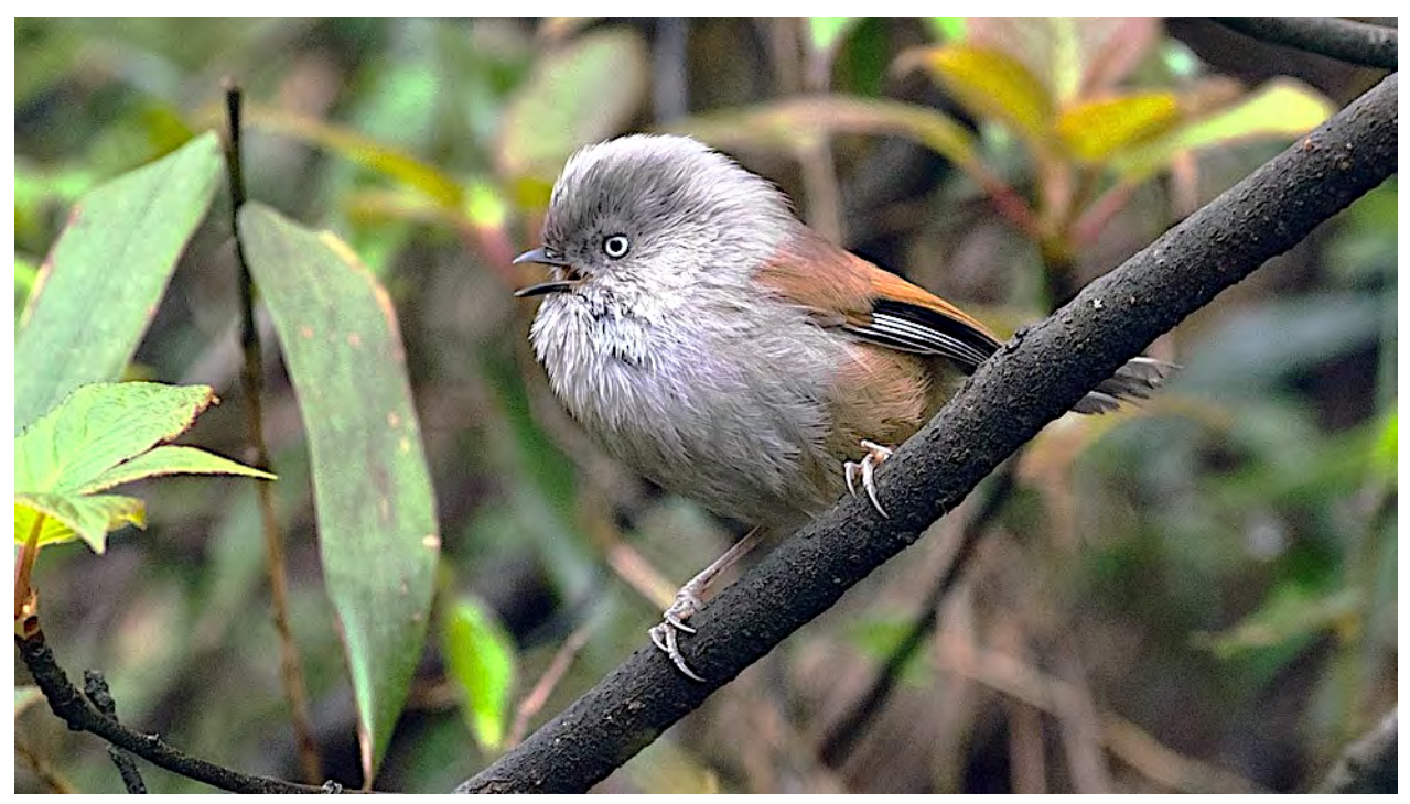
Gray-hooded Fulvettas and other small birds will be some of our targets when we bird the slopes of Erlangshan Mountain.

Day 15, Sun, 15 Jun. Rilong-Balangshan-Luding. LONG DRIVE. We will have some opportunity to try and see birds we may have missed on prior days. Following this final bit of birding, we will bid farewell to mighty Balangshan Mountain, before our long drive south to Luding, to put us in position for some excellent birding around Erlangshan, at a birding location that has been only relatively recently explored by birders. It is a long drive, but if there is any time, we may have an opportunity to do a bit of afternoon birding. Night in Luding (1,300 m).