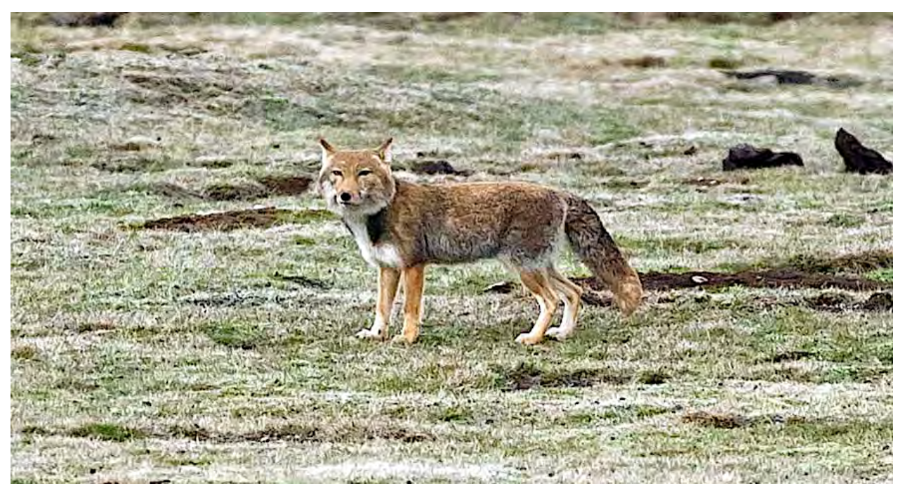
In addition to many wonderful birds, we will be watching for some of the mammals that inhabit this part of China, including the unique Tibetan Fox.

It's not only about the vistas offered by enchanted forests and majestic mountains, though - the wildlife is truly phenomenal. We have an opportunity to see up to 15 species (!!) of pheasants, grouse, and partridges, well over 30 species of Old World warblers, more than 10 species of rosefinch, 7 species of redstarts, not to mention such charismatic and emblematic species as Lammergeier, Grandala, Wallcreeper, Ground Tit (formerly known as Hume's Groundpecker), and the monotypic Przevalski's Pinktail, among many others! There is not a culture of hunting on the plateau, so many birds there rarely encounter humans, and can be astonishingly tame, providing some excellent photographic opportunities. The magic of birding on the Tibetan Plateau! We also stand a great chance to see many species of mammal, from the massive Takin to the adorable Plateau Pika, not to mention the distinctive Tibetan Fox (often on the prowl for these cute pikas), and the charismatic Golden Snub-nosed Monkey. If we are truly pure of heart (or just especially lucky), we may even glimpse a Red Panda or a Moon Bear!