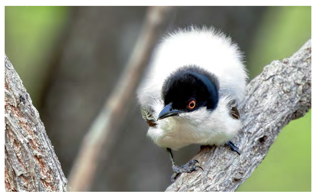
The Northern Puffback is a bushshrike found across sub-Saharan Africa. The name "Puffback" comes from the male's breeding display, seen here.

During the heat of the afternoon, we can be resting or birding around the hotel grounds, where you have to watch out for warthogs. Night in Mole National Park at Zaina Lodge tented camp.