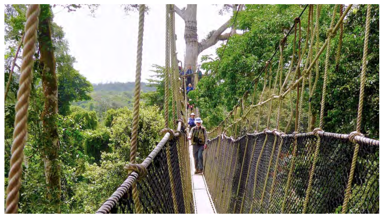
The canopy walkway at Kakum Forest gets us up where we can view many forest-dwelling birds, but it may present challenges to some.

If you are uncertain about whether this tour is a good match for your abilities, please don't hesitate to contact our office; if they cannot directly answer your queries, they will put you in touch with the guide.