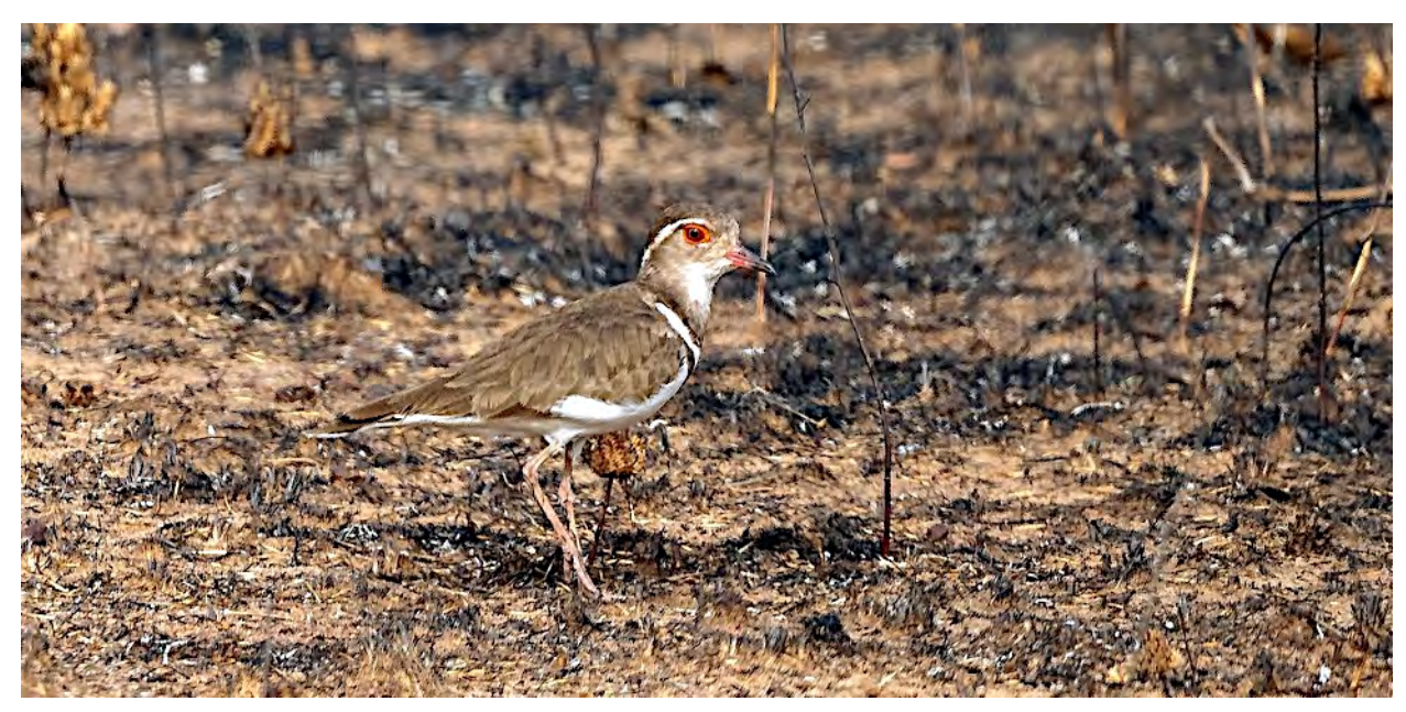
Forbes's Plover is a West African species that is often found in open areas, and places that have recently burned.

Our tour this year again visits the large forest block at Ankasa in the far west, on the border with Ivory Coast, with a now remnant forest site at Nsuta en route promising additional exciting species, including perhaps Rufous-sided Broadbill and African Piculet. Camping is no longer required and we will use comfortable hotels at both sites, with the new lodge at Ankasa being very nice indeed. Targets there include Hartlaub's Duck, Congo Serpent Eagle, Shining-blue and White-bellied Kingfisher, Cassin's and Black Spinetail, Rufous-sided Broadbill, as well as Orange-breasted Forest Robin, Yellow-bearded Greenbul, and three species of bristlebill. En route out, we can expect both Mouse-colored and Reichenbach's sunbirds and maybe Orange Weaver.