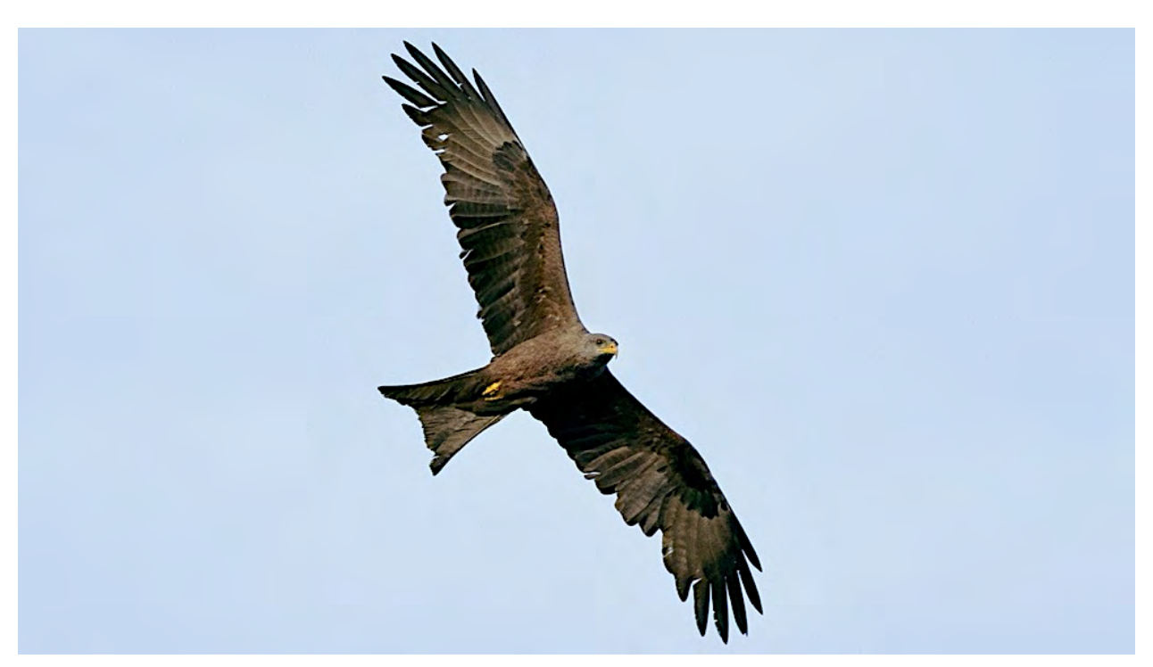
One of the raptors we should see is the graceful Black Kite. The Yellow-billed form is common in Ghana, and was seen every day on our 2023 tour.

Day 10, Mon, 25 Mar. Kakum National Park. This morning we'll be concentrating our attention on the Antwikwaa section of Kakum National Park, as well as some trails within and surrounding the park, which should prove to be very productive. We can attempt to find White-tailed (Fire-crested) Alethe, Red-tailed and Gray-headed bristlebills, Johanna's, Tiny and Olive-bellied sunbirds, Blue-headed Wood Dove, Red-rumped Tinkerbird, Black Dwarf and Red-billed Dwarf hornbills, Black-headed Paradise Flycatcher, Finsch's Flycatcher-thrush, Blue-shouldered Robin-Chat, Olive Long-tailed Cuckoo, Pale-breasted Illadopsis, Red-chested Goshawk, Yellow-billed and Guinea turacos, Long-tailed Hawk, Fire-bellied and Melancholy woodpeckers, Black-throated Coucal, Western Black-headed Oriole, African Finfoot, and possibly a Congo Serpent Eagle. There's also a remote chance of Ahanta Francolin, Black-collared Lovebird, and Willcocks's or Spotted Honeyguide. We may stay out until dusk to try again for Fraser's Eagle Owl and Akun Eagle Owl, and perhaps Brown Nightjar. Night at Rainforest Lodge Hotel near Kakum NP.