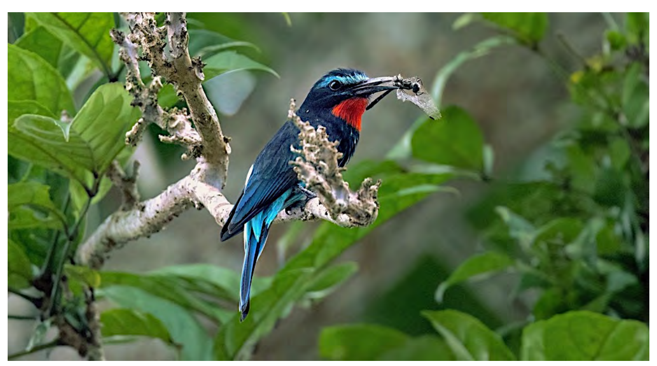
The beautiful Black Bee-eater is another West African species that we'll target.

Atewa is a hill-forest reserve that holds one of the few Blue-moustached Bee-eater sites in Ghana. It's also the home of such specialties as Chocolate-backed Kingfisher, Rufous-winged, Brown, Puvel's, and Blackcap illadopses, Golden Greenbul, the very rare Nimba Flycatcher (as yet never by me though it was found again in 2019), Narina Trogon, Western Bluebill, Black-and-white Shrike-Flycatcher, Kemp's and Grey Longbill, West African Batis, Western Bearded Greenbul, and several other apalis and flycatcher species. Birding the access foothills is good and means a longish steady and quite warm climb, but well worth the effort as Yellow-throated Cuckoo can sometimes be found as well.