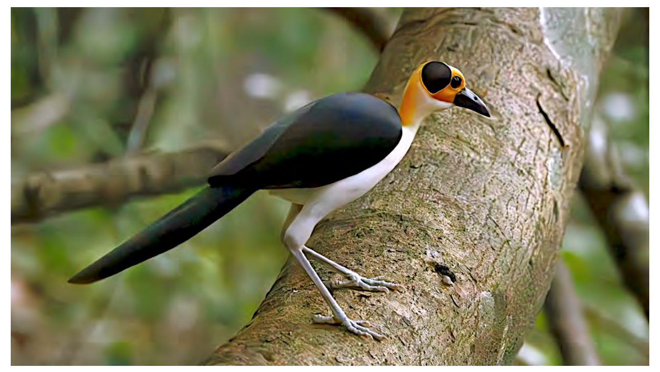
The White-necked Rockfowl is a large passerine found only in a small area of western Africa that includes the southwestern corner of Ghana. These birds are uncommon and vulnerable, making them a much-wanted species for birders! We've had good luck finding them on our tour.

We include here information for those interested in the 2024 Field Guides Ghana tour: