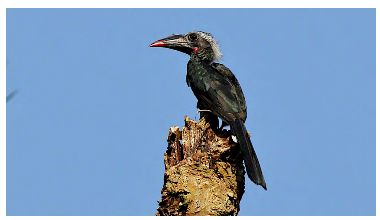
The Black Dwarf Hornbill, now known as the Westerrn Dwarf Hornbill, is one of 10 hornbill species we might see on the tour.

Day 6, Thu, 21 Mar. Ankasa is Ghana's only pristine, wet-evergreen upper-Guinea rainforest, a rarely visited forest protecting some wonderful species. We'll have an early start today to get a full day in at the park, where we will be in quest of Hartlaub's Duck, African Finfoot, African Crowned-Eagle, Great Blue and Yellow-billed Turaco, Yellow-casqued, Black-casqued, Red-billed Dwarf and Black Dwarf hornbill, White-bellied, Shining-blue, and Chocolate-backed kingfisher, Red-billed Helmetshrike, Purple-throated Cuckoo-shrike, Blackcap, Pale-breasted, Rufous-winged, and Brown illadopsis, Red-tailed and Green-tailed bristlebill, Yellow-bearded, Western Bearded, Plain, Spotted, Sombre, and Red-tailed greenbul, Blue-headed Wood-Dove, Olive Long-tailed Cuckoo, White-tailed Ant-Thrush, and a chance of Red-fronted Antpecker, to name a few. Also, there is a chance for Nkulengu Rail during the early evening, and in 2019 and 2023 we saw White-crested Tiger-Heron here as well. Night at the new and very nice Ankasa Reserve Lodge.