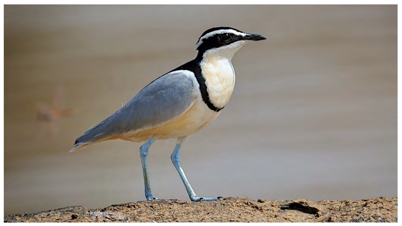
The elegant Egyptian Plover is a monotypic shorebird that we'll look for along the White Volta River near Mole National Park.

Mole National Park is a completely different savanna and grassland habitat in the dry north where we have a chance of Forbes's Plover, White-throated Francolin, Stone Partridge, Standard-winged and Long-tailed nightjars, and the amazing African endemic family of Bucorvidae (Ground-Hornbills), here represented by the Abyssinian species. Lavender Waxbill and Black-faced Firefinch can be seen, as can the striking and noisy Oriole Warbler, Sun Lark, and both Pygmy and Beautiful sunbirds. This year we will also make a 2-hour bus ride to visit a site on the nearby White Volta River where Egyptian Plover can be seen, saving us basically two days on the bus heading to the far north and back.