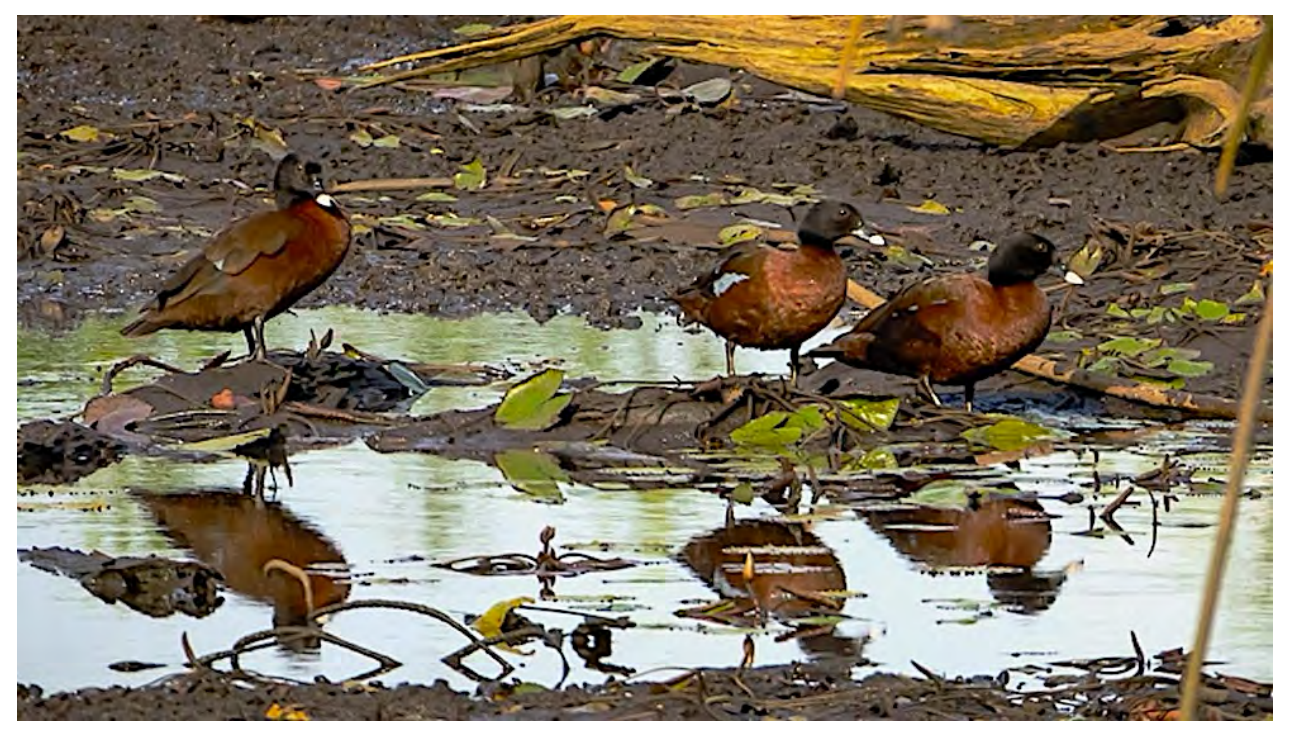
Hartlaub's Duck is a west African specialty, found in wooded areas and secluded swamps. We'll look for them at Ankasa.

Black-casqued, Red-billed Dwarf and Black Dwarf hornbill, White-bellied, Shining-blue, and Chocolate-backed kingfisher, Red-billed Helmetshrike, Purple-throated Cuckoo-shrike, Blackcap, Pale-breasted, Rufous-winged, and Brown illadopsis, Red-tailed and Green-tailed bristlebill, Yellow-bearded, Western Bearded, Plain, Spotted, Sombre, and Red-tailed Greenbul, Blue-headed Wood-Dove, Olive Long-tailed Cuckoo, White-tailed Ant-Thrush, and maybe Red-fronted Antpecker, to name a few. Also, there is a chance for Nkulengu Rail during the early evening, and in 2019 and 2023 we saw White-crested Tiger-Heron here as well. Night at the Ankasa Reserve Lodge.