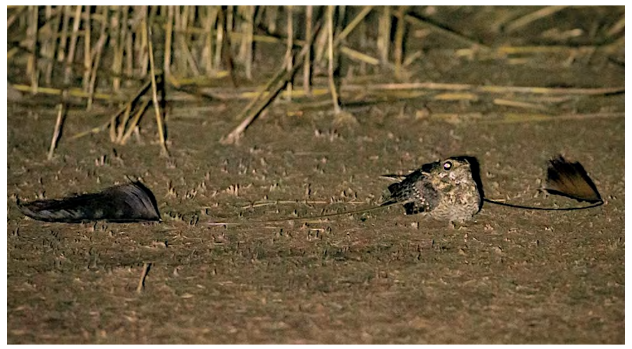
The standard-winged Nightjar is found in the savannas of sub-Saharan Africa. The "standards" are elongated primary feathers, used by the males in display.

Our tour this year again visits the large forest block at Ankasa in the far west, on the border with lvory Coast, with a now remnant forest site at Nsuta en route promising additional exciting species, including perhaps Piping and Western Pied Hornbill and African Piculet. Camping is no longer required and we will use comfortable hotels at both sites, with the new lodge at Ankasa being very nice indeed. Targets there include Hartlaub's Duck, Congo Serpent Eagle, Shining-blue and White-bellied Kingfisher, Cassin's and Black Spinetail, Rufous-sided Broadbill, as well as Orange-breasted Forest Robin, Yellow-bearded Greenbul, and three species of bristlebill. En route out, we can expect both Mouse-colored and Reichenbach's sunbirds and Orange Weaver.