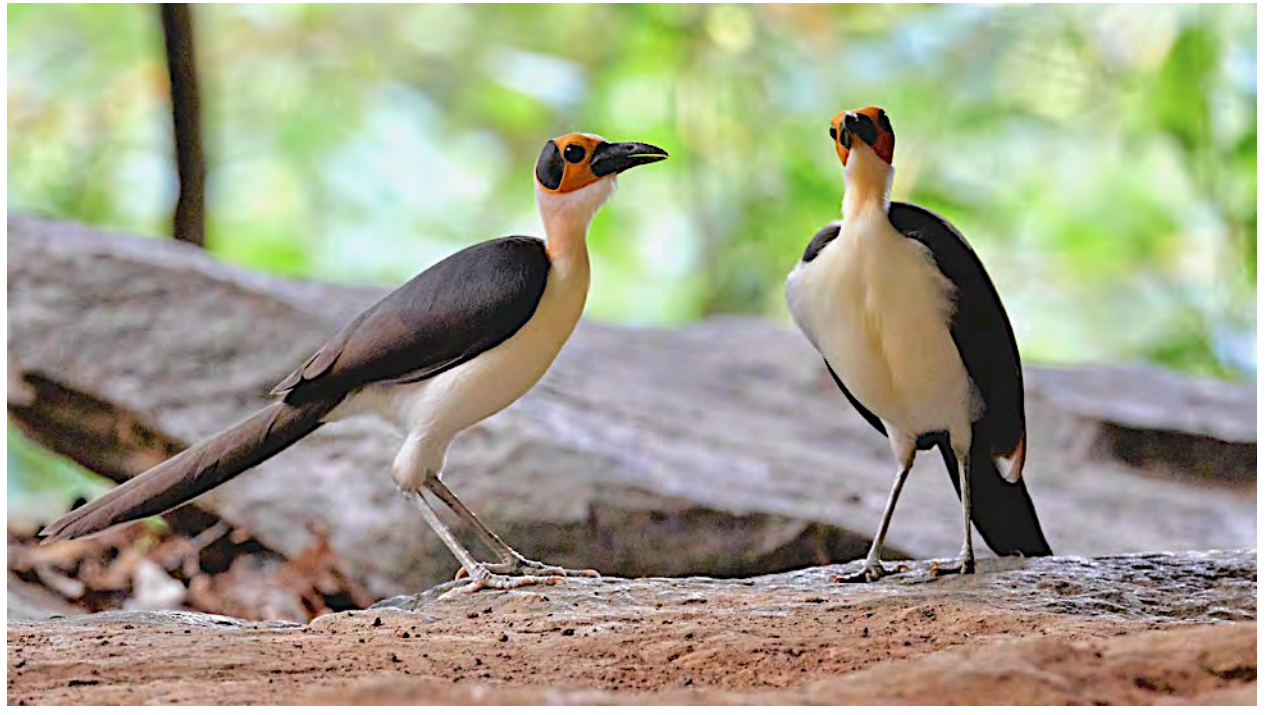
The White-necked Rockfowl is a large passerine found only in a small area of western Africa that includes the southwestern corner of Ghana. These birds are uncommon and vulnerable, making them a much-wanted species for birders! We've had good luck seeing them on our tour.

We include here information for those interested in the 2026 Field Guides Ghana: Window into West African Birding tour: - a general introduction to the tour