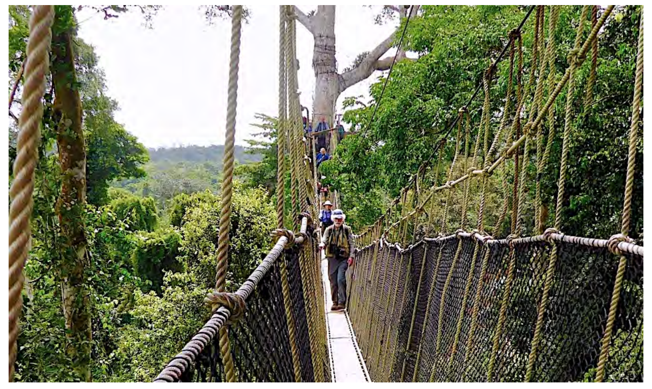
The canopy walkway at Kakum Forest gets us up where we can view many forest-dwelling birds, but it may present challenges to some.

If you are uncertain about whether this tour is a good match for your abilities, please don't hesitate to contact our office; if they cannot directly answer your queries, they will put you in touch with the guide.