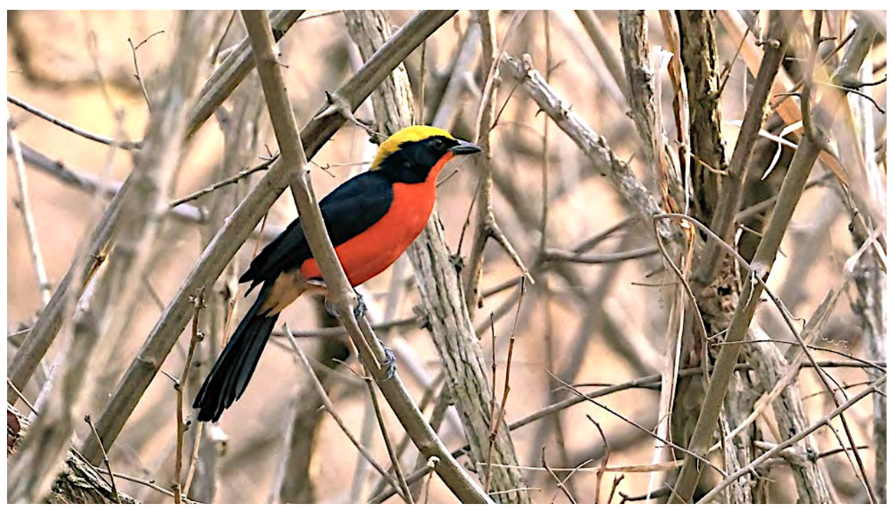
We'll see a number of bush-shrikes, including the beautiful Yellow-crowned Gonolek. Mole National Park has the savanna habitat favored by these birds.

Day 15, Sat, 28 Mar. Mole NP, visiting Mognori River circuit. This riparian growth holds Shining-blue and Giant kingfisher, Square-tailed Drongo, African Blue Flycatcher, and White-crowned Robin-chat. We will bird some nearby savanna areas later for Fine-spotted Woodpecker, Brown-backed Woodpecker, Brown-rumped Bunting and Rufous and perhaps Dorst's cisticola. Night in Mole National Park at Zaina Lodge tented camp.