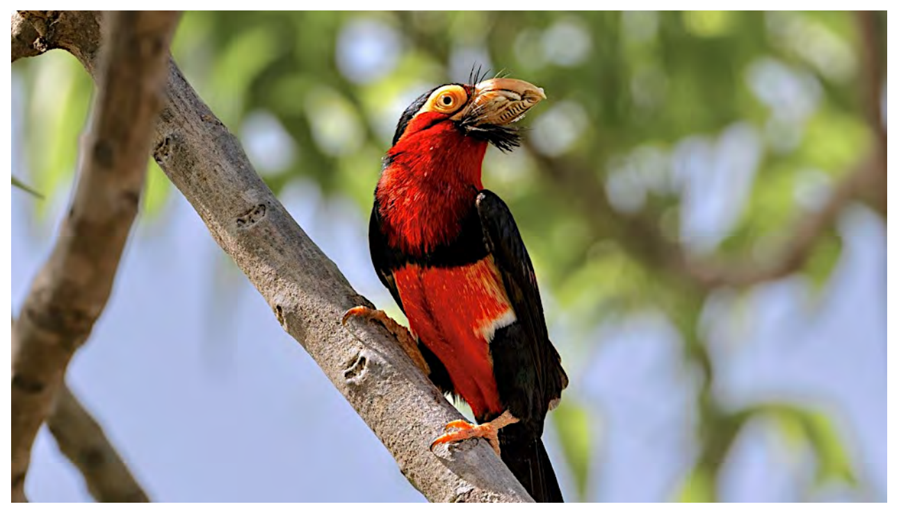
The large, colorful Bearded Barbet is one of several barbet species we'll watch for in the Shai Hills.

We'll have this afternoon and much of Day 3 to bird nearby areas in hopes of finding Purple and Gray herons, Western Reef Egret, Long-tailed Cormorant, Garganey, Black-winged Stilt, Collared Pratincole, Black-tailed Godwit, Ruff, Ruddy Turnstone, Senegal Thick-knee, African Swamphen and Black Tern to mention just a few. Night in or near Accra.