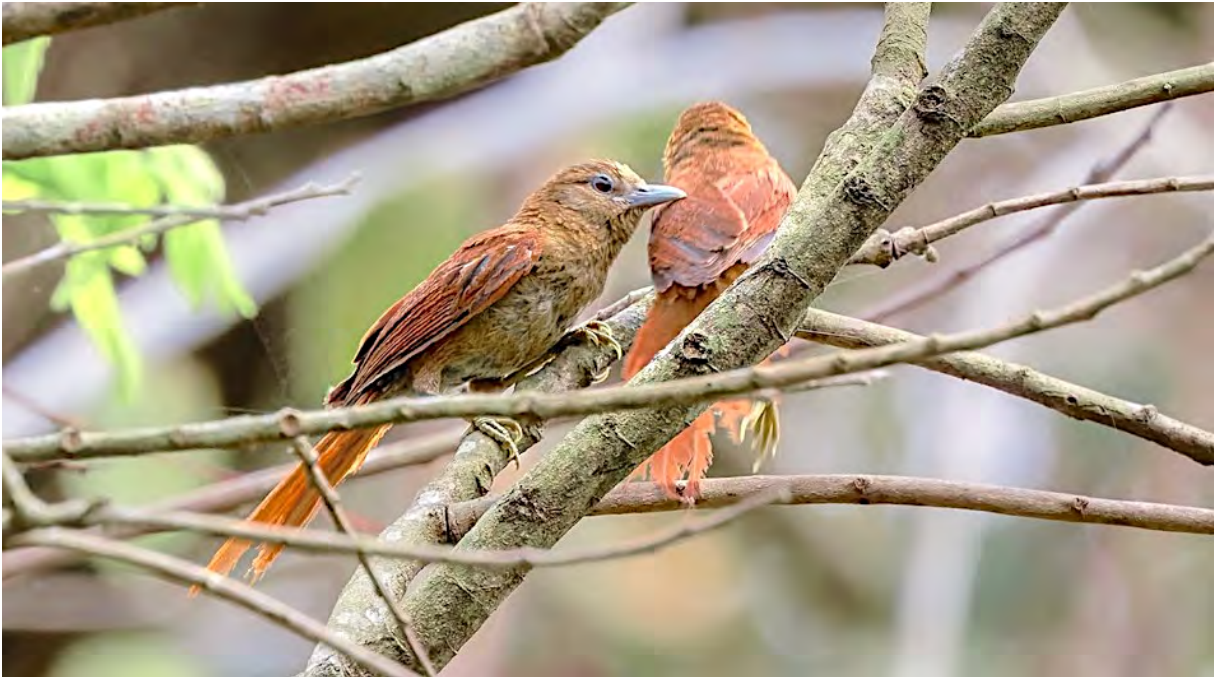
These Plain Softtails along the "Parana dos Ramos" were among the many whitewater specialties we saw on our 2022 tour.

That afternoon we will make our way into the Madeira-Tapajos interfluvium on the Rio Uraria, a strange little waterway that seems to be the remnant of a once-grand channel of the Rio Amazonas. There are lots of people living along the Uraria, but there is still some reasonably good habitat for birding as well, and we'll make a couple of stops, perhaps in our smaller boats, to see what birds are around. We will continue our eastward way down the Uraria through much of the night, our destination the lower Rio Abacaxis. Night on the Dorinha .