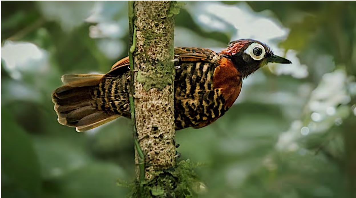
Harlequin Antbird has a very small distribution in the part of the Central Amazon most easily accessible by boat.

We include here information for those interested in one of the 2023 Field Guides Great Rivers of the Amazon II tour: