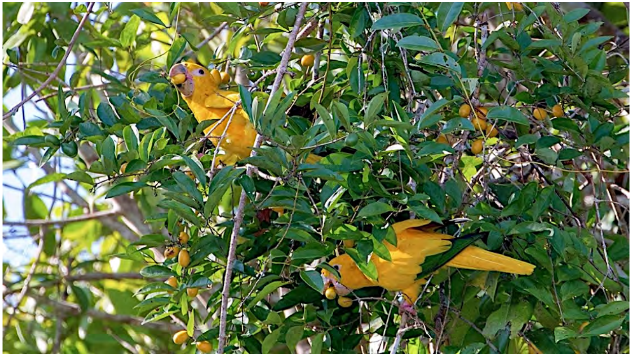
Golden Parakeet is just one of the special birds we'll seek along the rivers.

Coming into the Uraria from the south are a series of blackwater rivers and streams the headwaters of which are on the Brazilian shield, within the interfluvium. They are characterized by wide "mouth lakes", which formed during paleohistorically low water levels, and that led to widening of their lower courses (see the satellite image, above). The interface of these blackwater rivers with the whitewater Uraria is dramatic, the line of demarcation being very clearly defined.