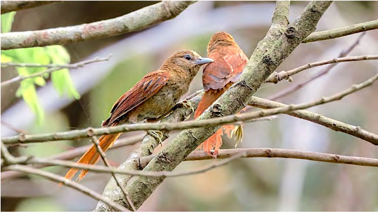
These Plain Softtails along the "Parana dos Ramos" were among the many whitewater specialties we saw on our 2022 tour.

That afternoon we will make our way into the Madeira-Tapajos interfluvium on the Rio Uraria, a strange little waterway that seems to be the remnant of a once-grand channel of the Rio Amazonas. There are lots of people living along the Uraria, but there is still some reasonably good habitat for birding as well, and we'll make a couple of stops, perhaps in our smaller boats, to see what birds are around. We will continue our eastward way down the Uraria through much of the night, our destination the lower Rio Abacaxis. Night on the Dorinha .