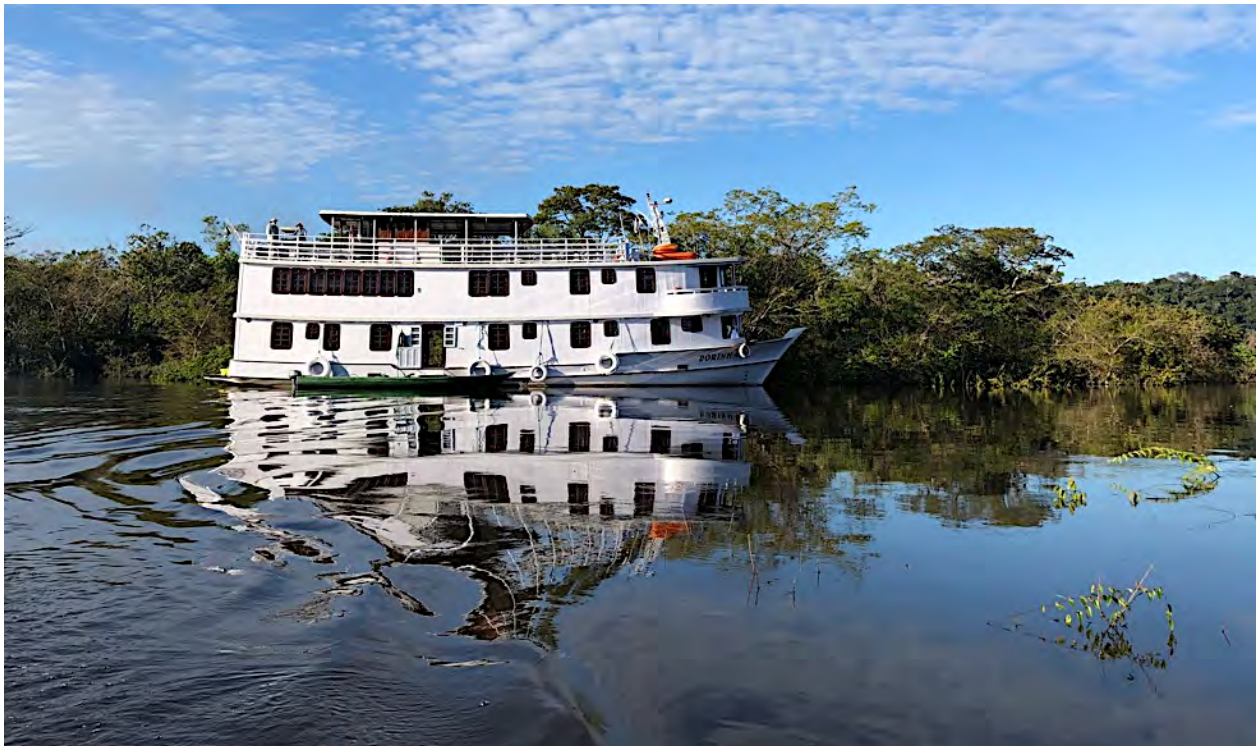
Our boat, the Dorinha, will be a very comfortable base for our expeditions.

Our live-aboard boat, the Dorinha , is simply fabulous! It has numerous, twin-bedded, air-conditioned rooms, each with private bathroom, a fully stocked bar (delicious, refreshing caipirinhas at hand!), and a wonderful cook and friendly, fun staff to take care of us all the way. Many of you have been with us on these boats over 20+ years of our “Rio Negro Paradise” tours, and you know what a dream it is to travel the Amazon in this level of comfort and safety, with your Field Guides guides calling the shots. So, we invite you to return for another run of a very different nature, or jump aboard for your first thrilling Amazon journey!