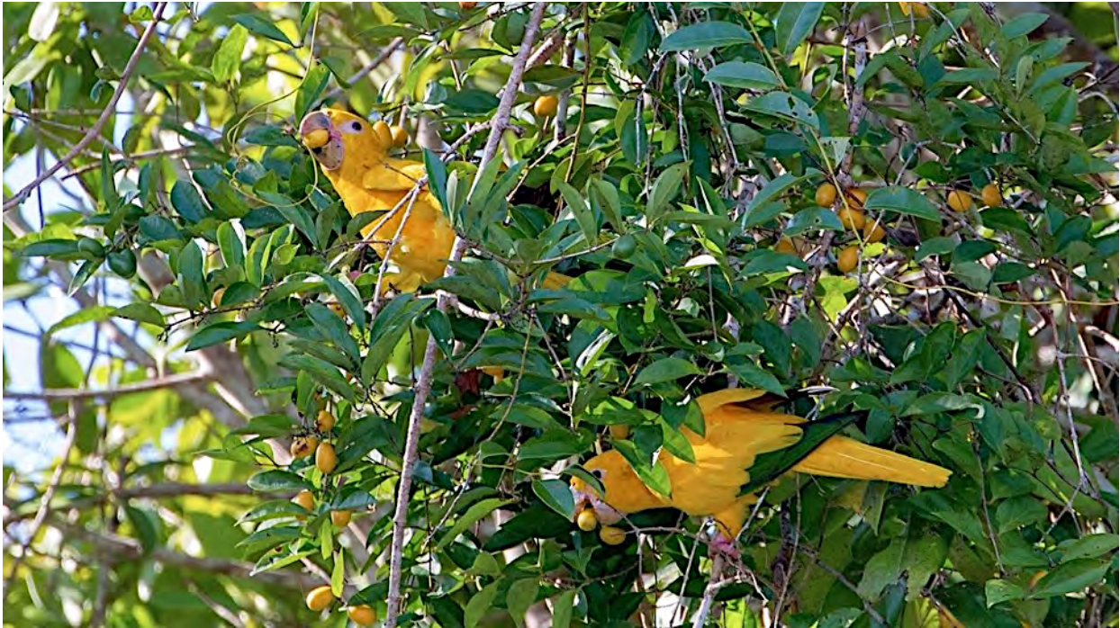
Golden Parakeet is just one of the special birds we'll seek along the rivers.

Coming into the Uraria from the south are a series of blackwater rivers and streams the headwaters of which are on the Brazilian shield, within the interfluvium. They are characterized by wide "mouth lakes", which formed during paleohistorically low water levels, and that led to widening of their lower courses (see the satellite image, above). The interface of these blackwater rivers with the whitewater Uraria is dramatic, the line of demarcation being very clearly defined.