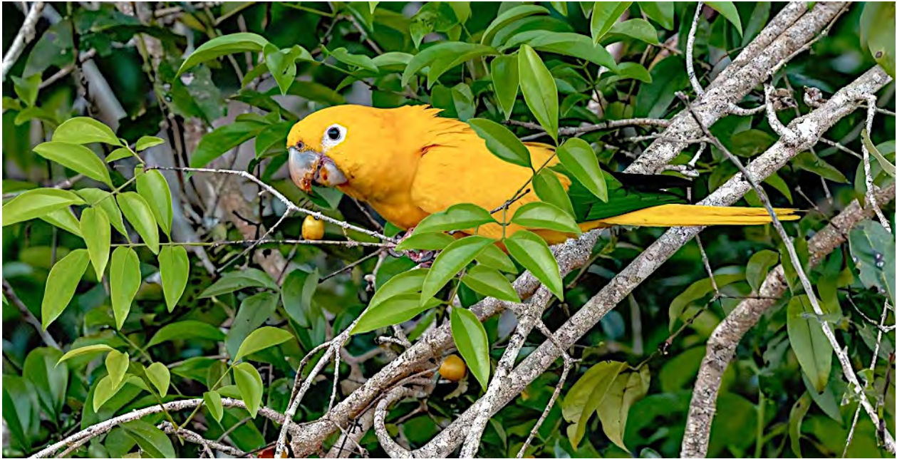
Golden Parakeet is just one of the special birds we'll seek along the rivers.

Coming into the Uraria from the south are a series of blackwater rivers and streams the headwaters of which are on the Brazilian shield, within the interfluvium. They are characterized by wide "mouth lakes", which formed during paleohistorically low water levels, and that led to widening of their lower courses (see the satellite image, above). The interface of these blackwater rivers with the whitewater Uraria is dramatic, the line of demarcation being very clearly defined.