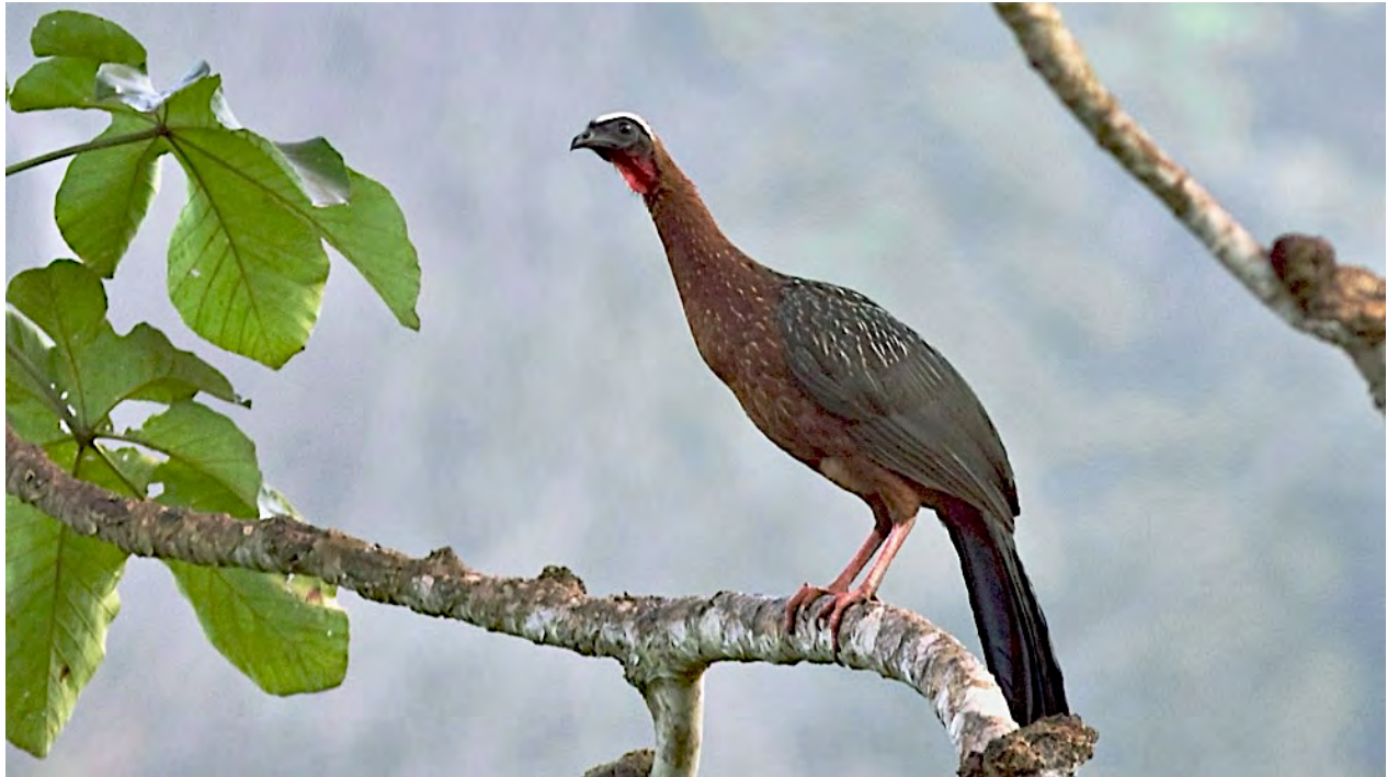
The White-crested Guan has a very small distribution in the part of the Central Amazon most easily accessible by boat.

We include here information for those interested in one of the 2025 Field Guides Great Rivers of the Amazon II tour: