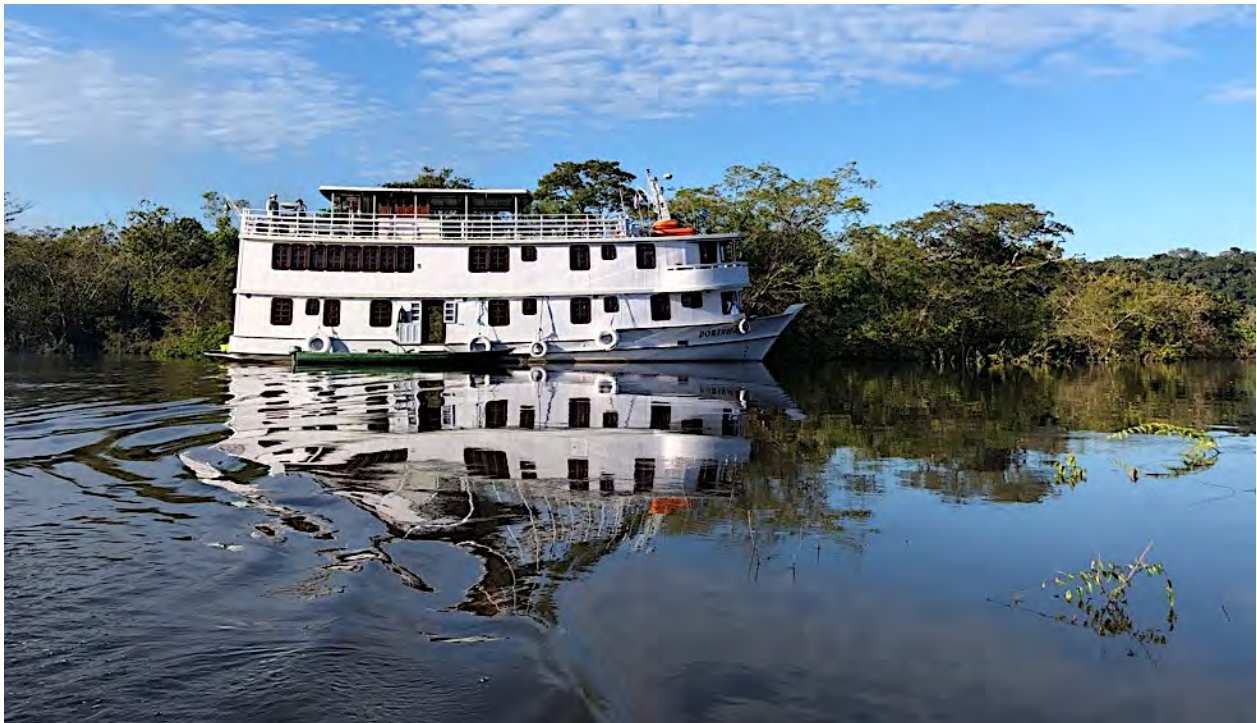
Our boat, the Dorinha, will be a very comfortable base for our expeditions.

Our live-aboard boat, the Dorinha , is simply fabulous! It has numerous, twin-bedded, air-conditioned rooms, each with private bathroom, a fully stocked bar (delicious, refreshing caipirinhas at hand!), and a wonderful cook and friendly, fun staff to take care of us all the way. Many of you have been with us on these boats over 20+ years of our “Rio Negro Paradise” tours, and you know what a dream it is to travel the Amazon in this level of comfort and safety, with your Field Guides guides calling the shots. So, we invite you to return for another run of a very different nature, or jump aboard for your first thrilling Amazon journey!