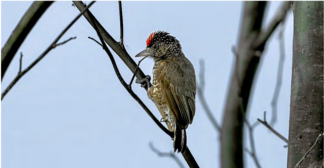
The Varzea Piculet is one of the range-restricted species we'll seek on the islands of the Tumpinambara Archipelago