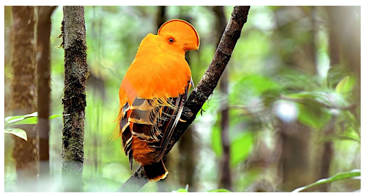
The Guianan Cock-of-the-Rock is a must-see bird, and we'll have a chance to view them on a lek near surama Lodge.

be in for an avian spectacle with possibilities including Pompadour, Purple-breasted, Guianan Red- and Spangled cotingas, as well as the outrageous Crimson Fruitcrow. At small stream crossings, we'll watch for Rose-breasted Chat, Guianan Streaked-Antwren, Crimson Topaz and Riverbank Warbler, and we'll keep one eye skyward for Black and Red-throated caracaras, Black and Ornate hawk-eagles, Harpy Eagle and Golden-winged Parakeet. As dusk descends, we'll try again for any nightbirds we may have missed yesterday, plus hope for a glimpse of a Jaguar. Night at Atta Rainforest Lodge.