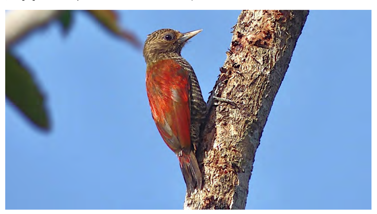
The Blood-colored Woodpecker has a limited range in the coastal regions of the Guianas. We'll watch for this local specialty along the Mahaica River and when we visit the Georgetown Botanical Gardens.

woodlands, are largely untouched. Though cattle ranching is expanding in the south, fewer than 15,000 people live in the whole savanna region; that's less than one person for every three square miles! The word "Rupununi" means "Land of Many Waters" in one of the local Amerindian languages, and it's a good moniker for a region dotted with a myriad puddles, water-catching depressions, and oxbow lakes. This is the land of "giants." The world's largest waterlily unfurls its seven-foot wide round leaves on still ponds here, while the world's largest freshwater fish (the six-foot long, 400-pound Arapaima) swims underneath. The New World's biggest cat, the elusive Jaguar, patrols river edges in the savanna, the Giant Otter (the world's longest weasel at five-and-a-half feet) hunts its waters, and the aptly named Giant Anteater (males are up to seven feet long) trundles across the plains in search of termites. Also present are a great variety of bird species, ranging from the tiny Bearded Tachuri to the statuesque Jabiru.