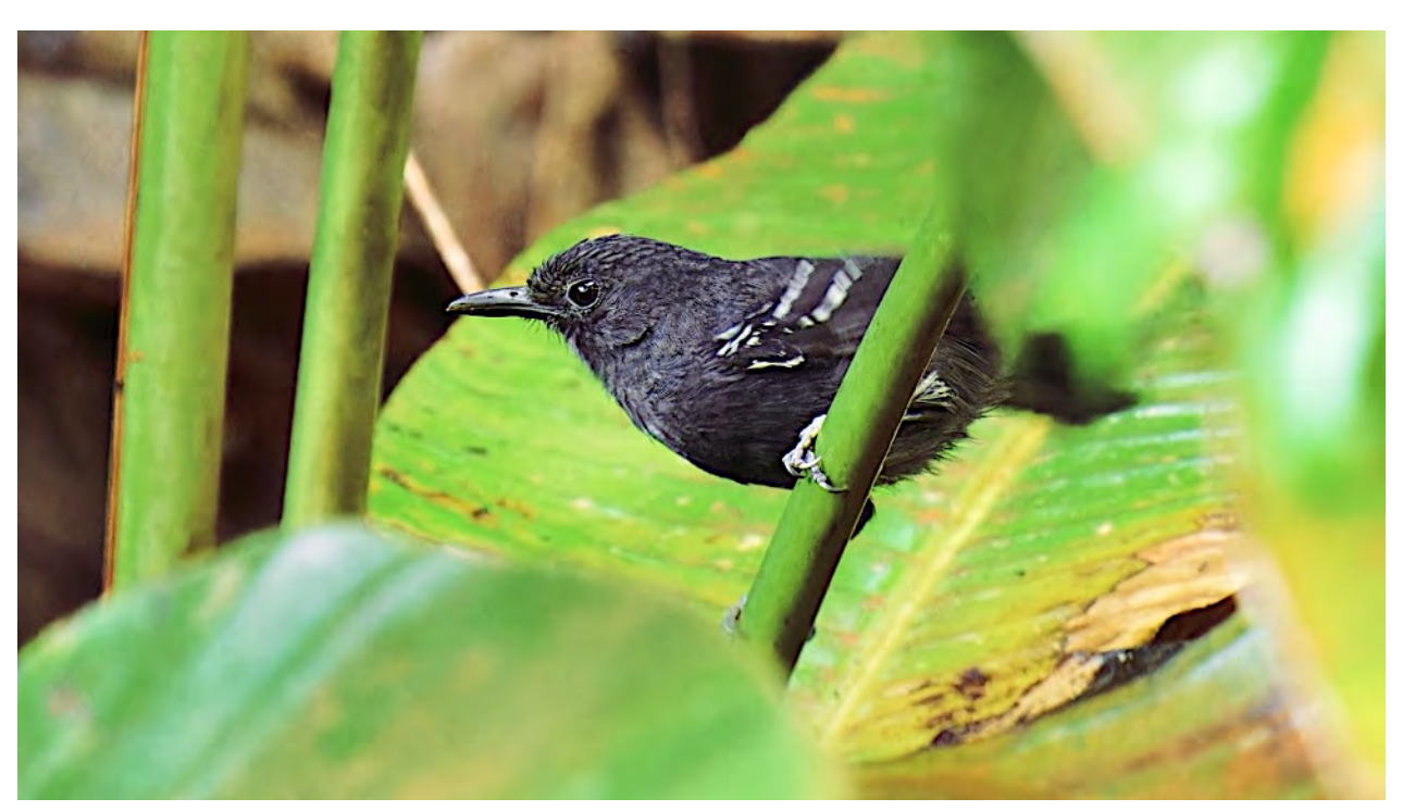
Rio Branco Antbird is a specialty we'll look for along the Ireng River. This species has a very small range and can be difficult to locate, but we've have had success in recent years.

Once we arrive at Manari Ranch, near the outskirts of Lethem, we'll settle into our rooms in two wings extending from the main ranch house. Each room has its own en-suite bathroom, the property has 24-hour electricity, and wi-fi is available in the main building. Depending on our arrival time, there may be enough daylight to check the grounds around the lodge for Ferruginous Pygmy-Owl, Rufous-tailed Jacamar, Venezuelan Troupial and Hooded Tanager. Night at Manari Ranch.