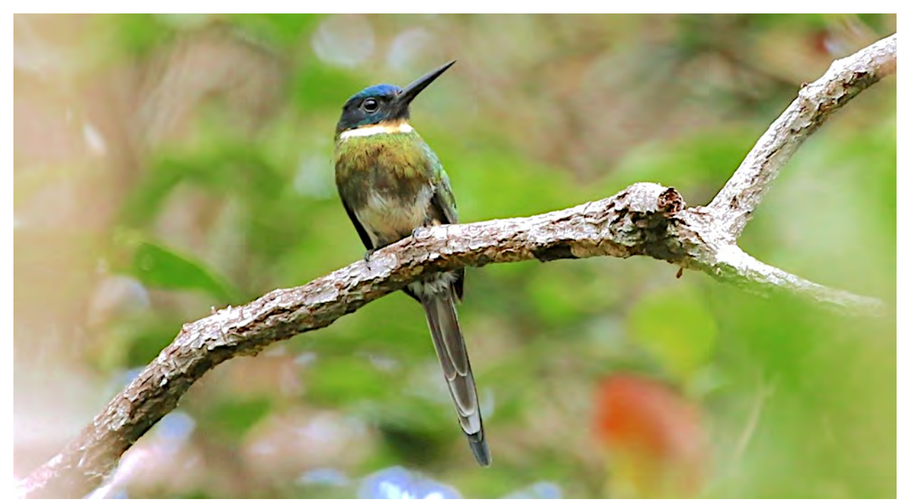
The Bronzy Jacamar is a species we'll look for in white sand forest.

In the late afternoon, we'll take a short boat trip across the Essequibo River and head for a patch of white sand forest on the opposite side. Growth on this poor soil is markedly different from that of the surrounding rainforest: trees here are stunted, shorter and thinner, but their growth can be quite dense. This unique habitat offers a variety of white sand specialists, including Black Manakin, Saffron-crested Tyrant-Manakin, Bronzy Jacamar, Red-shouldered Tanager, Guianan Schiffornis, Dusky Parrot, and (with luck) the stunning Guianan Red-Cotinga or Red-billed Woodcreeper. Night at Iwokrama River Lodge.