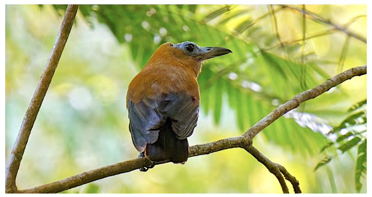
The odd Capuchinbird is a specialty of the Guianan Shield. We've had some excellent experiences with these bizarre cotingas on our tour!

Tour I: January 20 – 31, 2024 Tour II: February 3 – 14, 2024