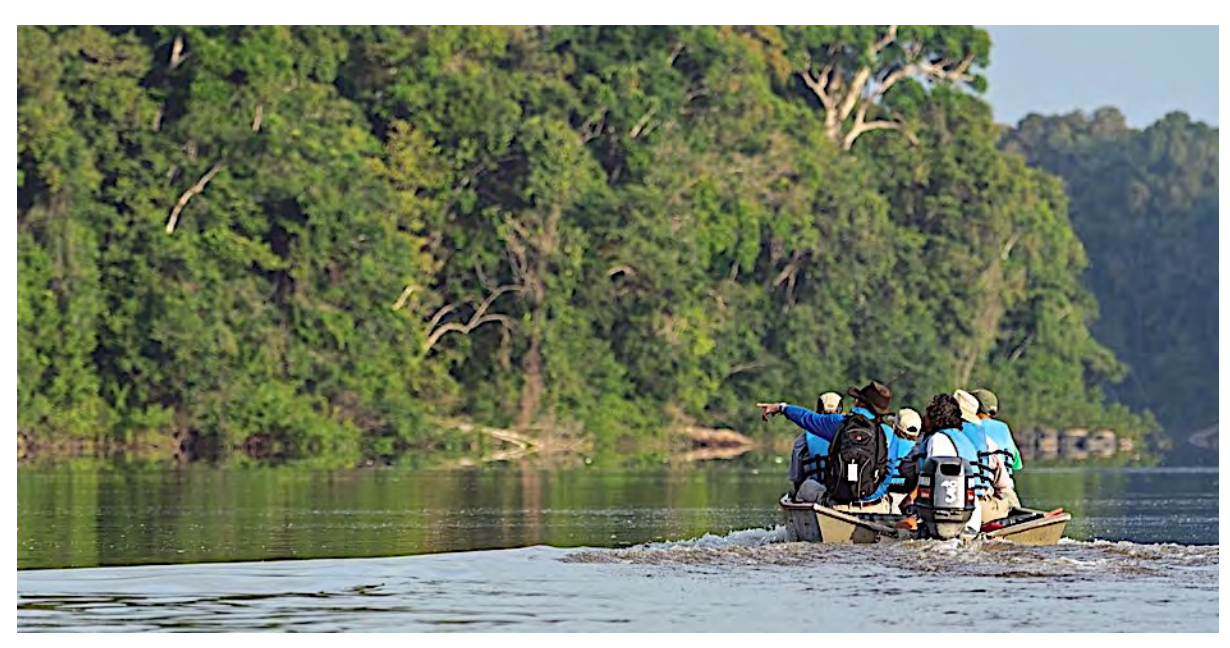
We'll take several boat rides such as this one on the Essequibo River near the Iwokrama River Lodge.

are among the possibilities. We'll also visit the Rupununi savanna to look for Bearded Tachuri, Giant Otter, Giant Anteater, and the many species attracted to the area's ponds, lakes, and marshes, and will finish with a visit to the Ireng River along the border with Brazil, where the range-restricted Hoary-throated Spinetail and Rio Branco Antbird will be our primary targets. Join us for a comfortable wilderness adventure!