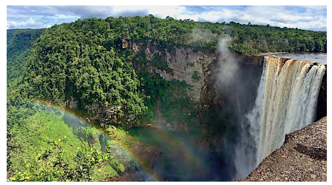
A highlight of the tour is our visit to the spectacular Kaieteur Falls. We'll visit the park on our way to lwokrama River Lodge.

there should be plenty of other species to enjoy as well, as the park's bird list surpasses 270 species. Note that chiggers are abundant here, so be sure to take appropriate precautions. Night at Cara Lodge in Georgetown.