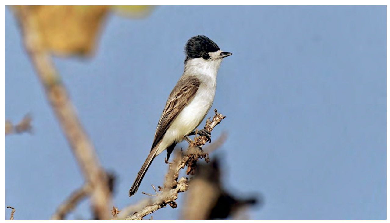
The White-naped Xenopsaris is an interesting bird. Taxonomically, it is now grouped with the Tityras, although it was once considered a monotypic genus. They are found in open habitats, and occur in three scattered populations, including one in Guyana.

Day 9, Jan 16 or Mar 6. Surama area: Buro-Buro trail. After an early breakfast, we'll walk through fine gallery forest along the Buro-Buro trail, perhaps venturing as far as the Buro-Buro River (a round trip of about six miles). Many species are possible here, including Tiny Tyrant-Manakin, Green-backed and Black-tailed trogons, Amazonian Antshrike, Ferruginous-backed Antbird, Helmeted Pygmy-Tyrant, Cream-colored Woodpecker, Rufous-capped Antthrush, Pectoral Sparrow, and more. With luck, we might find an ant swarm; attendant species might include Amazonian Barred-, Black-banded, Olivaceous, and Wedge-billed woodcreepers, Rufous-throated and White-plumed antbirds, and (if we're really lucky) the rarely seen and highly desirable Rufous-winged Ground-Cuckoo, which is most often found in the vicinity of army ant incursions. After lunch and a break at the lodge, we'll venture to a savanna area near outskirts of the village, where we'll search for White-naped Xenopsaris, Cinereous Becard, Grassland Sparrow and Bicolored Wren. Once dusk falls, we continue along the road, watching for Least Nighthawk, Spectacled and Crested owls and Tawny-bellied Screech-Owl. Night at Surama Eco-lodge.