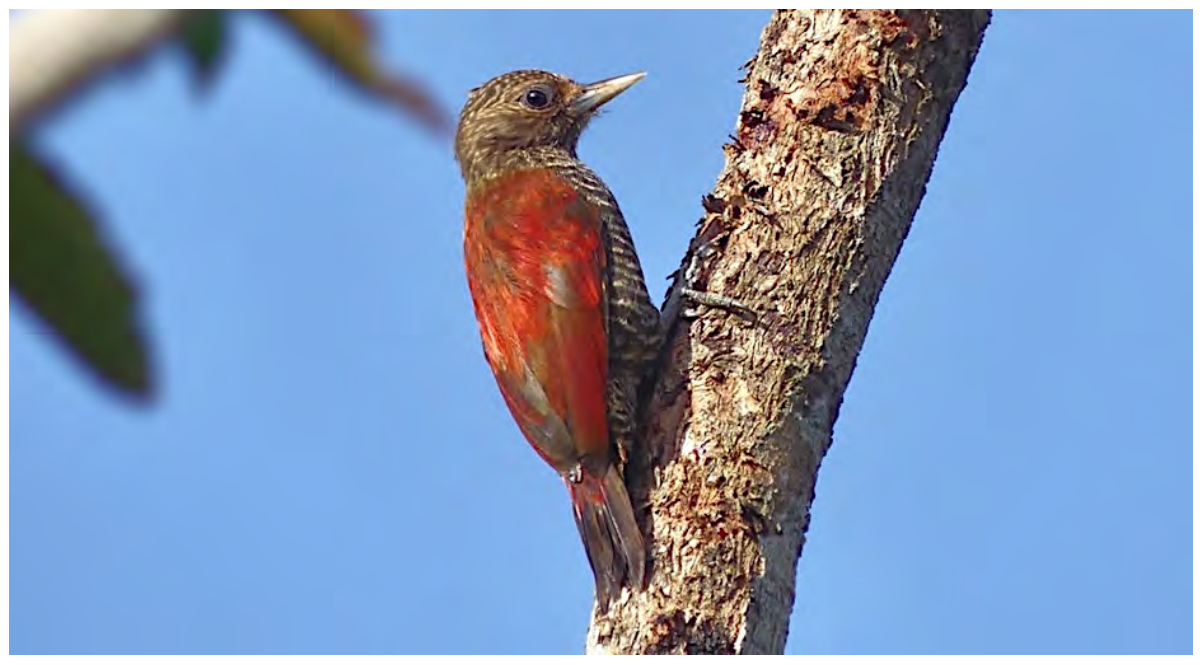
The Blood-colored Woodpecker has a limited range in the coastal regions of the Guianas. We'll watch for this local specialty along the Mahaica River and when we visit the Georgetown Botanical Gardens.

The Rupununi Savanna is a 5000 square mile area that lies between the Rupununi River and Guyana's border with Roraima, Brazil. Its extensive grasslands, dotted with massive termite mounds and scattered gallery and riparian woodlands, are largely untouched. Though cattle ranching is expanding in the south, fewer than 15,000 people live in the whole savanna region; that's less than one person for every three square miles! The word "Rupununi" means "Land of Many Waters" in one of the local Amerindian languages, and it's a good moniker for a region dotted with a myriad puddles, water-catching depressions, and oxbow lakes. This is the land of "giants." The world's largest waterlily unfurls its seven-foot wide round leaves on still ponds here, while the world's largest freshwater fish (the six-foot long, 400-pound Arapaima) swims underneath. The New World's biggest cat, the elusive Jaguar, patrols river edges in the savanna, the Giant Otter (the world's longest weasel at five-and-a-half feet) hunts its waters, and the aptly named Giant Anteater (males are up to seven feet long) trundles across the plains in search of termites. Also present are a great variety of bird species, ranging from the tiny Bearded Tachuri to the statuesque Jabiru.