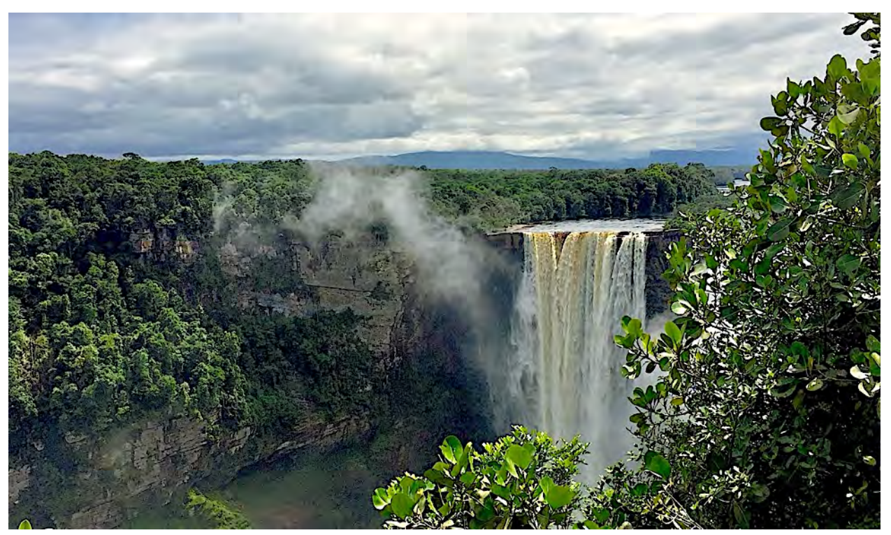
Guyana is one of the last places in the world with large tracts of wilderness. We'll visit Kaieteur Falls to see this majestic waterfall, and experience the remoteness.

Before we head to the country's wild interior, we'll start with a day in the rice fields, mangrove swamps, and mudflats along the coast, where Hoatzin, Rufous Crab Hawk, White-bellied Piculet, Blood-colored Woodpecker, and Scarlet Ibis are among the possibilities. Towards the end of the tour, we'll visit the Rupununi savanna to look for Bearded Tachuri, Giant Anteater, and the many species attracted to the area's ponds, lakes, and marshes, and will finish with a visit to the Ireng River along the border with Brazil, where the range-restricted Hoary-throated Spinetail and Rio Branco Antbird will be our primary targets. Join us for a comfortable wilderness adventure!