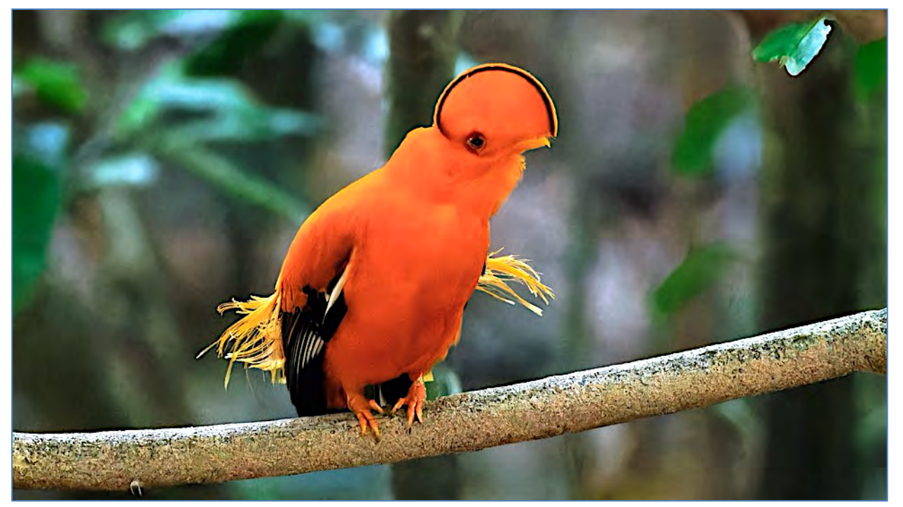
The Guianan Cock-of-the-Rock is a spectacular bird. We'll visit a lek near Kaieteur Falls where we should get good views of these flamboyant creatures.