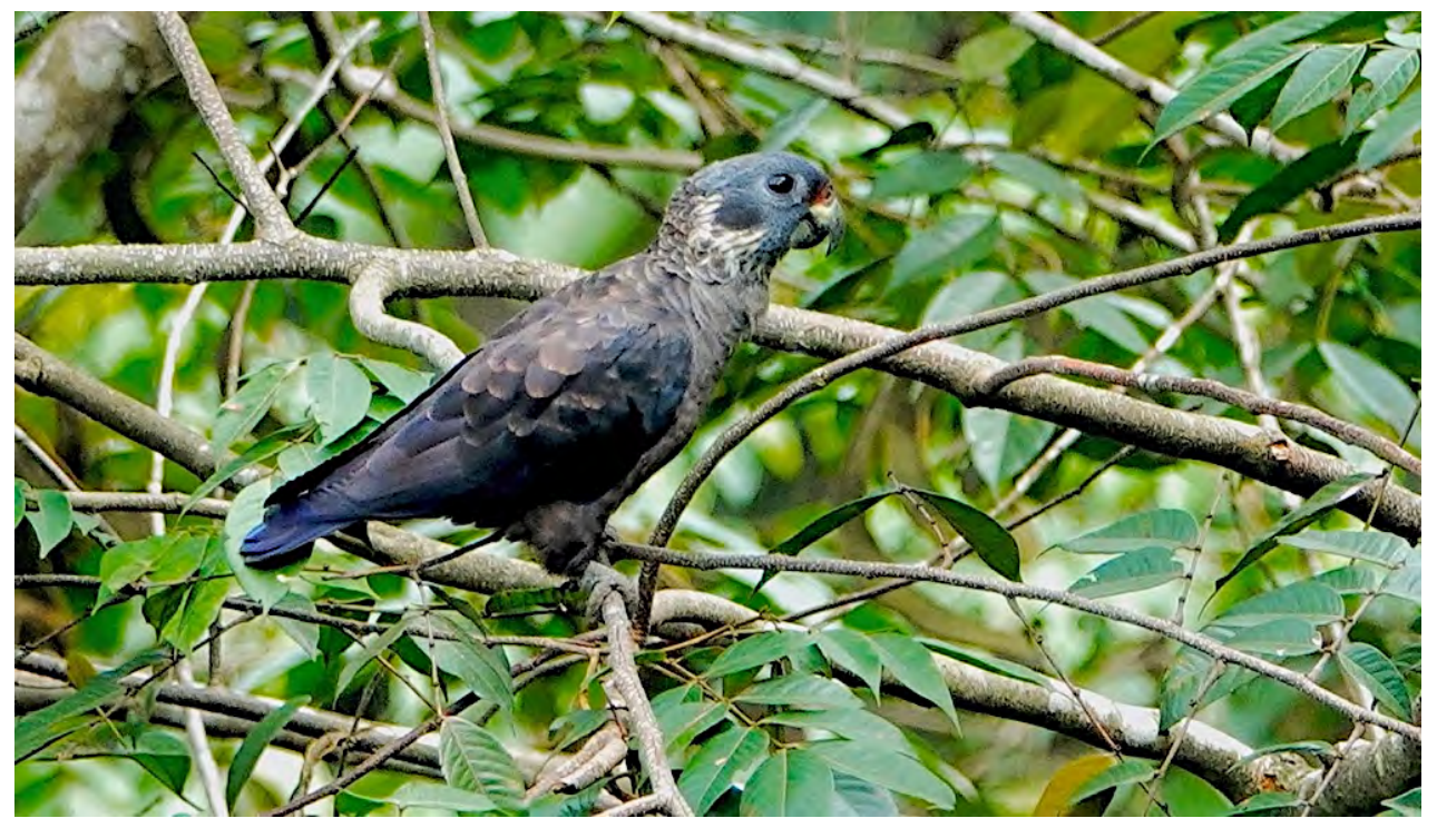
Near Atta Rainforest Lodge, we'll visit some white-sand habitat where we'll look for some Guianan Shield specialties like Dusky Parrot.