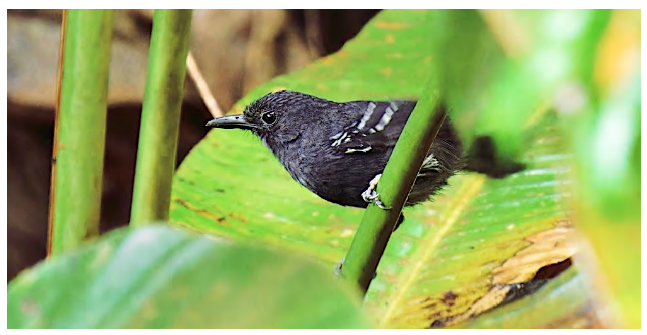
Rio Branco Antbird is a specialty we'll look for along the Ireng River. This species has a very small range and can be difficult to locate, but we've have had success in recent years.

Once we arrive at Manari Ranch, near the outskirts of Lethem, we'll settle into our rooms in two wings extending from the main ranch house. Each room has its own en-suite bathroom, the property has 24-hour electricity, and wi-fi is available in the main building. Depending on our arrival time, there may be enough daylight to check the grounds around the lodge for Ferruginous Pygmy-Owl, Rufous-tailed Jacamar, Venezuelan Troupial and Hooded Tanager. Night at Manari Ranch.