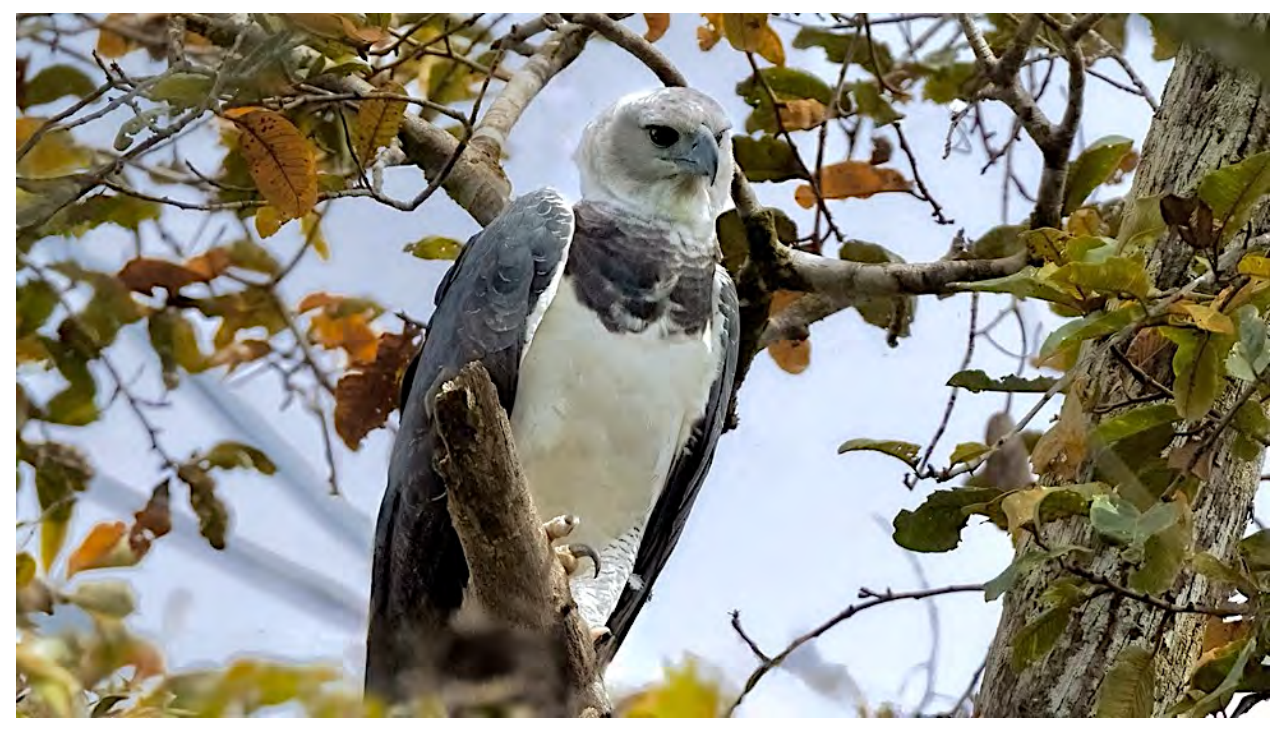
Near Atta Rainforest Lodge, we'll look for the magnificent Harpy Eagle. This one was seen on one of our 2025 tours.

In the late afternoon, we'll venture out onto the lodge's entrance drive, or one of its many forest trails. Night at Iwokrama River Lodge.