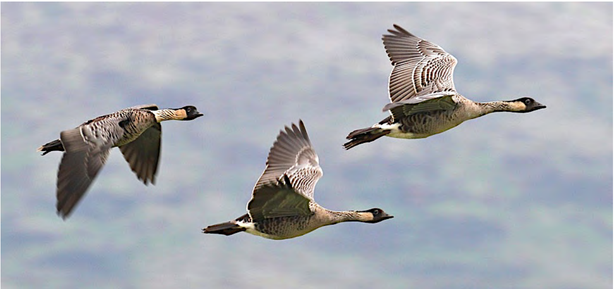
The Nene, or Hawaiian Goose, was nearly lost to extinction, but is making a slow recovery with the help of extensive conservation efforts. We'll look for them on Kauai.