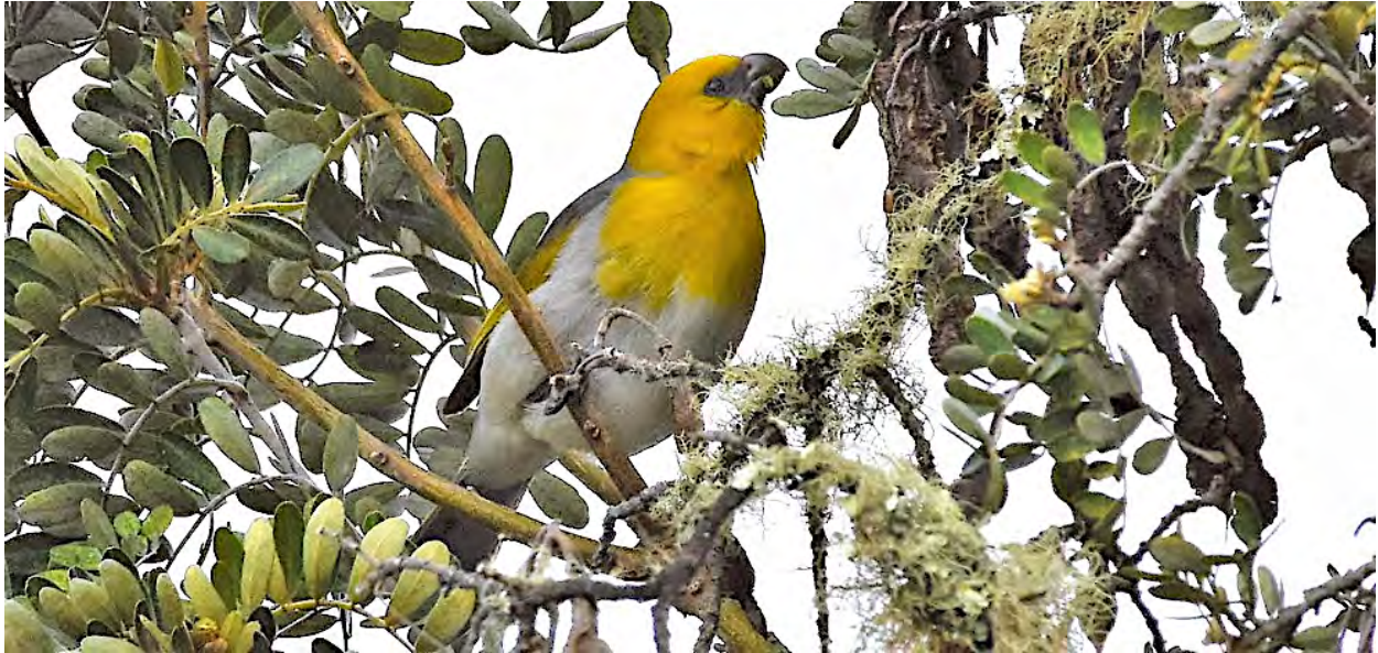
Another of Hawaii's native species, the Palila has a bill that is specialized for eating seeds of the endemic Mamane tree. The Palila is found in a very small range on the island of Hawaii, where its habitat is being threatened by grazing animals.

since 1983; depending on conditions, it may be possible to visit the current lava flow (as of July 2018, it is not). As each island has risen out of the sea, new land has become available for plants and birds to colonize, and each island has several endemic bird species. Finally, the fact that it is a series of islands makes Hawaii great for seabirding, as well as enjoying the marine mammals, tropical reefs, and fishes found beneath the water's surface.