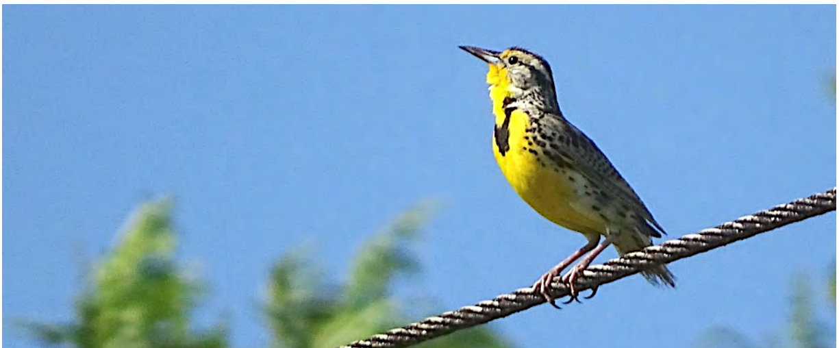
The Western Meadowlark is one of many non-native species in Hawaii; it is found only on Kauai.

Day 10, Thu, 11 Apr. Transfer to the Kona airport; flights home. The tour ends this morning after breakfast. Participants may arrange a transfer to the airport with the help of the hotel staff. Unfortunately, our hotel doesn't offer a free shuttle, but there are several low-cost shuttle options available, and a taxi ride to the airport costs about $65. Flights to the mainland tend to be in the early afternoon or overnight. We'll reserve several hospitality rooms for group participants to share on the final afternoon; these have en-suite showers and bathrooms, couches, televisions, etc. and will give us a place to store our luggage until we leave the hotel. If you'd prefer, you can plan to stay an extra night to unwind after the tour, or to snorkel or take a helicopter tour over the volcanoes.