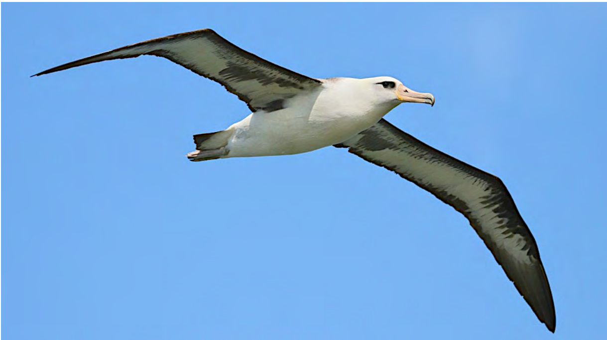
On our pelagic trip out of Kauai, we'll watch for Laysan Albatross and other seabirds. The main nesting colonies of the Laysan Albatross are on Midway and Laysan Islands however, we may see some nests and young birds on Kauai.

Day 5, Sat, 6 Apr. Kauai Pelagic. Today, we'll board a charter boat for our half-day pelagic trip, motoring out in search of fish and fisherman, which often attract pelagic birds. More common species include Brown and Red-footed boobies, Brown and Black noddies, Wedge-tailed Shearwater, White-tailed Tropicbird, and Sooty and (less commonly) Gray-backed terns. Uncommon but regular species include Mottled Petrel and Newell's Shearwater; rarer specialty birds such as Christmas Shearwater, and Hawaiian and Bulwer's petrels are possible as well. As with any pelagic trip, we'll need some luck to find any of these less common species. Opportunities for spotting rare marine mammals exist, and we'll be on the lookout for those as well. Night in Kapa'a.