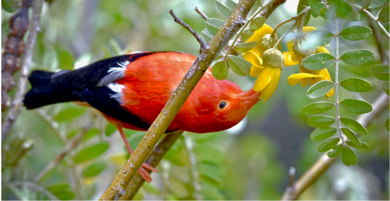
The brilliant l'iwi is adapted for feeding on nectar from native plants such as the māmane tree. These gorgeous birds seem to be doing well on several islands.

sea, new land has become available for plants and birds to colonize, and each island has several endemic bird species. Finally, the fact that it is a series of islands makes Hawaii great for seabirding, as well as enjoying the marine mammals, tropical reefs, and fishes found beneath the water's surface.