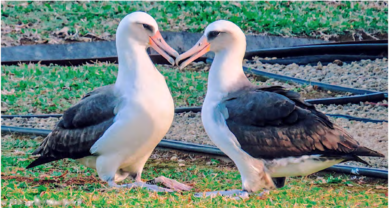
We'll hope to visit a site on Kauai where Laysan Albatrosses nest. While we will probably not see any chicks, we may get to witness courting behavior.

Day 5, Sun, 23 Jan. Kauai Pelagic. Today, we'll board a charter boat for our half-day pelagic trip, motoring out in search of fish and fisherman, which often attract pelagic birds. More common species include Brown and Red-footed boobies, Brown and Black noddies, Wedge-tailed Shearwater, White-tailed Tropicbird, and Sooty and (less commonly) Gray-backed terns. Uncommon but regular species include Mottled Petrel and Newell's Shearwater; rarer specialty birds such as Christmas Shearwater, and Hawaiian and Bulwer's petrels are possible as well. As with any pelagic trip, we'll need some luck to find any of these less common species, and these less common species will likely NOT be seen on the January departure. Opportunities for spotting rare marine mammals exist, and we'll be on the lookout for those as well. Recent trips have recorded Short-finned Pilot Whales, Rough-toothed and Spinner dolphins. Night in Kapa'a.