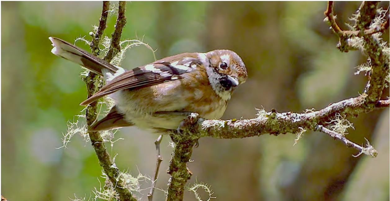
The Elepaio is an Old World flycatcher endemic to the Hawaiian Islands. This one, the Hawaii Elepaio, is widespread in forests on the Big Island.