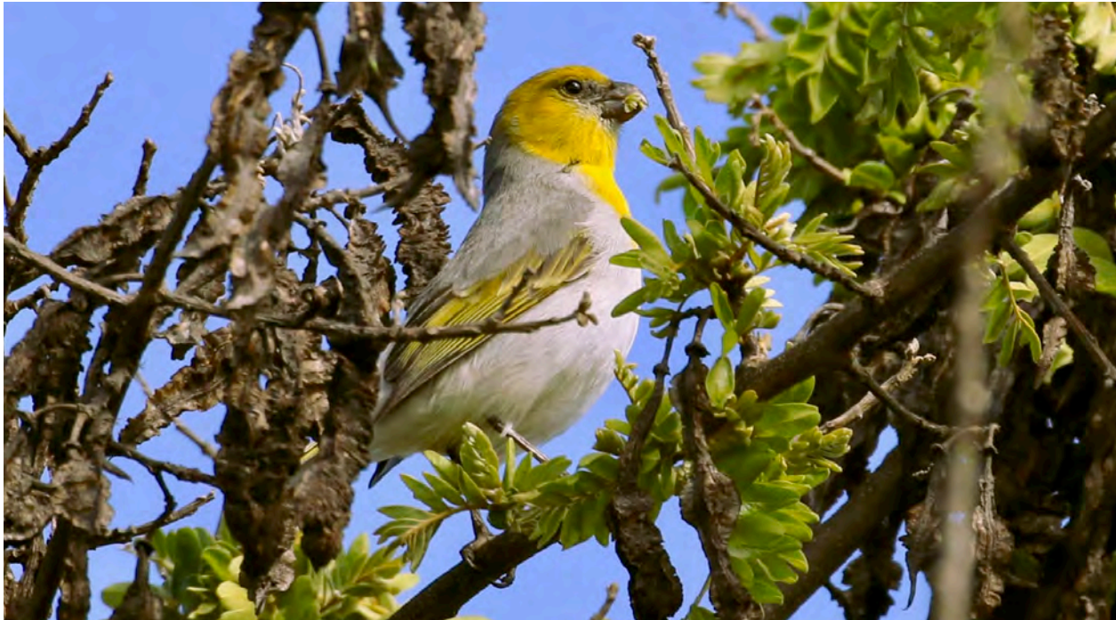
The Palila is one of Hawaii's endangered honeycreepers. These "finch-billed" birds are adapted to feed on the immature seeds and flowers of the endemic māmane tree. Palila are found only on the island of Hawaii, on the forested slopes of Mauna Kea.

We include here information for those interested in the 2022 Field Guides Hawaii tour: