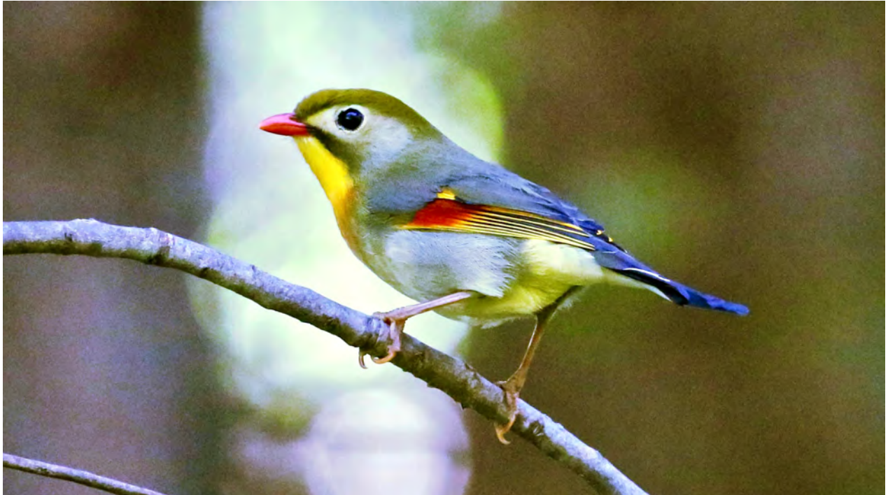
The Red-billed Leiothrix was brought to Hawaii early in the 20 th century, and is established on several islands, including Hawaii.

Day 9, Thu, 27 Jan. Hakalau National Wildlife Refuge. We'll start early this morning, taking a picnic breakfast with us to eat in the field. Hakalau was the first wildlife refuge to be established solely for the benefit of forest birds. It's certainly in the right place, as almost all of Hawaii's native birds can be found here. In addition to 'Apapanes, Amakihis, and I'iwis, we'll concentrate on finding the 'Akepa, Akiapola'au, Hawaii Creeper, and Oma'o (Hawaii Thrush). Today will be another highlight—the birds and forest are superb! Night in Waikoloa.