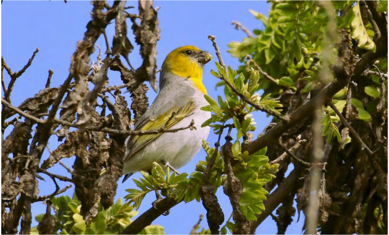
The endangered Palila is found on the island of Hawaii, where we’ll search for it at Pu’u La’au.

Hawk, Hawaii ‘Elepaio, Oma’o (Hawaii Thrush), Hawaii Amakihi, Akiapola’au, Hawaii Creeper, ‘Akepa, and best of all, l’iwi. It gives us a taste of what Hawaii was like before Europeans arrived! We will also venture out into the waters west of the Big Island in search of pelagic birds, and this itinerary offers us some varied possibilities. We’ll keep our eyes out for Black and Brown noddies, Sooty Tern, Brown Booby, White-tailed Tropicbird, Great Frigatebird, Wedge-tailed and Sooty shearwaters (possibly Newell’s and Christmas too), and Bulwer’s Petrel. There should be plenty to see out there.