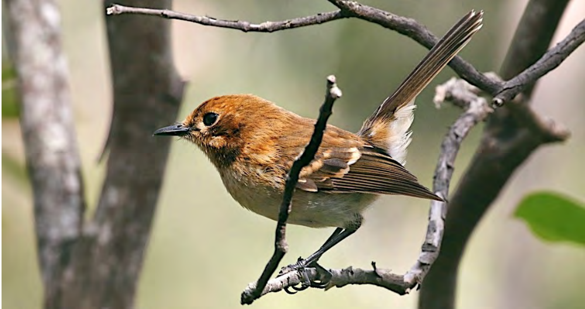
The three species of 'Elepaio are small, spritely birds that resemble wrens, although they are actually monarch flycatchers. This one, the endangered Oahu 'Elepaio, is rare and local on the island, but we've been able to get good looks on recent tours.

own unique character created by differing weather, geology, and birdlife. The archipelago of Hawaii was formed as the tectonic plate on which it lies moved over a “hot spot” in Earth's crust. The plate moves northwestward, so the oldest main island is Kauai in the northwest part of the chain, and the newest is Hawaii (the Big Island) in the southeast. The Big Island is not only new, it's growing daily. As each island has risen out of the sea, new land has become available for plants and birds to colonize, and each island has several endemic bird species. Finally, the fact that it is a series of islands makes Hawaii great for seabirding, as well as enjoying the marine mammals, tropical reefs, and fishes found beneath the water's surface.