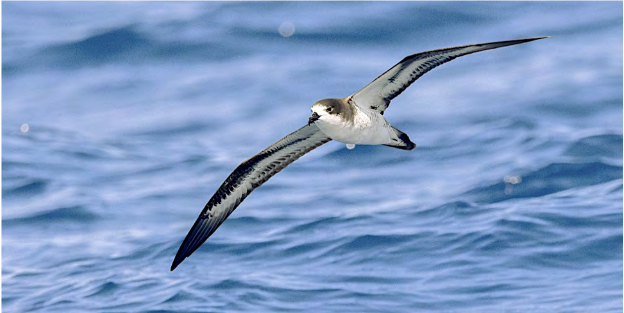
On our pelagic charter, we'll see a number of special birds such as the endangered Hawaiian Petrel seen here.

sandalwood, and naio we will bird Saddle Road for Short-eared Owl (endemic subspecies), Eurasian Skylark, Chukar, California Quail, Wild Turkey, Erckel's, Black, and Gray francolins and more. From the high elevations of Pu`u La`au along the slopes of Mauna Kea, we will drive to Waikoloa in search of more introduced species, like Chestnut-bellied Sandgrouse and African Silverbill, on our way back to Kona. Night in Kona.