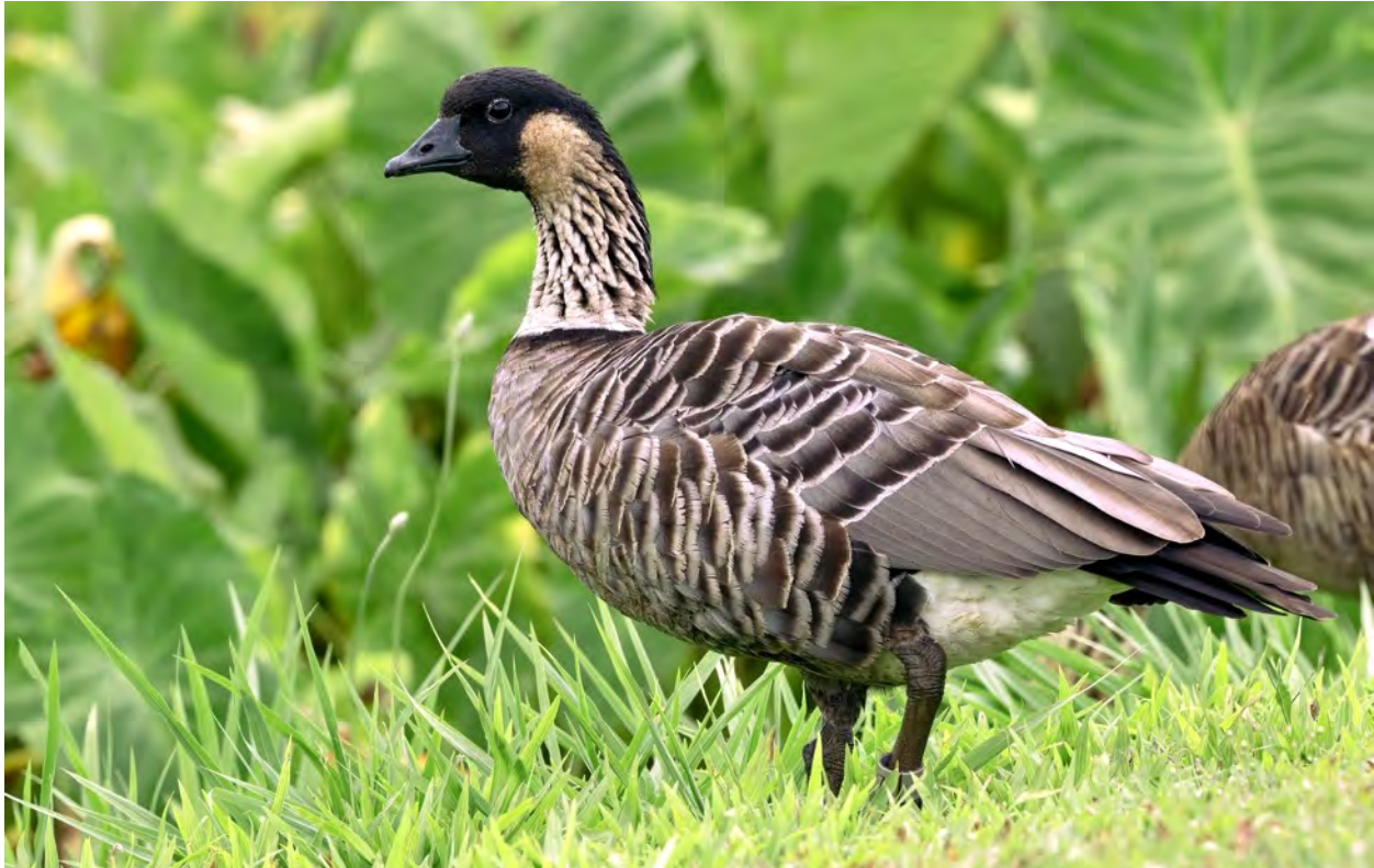
The Hawaiian Goose, also known as the Nene, is specially adapted for island life. The webbing between its toes is reduced, the legs are longer than those of other geese, and the feet are specially padded to allow them to run over lava rocks easily. We'll see these special birds on Kauai.

We include here information for those interested in the 2023 Field Guides Hawaii tours: