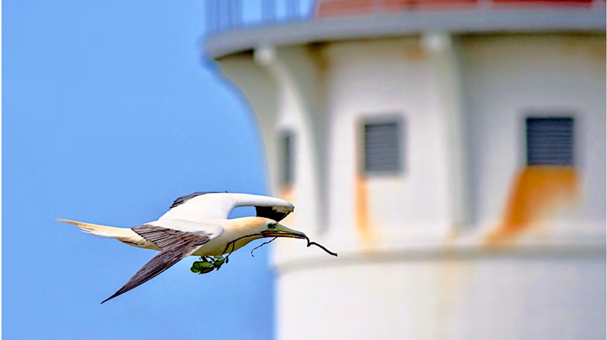
Near the Kilauea Lighthouse we'll be able to observe a nesting colony of Red-footed Boobies and see several other species of sea-faring birds.

Day 4, Sun, 15 Jan. or Thu, 23 Mar. Flight to Kauai and Birding Kauai. After breakfast we fly to Lihue and discover the beauty of Kauai's North Shore in pursuit of impressive seabirds along Kilauea Lighthouse NWR's stunning coastline and more endemic water birds amongst Hanalei NWR's historic lo'i ponds. While scanning the rugged cliffs of Kilauea covered with Red-footed Boobies and surveying the skies for Brown Booby, spectacular Red-tailed and White-tailed tropicbirds, majestic Laysan Albatross, and soaring Great Frigatebirds, we will enjoy up close views of Hawaii's state bird, the Nene (Hawaiian Goose). We will then explore Hanalei valley's lush important bird area for more of Hawaii's endangered water birds, such as the Hawaiian Duck. Night in Kapa'a.