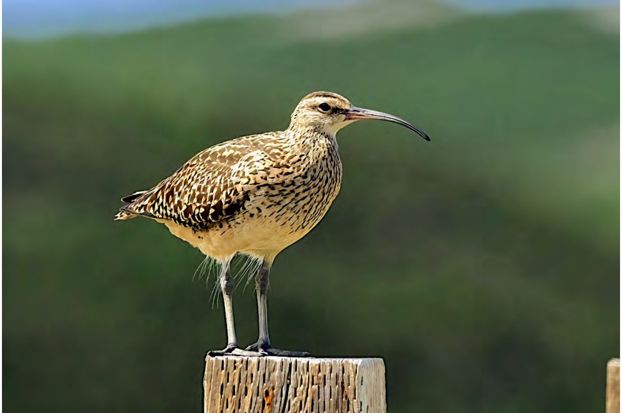
Bristle-thighed Curlews breed on the tundra of Alaska, and many winter in the Hawaiian Islands. We'll seek these long-distance migrants on Oahu.

Day 2, Thu, 18 Jan. or Thu, 21 Mar. Birding in Oahu. After breakfast at the hotel, we will leave the city behind and enter the rainforests of the Koolau Mountains in pursuit of Oahu's endemic honeycreeper, the Oahu Amakihi, before we descend down into the valleys to search for the endangered Oahu Elepaio. While on our endemic bird adventure we will most likely encounter White-rumped Shama, noisy flocks of Red-billed Leiothrix, an occasional Red-whiskered Bulbul, and chattering Warbling White-eyes. We'll also check out Kapiolani Park (next to our hotel) to admire visiting Pacific Golden-Plovers and Honolulu's city bird, the beautiful White Tern. While exploring the park we are sure to encounter myriad of introduced species among the banyan and rainbow shower trees, such as Common Myna, Red-crested Cardinal, Red-vented Bulbul, Yellow-fronted Canary, Java Sparrow, Common Waxbill, Spotted Dove, Zebra Dove, and Rose-ringed Parakeet. Night in Waikiki.