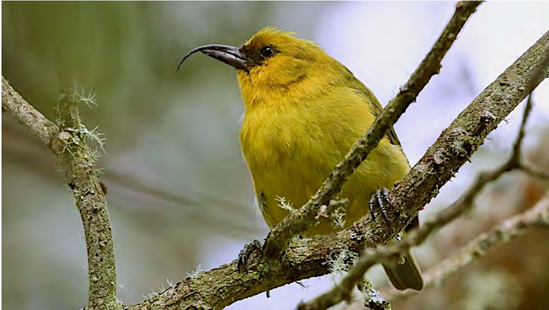
The Akiapola'au is a wonderful example of adaptation. This bird uses its lower mandible to pry off flakes of bark in search of insects, then uses the upper mandible to spear its prey.

We include here information for those interested in the 2024 Field Guides Hawaii tours: