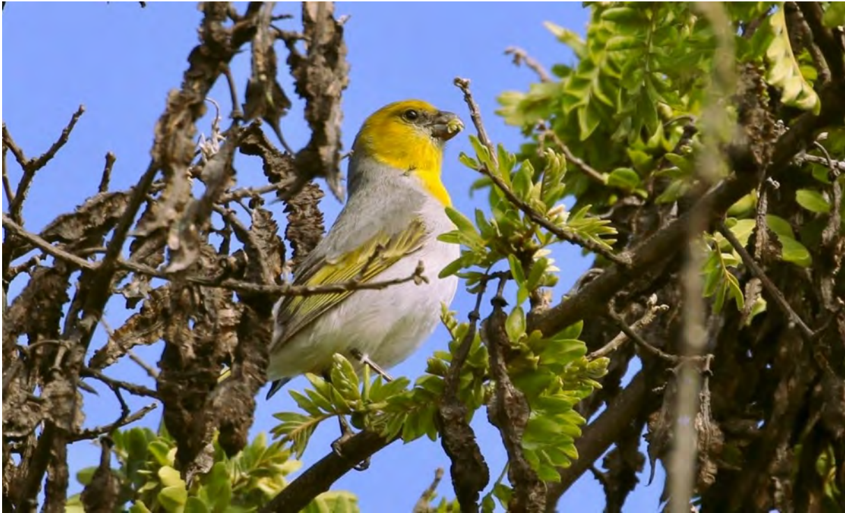
The endangered Palila is found on the island of Hawaii, where we'll search for it on the Saddle Road.

Day 6, Mon, 22 Jan. or Mon, 25 Mar. Birding Kauai and Flight to Kona. On our last morning on Kauai we will search for the rare Greater Necklaced Laughingthrush and any of Kauai's specialty species we haven't already found before our afternoon flight to Kona. Night in Kona.