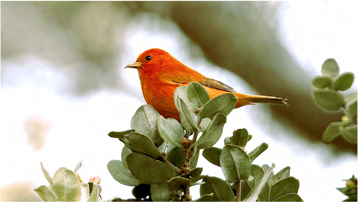
The Akepa is a small honeycreeper of the montane forests on Hawaii. The bill is slightly crossed at the tip, allowing the bird to open tree buds easily.