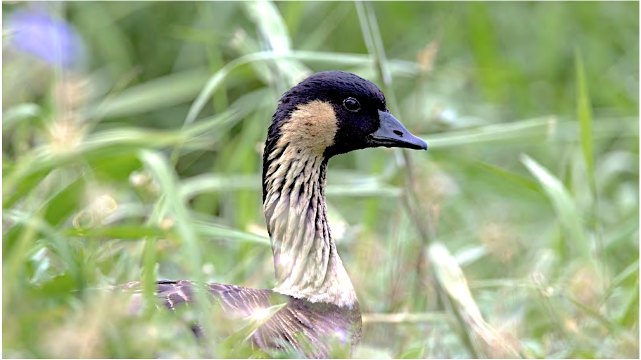
The Hawaiian Goose is the state bird, and it has some interesting adaptations that separate it from other geese. These geese nearly became extinct, but captive breeding, predator control and habitat protection are helping the population to recover.