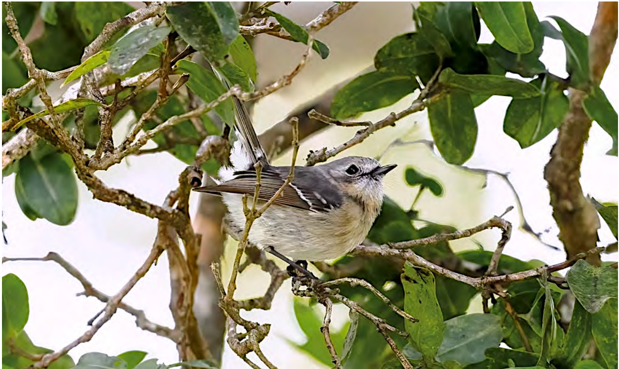
The Kauai Elepaio is a small monarch flycatcher found only on Kauai. These active little birds tend to hold their tails cocked up, much like the wrens of the mainland.

Day 6, Tue, 18 Mar. Birding Kauai and Flight to Kona. On our last morning on Kauai we will search for the rare Greater Necklaced Laughingthrush or any of Kauai's specialty species we haven't already found before our afternoon flight to Kona. Night in Kona.