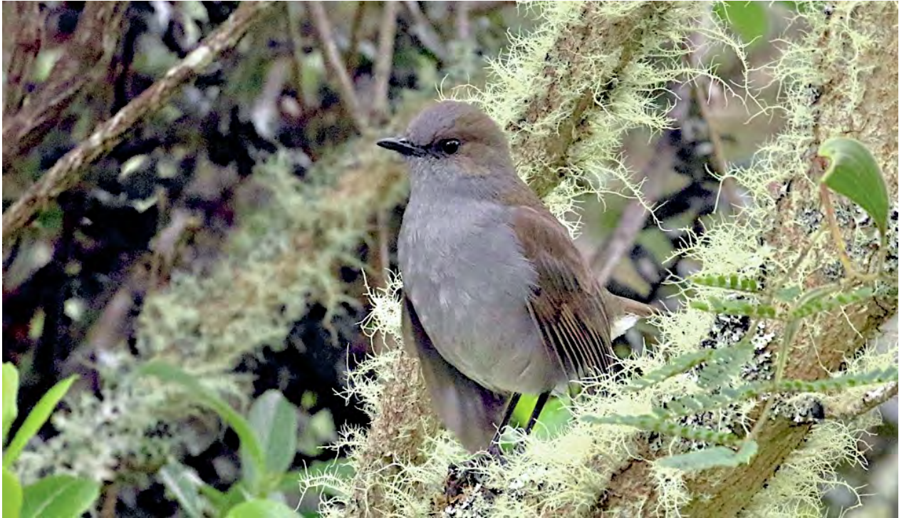
Hawaii has a few native thrushes that are in the same genus as the solitaires of North and South America. The Omoia is found on the island of Hawaii in the wet montane forests.