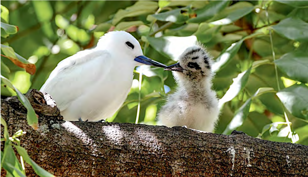
The lovely White Tern nests in the city of Honolulu on Oahu.

the Hawaii 'Elepaio. The Kona coast is home to a wide assortment of introduced species, from Yellow-billed Cardinal and Java Sparrow to African Silverbill. We will visit Hakalau NWR, a superb patch of forest with the widest diversity of native landbirds of any site on the Big Island. Here, we'll look for Hawaiian Hawk, Hawaii 'Elepaio, Oma'o (Hawaii Thrush), Hawaii Amakihi, Akiapola'au, Hawaii Creeper, 'Akepa, and best of all, I'iwi. It gives us a taste of what Hawaii was like before people arrived!