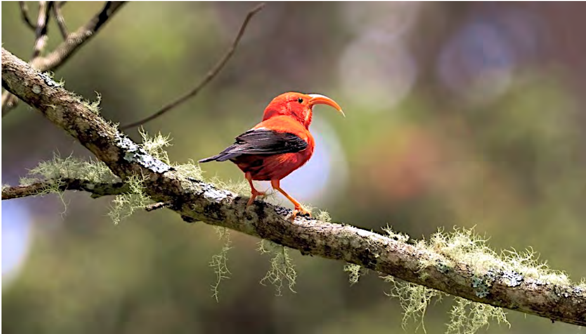
The spectacular L'iwi might be Hawaii's best-known endemic. These gorgeous birds are found primarily on the Big Island, but they can be found on several others as well.

We include here information for those interested in the 2025 Field Guides Hawaii tours: