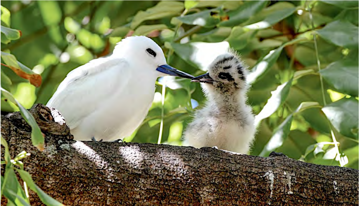
The lovely White Tern nests in the city of Honolulu on Oahu.

the Hawaii 'Elepaio. The Kona coast is home to a wide assortment of introduced species, from Yellow-billed Cardinal and Java Sparrow to African Silverbill. We will visit Hakalau NWR, a superb patch of forest with the widest diversity of native landbirds of any site on the Big Island. Here, we'll look for Hawaiian Hawk, Hawaii 'Elepaio, Oma'o (Hawaii Thrush), Hawaii Amakihi, Akiapola'au, Hawaii Creeper, 'Akepa, and best of all, I'iwi. It gives us a taste of what Hawaii was like before people arrived!