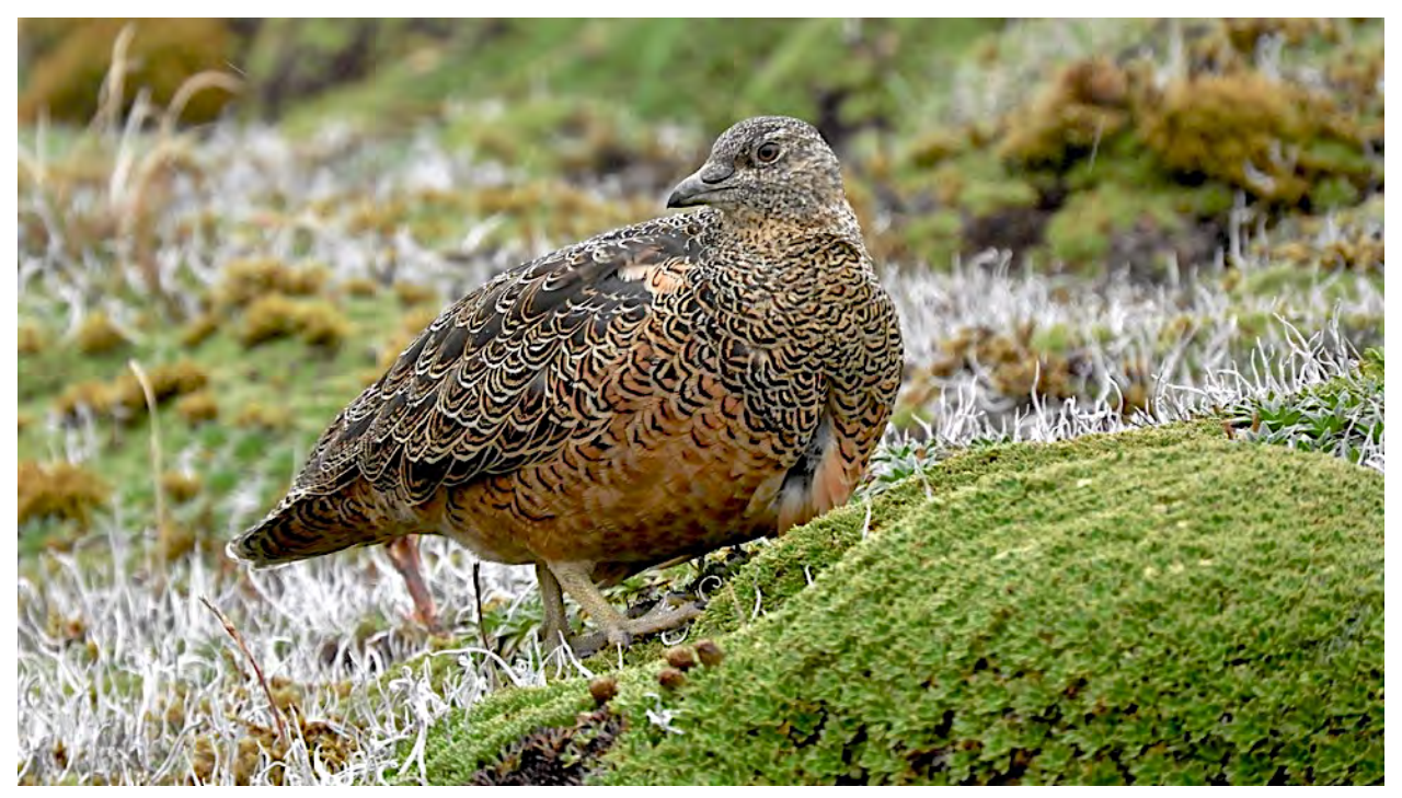
As we make our way from Quito to San Isidro, we'll go through montane habitats where we'll find some special high-elevation birds, such as this Rufous-bellied Seedsnipe.

At San Isidro, we'll have ample time to explore the numerous forest trails and wooded roadsides near the lodge. Just a few possibilities include White-rumped Hawk, Sickle-winged Guan, White-capped Parrot, Golden-headed and Crested quetzals, Crimson-mantled Woodpecker, Tyrannine Woodcreeper, and Saffron-crowned, Flame-faced, Golden-naped,