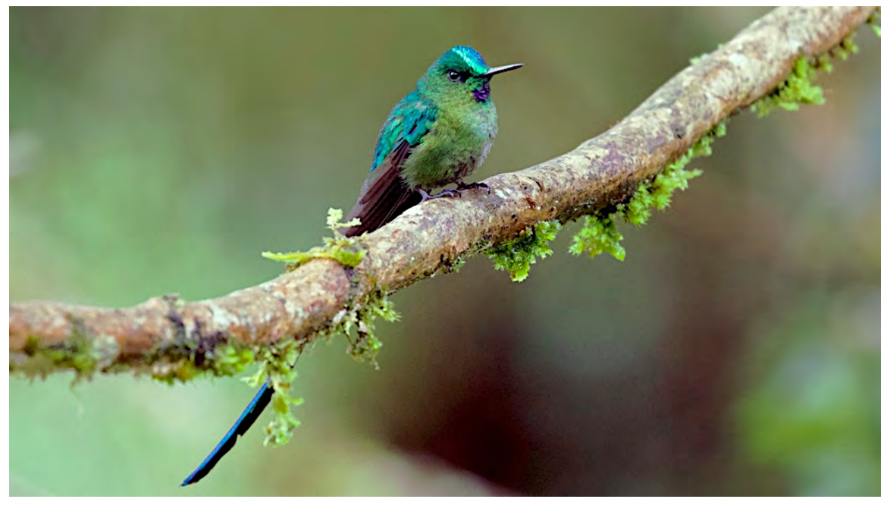
Hummingbirds abound at the San Isidro feeders, including the gorgeous Long-tailed Sylph.

We include here information for those interested in the 2023 Field Guides Holiday at San Isidro, Ecuador tour: