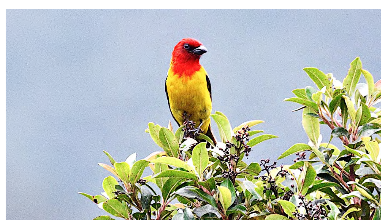
The Red-hooded Tanager is an uncommon resident of the temperate forests of the eastern Andes. We'll be watching for this colorful bird near Guango Lodge.

Guango Lodge —We will spend one night at Guango Lodge, at the edge of some of the best temperate forest to be accessed on the eastern slope in Ecuador. If the weather is right (we always hope for sunny early morns, cloudy but calm mid-days, and then a bit of late-afternoon sun), we could encounter the resident roving mixed-species flock with species typical of the eastern temperate zone: Tyrannine Woodcreeper, Rufous-breasted Flycatcher, Black-eared and Black-capped Hemispingus, Hooded Mountain-Tanager, Slaty Brush-Finch, and Northern Mountain-Cacique are all possibilities. This is also our best chance for the striking Gray-breasted Mountain-Toucan.