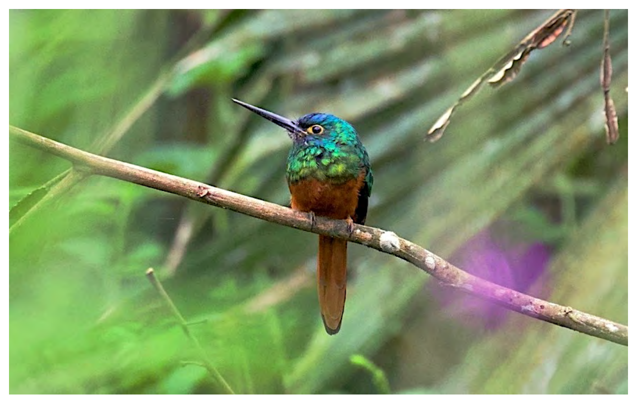
The Coppery-chested Jacamar is almost endemic to Ecuador, where they are found on the east slope of the Andes.

Aside from its unique set of birds, San Isidro offers some of the best dining to be found at any of the lodges in Ecuador. Imaginative and delicious meals will be waiting for us in the main house each evening. For those looking for some relaxation between and/or after birding bouts, the lodge's ample, heated pool awaits - water temperatures hovering around 88-90 degrees, and with gorgeous views of the surrounding forest - so don't forget that swim suit if this entices you!