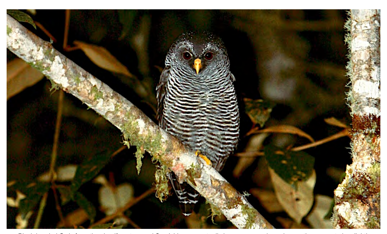
Black-banded Owls from the cloudforest around San Isidro may actually be an unnamed species, as they seem to be slightly different from Black-banded Owls elsewhere.

Depending on the weather and our time, we will get into San Isidro for some late-afternoon or evening birding. Owned by a lover of nature who welcomes birders—and also happens to be Mitch Lysinger's wife, Carmen—San Isidro offers delicious and original home-style meals between birding forays. Set in a forested garden, the cabañas are within earshot of "Black-banded" Owls and displaying Wattled Guans and are but minutes away from some tremendous east-slope, subtropical birding. Here, too, you'll want your umbrella whenever you walk up to the dining area, and bring your flashlight mornings and evenings. Watch for Rufous-bellied Nighthawk on the way to the dining room. Night at San Isidro.