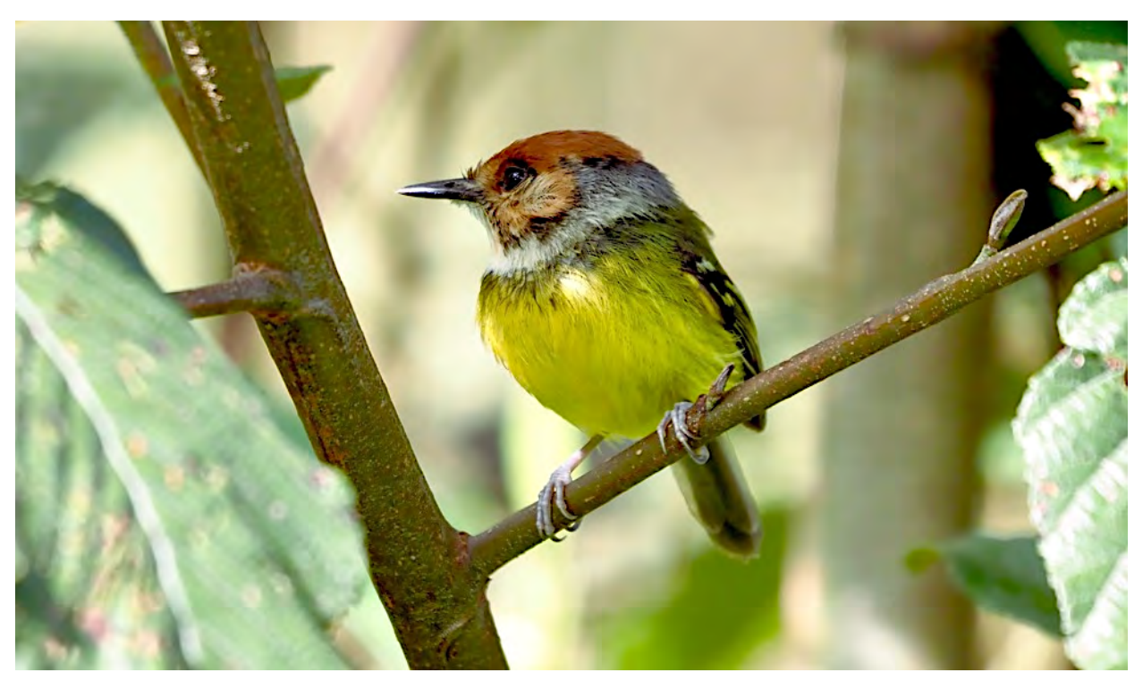
The tiny Rufous-crowned Tody-Flycatcher is one of the cutest birds we'll see.

During our stay at San Isidro we are bound to run into a rainy morning or afternoon, but not to worry. The hummingbird feeders at the dining room attract a menagerie colorful enough to dazzle anyone: Chestnut-breasted Coronet, Bronzy and Collared incas, Long-tailed Sylph, Sparkling Violetear, Speckled Hummingbird, and Fawn-breasted Brilliant are all regulars. We could even luck into a male Gorgeted Woodstar, a tiny hummer known to hit the feeders from time to time. The forests right next to this very same gazebo often produce Yellow-vented Woodpecker, Chestnut-breasted Chlorophonia, Streak-headed Antbird (split from Long-tailed), Rufous-crowned Tody-Flycatcher, and Handsome Flycatcher in a single rainy morning—an impressive collection of attractive birds.