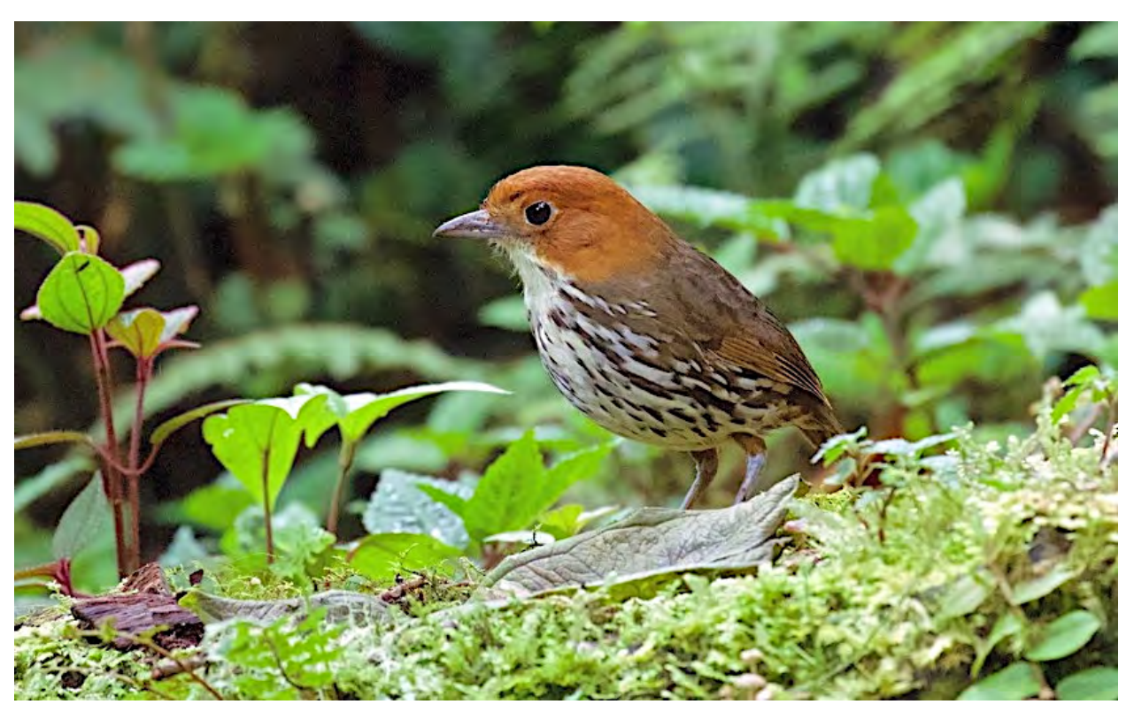
Although it is fairly common, it's not always easy to see the pretty Chestnut-crowned Antpitta, so we're always excited when we do! This one performed well for us on a recent tour.